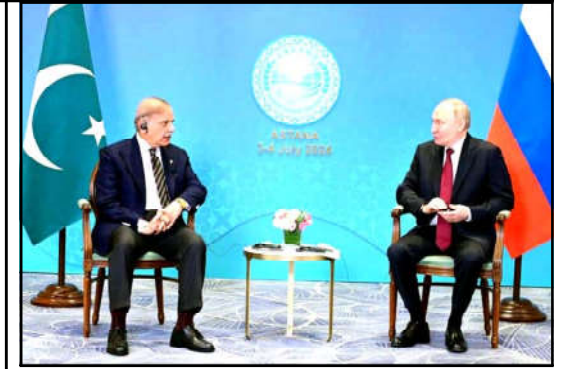
ASTANA: Prime Minister Muhammad Shehbaz Sharif meets with the President of Russia H.E. Vladimir Putin.

The notification said that he shall perform such functions as assigned to him by the Minister for Law and Justice in accordance with the rule 5(8) of the Rules of Business, 1973.