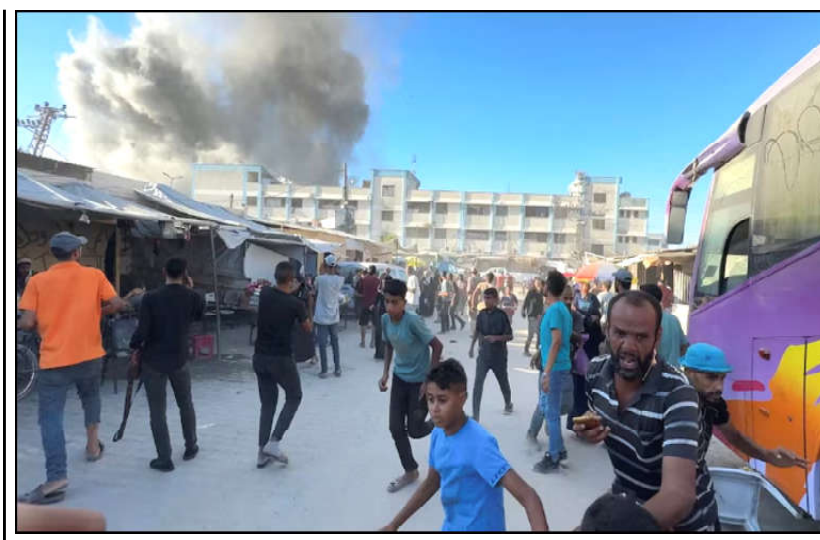
Palestinians react, following an Israeli strike near a UN-run school sheltering displaced people, amid the Israel-Hamas conflict, in Khan Younis, in the southern Gaza Strip.

Monitoring Desk MOSCOW: Authorities in Russia's mostly-Muslim North Caucasus region of Dagestan on Wednesday temporarily banned women from wearing the niqab, after simultaneous attacks targeting churches and synagogues killed 22 last month. In a statement posted on the Telegram messenger app, the Dagestan Muftiate said it was introducing a "temporary" ban on the niqab after an appeal from Russia's ministry of nationality policy and religious affairs. Reports following the attacks on June 23 said one of the gunmen had planned to escape wearing a niqab. The muftiate, a religious organisation representing Dagestani Muslims, said that the ban would remain in place "until the identified threats are eliminated and a new theological conclusion is reached".