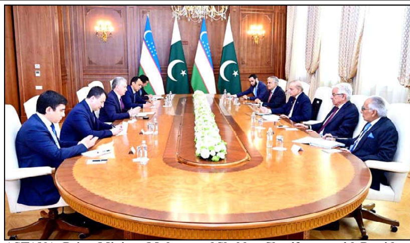
ASTANA: Prime Minister Muhammad Shehbaz Sharif meets with President of Uzbekistan H.E. Shavkat Mirziyoyev on the sidelines of Shanghai Cooperation Organisation Summit.