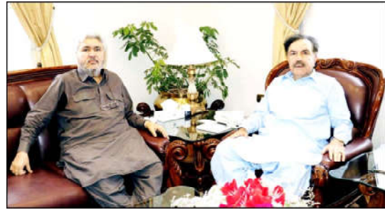
Ex-senator Hidayatullah among 4 killed in Bajaur explosion

Local divers after receiving the reports rushed to the site of incident to retrieve the bodies. Later, all the bodies were handed over to legal heirs.