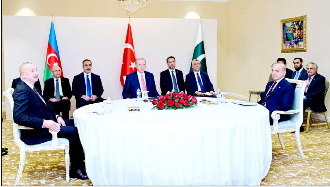
ASTANA: Prime Minister Muhammad Shehbaz Sharif in an inaugural session of Pakistan-Turkiye-Azerbaijan Trilateral Summit along with President of Türkiye H.E. Recep Tayyip Erdogan and President of Azerbaijan H.E. Ilham Aliyev, on the sidelines of Shanghai Cooperation Organization Summit

Ph: 2841470/2841473 Vol: XX No. 05, Zil Hajj 27, 1445 AH Thursday July 04, 2024, Pages 04, Price Rs. 15