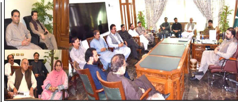
QUETTA: Provincial Ministers, Senators, MPAs and leaders belong to PPP meeting with Chief Minister Balochistan Mir Sarfraz Ahmed Bugti

The Governor said that it is responsibility of the government to maintain peace and law and order all over