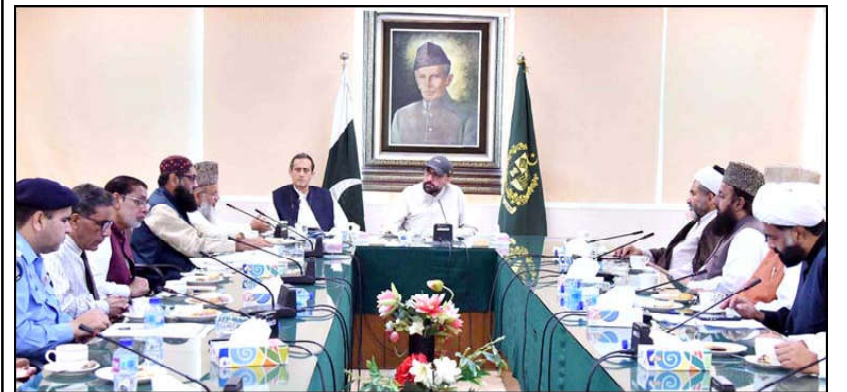
ISLAMABAD: Federal Minister for Religious Affairs and Interfaith Harmony, Chaudhry Salik Hussain chairing a meeting regarding inter-religious harmony during Muharram-ul-Haram.

trade between the two countries. Prime Minister Shehbaz expressed Pakistan's eagerness to see a prosperous Central Asia and enhanced regional connectivity. The two leaders also discussed the situation in Afghanistan and the common interest of both Pakistan and Uzbekistan for a peaceful and stable Afghanistan which could be a partner in the development and prosperity of the region. The early realization of Uzbekistan-Afghanistan-Pakistan Railway Transit Trade Project was also discussed.