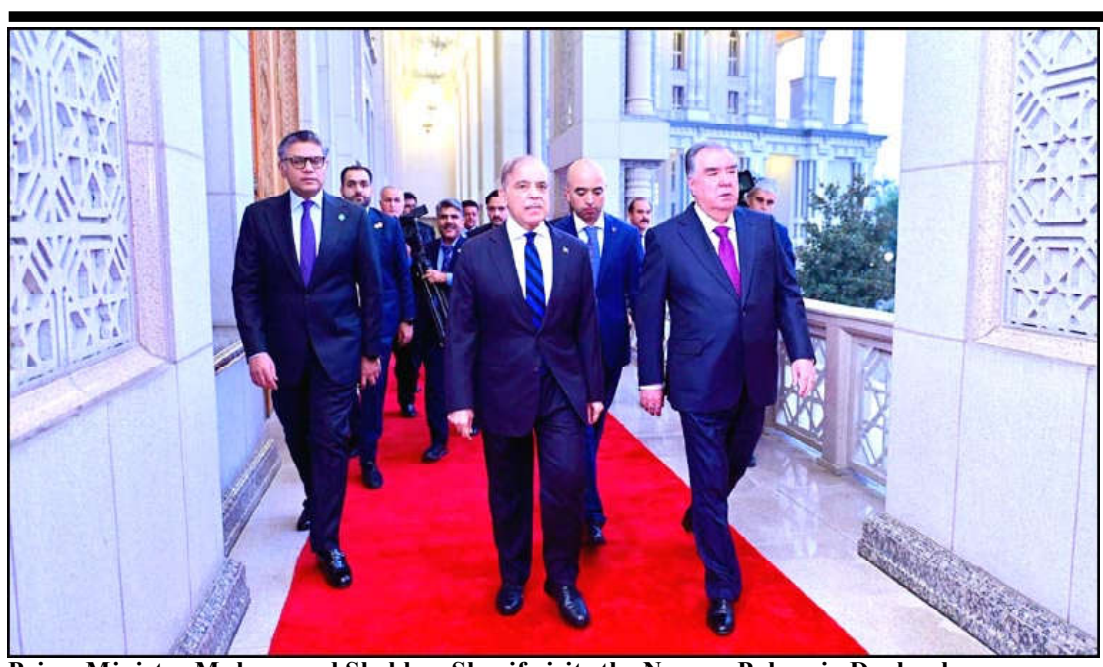
Prime Minister Muhammad Shehbaz Sharif visits the Navruz Palace in Dushanbe.