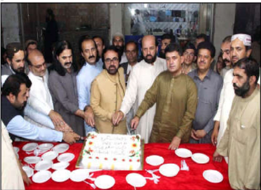
QUETTA: Leader and members of Central Anjuman Tajran Pakistan are cutting cake during celebration ceremony held in Quetta.

Independent Report QUETTA: The Chief Minister Sarfraz Ahmed Bugti has expressed displeasure over the absence of doctors and other medical staff from their duties and directed to the Special Secretary Health to take disciplinary action against those found absent from their duties. The Chief Minister on an occasion asked the Medical Superintendent of the Hospital not to hide the facts rather tell the truth. He regretfully pointed out that billions of rupees are provided for medical treatment of the poor people, however, there are no results of the same. He directed to the Medical Superintendent of Mufti Mehmood Hospital to improve the attendance of doctors and situation of cleanliness in the Hospital within couple of days. Stern action would be taken if the situation was not improved, adding the Chief Minister warned. Mir Sarfraz Bugti was on surprise visit to the MMMH on Monday when he went round of different departments and sections of the Hospital and inspected the health facilities being provided to the patients there. He also inspected the record of attendance of the doctors and other staff at the Hospital. He was displeased with absence of