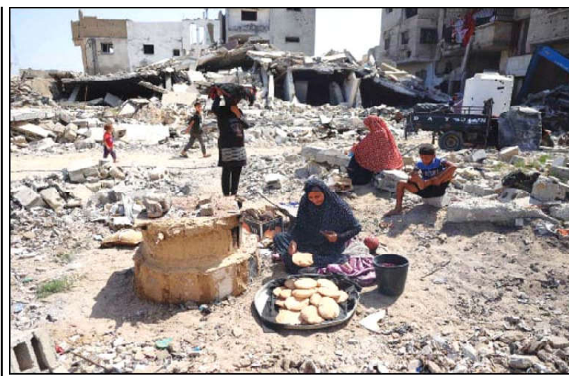
A Palestinian woman bakes unleavened bread in a makeshift oven while sitting on the rubble of buildings destroyed in the Israeli bombardment, as some residents return to the city of Khan Yunis.

The United Nations and other relief agencies have voiced alarm over the dire humanitarian crisis and the threat of starvation in the Israeli siege has brought for Gaza's 2.4 million people.