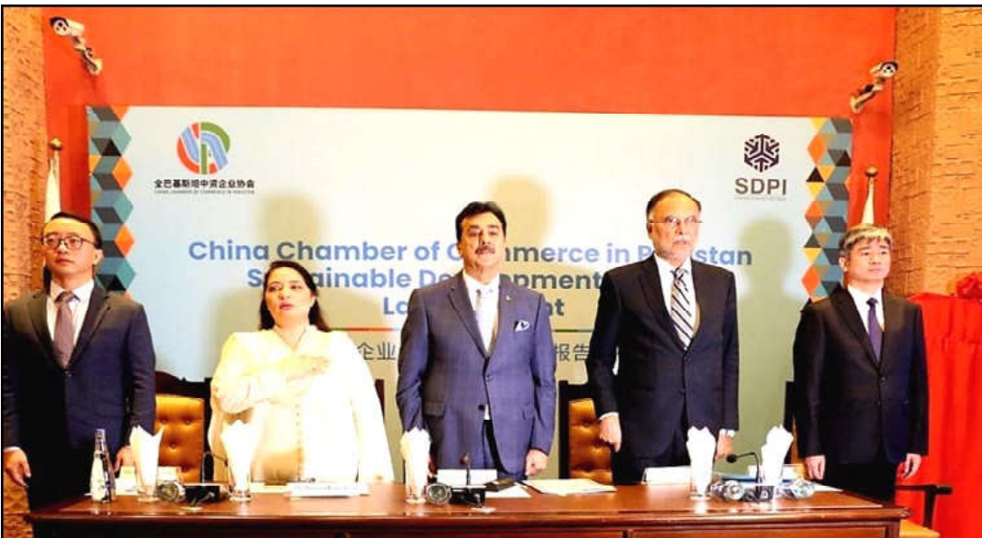
ISLAMABAD: Chairman Senate, Syed Yousaf Raza Gillani attending launching ceremony of the "China Chamber of Commerce Sustainable Development Report 2023" of CCCPK (formerly "All-Pakistan Chinese Enterprises" Association APCEA), co-organized by the Sustainable Development Policy Institute (SDPI) here at the Pakistan Institute for Parliamentary Services (PIPS) Hall.