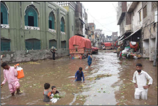
LAHORE: Citizens busy in their routine works and heading towards their destinations in the first rain of monsoon since morning in the provincial capital.