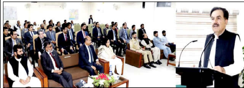
QUETTA: Governor Balochistan Jaffar Khan Mandokhail addressing participants of ceremony of 40th course at National Institute of Management Quetta

A total of 50,558 candidates were declared successful out of total 67,800 candidates appeared in the examinations of 9th class while a total of 70,804 could pass the 10th class examination out of total 76,049 candidates. The pass percentage remained 74.57 percent and 93.10 percent in 9th and 10th classes respectively.