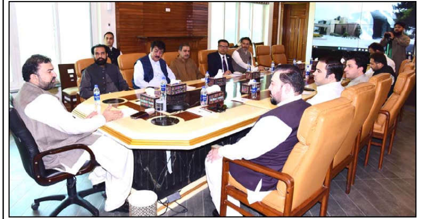
QUETTA: Chief Minister Balochistan Mir Sarfraz Bugti presiding over a meeting regarding Land Record Digitalization of Revenue Department

He said he was looking forward to his meeting with President Tokayev during his upcoming visit to Astana for the Shanghai Cooperation Organization (SCO) Council of Heads of State meeting on July 3-4.