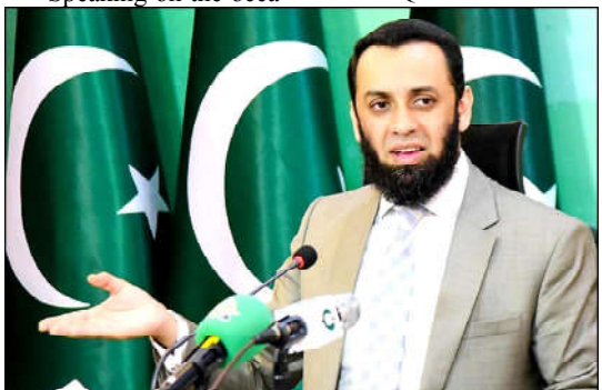
ISLAMABAD: Federal Minister for Information and Broadcasting Attaullah Tarar addressing a press conference.