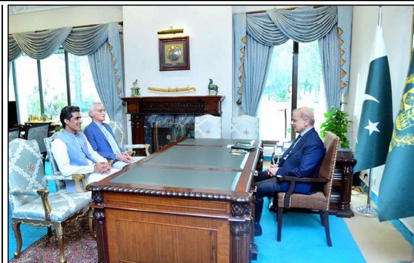
ISLAMABAD: Businessman and member of Economic Advisory Council Jahangir Khan Tareen along with MNA Aoun Chaudhary called on Prime Minister Muhammad Shehbaz Sharif.

The core inflation measured by non-food non-energy Rural increased to 17.0% on (YoY) basis in June 2024 as compared to an increase of 17.0% in the previous month and 25.2% in June 2023. On (MoM) basis, it increased by 0.9% in June 2024 as compared to an increase of 0.5% in previous month and an increase of 0.9% in corresponding month of last year i.e. June 2023.