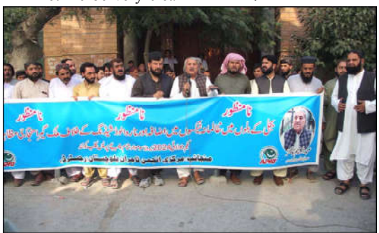
QUETTA: Members of Central Anjuman Tajran Balochistan are holding protest demonstration against taxes and prolong electricity load shedding during summer season, at Quetta press club.

PM Shehbaz also ensured that the petroleum development levy to be maintained at Rs 60 in the current fiscal year. However, only Rs 10 margin had to be given as a contingency measure, he noted.