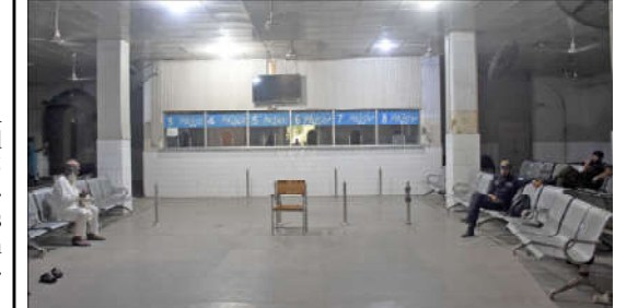
LAHORE: People are suffering during closed outdoor Patient Department (OPD) at Services Hospital in the Provincial Capital, due to young doctor's strike after the Sahiwal teaching hospital incident.