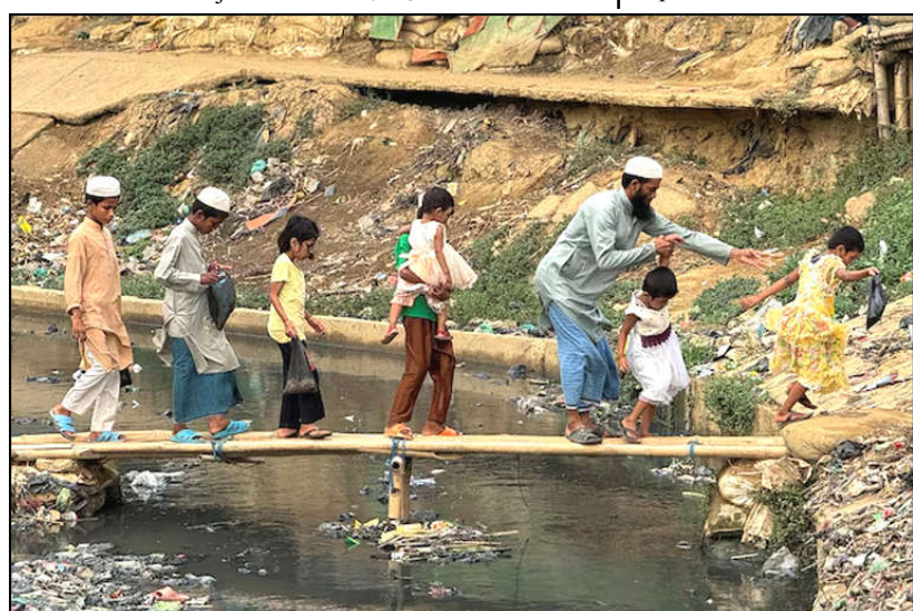
Rohingya refugees cross a bamboo-made bridge during an ongoing heatwave in Cox's Bazar, Bangladesh.

According to the US National Hurricane Center (NHC), the storm was located about 135 miles (217 km) east of the Mexican port of Tampico, packing maximum sustained winds of 50 mph (80 kph), as military and emergency services personnel braced for its full impact.