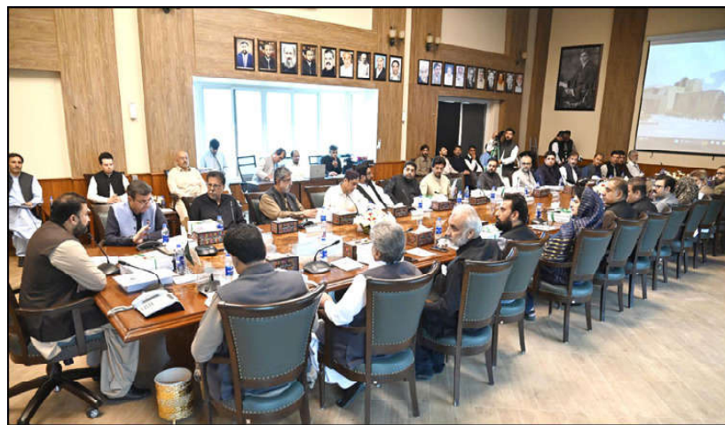
QUETTA: Chief Minister Balochistan Mir Sarfraz Ahmed Bugti presiding over budget meeting of Provincial Cabinet.

He announced that we would not leave even a single penny on the federation.