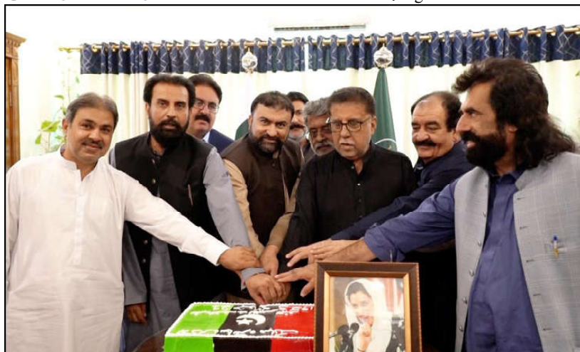
QUETTA: Chief Minister Balochistan Mir Sarfraz Ahmed Bugti and Provincial Ministers cutting cake on eve of birth anniversary of Shaheed Mohtarma Benazir Bhutto.