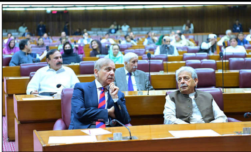
ISLAMABAD: Prime Minister Muhammad Shehbaz Sharif attends a session of National Assembly.

Chinese leadership for hosting the Prime Minister of Pakistan during his recent visit, resulting in a strong consensus on bilateral matters, with both sides agreeing to enhance the strategic partnership and economic cooperation. The 13th session of CPEC's Joint Coordination Committee (JCC) was successfully held on May 24 wherein Pakistan and China agreed to upgrade CPEC by introducing five new corridors: Growth Corridor, Livelihood Enhancing Corridor, Innovation Corridor, Green Corridor, and Opening Up/Regional Connectivity Corridor. These new corridors align with Pakistan's 5E framework, prioritizing export-led growth, digital development (e-Pakistan), environmental sustainability, energy and infrastructure development, and equity and employment. Both sides agreed to expedite initiatives for modernizing Pakistan's agricultural sector with advanced technologies.