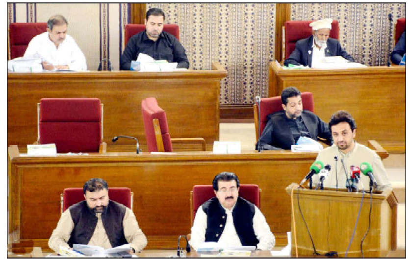
QUETTA: Balochistan Finance Minister Mir Shoaib Noshewani presenting the Budget 2024-25 during Balochistan Assembly session.

He said that the provincial ministers and members would monitor the development schemes in their respective departments and constituencies.