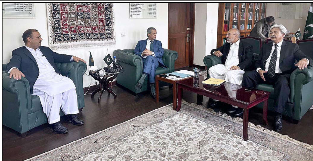
ISLAMABAD: A delegation of Lawyers from Khyber Pakhtunkhwa Bar Council calls upon Minister for Law and Justice Azam Nazeer Tarar.

sire of our two nations to work jointly for a brighter, cleaner, and safer future," he added. Mentioning continuous collaboration between the parliaments of two countries, he said, "Parliaments of Pakistan and China enjoy an all-weather partnership, mutual trust, and practical cooperation." He said that during his last tenure as Speaker of the National Assembly, he had the privilege of leading parliamentary delegations to China twice on the invitation of the Chairman of the National People's Congress.