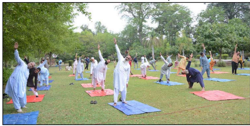
FAISALABAD: People busy in yoga exercise in the yoga classes to keep themselves healthy on the occasion of World Yoga Day at Bagh-e-Jinnah.