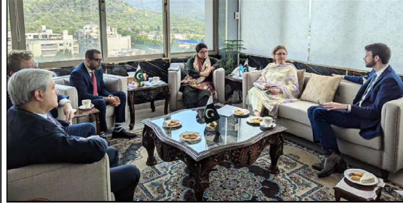
ISLAMABAD: Minister of State for IT and Telecommunication Ms. Shaza Fatima Khawaja in a meeting with Google delegation.

ISLAMABAD (APP): The price of per tola of 24 karat gold increased by Rs.1,600 and was sold at Rs.242,900 on Friday against its sale at Rs.241,300 on last trading day. The price of 10 grams of 24 karat gold also increased by Rs. 1,372 to Rs.208,248 from Rs. 206,876 whereas that of 10 gram 22 karat gold went up to Rs.190,894 from Rs.189,636.