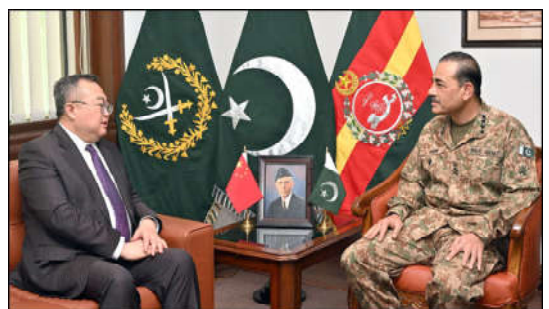
RAWALPINDI: Minister of the International Department of the Communist Party of China (IDCPC) Liu Jianchao, met with Chief of Army Staff (COAS) General Syed Asim Munir, at General Headquarters.

"Sanitization of the area is being carried out to eliminate any terrorists present in the area and perpetrators of this heinous act will be brought to justice."