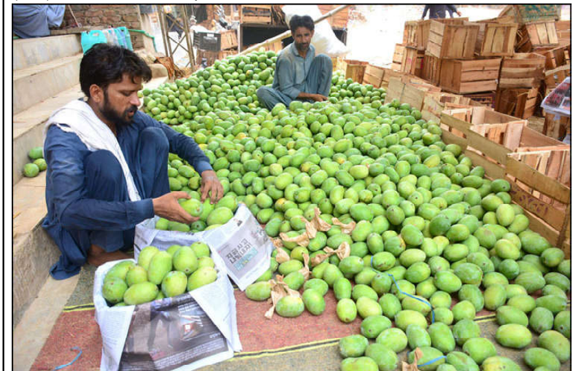
HYDERABAD: Labourers busy in packing mangoes in wooden boxes at fruits market.