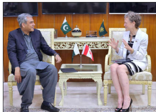
ISLAMABAD: Federal Minister for Interior Mohsin Naqvi in a meeting with Canadian High Commissioner Leslie Scanlon.

anti-Pakistan propaganda including disinformation activities, and cyber warfare. He said: "The 2019 report provided proof of 15 years of massive disinformation operations against Pakistan, involving more than 10 so-called NGOs fraudulently accredited to the UN Human Rights Council, over 750 fake media outlets, and 550 fake websites, even resurrecting dead people." The Pakistan envoy stressed that the EU DisinfoLab's exposé on disinformation campaigns requires global attention. Furthermore, Ambassador Akram discussed the Pakistan sponsored UN General Assembly resolution, titled "Countering Disinformation for the Promotion and Protection of Human Rights and Fundamental Freedoms."