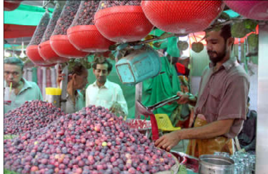
KARACHI: A vendor is preparing Falsa juice for customers at his roadside setup, in the Provincial Capital.