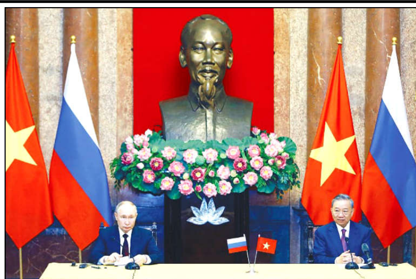
President Vladimir Putin and Vietnam's President To Lam take part in a press briefing at the Presidential Palace in Hanoi.