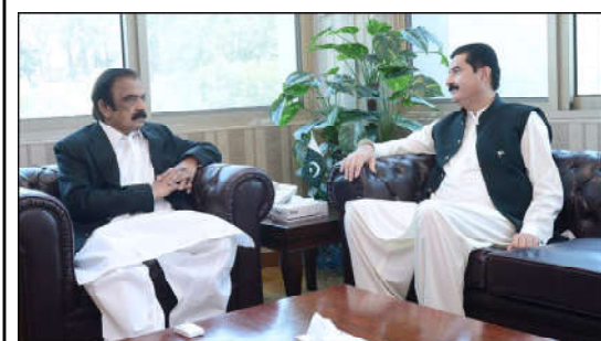
ISLAMABAD: Governor of Khyber Pakhtunkhwa, Faisal Karim Kundi calls on Federal Minister for Inter Provincial Coordination, Rana Sanaullah.

ISLAMABAD (APP): Indus River System Authority (IRSA) on Friday released 338,600 cusecs water from various rim stations with inflow of 298,100 cusecs. According to the data released by IRSA, water level in River Indus at Tarbela Dam was 1457.18 feet and was 59.18 feet higher than its dead level of 1,398 feet. Water inflow and outflow in the dam was recorded as 190,000 cusecs and 195,000 cusecs respectively.