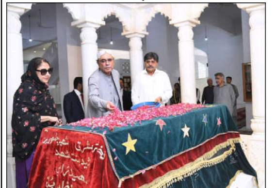
LARKANA: President Asif Ali Zardari showering petals over the grave of Shaheed Mohtarma Benazir Bhutto on her 71st birth anniversary, in Garhi Khuda Baksh Bhutto.

Reflecting on his recent visit to China where he held fruitful and productive meetings with President Xi Jinping and Premier Li Qiang, the prime minister commended the vision of the Chinese leadership for the continued growth of Pakistan-China strategic relations and the shared desire of both countries to work together to ensure success of the CPEC and its upgradation to the next phase.