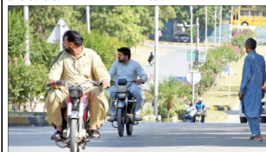
ISLAMABAD: People riding motorcycles as looking wrong side at a road in the Federal Capital, which may cause any incident any time.

The Council expressed deep regret over the increasing frequency of such incidents, highlighting that the measures taken against the perpetrators have been insufficient. The Council believed that it is the responsibility of the state and judiciary to administer punishment to an accused of blasphemy acts or discretion of the holy book. The Council condemned the ongoing trend of individuals taking the law into their own hands, acting as judge, jury, and executioner, as wholly unacceptable. The Council urged the government and all state institutions, particularly the police and judiciary, to handle such cases decisively and without any compromise, vested interests, or fear.