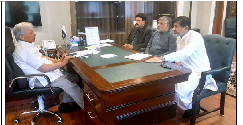
ISLAMABAD: The delegation of All Pakistan Fertilizer Dealers Association (APFDA) calls on the Federal Minister for Industries and Production Rana Tanveer Hussain