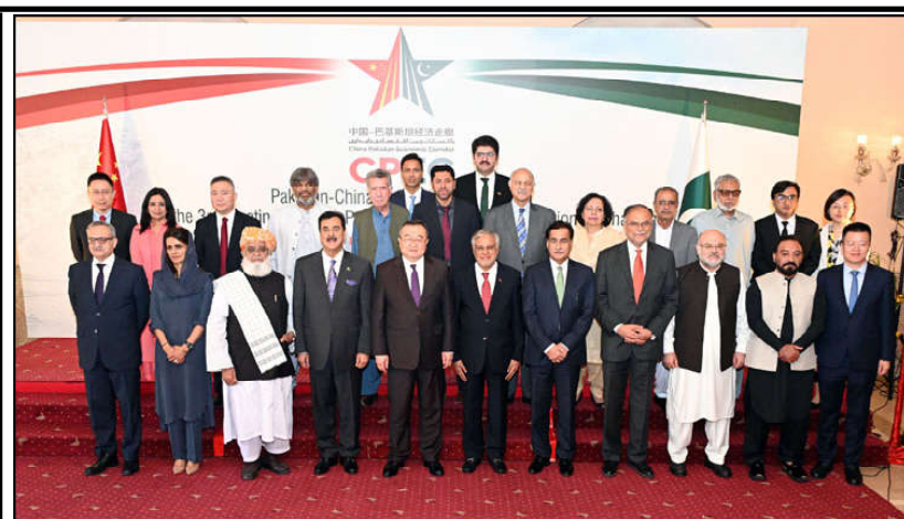
ISLAMABAD: Speaker National Assembly Sardar Ayaz Sadiq in a group photo with participant's pf 3rd Pakistan-China joint consultative meeting of political parties on CEPEC, in the Federal Capital.

Yesterday, PPP Chairman Bilawal Bhattu Zardari called on Prime Minister Shehbaz Sharif to discuss the former's reservations over the budget 2024-25. The prime minister urged all political parties to work together for the development and prosperity of the country and public welfare.