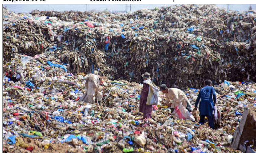
ISLAMABAD: Gypsy people searching valuables in a heap of garbage outside fruit and vegetable market at sector I-11 in the Federal Capital.