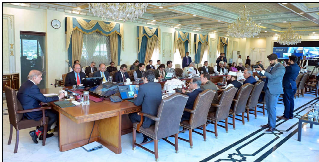
ISLAMABAD: A delegation of leading exporters of Pakistan calls on Prime Minister Muhammad Shehbaz Sharif.