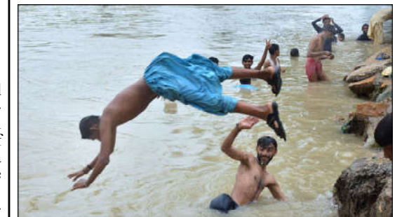
HYDERABAD: Youngster diving in water canal to get relief from hot weather in the city.

agement Company in the cleanliness campaign. Speaking on the occasion, he said that Chief Minister Punjab had vowed to make Punjab, a neat and clean province terming it a good sign that Bahawalpur Waste Management Company had lifted offal during three days of Eid-ul-Azha. "You can not spot offal anywhere in the city," he said. He said that the Punjab government had introduced dynamic policies and strategies to put the province on track of development.