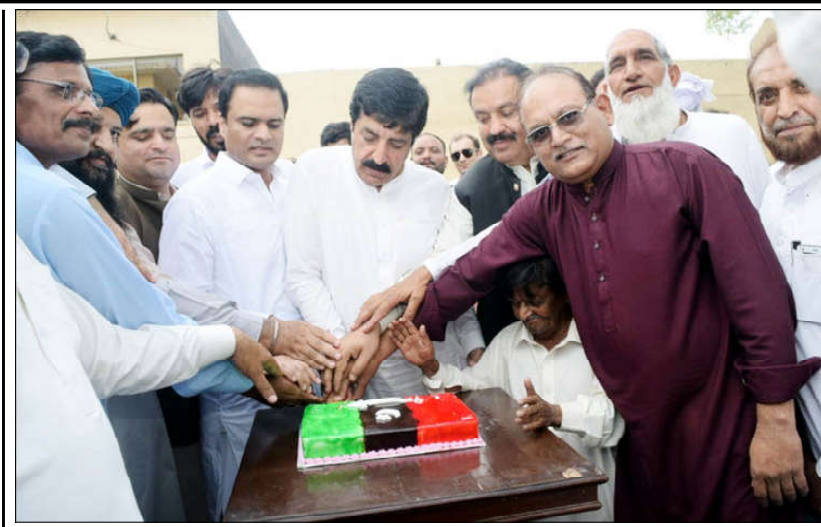
LAHORE: Punjab Governor Sardar Saleem Haider Khan cutting the cake on the eve of birth anniversary of martyred Benazir Bhutto.

resolve power-related issues as per their commitments. He expressed disappointment that the federal government has not fulfilled its promises. Despite significant recoveries from high-loss areas, unscheduled load-shedding continues. He highlighted that the severe load-shedding is making life unbearable for the residents of the province. The public's reaction to unscheduled load shedding is intensifying, he added. "Protests against load-shedding are not driven by any political party or provincial government but are a genuine public issue. People are struggling to get water for drinking at home and for ablution in mosques," he added. Gandapur warned that if the situation persists, public reaction might spiral out of control. He urged the federal government to take the matter seriously.