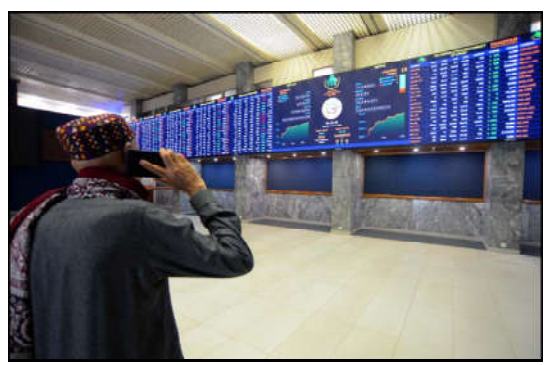
KARACHI: Brokers are busy in trading at Pakistan Stock Exchange (PSX) in Karachi.

In PSX, the three top trading companies were Silk Bank Ltd with 53,586,473 shares at Rs. 1.09 per share, the K-Electric Ltd with 23,109,865 shares with Rs. 4.72 per share and Habib Bank with 20,943,162 shares at Rs. 121.92 per share. Rafhan Maize Products Company Limited witnessed a maximum increase of Rs. 86.62 per share price, closing at Rs. 7,706.92, whereas the runner-up was Ismail Industries Limited with a Rs. 63.93 rise in its per share price to Rs. 1,443.93.