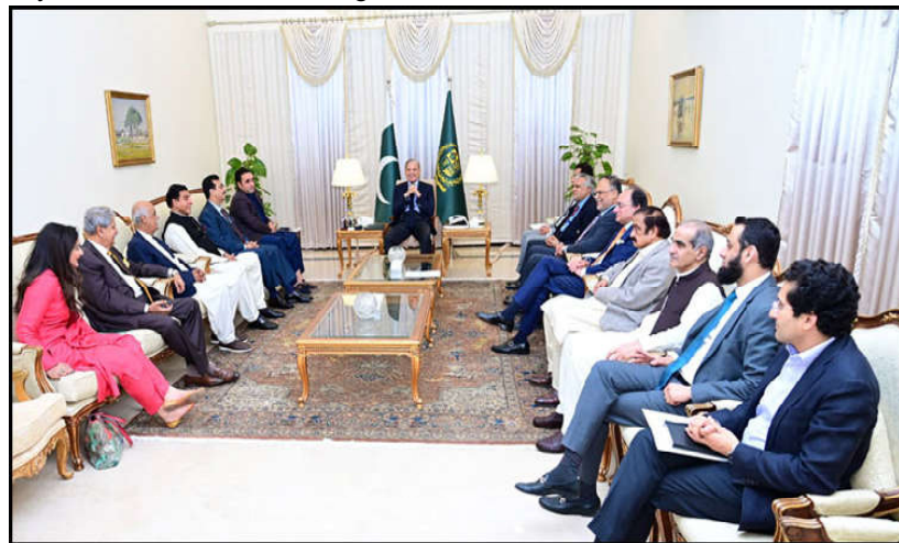
ISLAMABAD: A delegation of Pakistan People's Party headed by Chairman Bilawal Bhutto Zardari meeting with Prime Minister Shehbaz Sharif