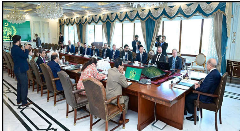
ISLAMABAD: A high level delegation of Google for Education calls on Prime Minister Muhammad Shehbaz Sharif.

He said the government was taking steps to increase the capacity of the country's youth through the use of modern technology.