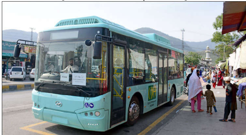
ISLAMABAD: A view of electric busses on their way at a road in the area of Bari Imam during test service in the Federal Capital. The residents of Islamabad will see more busses on city roads soon as out of the 160 electric busses 30 have arrived from China and another fleet of 70 is on the way.

Romina Khurshid thanked and lauded the UNDP - Pakistan for their generous offer for helping Pakistan through the climate change and environmental coordination ministry to build up resilience of the climate-vulnerable sectors, particularly agriculture, urban flood resilience and early warning for disaster risk reduction. "I would leave no stone unturned to avail any opportunity that help us protection lives and livelihoods of the people and socio-economic sectors particularly agriculture, water, energy, health, education through climate adaptation and mitigation measures," Romina Khurshid Alam told the UNDP - Pakistan's senior official Van Nguyen. "Greater financial protection and faster and more reliable disaster preparedness and response provided under the initiative can contribute to effectively responding to the vulnerabilities as well as climate change-related loss.