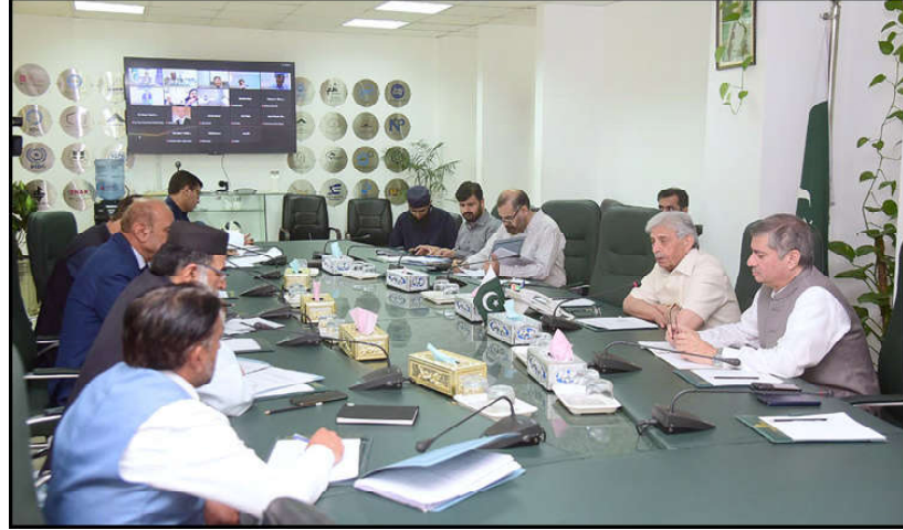
ISLAMABAD: Federal Minister for Industries and Production Rana Tanveer Hussain presides over a meeting of the Fertilizer Review Committee.