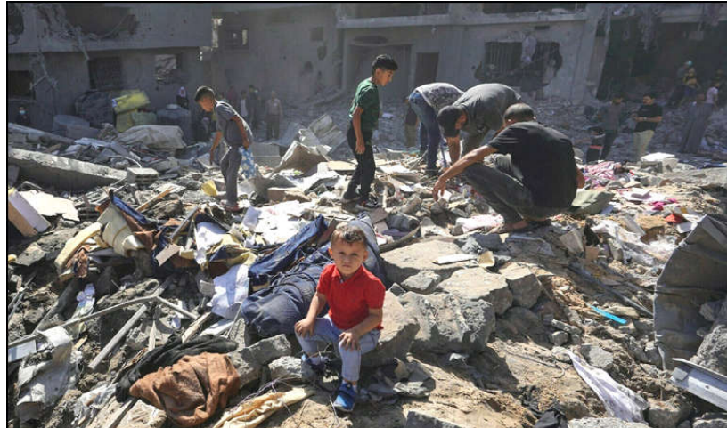
A Palestinian boy sits as people search the rubble of the Harb family home destroyed in overnight Israeli strikes in al-Bureij refugee camp in the central Gaza Strip.

gimes like North Korea and China, Iran, Russia - then it's even more important that we are aligned as countries believing in freedom and democracy," he said. The growing closeness between Russia and other Asian nations means it is all the more important that NATO works with allies in the Asia-Pacific, he said, adding this was why leaders from Australia, Japan, New Zealand and South Korea had been invited to a NATO summit in Washington next month.