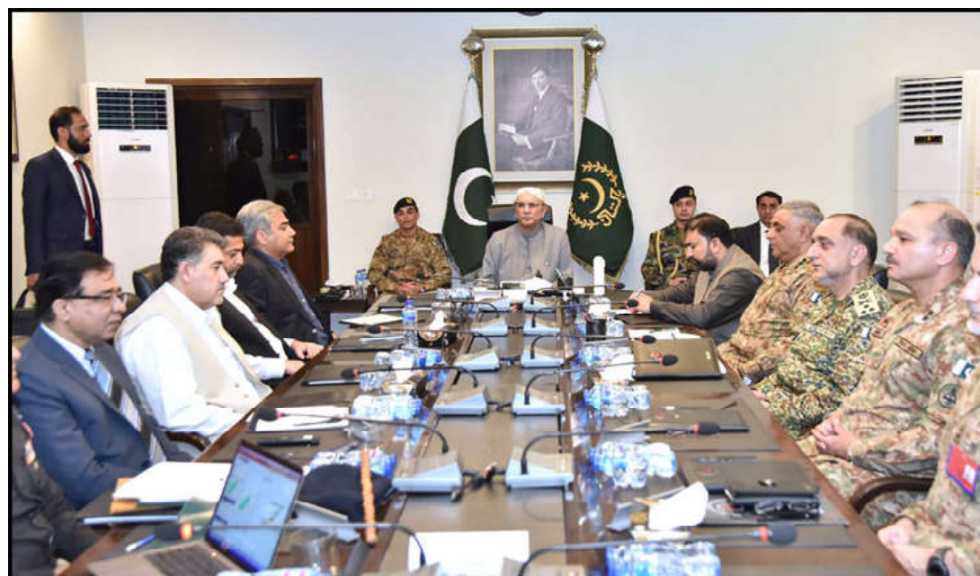
GWADAR: President Asif Ali Zardari chairing a meeting on the security and law and order situation of Balochistan.