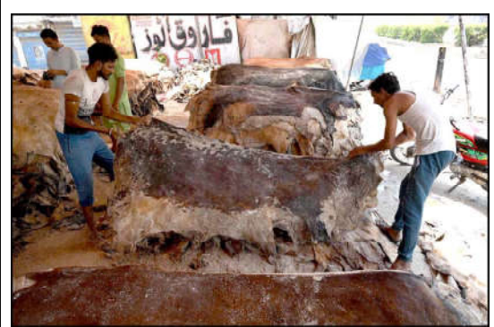
PESHAWAR: Workers preserving the hides of sacrificial animals at their warehouse at Ring road.

He said that at the moment, the economy of the country is facing multiple challenges, which have slowed down the business activities, therefore, the ICCI felt the need to bring the leadership of the entire business community at one place and give comprehensive as well as workable proposals to the government for the revival of business and economic activities.