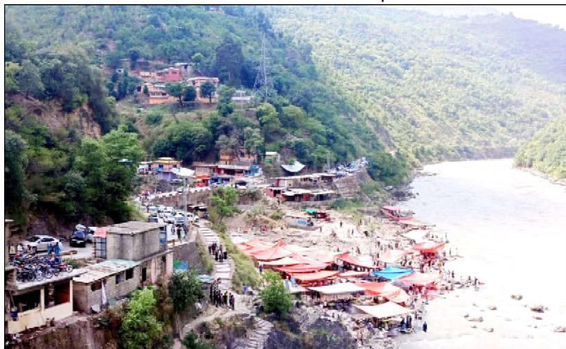
ABBOTTABAD: Beautiful eye-catching view of the Neelum tourist point which attract domestic and international tourists, which represents the beautification of country

Religious and political personalities from these areas will attend the huddle which Maulana Fazl will also address. The grand Jirga has been called in the wake of rising lawlessness in the tribal belt.