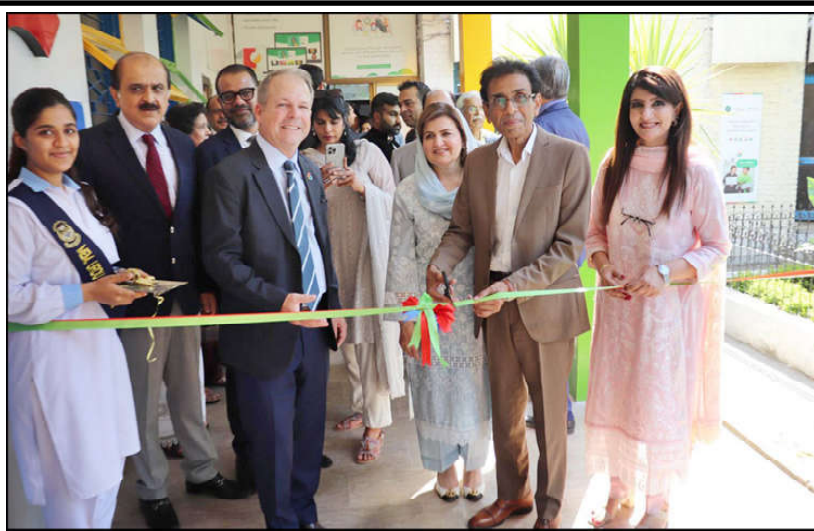
ISLAMABAD: Minister for Federal Education and Professional Training, Dr. Khalid Maqbool Siddiqui inaugurates a Tech-Ed Centre of Excellence established in collaboration with Google at IMCG, F-6/2.

Talking to the PTV news channel, he said that almost 43 transfer stations were being set up at the Union Council level.