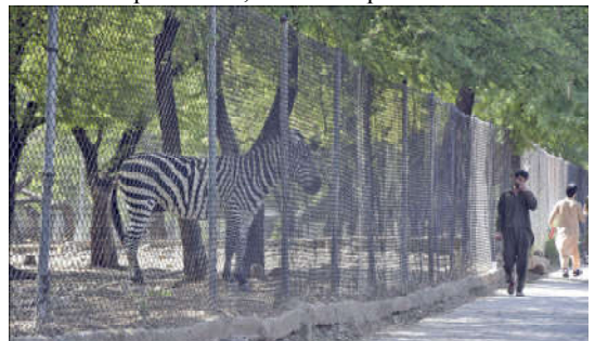
ISLAMABAD: A zebra stands under the shade of trees in a cage on a green belt alongside Faisal Avenue during hot summer day in the Federal Capital.

Replying to a question, he emphasized the need to address the root causes of displacement and ensure the safety of millions affected by conflict, violence, and climate change, noting that the forcibly displaced were among the world's most vulnerable communities.