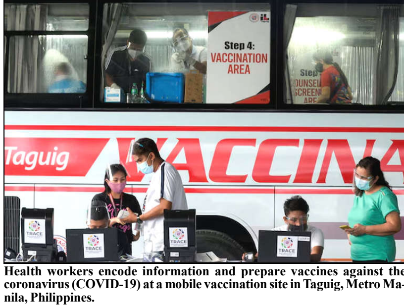
Health workers encode information and prepare vaccines against the coronavirus (COVID-19) at a mobile vaccination site in Taguig, Metro Manila, Philippines.