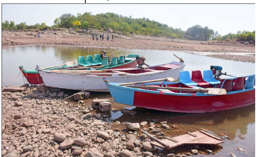
ISLAMABAD: A view of decreasing water level at Rawal Dam after hot weather in the Federal Capital.

He further said that the efforts and duties performed by Islamabad Police during Eid-ul-Adha were appreciated by all segments of society and citizens on various forums.