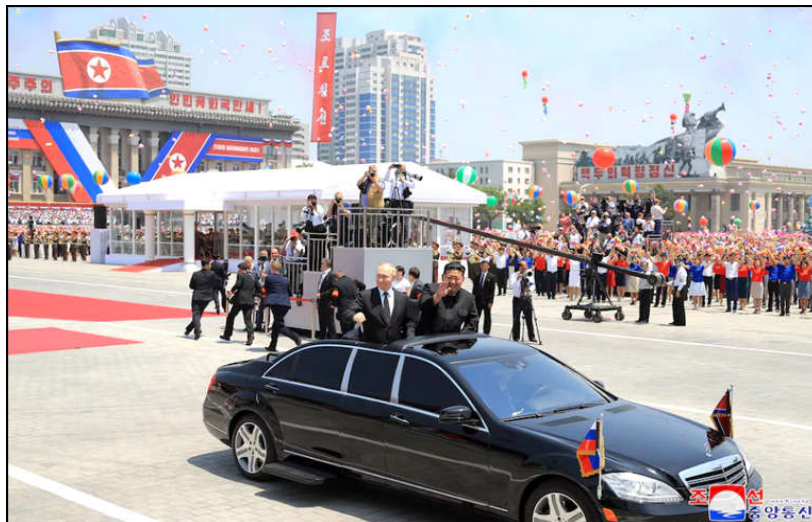
Russia's President Vladimir Putin and North Korea's leader Kim Jong Un attend an official welcoming ceremony at Kim Il Sung Square in Pyongyang, North Korea in this image released by the Korean Central News Agency.

West and the United States in particular, including its support for Ukraine. The agreement also said neither side would sign any treaty with a third country that infringes on the interests of the other and will not allow its territory to be used by any country to harm the other's security and sovereignty, KCNA said. The two countries will take joint actions aimed at "strengthening defence capabilities to prevent war and ensure regional and international peace and security", it said. South Korea and the White House did not immediately have comment on the reported content of the agreement. Japan expressed "grave concerns" about Putin's vow not to rule out cooperation with Pyongyang on military technology.