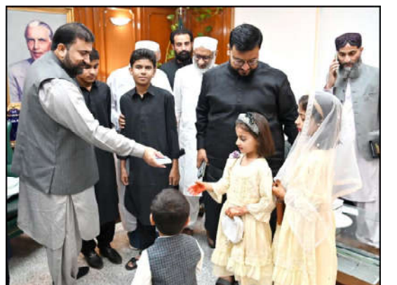
QUETTA: Chief Minister Balochistan Mir Sarfaraz Ahmed Bugti giving Eidi to children.

"Terrorists and criminals do not manufacture these arms," the Pakistani envoy told delegates, pointing out they acquire them from illicit arms markets or receive them from entities that want to destabilize a particular region or country.