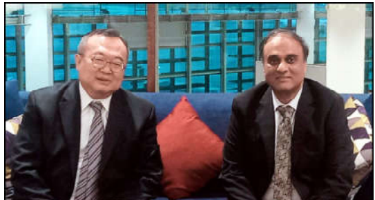
ISLAMABAD: Minister of the International Department of the Communist Party of China (IDCPC), Liu Jianchao received at the Islamabad International Airport by Additional Foreign Secretary.

The search for the abductees has begun by the law enforcement agencies.