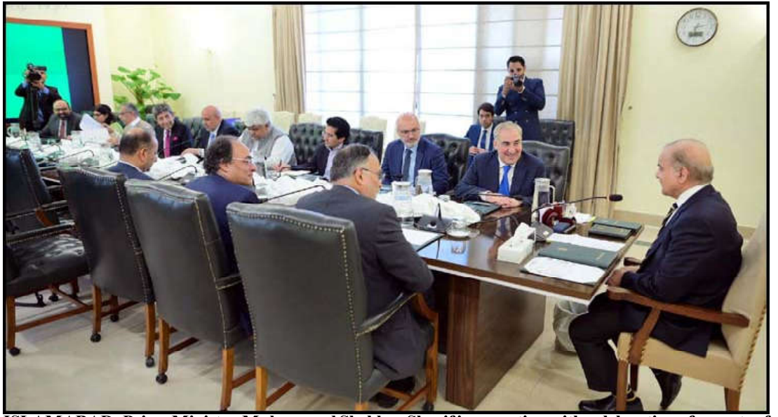
ISLAMABAD: Prime Minister, Muhammad Shehbaz Sharif in a meeting with a delegation of experts of Power Sector led by Nika Gilauri Former Georgian Prime Minister, in Islamabad.

The prime minister expressed his government's desire to promote alternative energy sources, particularly solar energy, and reduce reliance on expensive energy sources. He said the government would also promote public private partnership in the energy sector. The prime minister directed the federal ministers to consult with the delegation regarding the basic reforms of the country's energy sector and to evolve a comprehensive strategy regarding the reforms immediately. Minister for Planning and Development Ahsan Iqbal, Finance Minister Muhammad Aurangzeb, Petroleum Minister Musadik Malik, Power Minister Awaiz Ahmed Khan Leghari, Minister of State for Finance Ali Pervaiz Malik, and relevant high officials attended the meeting.