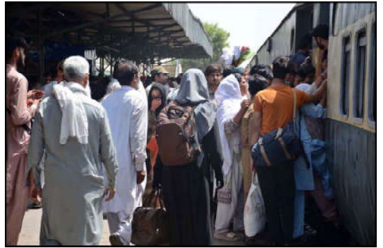
FAISALABAD: People departing back to the city at Railway Station after spending Eid-ul-Azha holidays at their hometowns.