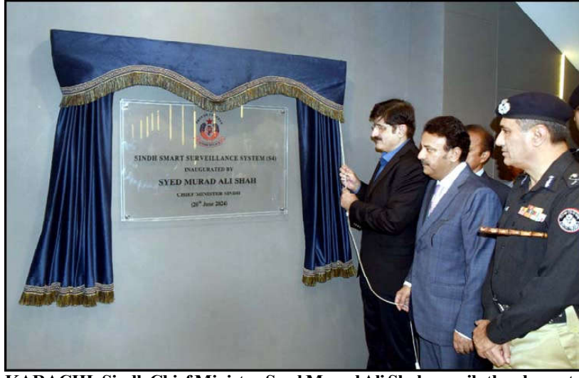
KARACHI: Sindh Chief Minister, Syed Murad Ali Shah unveils the plaque to inaugurate the Sindh Smart Surveillance System (S-4) during inauguration ceremony held at Chief Police Office (CPO) in Karachi.

A spokesperson for the Safe Cities stated the Waste Management Company took timely action based on Safe City's alerts. The Lahore Waste Management Company (LWMC) personnel were also on duty at the Safe City Center. The Safe City is providing all possible support to law enforcement and civic agencies.