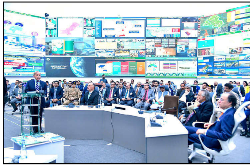
ISLAMABAD: Prime Minister Muhammad Shehbaz Sharif addresses the National Emergencies Operation Centre.

"This is not an expenditure. This is an investment to save our future investments," he remarked.