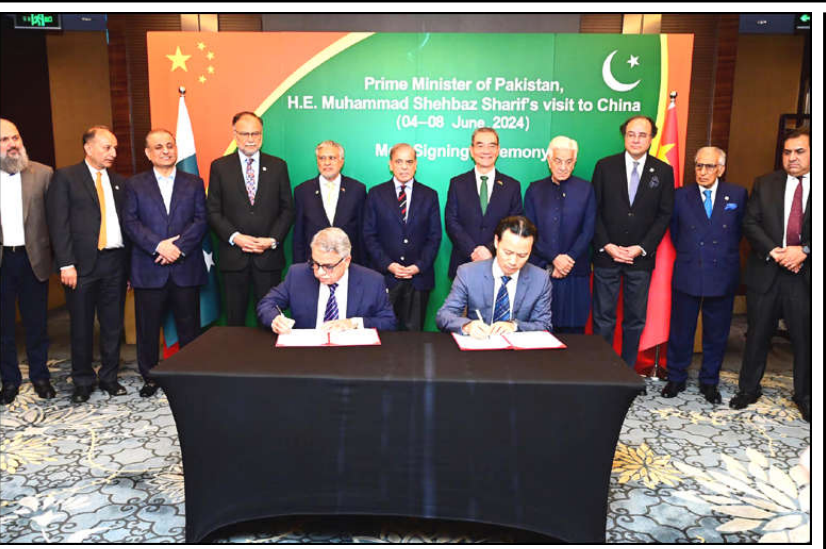
BEIJING: Prime Minister Muhammad Shehbaz Sharif witnesses signing of Memorandums of understanding regarding cooperation in different fields between China and Pakistan.