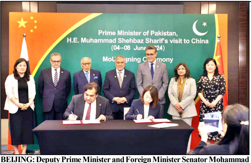
Ishaq Dar witnesses the signing ceremony of MoUs between the Board of Investment and several Chinese entities.