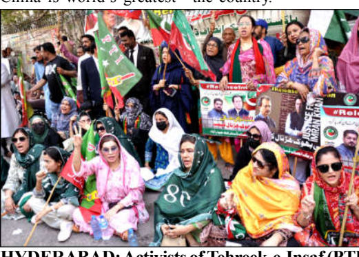
HYDERABAD: Activists of Tehreek-e-Insaf (PTI) are holding protest demonstration for release of PTI Founder Imran Khan, at Hyderabad press club.

He said Pakistan condemns this dastardly act and will ensure every humanly possible effort to protect each Chinese citizen across