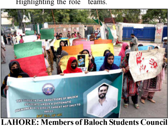
Punjab are holding protest demonstration against enforced disappearance of students and demanding their recovery, at Lahore press club.

of sports in uniting diverse cultures and enhancing diplomatic relations, he emphasized that sports serve as a bridge bringing cultures, nations, and individuals closer, and have historically been a vital tool in diplomacy. He also wished Pakistan and the USA for an exciting game of cricket. Team Pakistan will be starting its World Cup campaign against the talented hosts. the United States at Grand Prairie Stadium, in Dallas Texas where a large crowd is expected to cheer for both