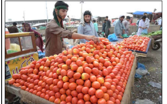
ISLAMABAD: A vendor arranging and displaying tomatoes on handcart to attract the customers at Fruit & Vegetable Market in Federal Capital.