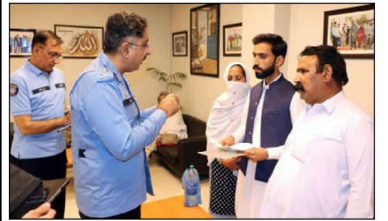
Katchery at the Central Police Office Islamabad, a public relations officer said.

ISLAMABAD (APP): International Day of the Seafarer was observed across the globe on Tuesday. The International Maritime Organization (IMO) designated 25 June as the International Day of the Seafarer in 2010. The day also aimed to support and promote seafarers and sailors who are essential to the global trade and transport industry.