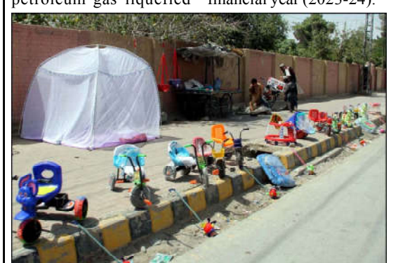
QUETTA: Vendor sells toys to earn his livelihood for support his family, at a roadside stall located on Zarghoon road in Quetta.

Cargo volume of 161,353 tonnes, comprising 128,100 tonnes imports cargo.