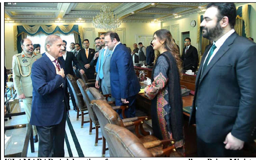
ISLAMABAD: A delegation of young entrepreneurs calls on Prime Minister Muhammad Shehbaz Sharif.

provision of economic opportunities. He also noted that the usage of latest technology for increasing agriculture yield could further boost the exports. The prime minister informed the delegation that they were also reducing the size of the government's structure and resolved to make the state-owned entities more efficient. During the meeting, the prime minister directed for the constitution of a youth entrepreneurs advisory committee comprising the youth business people on the pattern of Economic Coordination Committee. The prime minister said the promotion of bilateral business cooperation between Pakistan and China was their top priority, adding with the second phase of China Pakistan Economic Corridor, the industrial development would be accelerated.