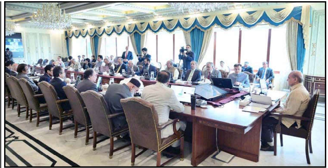
ISLAMABAD: Prime Minister Muhammad Shehbaz Sharif chairs Federal Cabinet Meeting.

ISLAMABAD (APP): President Asif Ali Zardari has stressed that eliminating the scourge of drug abuse required creation of awareness, strengthening of anti-narcotics laws, investing in prevention and treatment and engaging communities. "We also need to educate our youth about the harmful impacts of drug abuse to save them from this menace. Additionally, we should divert the energies of our youth into healthy and productive activities. The future of our young generation lies in our hands," the president said in a message on the occasion of 'International Day Against Drug Abuse and Illicit Trafficking' being observed on June 26. Today, the president said they commemorated the international day against drug abuse and illicit trafficking under the theme "The evidence is