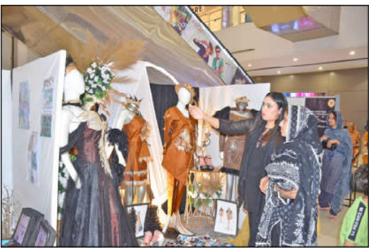
FAISALABAD: Students of GC University Faisalabad Fashion Designing are exhibiting their designed dresses.