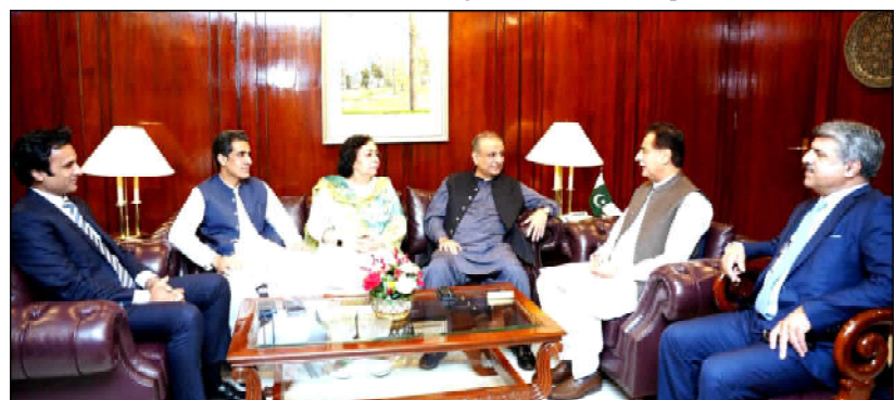
ISLAMABAD: Parliamentary Delegation of Istihkam-e-Pakistan Party (IPP) headed by Federal Minister for Privatization, Board of Investment and Communications Abdul Aleem Khan called on Speaker National Assembly Sardar Ayaz Sadiq.

ISLAMABAD (INP): Federal Minister for Planning Ahsan Iqbal said that the government would cut Rs 250 billion from the proposed budget for the fiscal year 2024-25. Speaking to the media, Ahsan Iqbal said that confirmed that a cut of Rs 250 billion would be made in the federal development program. He said that the cut was essential to overcome the revenue shortfall and that the development budget had to bear the brunt of it.