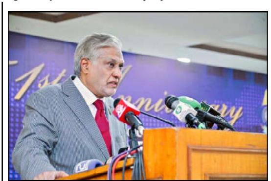
ISLAMABAD: Deputy Prime Minister and Foreign Minister Senator Ishaq Dar delivers remarks at 51st Anniversary of Institute of Strategic Studies.

ISLAMABAD (APP): The three new judges of Supreme Court of Pakistan on Tuesday took oath of their offices in a ceremony at apex court Islamabad. Chief Justice of Pakistan (CJP) Qazi Faez Isa administered the oath to Justice Malik Shahzad Ahmad Khan, Justice Aqeel Ahmed Abbasi, and Justice Shahid Bilal Hassan as top court's judges in a ceremony. The oath taking ceremony was attended by judges of SC, attorney general of Pakistan and senior lawyers. The law ministry has issued the notification on Monday, which stated that under Article 177 of the Constitution, the president pleased to appoint Sindh High Court (SHC) Chief Justice Aqeel Ahmed Abbasi, Lahore High Court (LHC) Chief Justice Malik Shahzad Ahmad Khan and LHC's Justice Shahid Bilal Hassan as judges of the Supreme Court.