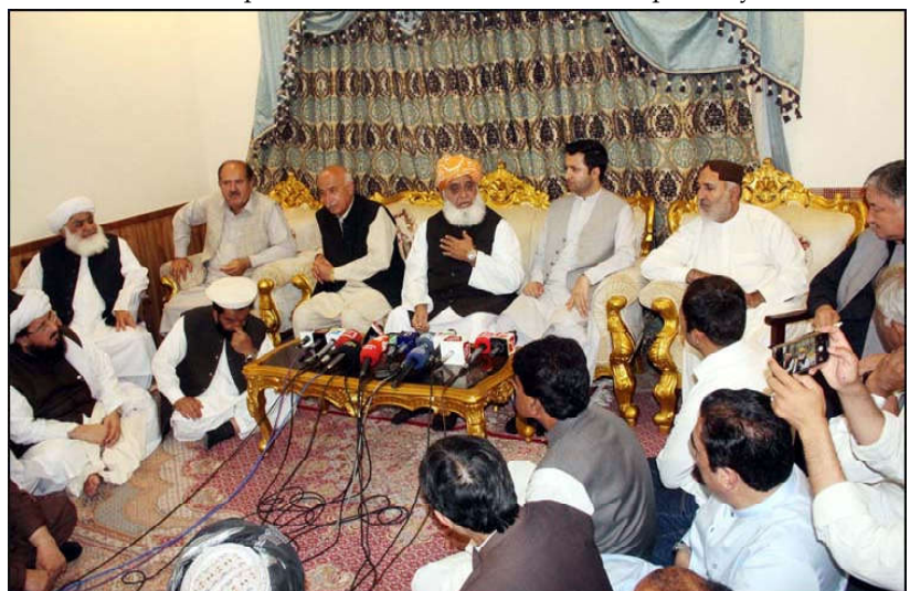
QUETTA: Jamiat Ulema-e-Islam (JUI-F) Chief, Maulana Fazlur-Rehman addresses to media persons during press conference, in Quetta.

The election commission distributed the reserved seats for women and minorities among other political parties. In the Khyber Pakhtunkhwa Assembly — according to a notification, the ECP allocated one reserved seat each to Jamiat Ulema-e-Islam Pakistan, Pakistan Muslim League-Nawaz (PML-N) and Pakistan People's Party (PPP).