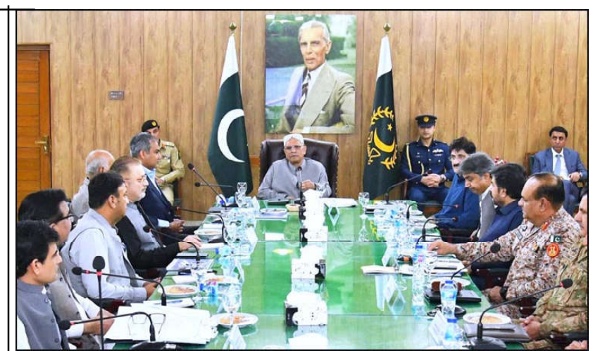
SUKKUR: President Asif Ali Zardari chairing a meeting on the security/law and order situation in Sindh during his visit to Sukkur.

The meeting was further informed that, on the directions of the President, the campaign against drug peddlars was intensified and, in this regard, 308 drug suppliers had been arrested, besides installing smart cameras to monitor the entry points of the province.