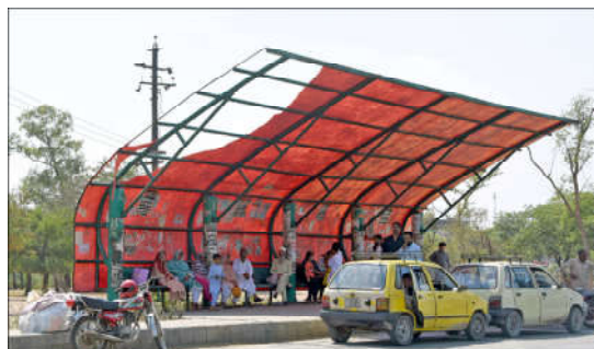
ISLAMABAD: People are sitting under the shade of damaged bus station as waiting for public transport, alongside Islamabad expressway in the Federal Capital, as needs to attention for concern authorities.