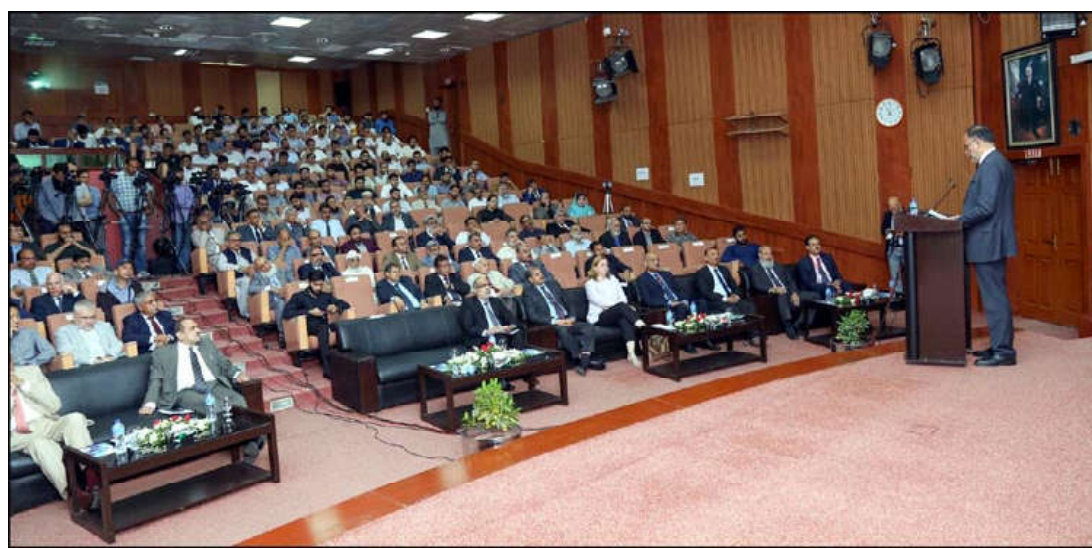
Prof. Ahsan Iqbal, Federal Minister for Planning, Development, and Special Initiatives, being the Chief Guest, addressed the ceremony of 49th International Nathiagali Summer College on Physics and Contemporary Needs was inaugurated at the National Center for Physics, Islamabad