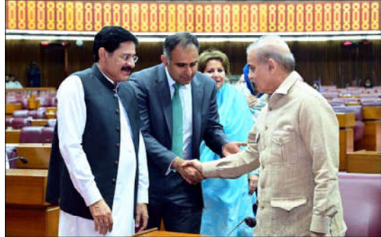
ISLAMABAD: Prime Minister, Muhammad Shehbaz Sharif interacts with Members of the National Assembly during National Assembly Budget Session in Islamabad.

ISLAMABAD (APP): Division in the Cabinet and Frontier Regions, Kashmir Affairs and Gilgit-Baltistan, Engineer Amir Muqam has said that he had always represented FATA, PATA/Malakand Division at the center in 2016, 2018, 2023 and would continue to do so in the future. He said that he would continue to represent his people at all levels regardless of the results. In a meeting with the delegation of Malakand Traders Federation and Swat Chamber of Commerce, Amir Muqam reiterated that he would continue to raise awareness about the sacrifices of the people of FATA and PATA/Malakand