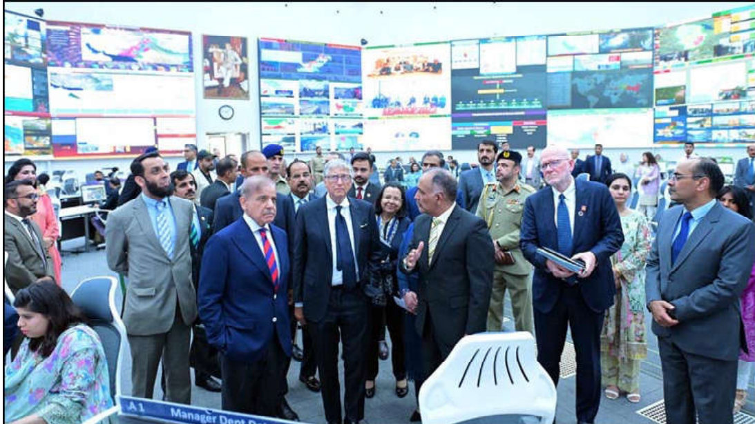
ISLAMABAD: Chairman NDMC briefs Prime Minister Muhammad Shehbaz Sharif and Chairman Gates Foundation, Bill Gates during their visit of NDMC.

Vol. XIV No. 145 Reg. mails-B / ID-445 Tuesday June 25, 2024, Zil Hajj 18, 1445 A.H. Ph: 2158688, 2158997 Pages 4: Rs. 12