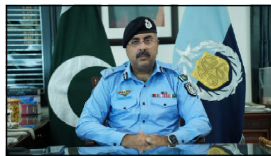
IG Islamabad reorganized the Dolphin Squad Islamabad and deployed young police officers in the Dolphin Emergency Response Unit to control street crime and effectively arrest the accused. Moreover, departmental training for these officers was initiated at Police Lines to enhance patrolling efficiency.

A traffic theme park was specially designed and constructed to provide a peaceful and recreational space for families and children to spend beautiful moments together. To promote friendly policing and reduce the gap between the public and police, the "Friend of Police Internship Program" was launched, allowing students from various educational institutions to work in different divisions of Islamabad Police and be briefed on police work by officers.