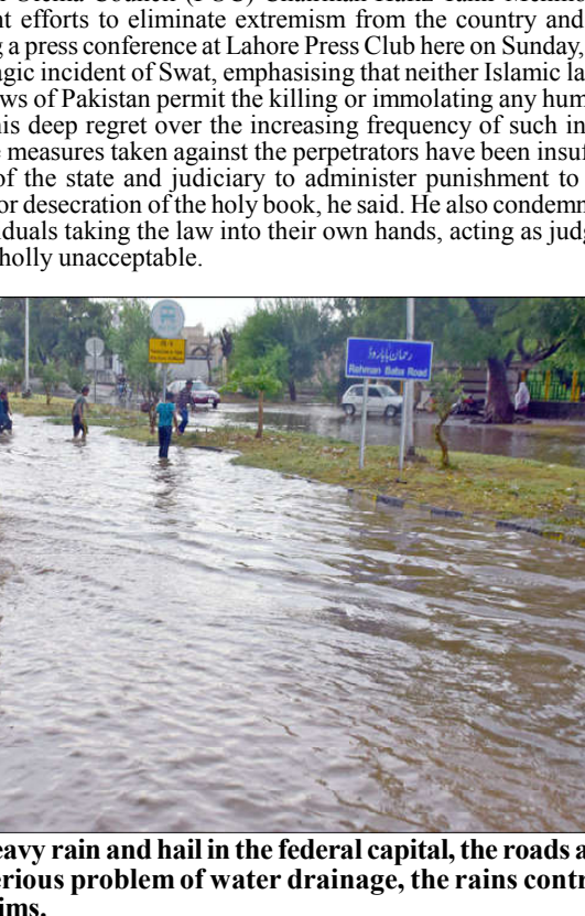
ISLAMABAD: After heavy rain and hail in the federal capital, the roads are looking like ponds. A serious problem of water drainage, the rains controverts the CDA's tall claims.

LAHORE (APP): Pakistan Ulema Council (PUC) Chairman Hafiz Tahir Mehmood Ashrafi has called for joint efforts to eliminate extremism from the country and to educate society. Addressing a press conference at Lahore Press Club here on Sunday, he strongly condemned the tragic incident of Swat, emphasising that neither Islamic laws nor the Constitution and laws of Pakistan permit the killing or immolating any human being. Ashrafi expressed his deep regret over the increasing frequency of such incidents, highlighting that the measures taken against the perpetrators have been insufficient. It is responsibility of the state and judiciary to administer punishment to an accused of blasphemy acts or desecration of the holy book, he said. He also condemned the ongoing trend of individuals taking the law into their own hands, acting as judge, jury, and executioner, as wholly unacceptable.