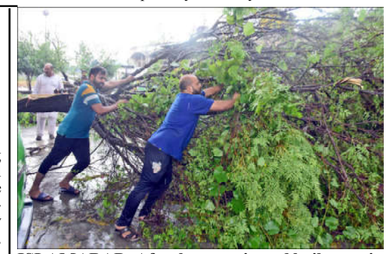
ISLAMABAD: After heavy rain and hailstorm in the federal capital, tree falling accidents have occurred in most areas in which cars damaged.

ISLAMABAD (APP): Out of four car lifter gang members, three were killed and a woman accomplice was apprehended in a police encounter on Sunday near Kashmir Chowk, Islamabad.