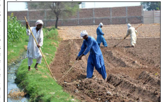
MULTAN: Farmers are preparing land for the next crop using the old method.

Kernal rice is available for Rs 270 per kg with a decrease of Rs 50. According to rice market sources, the price of rice has been decreasing continuously for the last two months, the artificial inflation in the market has been eliminated due to better rice harvest in the last season and effective government policies. Market sources said that the price of rice in the market was likely to remain at the current level for the next few weeks.