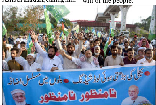
RAWALPINDI: Activists of Jamaat-e-Islami shouting slogans during protest against inflated electricity bills, at Murree road in the city.

He praised President Asif Ali Zardari, calling him the king of reconciliation and credited him with the ability to bring the country out of difficult situations by uniting all institutions and political parties. He also appreciated the government for not imposing taxes on medicines and supported the tax on luxury items. He highlighted the issues of Tharparkar and urged the federal government to address these problems.