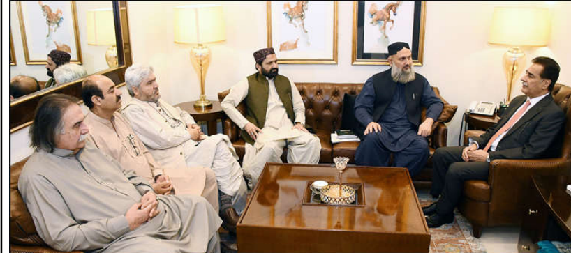
ISLAMABAD: Delegation of Member National Assembly belonging to Balochistan led by Federal Minister for Commerce Jam Kamal Khan in a meeting with Speaker National Assembly Sardar Ayaz Sadiq at Parliament House.

The PPP have asked for a share in the governmental departments while also demanding representation in the market committees, zakat committees and bait-ul-maal committees.