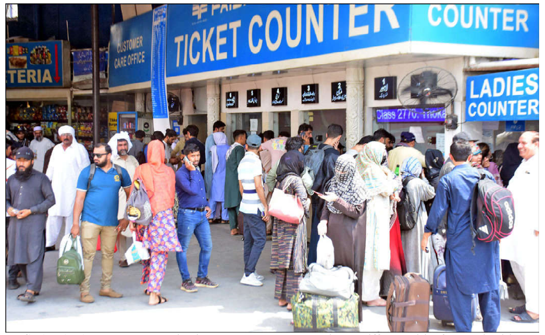
ISLAMABAD: Peoples standing in queue as they are heading to different cities from twin cities.

ban in their respective provincial and admirative territories as a part of the federal government's 'Plastic-Free Pakistan' campaign. But, "now it is heartening to note all provincial governments are making efforts to rid the country of environmentally-damaging plastics in support to achieve the goal of Plastics-Free Plastic", PM's Coordinator Romina Khurshid said, rejoicingly. The PM's aide recalled that in Islamabad implementation ban on single-use plastics and other plastic items faced stiff challenges including resistance from businesses, lack of alternatives, and enforcement issues.