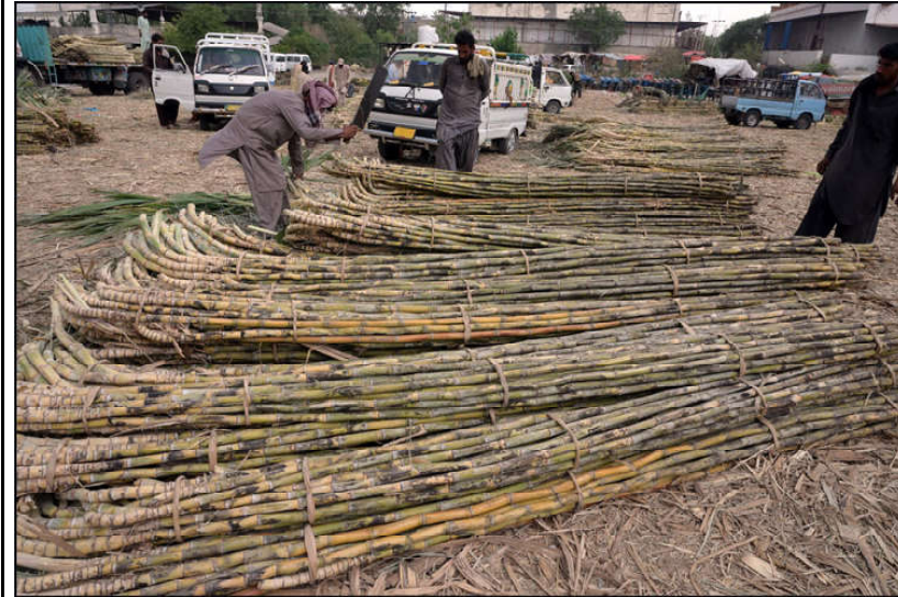
ISLAMABAD: Labours busy cutting sugarcane at fruit market.