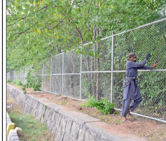
ISLAMABAD: The fence of the Golf Club adjacent to the Islamabad Club is being reset.