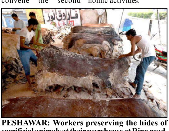
sacrificial animals at their warehouse at Ring road. | and QICT on Thursday.

moment, the economy of the country is facing multiple challenges, which have slowed down the business activities, therefore, the ICCI felt the need to bring the leadership of the entire business community at one place and give compre-hensive as well as workable proposals to the government for the revival of business and economic activities.