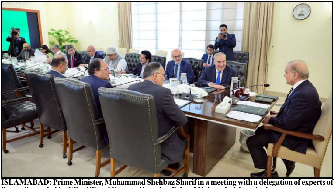
Power Sector led by Nika Gilauri Former Georgian Prime Minister, in Islamabad.

The prime minister expressed his government's desire to promote alternative energy sources, particularly solar energy, and reduce reliance on expensive energy sources. He said the government would also promote public private partnership in the energy sector. The prime minister directed the federal ministers to consult with the delegation regarding the basic reforms of the country's energy sector and to evolve a comprehensive strategy regarding the reforms immediately. Minister for Planning and Development Ahsan Iqbal, Finance Minister Muhammad Aurangzeb, Petroleum Minister Musadik Malik, Power Minister Awais Ahmed Khan Leghari, Minister of State for Finance Ali Pervaiz Malik, and relevant high officials attended the meeting.