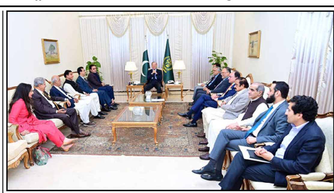
ISLAMABAD: A delegation of Pakistan People's Party headed by Chairman Bilawal Bhutto Zardari meeting with Prime Minister Shehbaz Sharif

Speaker National As-sembly Sardar Ayaz Sadiq, Deputy Prime Minister and Minister for Foreign Affairs Ishaq Dar, Federal Minister for Planning Ahsan Iqbal, Federal Minister for Finance and Revenue Muhammad Aurangzeb Federal Minister for Information and Broadcasting Attaullah Tarar were also present in the meet-