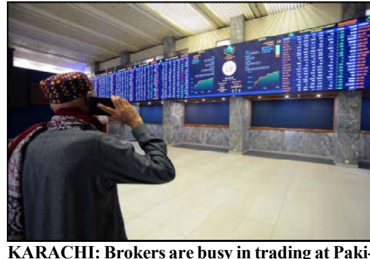
KARACHI: Brokers are busy in trading at Pakistan Stock Exchange (PSX) in Karachi.

In PSX, the three top trading companies were Silk Bank Ltd with 53,586,473 shares at Rs. 1.09 per share, the K-Electric Ltd with 23,109,865 shares with Rs.4.72 per share and Habib Bank with 20,943,162 shares at Rs.121.92 per share. Rafhan Maize Products Company Limited witnessed a maximum increase of Rs.86.62 per share price, closing at Rs.7,706.92. whereas the runner-up was Ismail Industries Limited with a Rs.63.93 rise in its share price to