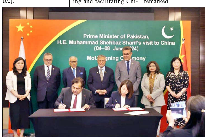
BEIJING: Deputy Prime Minister and Foreign Minister Senator Mohammad Ishaq Dar witnesses the signing ceremony of MoUs between the Board of Investment and several Chinese entities.

Japan, through JICA, has extended this generous grant to Pakistan, marking the 7th installment of the JDS project since its inception in 2018. This year, the grant will provide seventeen (17) scholarships for Master's programs and one (1) for a PhD/Doctorate program at prestigious universities in Japan for young Federal Civil Service and Ex-Cadre officers of Pakistan. Since 2018, six (6) batches, each comprising around 18 participants, have benefited from the JDS scholarships.