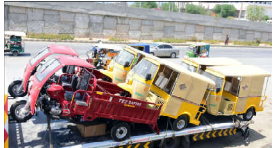
ISLAMABAD: A trailer loaded with CNG Rickshaws heading towards destination on Karnal Sher Khan Shaheed Road in the Federal Capital.