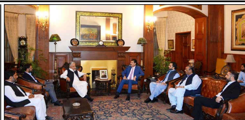
A representative delegation of Sarhad Chamber of Commerce and Industries calls on Governor Khyber Pakhtunkhwa Faisal Karim Kundi at Governor House Peshawar.

The company head recalled that under Shehbaz Sharif's supervision, the Lahore Orange Line project was completed timely.