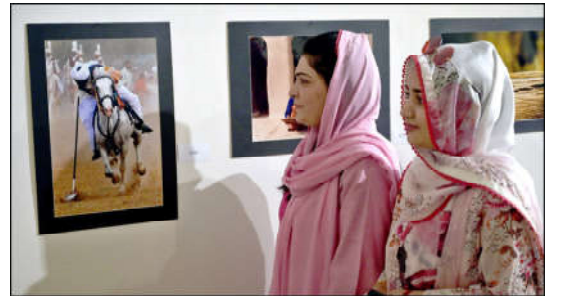
ISLAMABAD: Art lover women are taking keen interest in a sport portrait at the Annual Members Photographic Competition & Exhibition, hosted in collaboration with Islamabad Club and Islamabad Camera Club at PNCA in the Federal Capital.