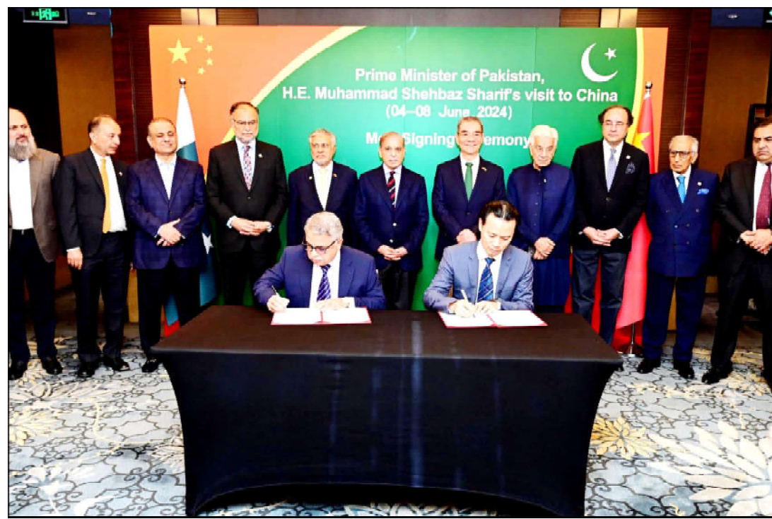
BEIJING: Prime Minister Muhammad Shehbaz Sharif witnesses signing of Memorandums of understanding regarding cooperation in different fields between China and Pakistan.

He said having come into being two years after Pakistan, China took its trade to trillions of dollars while Pakistan's hovered around $30-40 billion in terms of exports. Besides, China has excelled in information technology and artificial intelligence. He also referred to the "wonderful" bilateral cooperation in space program as Pakistan recently sent a lunar satellite and a space satellite recently with Chinese collaboration.