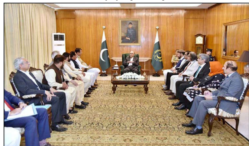
ISLAMABAD: A delegation of the members of the Gilgit-Baltistan Council calls on President Asif Ali Zardari, at Aiwan-e-Sadr.