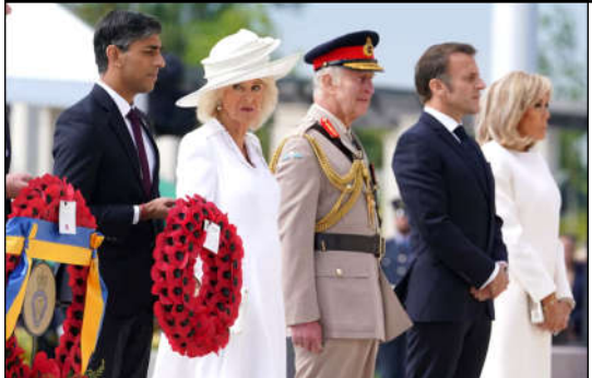
British Prime Minister Rishi Sunak, Queen Camilla, Britain's King Charles, President of France Emmanuel Macron and his wife Brigitte Macron attend the UK national commemorative event for the 80th anniversary of D-Day, held at the British Normandy Memorial in Ver-sur-Mer, Normandy, France.

lometer (620-mile) front line after more than two years of war. Dmitry Medvedev, deputy head of Russia's Security Council, said that Putin's comments Wednesday in St. Petersburg, Russia, amounted to "a quite significant shift in our foreign policy." "Let the U.S. and its allies feel the impact of direct use of Russian weapons by others," Medvedev wrote on his messaging app channel. Putin deliberately didn't name potential recipient countries of Russian weapons, Medvedev said. They could go to anyone who considers the U.S. and its allies their enemies, he said. Kremlin spokesman Dmitry Peskov said Thursday the use of Western weapons against Russia "can't be left without consequences, and those consequences will certainly follow." Putin claimed that using some Western-supplied weapons involves military personnel of those countries controlling the missiles and selecting targets, and therefore he said that "asymmetrical" steps elsewhere in the world.