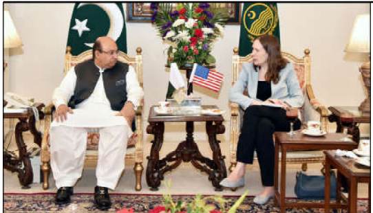
LAHORE: American Consul General Kristin K Hawkins meeting with Punjab Minister for Finance Mujtaba Shuja ur Rehman.

equipment to students and alleviate travel difficulties. He said investment would be made in solar systems to reduce electricity bills, and private sector investment would be encouraged for mega projects. The minister said there would be no increase in taxes burdening the poor in the budget. The provincial minister informed the consul general that the Punjab government would not impose any tax on net wealth. Instead of increasing property tax rates, changes would be made in the tax base, he added. A reasonable increase in property tax rates was proposed after five years.