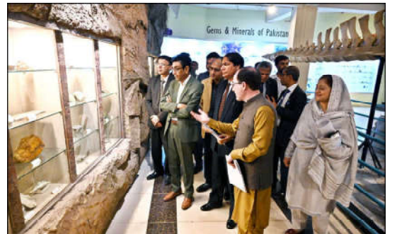
ISLAMABAD: Federal Minister for Science and Technology, Dr. Khalid Maqbool Siddiqui, explores the galleries at the Pakistan Museum of Natural History Garden Avenue during the Foundation Stone Laying Ceremony for new blocks.

He added that the initial allocation of 10 acres for the Daanish schools project has been increased to 30 acres.