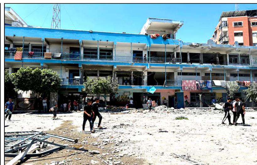
Palestinians inspect the site of an Israeli strike on a UNRWA school sheltering displaced people, amid the Israel-Hamas conflict, in Nuseirat refugee camp in the central Gaza Strip.

are in power in Afghanistan... We have to build up relations with the Taliban government." Putin's comments came hours after a Taliban delegation arrived in St Petersburg to attend the economic forum. Russian Foreign Minister Sergei Lavrov had said last week that Moscow planned to take the Taliban off its list of banned terrorist organizations, nearly three years after the group seized power from a US-backed government. "They are the real power" in Afghanistan, Lavrov said at the time, speaking during a visit by Putin to Uzbekistan. The Taliban were designated a terrorist organisation by Moscow in 2003.