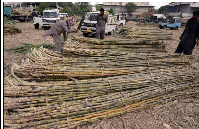
ISLAMABAD: Labours busy cutting sugarcane at fruit market.