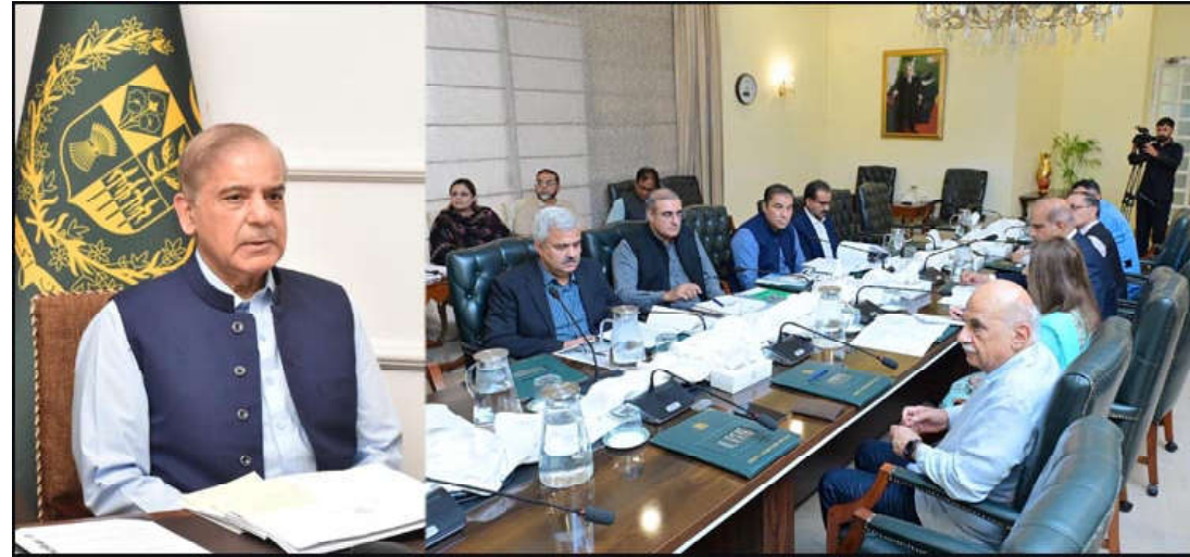
Prime Minister Muhammad Shehbaz Sharif chairs a meeting regarding law & order and security projects in Islamabad, in Lahore.