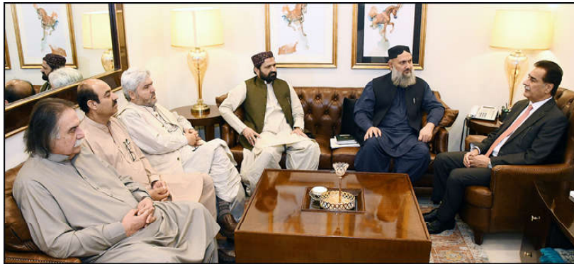
ISLAMABAD: Delegation of Member National Assembly belonging to Balochistan led by Federal Minister for Commerce Jam Kamal Khan in a meeting with Speaker National Assembly Sardar Ayaz Sadiq at Parliament House.

where they had gone for picnic. The reports suggested that the persons mostly young people were kidnapped after identification. They are included three real brothers and three their cousins belonging to Quetta and Mulan. Two of them had come from Multan to Quetta on summer vacations. Meanwhile, the families of abducted persons have demanded of the government to ensure their safe recovery at the earliest. They said that they are undergoing mental agony due to kidnaping of their dear ones.