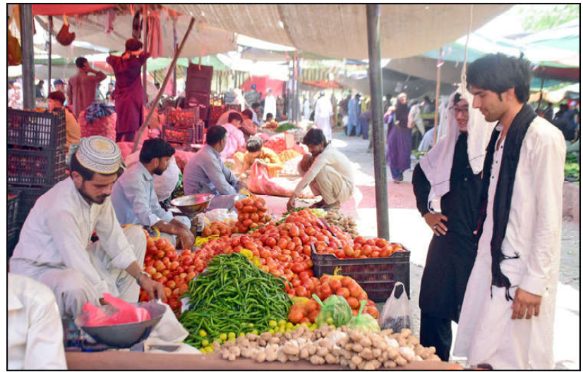
ISLAMABAD: Vendors selling vegetables at Sector G-10 Sunday Bazaar in the Federal Capital.

well-funded defence budget. "It is necessary to allocate a good portion of funds keeping in view the critical condition on the borders," he added. Qaiser also shed light on the positive developments in the agriculture sector and said that the agricultural advancements were vital for food security, rural development and export potential, making this sector a cornerstone of economic policy. In his concluding remarks, Qaiser urged the government to intensify its focus on information technology and agriculture as both sectors have great potential to meet the demands of modern-day life.