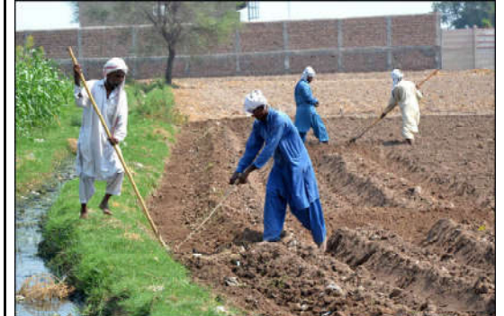
MULTAN: Farmers are preparing land for the next crop using the old method.

Kernal rice is available for Rs 270 per kg with a decrease of Rs 50. According to rice market sources, the price of rice has been decreasing continuously for the last two months, the artificial inflation in the market has been eliminated due to better rice harvest in the last season and effective government policies. Market sources said that the price of rice in the market was likely to remain at the current level for the next few weeks.