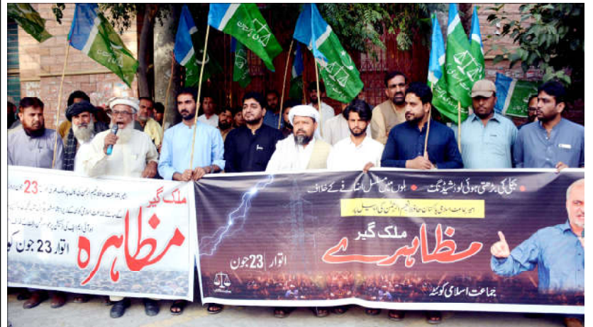
QUETTA: Activists of Jamaat-e-Islami shouting slogans during protest against inflated electricity bills

The ongoing session would remain continued till June 29.