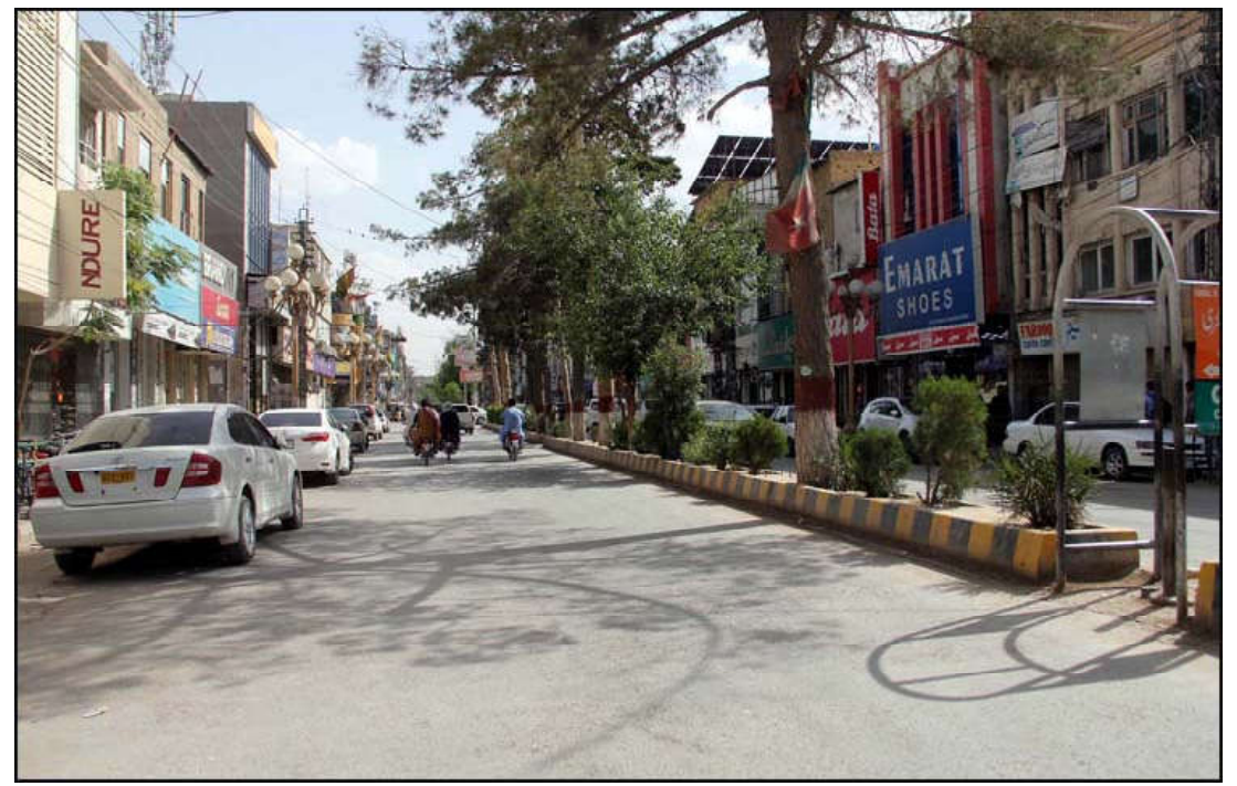
QUETTA: View of city gives desert look due to hot weather of summer season, in Quetta.

graded version of CPEC in Pakistan. He said that the first corridor would be a 'corridor of growth' bringing rapid economic growth to Pakistan, and the second corridor would be a 'corridor of livelihood' under which socioeconomic programs would be developed, poverty would be eradicated, and jobs would be created. Speaking about the third corridor, which he called the 'corridor of innovation, we had a special focus on artificial intelligence (AI) and as everyone knows that the world was far away in this sector and China was also competing with the world, we would take advantage from Chinese's experts and make