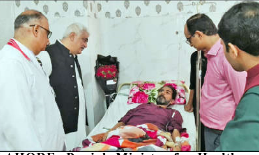
LAHORE: Punjab Minister for Health and Emergency Services Salman Raifque enquiring about the health of Punjabi Poet Tajamul Kaleem.

He said that the provincial government should patronize the elected local body representatives so that the basic problems of the people can be solved at their doorsteps.