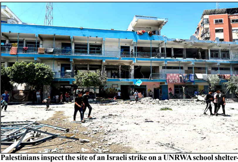
ing displaced people, amid the Israel-Hamas conflict, in Nuseirat refugee camp in the central Gaza Strip.

The need for the board to hold Iran accountable to its legal obligations is long overdue. Iran must urgently, fully and unambiguously cooperate with the agency Britain, France and Germany said in a statement on the resolution they proposed