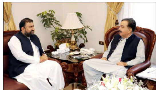
QUETTA: Chief Minister Balochistan Mir Sarfaraz Ahmed Bugti meeting with Governor Balochistan Sheikh Jaffar Khan Mandokhail.