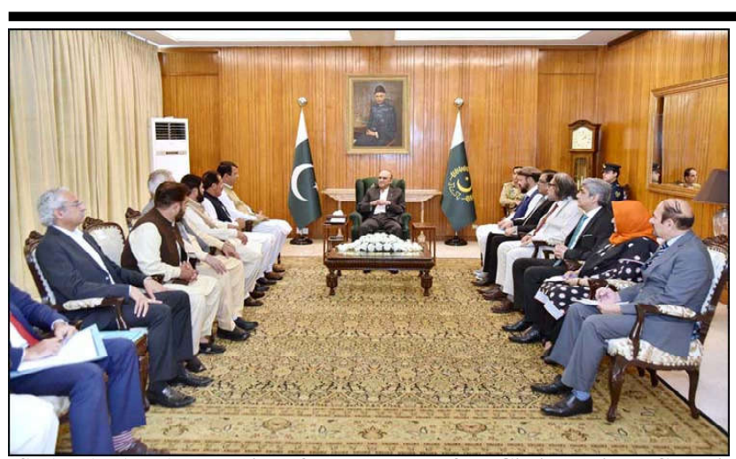
ISLAMABAD: A delegation of the members of the Gilgit-Baltistan Council calls on President Asif Ali Zardari, at Aiwan-e-Sadr.