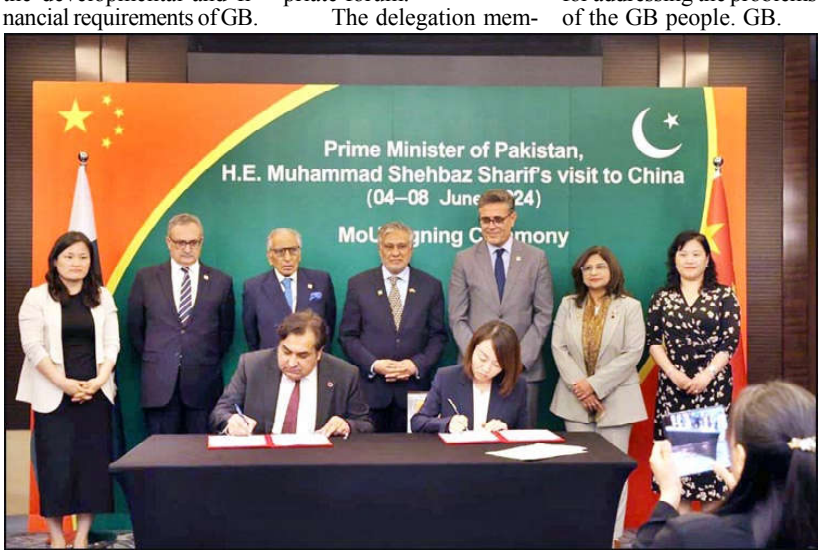
BEIJING: Deputy Prime Minister and Foreign Minister Senator Mohammad Ishaq Dar witnesses the signing ceremony of MoUs between the Board of Investment and several Chinese entities.

President Zardari assured the delegation of his cooperation and support for addressing the problems of the GB people. GB.