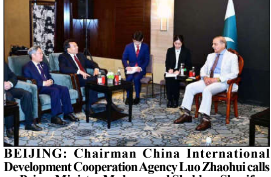
on Prime Minister Muhammad Shehbaz Sharif.

ISLAMABAD (Online): Election Commission (EĆ) has adjourned hearing of case pertaining to change of tribunal set up in connection with the constituencies in federal capital. A 4-member commission headed over by Chief Election Commissioner (CEC) took up the matter for hearing Thursday. Counsels for MNAs of PML-N appeared before EC. The counsels for PTI backed candidates from three constituencies also