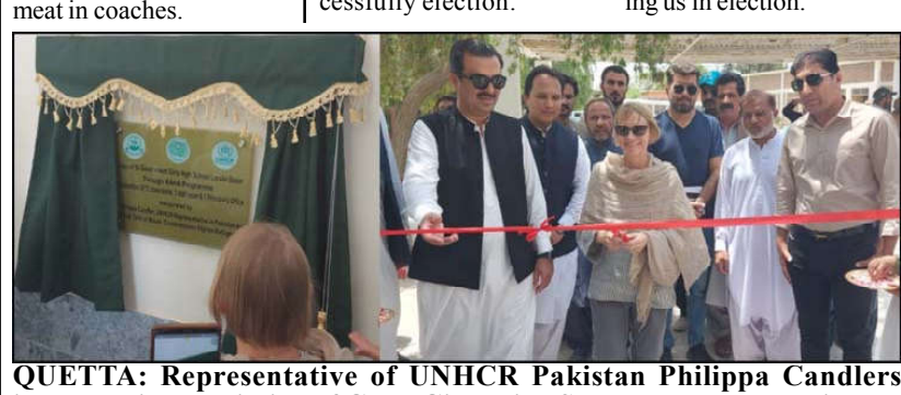
inaugurating a building of Govt. Girls High School constructed with the

They also thanked PBC's staffs for supporting us in election