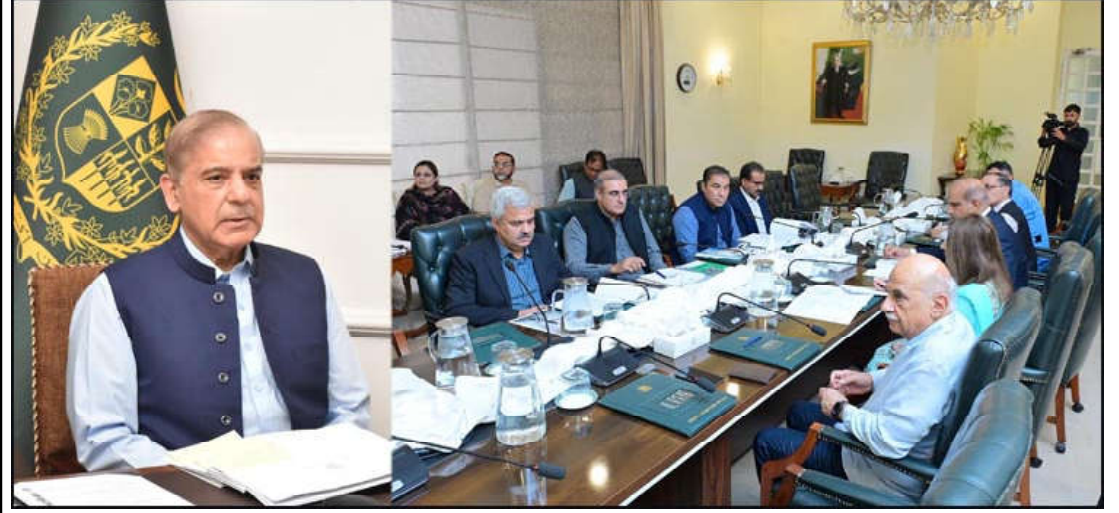
Prime Minister Muhammad Shehbaz Sharif chairs a meeting regarding law & order and security projects in Islamabad, in Lahore.

The meeting featured comprehensive briefings on various aspects of Islamabad's security infrastructure, including the Islamabad Model Jail, Islamabad Safe City, the Federal Counter Terrorism Department, and the Special Protection Unit. Updates were also provided on the Islamabad National Facilitation Centres and the K-9 Unit, aimed at enhancing detection of narcotics and explosives.