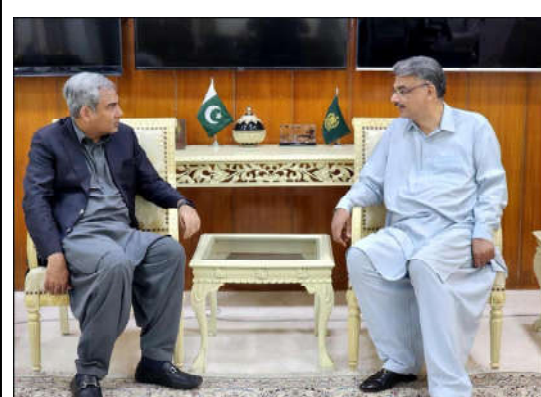
ISLAMABAD: Federal Minister for Interior Mohsin Naqvi in a meeting with Prime Minister of Azad Jammu and Kashmir Chaudhary Anwar-ul-Haq.

Later langar (food) was also distributed among the participants.