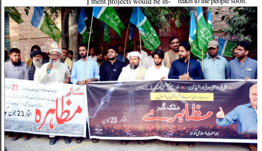
QUETTA: Activists of Jamaat-e-Islami shouting slogans during protest against inflated electricity bills

Large number of people participated in the rallies across major cities including Karachi, Lahore, Rawalpindi-Islamabad, Peshawar, Quetta, Hyderabad, Sukkur, Faisalabad, and Multan, as well as numerous small cities.