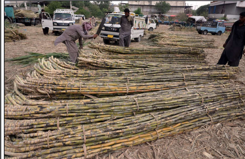
ISLAMABAD: Labours busy cutting sugarcane at fruit market.