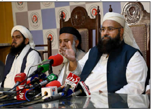
LAHORE: Chairman Pakistan Ulema Council, Allama Tahir Ashrafi is addressing a press conference at the Press Club.