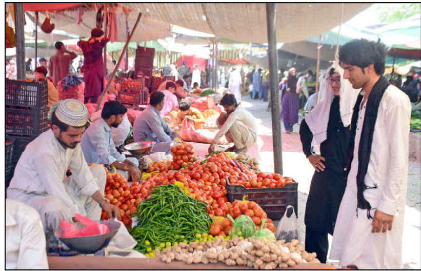
ISLAMABAD: Vendors selling vegetables at Sector G-10 Sunday Bazaar in the Federal Capital.

In his concluding remarks, Qaiser urged the government to intensify its focus on information technology and agriculture as both sectors have great potential to meet the demands of modern-day life.