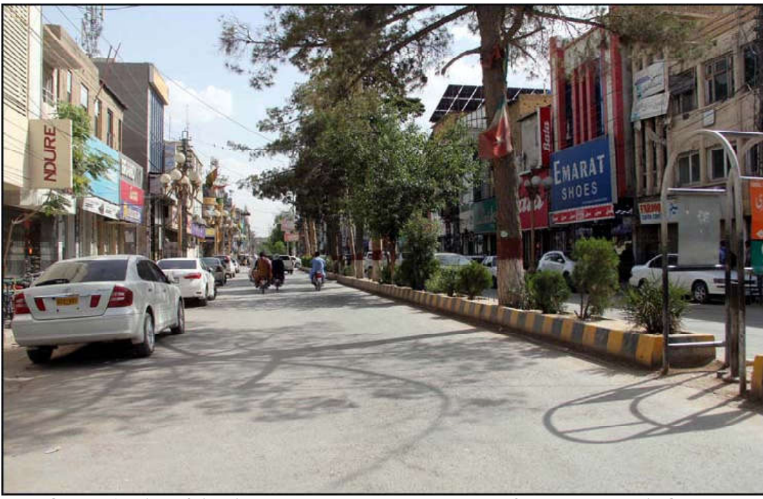
QUETTA: View of city gives desert look due to hot weather of summer season, in Quetta.