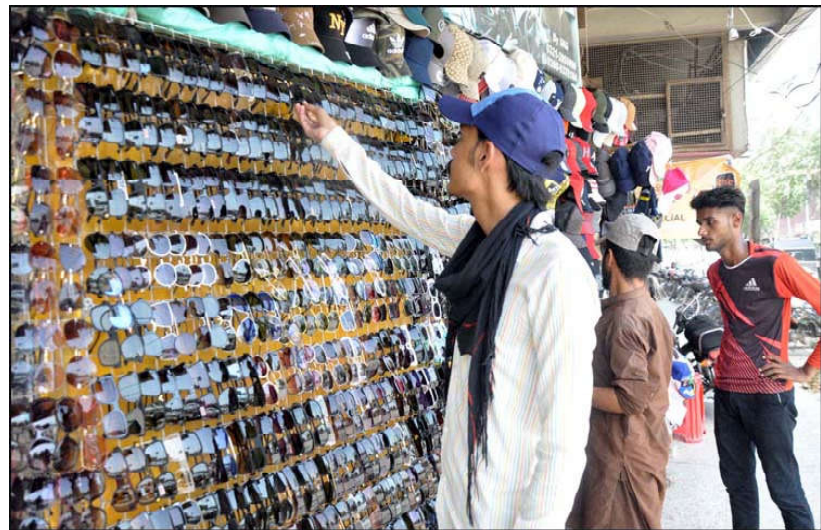
HYDERABAD: People are busy in buying sunglasses to protect themselves from scorching sun during hot weather in city, at a shop in Hyderabad.