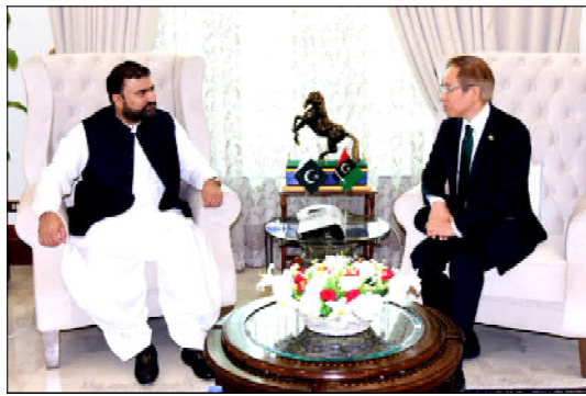
QUETTA: Ambassador of South Korea Park Kijun meeting with Chief Minister Balochistan Mir Sarfraz Ahmed Bugti.

The federal authorities insisted that it must be ensured that electricity would not be taken from QESCO system after the solar energy.