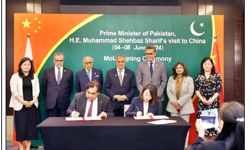
BEIJING: Deputy Prime Minister and Foreign Minister Senator Mohammad Ishaq Dar witnesses the signing ceremony of MoUs between the Board of Investment and several Chinese entities.

President Zardari assured the delegation of his cooperation and support for addressing the problems of the GB people. GB.