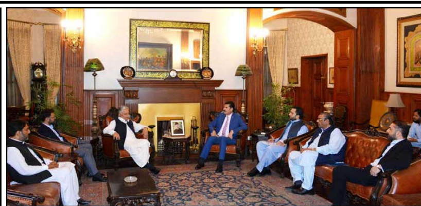
A representative delegation of Sarhad Chamber of Commerce and Industries calls on Governor Khyber Pakhtunkhwa Faisal Karim Kundi at Governor House Peshawar.

ISLAMABAD (APP): The Pakistan Telecommunication Authority (PTA) Zonal Office, Lahore, in close collaboration with the Federal Investigation Agency (FIA) Cyber Crime Circle, conducted a successful raid against franchisee of Telenor located on Jampur Road, DG Khan. The franchisee was found to be involved in the illegal issuance of SIMs, said a news release. During the raid, 17 BVS devices, 1 laptop, 360 active SIMs and 1000 scanned soft images of finger/thumb impressions from laptops were seized as evidence. Two persons were apprehended on the premises by the FIA, which is currently investigating the matter further.