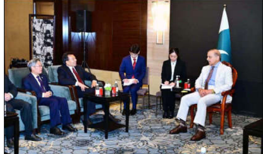
BEIJING: Chairman China International Development Cooperation Agency Luo Zhaohui calls on Prime Minister Muhammad Shehbaz Sharif.

Pakistan Economic Corridor (CPEC) as the hallmark of ironclad friendship between Pakistan and China, they noted that the Joint Working Group on Socio-economic Development under the CPEC had yielded positive results. They also expressed confidence that the momentum would continue in the CPEC phase II to improve the lives and livelihoods of the people. Prime Minister Shehbaz underlined that the governments and the peoples of both countries had always stood in solidarity with each other during times of natural disasters and calamities. He commended CIDCA's pivotal role in supporting developing countries particularly Pakistan during the COVID-19 pandemic, the post-2022 flood reconstruction, and the grant of polio vaccines.