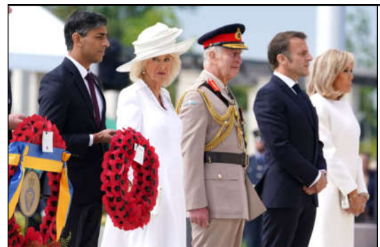
British Prime Minister Rishi Sunak, Queen Camilla, Britain's King Charles, President of France Emmanuel Macron and his wife Brigitte Macron attend the UK national commemorative event for the 80th anniversary of D-Day, held at the British Normandy Memorial in Ver-sur-Mer, Normandy, France.

are in power in Afghanistan... We have to build up relations with the Taliban government." Putin's comments came hours after a Taliban delegation arrived in St Petersburg to attend the economic forum. Russian Foreign Minister Sergei Lavrov had said last week that Moscow planned to take the Taliban off its list of banned terrorist organizations, nearly three years after the group seized power from a US-backed government. "They are the real power" in Afghanistan, Lavrov said at the time, speaking during a visit by Putin to Uzbekistan. The Taliban were designated a terrorist organisation by Moscow in 2003.