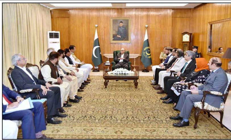
ISLAMABAD: A delegation of the members of the Gilgit-Baltistan Council calls on President Asif Ali Zardari, at Aiwan-e-Sadr.