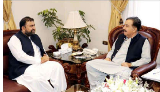
QUETTA: Chief Minister Balochistan Mir Sarfaraz Ahmed Bugti meeting with Governor Balochistan Sheikh Jaffar Khan Mandokhail.

It remained evident that the Balochistan Food Authority and relevant administrative authorities are actively engaged in action against the supply of sub-standard and unhealthy meat in coaches.