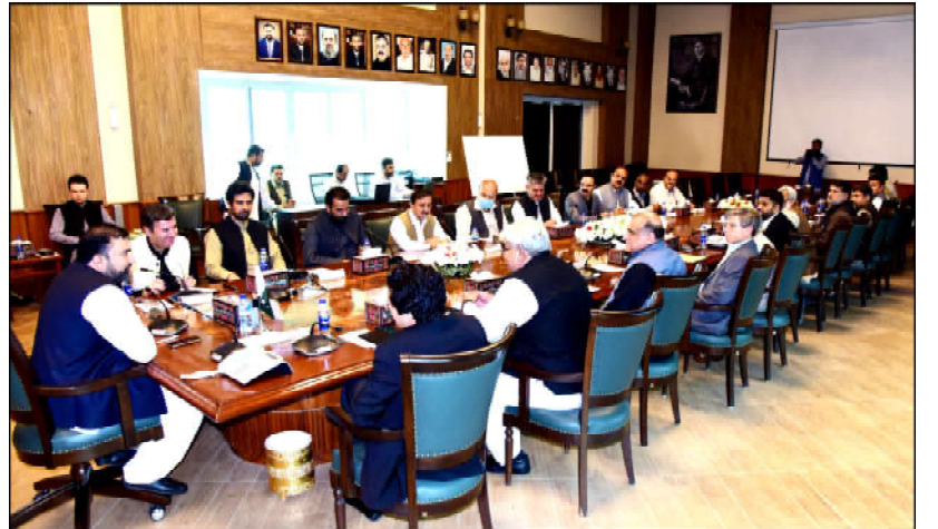
QUETTA: Balochistan Chief Minister Mir Sarfraz Ahmed Bugti presiding over joint meeting of Federal and Provincial officials regarding solarization.

He said having come into being two years after Pakistan, China took its trade to trillions of dollars while Pakistan's hovered around $30-40 billion in terms of exports. Besides, China has excelled in information technology and artificial intelligence. He also referred to the "wonderful" bilateral cooperation in space program as Pakistan recently sent a lunar satellite and a space satellite recently with Chinese collaboration.