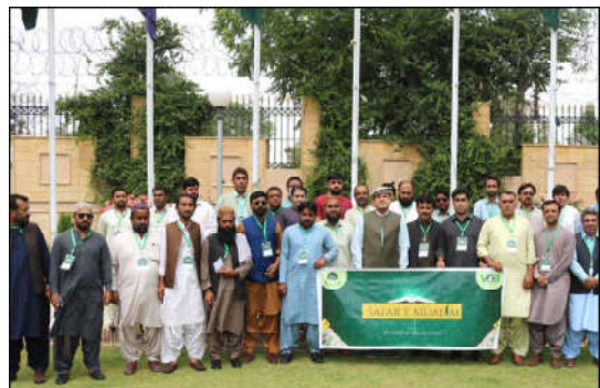
QUETTA: Speaker Balochistan Assembly Captain (Retd) Abdul Khaliq Achakzai in a group photo with the teachers coming from different districts of the Province led by Voice of Balochistan.

Atozai also drew attention to the systematic destruction of religious sites in India and other Islamophobic actions within that country.