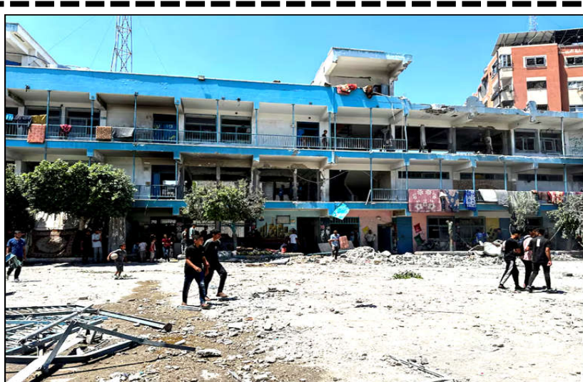
Palestinians inspect the site of an Israeli strike on a UNRWA school sheltering displaced people, amid the Israel-Hamas conflict, in Nuseirat refugee camp in the central Gaza Strip.

Monitoring Desk VIENNA: The UN nuclear watchdog's 35-nation board of governors passed a resolution on Wednesday calling on Iran to step up cooperation with the watchdog and reverse its recent barring of inspectors, despite concerns Tehran would respond with atomic escalation. Twenty countries voted in favour and two against — Russia and China — with 12 abstentions. It follows up on the last resolution 18 months ago that asked Iran to comply with a years-long International Atomic Energy Agency (IAEA) investigation into uranium traces found at undeclared sites. "The need for the board to hold Iran accountable to its legal obligations is long overdue. Iran must urgently, fully and unambiguously cooperate with the agency," Britain, France and Germany said in a statement on the resolution they proposed.