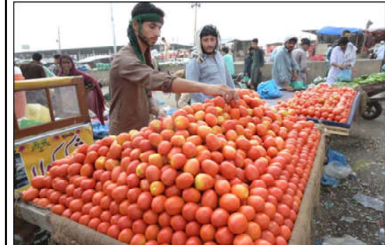
ISLAMABAD: A vendor arranging and displaying tomatoes on handcart to attract the customers at Fruit & Vegetable Market in Federal Capital.