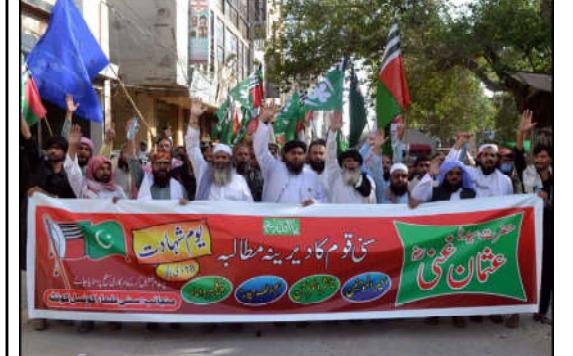
QUETTA: Members of Sunni Ulema Council chant slogan during rally on the martyrdom day of Hazrat Usman Ghani (RA), at Quetta press club.

It may be mentioned here that some 750 prisoners are imprisoned in central Jail Mach these days. They are included a total of 73 prisoners who are awaiting death sentence in the jail. Besides, more than 100 high profile prisoners are also undergoing imprisonment in the Mach jail, the sources informed adding that the security concerns were increased in the prison due to power disconnection.