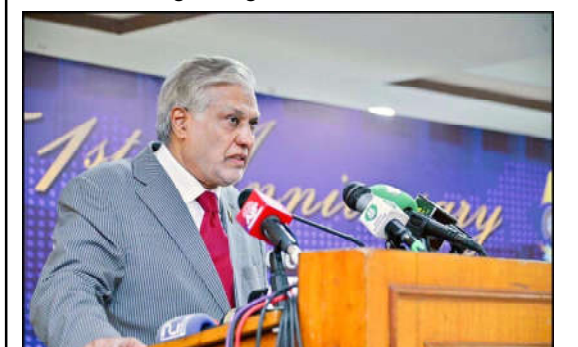
ISLAMABAD: Deputy Prime Minister and Foreign Minister Senator Ishaq Dar delivers remarks at 51st Anniversary of Institute of Strategic Studies.

ISLAMABAD (APP): Deputy Prime Minister and Foreign Minister Ishaq Dar on Monday emphasized Pakistan's commitment to maintaining peaceful, cooperative and good neighborly relations, with all countries despite facing challenges and setbacks in certain instances. Speaking at the Institute of Strategic Studies Islamabad's (ISSI) 51st Foundation Day, he highlighted the importance of dialogue, the avoidance of bloc politics, and adherence to the UN Charter. Dar stressed Pakistan's focus on economic development and regional peace, particularly with Afghanistan and India, advocating for stability in South Asia. He also underscored Pakistan's strong strategic partnership with China, its desire for deeper ties with neighboring and major powers, and its commitment to multilateralism. The overarching goal was to enhance regional connectivity and economic security through a pivot to geo-economics, he added. Dar stated that despite challenges, Pakistan remained steadfast. He stressed the importance of communication, dialogue, and negotiations to mitigate risks, advocating for a collaborative approach that respected all nations' interests and aspirations. The DPM reiterated Pakistan's opposition to bloc politics, endorsing cooperation over confrontation and commitment to the UN Charter and international law.