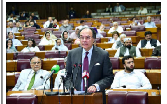
ISLAMABAD: Minister for Finance and Revenue Senator Muhammad Aurangzeb addressing to members of the National Assembly of Pakistan.