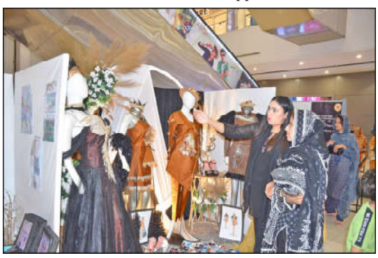
FAISALABAD: Students of GC University Faisalabad Fashion Designing are exhibiting their designed dresses.