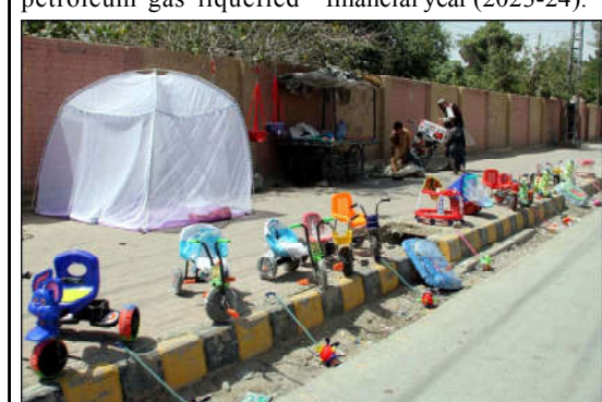
QUETTA: Vendor sells toys to earn his livelihood for support his family, at a roadside stall located on Zarghoon road in Quetta.

Cargo volume of 161,353 tonnes, comprising 128,100 tonnes imports cargo.