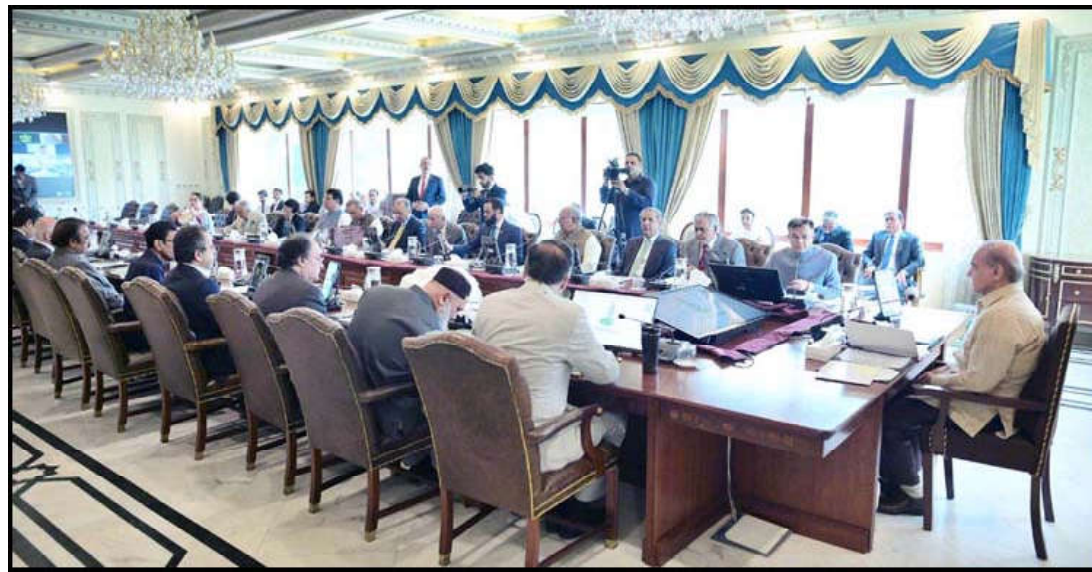
ISLAMABAD: Prime Minister Muhammad Shehbaz Sharif chairs Federal Cabinet Meeting.