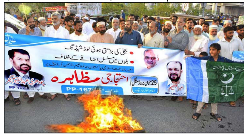
LAHORE: Activists of Jamat-e-Islami (JI) are holding protest demonstration against prolong electricity load shedding and high inflated electricity bills, at Thokar Niaz Baig Chowk in Lahore.

The Japanese Yen remained unchanged and closed at Rs 1.74, whereas an increase of 92 paise was witnessed in the exchange rate of the British Pound, which traded at Rs 353.51 as compared to the last day's closing of Rs 352.59.