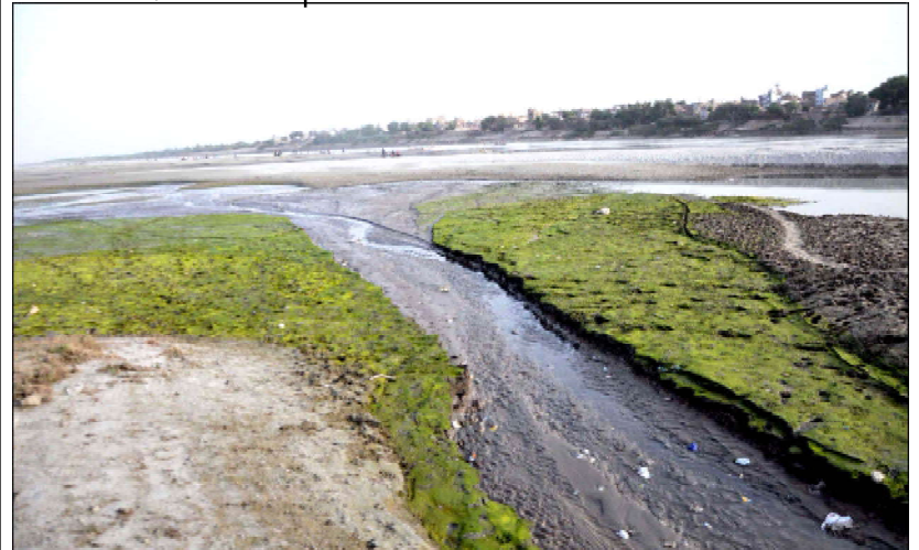
HYDERABAD: View of dried part of Indus River as the water level decrease due to acute water shortage which indicating for high risks of shortage of water in future, at Kotri

The bodies and injured were shifted to hospital and police after registering a case against culprits started raids for their arrest.