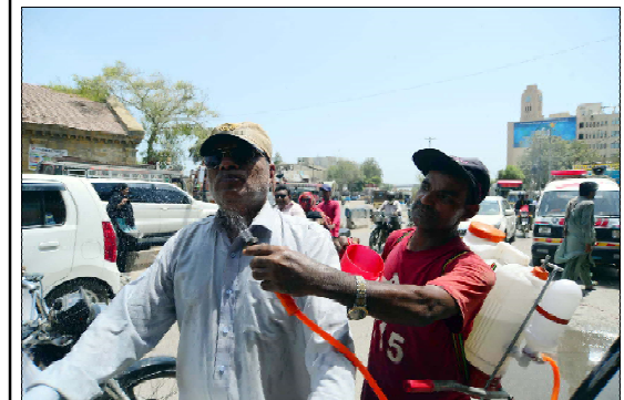
KARACHI: Volunteers of Edhi Foundation watering commuters to beat the heat of scorching sun during hot day of summer season at the Metropolitan area. Karachi is experiencing scorching weather, which will continue to rise in hot weather with a prediction of a maximum temperature of 41 degrees Celsius, according to the Pakistan Meteorological

Both sides expressed satisfaction with the existing bilateral relations and reiterated their commitment to further strengthening cooperation in various fields, especially agriculture and education for the mutual benefit of both nations.