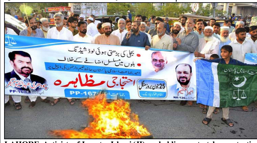
LAHORE: Activists of Jamat-e-Islami (JI) are holding protest demonstration against prolong electricity load shedding and high inflated electricity bills, at Thokar Niaz Baig Chowk in Lahore.

Countries should "work closely together, reject bloc confrontation, oppose decoupling and disconnection, maintain the stability and smoothness of industrial and supply chains, and promote trade and investment liberalization and facilitation," Li said in a speech to the conference.