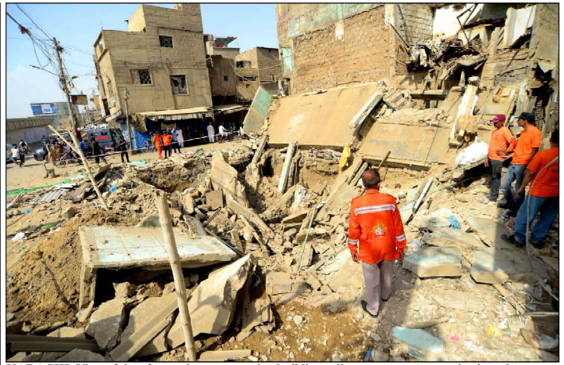
KARACHI: View of site after under-construction building collapse as rescue operation is underway, at Liaquatabad No.10 in Karachi

The deputy prime minister said that since the Taliban takeover in August 2021, Pakistan had cooperated with Afghanistan to avert a humanitarian crisis and support the Afghan people.