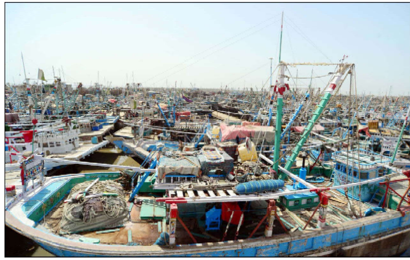
KARACHI: A large number of boats seen moored at Fishery area due to rough sea condition, at Fishery Harbour in Karachi. The Met Office has forecast likely rainfall with thunderstorm in Karachi and other districts of Sindh