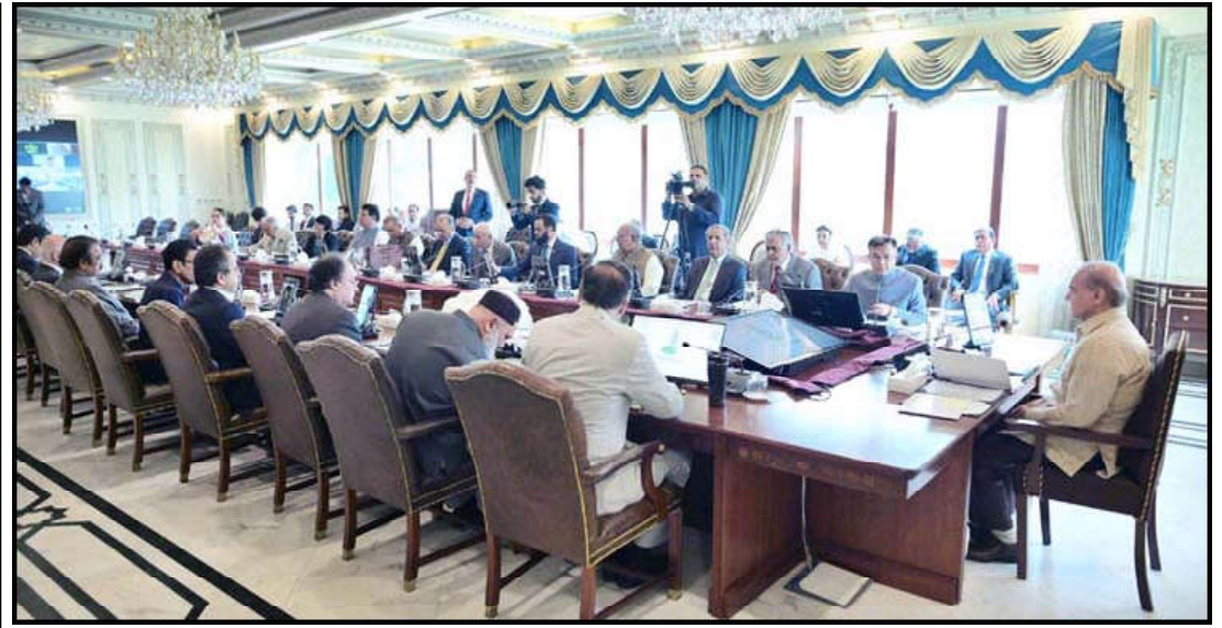
ISLAMABAD: Prime Minister Muhammad Shehbaz Sharif chairs Federal Cabinet Meeting.

Discussing the annual budget 2024-25, Prime Minister Shehbaz Sharif instructed the cabinet members to ensure their presence in the ongoing budget debate in the Parliament.