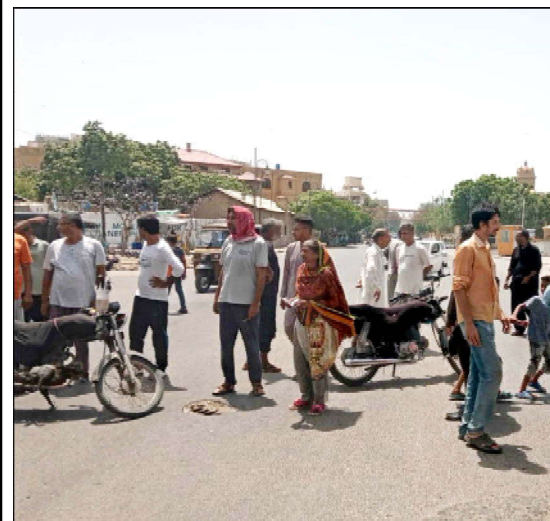
KARACHI: Residents of LI Chundrigar are blocked road as they are holding protest demonstration against prolong electricity load shedding in their area, near Law College

by all the deputy commissioners and the senior officers of Sindh building control authority. The officers of the building control authority briefed the commissioner about the progress of the efforts the authority is making. It was told that the Building Control Authority has completed a survey of dilapidated conditioned buildings and served notices to their residents advising them to vacate the buildings.