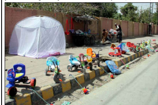
QUETTA: Vendor sells toys to earn his livelihood for support his family, at a roadside stall located on Zarghoon road in Quetta.

Cargo volume of 161,353 tonnes, comprising 128,100 tonnes imports cargo.