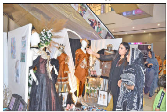
FAISALABAD: Students of GC University Faisalabad Fashion Designing are exhibiting their designed dresses.

"We cannot slow down our pace in green transition in exchange for short-term economic growth nor practice protectionism in the name of green development or environmental protection," he said. China is facing pushback over its electric vehicle exports, which some governments fear will flood markets and hurt domestic producers. The European Union and Canada among others are mulling surtaxes on Chinese EVs. China and the E.U. said over the weekend they are open to talks over the tentative tariffs after Beijing last week announced an anti-dumping probe into European pork, largely seen as retaliation for the EV duties. Polish President Andrzej Duda and Vietnamese Prime Minister Pham Minh Chinh joined the business leaders.