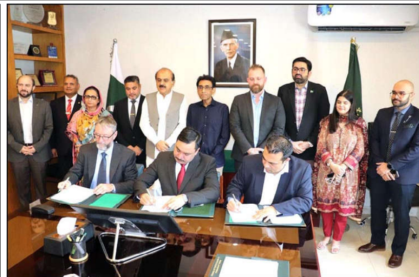
ISLAMABAD: In a major breakthrough, NRTC Pakistan, Allied Australian, and Tech Valley Pakistan signed a letter of understanding (LoU) at the Ministry of Federal Education, paving the way for a groundbreaking joint venture to establish a state-of-the-art Chromebook assembly line in Pakistan.

In the Annual Development Programme, the minister said, priority had been given to the communication and works department with an allocation of Rs. 14.9 billion followed by education department Rs. 4.8 billion and health department Rs. 3 billion, local government schemes Rs. 3.7 billion, and physical planning and housing schemes Rs. 2.46 billion.