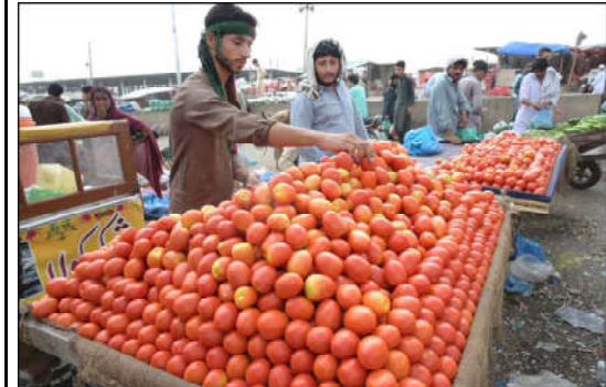
ISLAMABAD: A vendor arranging and displaying tomatoes on handcart to attract the customers at Fruit & Vegetable Market in Federal Capital.