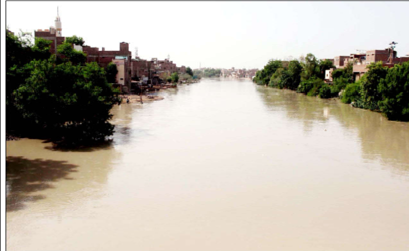
HYDERABAD: View of water level increasing in the Phuleli Canal while many nearby residents evacuate from their homes due to increased water level and over flowing canal water

The bodies were shifted to different hospitals and police after registering separate cases in all incidents at respective police stations started investigations.