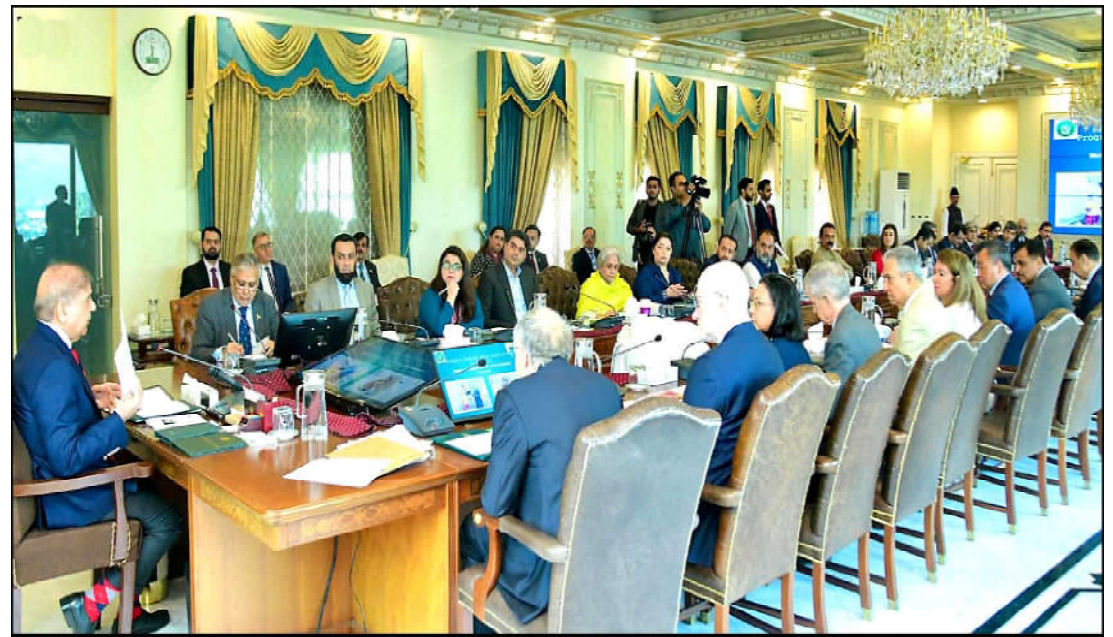
ISLAMABAD: Prime Minister Muhammad Shehbaz Sharif chairs meeting of National Task Force on Polio Eradication..

Bill Gates thanked the prime minister for his continued dedication and personal interest in eradicating wild polio from the country.