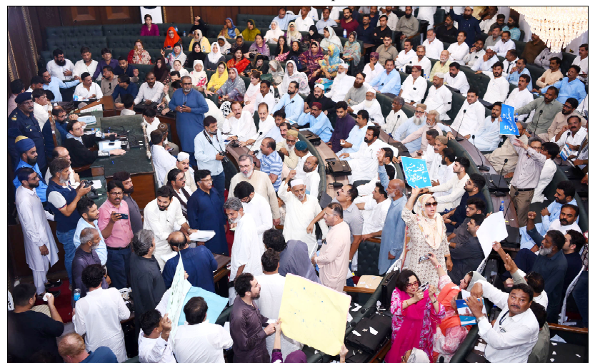
KARACHI: Opposition members of district government are holding protest demonstration against Districts Councils Budget 2024-25 during district assembly annual budget session presided by Mayor Barrister Murtaza Wahab, held at Old KMC building

The Governor Sindh also admired hill station of Murree and heaven like valleys of Gilgit-Baltistan which are a matter of immense attraction for tourists all around the world.