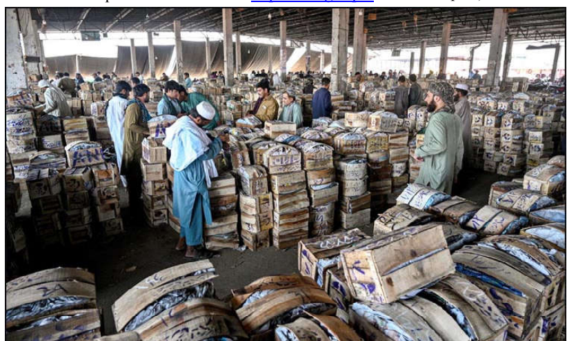
ISLAMABAD: Vendors busy in checking the mangoes filled in wooden boxes before buying at Islamabad Fruit and Vegetable Market.

ISLAMABAD (APP): Overseas Employment Corporation (OEC) attached department of Ministry of Overseas Pakistanis and Human Resource Development would export the nurses staff to Saudi Arabia and all staff would be selected through the walk-in-interviews from the different dates and station including 27 th & 28 th June, 2024 Lahore Shalimar Tower Hotel Jail Road, Lahore. 2 nd & 3 rd July, 2024 Pearl Continental (PC) Hotel Rawalpindi. An official source told APP here on Monday, he said that ICU Nurse with diploma in general nursing or bachelor of science in nursing/ Post RN, at least 02-Years of experience in respective Categories. CCU Nurse, NICU Nurse, ER Nurse, PICU Nurse, MICU Nurse, Oncology ICU Nurse, Neuro ICU Nurse, Surgical ICU Nurse and LDR Nurse. He said that the following details of facilities which will be entitled to the employee are as follows accommodation and transport will be provided by the company, over time as per Saudi Labor Law, free return ticket after one year, 21 days paid holidays every year. The Candidates must bring their original Diplomas, CNIC, updated CV+ 02 Passport Size Picture. Interested applicants can apply via OEC's website https://oec.gov.pk/