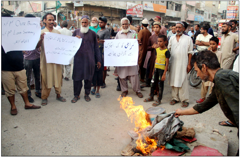
KARACHI: Residents of Jahangirabad protesting against the shortage of water and load shedding of electricity at Chandni Chowk in Paposh Nagar by burning wood

The newly appointed chairpersons extended their appreciation to all participants and affirmed their commitment to ensuring the effective functioning of their respective committees with the full support of its members.