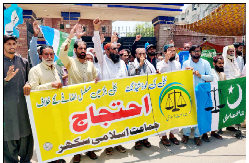
SUKKUR: Activists of Jamat-e-Islami (JI) are holding protest demonstration against prolong electricity load shedding and high inflated electricity bills, at Sukkur press club