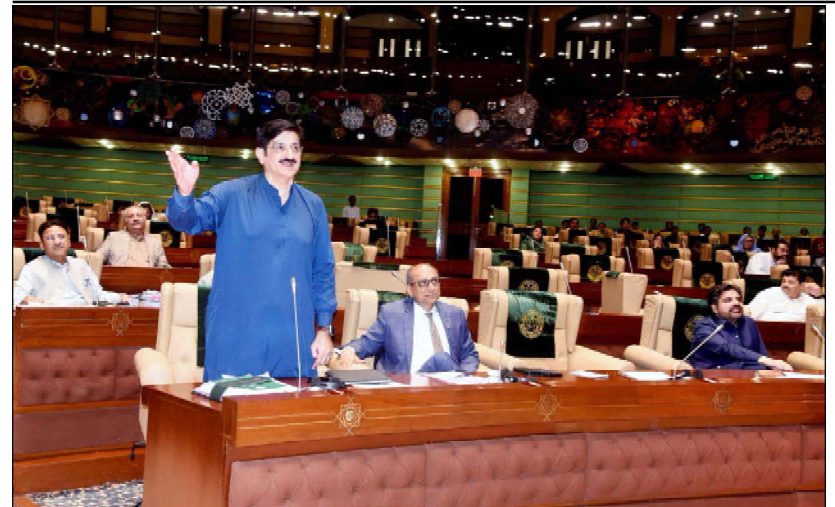
KARACHI: Sindh Chief Minister, Syed Murad Ali Shah addresses during provincial assembly session on Budget 2024-25, held at Sindh Assembly building