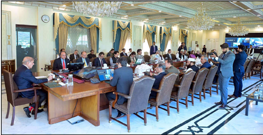
ISLAMABAD: A delegation of leading exporters of Pakistan calls on Prime Minister Muhammad Shehbaz Sharif.