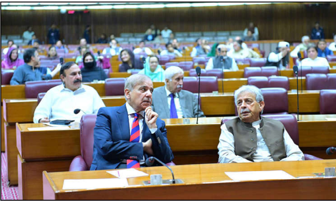
ISLAMABAD: Prime Minister Muhammad Shehbaz Sharif attends a session of National Assembly.