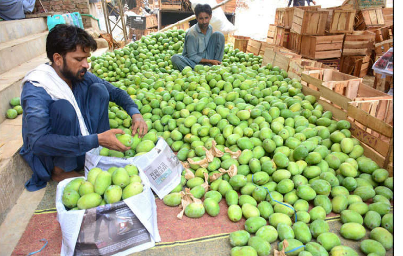
HYDERABAD: Labourers busy in packing mangoes in wooden boxes at fruits market.