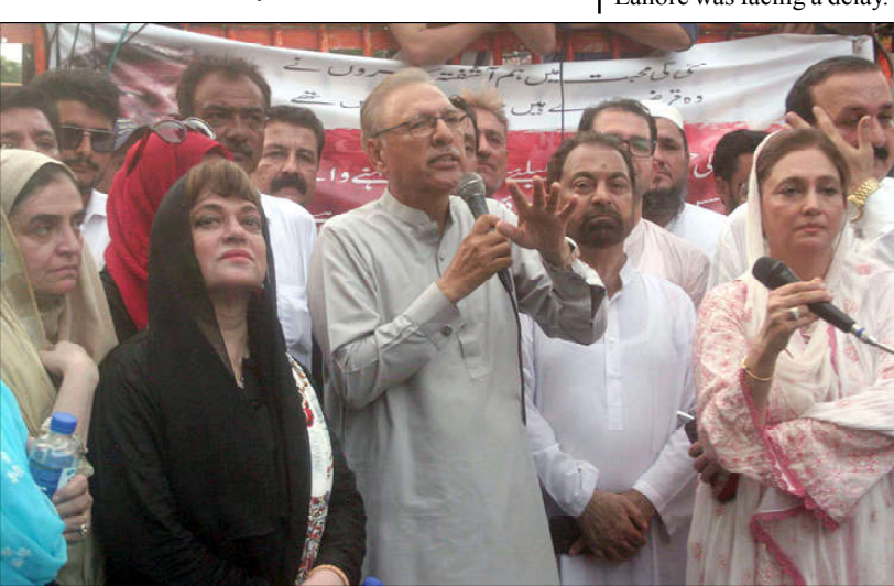
KARACHI: Former President Dr Arif Alvi addressing during PTI protest outside press club in the Provincial Capital.

KARACHI (INP): Rain with thunderstorm in parts of Sindh on Friday brought the mercury down and provided much-needed relief to the masses from hot weather. As per details, Larkana, Shikarpur, Jacobabad and adjoining areas also received showers. Separately, the weather became pleasant in Lahore due to dusty winds, significantly lowering the temperature on Thursday. The temperature in Lahore was forecasted between a minimum of 28 degrees and a maximum of 38 degrees. Residents of Lahore anticipated cooler conditions and possible thunderstorms, offering a respite from the typically high summer temperatures. The strong winds and potential rain provided much-needed relief from the heat.