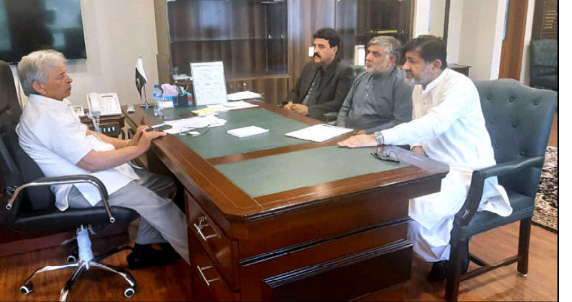
ISLAMABAD: The delegation of All Pakistan Fertilizer Dealers Association (APFDA) calls on the Federal Minister for Industries and Production Rana Tanveer Hussain

witnessed an increase of 23.78 per cent. The weekly SPI with the base year 2015-16=100 covers 17 urban centres and 51 essential items for all expenditure groups. The SPI for the lowest consumption group of up to Rs 17,732, increased by 1.58 per cent and went up to 309.10 points from the last week's 304.28 points. The SPI for consumption groups of Rs 17,732-22,888, Rs 22,889-29,517, Rs 29,518-44,175 and above Rs 44,175, increased by 1.44 percent, 1.20 percent, 1.11 and 0.69 percent respectively.