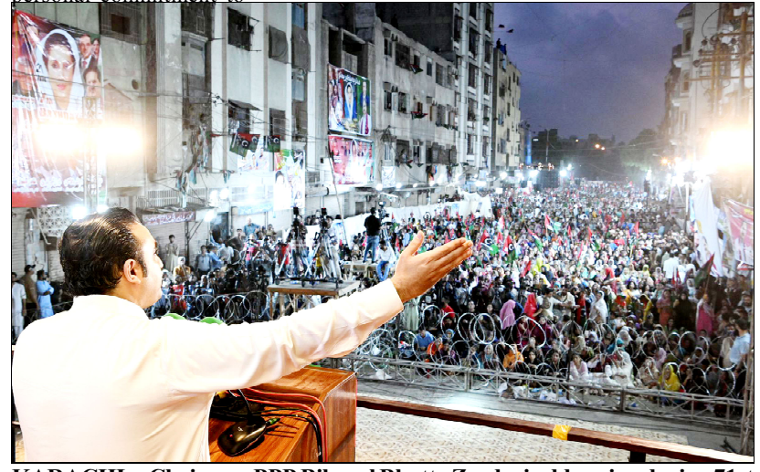
KARACHI: Chairman PPP Bilawal Bhutto Zardari addressing during 71st birth anniversary ceremony of Shaheed Mohtarma Benazir Bhutto at Lyari

The prime minister hosted a banquet in honour of Liu Jianchao and the accompanying Chinese delegation which was also at