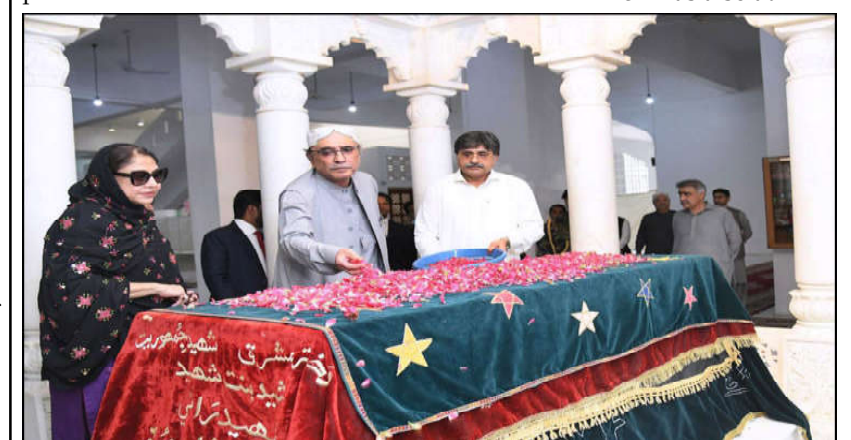
LARKANA: President Asif Ali Zardari showering petals over the grave of Shaheed Mohtarma Benazir Bhutto on her 71st birth anniversary, in Garhi Khuda Bakhsh Bhutto.

President Asif Ali Zardari strongly condemned the attack and lauded the martyrs.