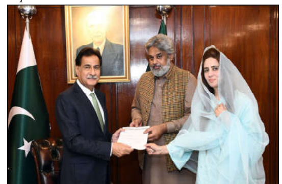
ISLAMABAD: Sahibzada Hamid Raza along with delegation of Sunni Ittehad Council called on speaker NA Sardar Ayaz Sadiq at Parliament House, SIC presented the name of Zartaj Gul for the newly Parliamentary Leader of National Assembly.

During the informal chatting foreign diplomats also recognized Governor's effort of gifting two camels to a poor man of interior Sindh who's camel leg was cut by a culprit.