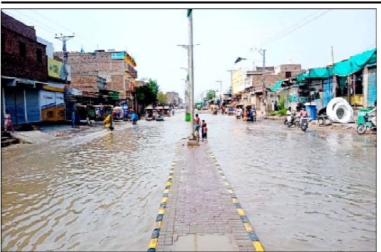
LARKANA: View of stagnant rainwater after heavy downpour due to poor sewerage system, creating problems and difficulties in transportation for commuters and residents, showing negligence of concerned authorities.

repaired so that the drainage process can start immediately after the rains. In the event of immediate rain, water drainage through storm-water drains will be possible. We are making every effort to minimize the inconvenience to the public during the rainy days. The Mayor Karachi said that cleaning the drains is a continuous process, being carried out systematically, yielding positive results. The current city administration has been present on the streets during the previous rains and will continue to fulfill its responsibilities effectively in the future as well, he said.