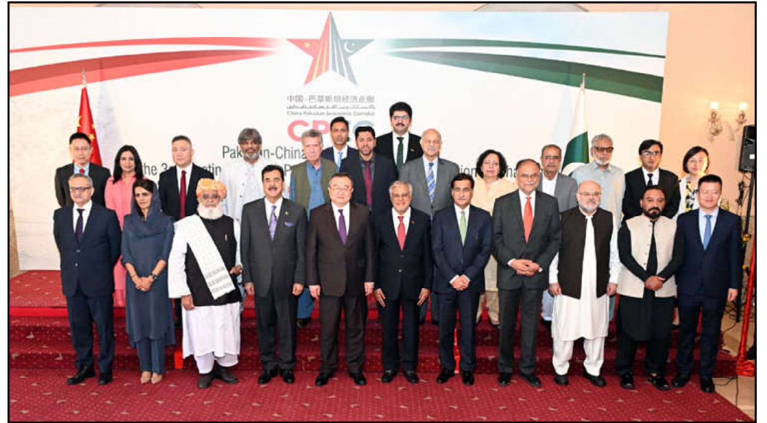
ISLAMABAD: Speaker National Assembly Sardar Ayaz Sadiq in a group photo with participant's of 3rd Pakistan-China joint consultative meeting of political parties on CPEC, in the Federal Capital.

He revealed that PPP representatives are in Islamabad negotiating with the government to resolve issues and work towards passing the budget, expressing trust in Prime Minister Shehbaz Sharif's intentions to honor promises made to PPP.