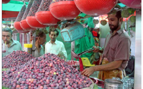
KARACHI: A vendor is preparing Falsa juice for customers at his roadside setup, in the Provincial Capital.

percent. For the 28-day tenor an amount of Rs486.85 billion was offered through 11 quotes at the rate of return ranging between 20.55% to 20.59%. The SBP accepted all the 20 bids for 7-day tenor at 20.56% and 11 bids for 28-tenor at 20.55% annual rate of return. Meanwhile, the central bank also injected Rs130 billion in the market through Shariah Compliant Mudarabah based Open Market Operation for 7-day and 28-day tenors. The SBP received one quote amounting to Rs130 billion (face value of collateral) at 20.58% rate of return while no bid was received for 28-day tenor.