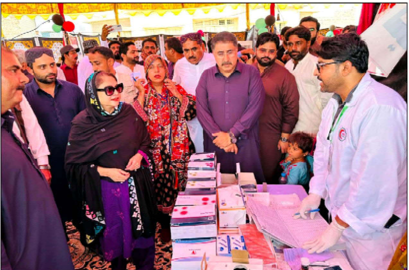
RAJODERO: Peoples Party (PPP) Women Wing President and MPA, Faryal Talpur being briefed by officials during her visit to the free medical camp organized by Shaheed Zulfiqar Ali Bhutto Institute of Science and Technology University (SZABIST) Foundation, held at village Chhawan of Ratodero.