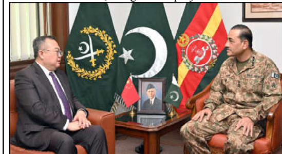
RAWALPINDI: Minister of the International Department of the Communist Party of China (IDCPC) Liu Jianchao, met with Chief of Army Staff (COAS) General Syed Asim Munir, at General Headquarters.

He emphasized the significance of the longstanding brotherly relations between the two nations and expressed satisfaction with the progress achieved on CPEC, reiterating China's commitment to its timely completion. The visiting dignitary also commended Pakistan's efforts in maintaining regional peace and stability, acknowledging the support of the Pakistan Armed Forces in providing security to Chinese nationals and projects in Pakistan.