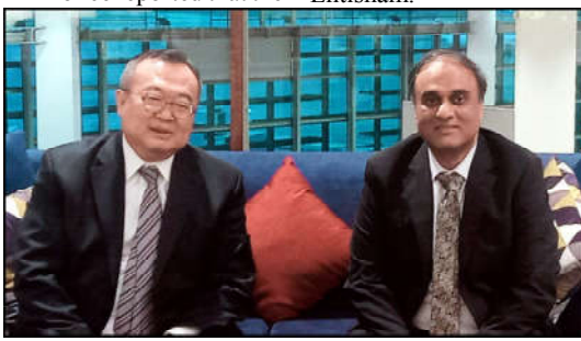
ISLAMABAD: Minister of the International Department of the Central Committee of the Communist Party of China (IDCPC), Liu Jianchao received at the Islamabad International Airport by Additional Foreign Secretary.