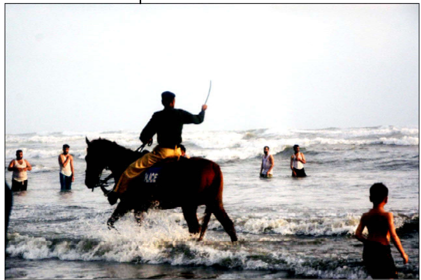
KARACHI: Police staffs patrolling on horses and disperse the people visit Sea View Beach as ban has been imposed on bath into sea due to rough condition of sea, at Clifton area

According to the reports submitted by the deputy commissioners to the Commissioner Karachi 26 individuals were arrested in District South, 44 in District East, 7 in District West, 14 in District Malir, 57 in District Korangi, 40 in District Central and 5 were nabbed in district Keamari.