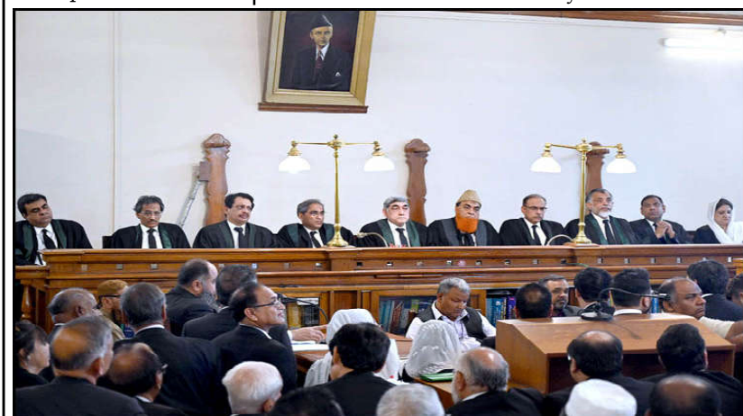
KARACHI: A view of Full Court Reference on the eve of elevation of Hon'ble Chief Justice Sindh High Court Mr. Justice Aqeel Ahmed Abbasi to the Supreme Court of Pakistan at the Committee Court room No. 1 High Court.