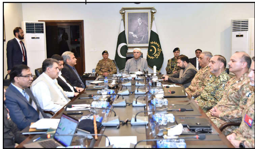
GWADAR: President Asif Ali Zardari chairing a meeting on the security and law and order situation of Balochistan.