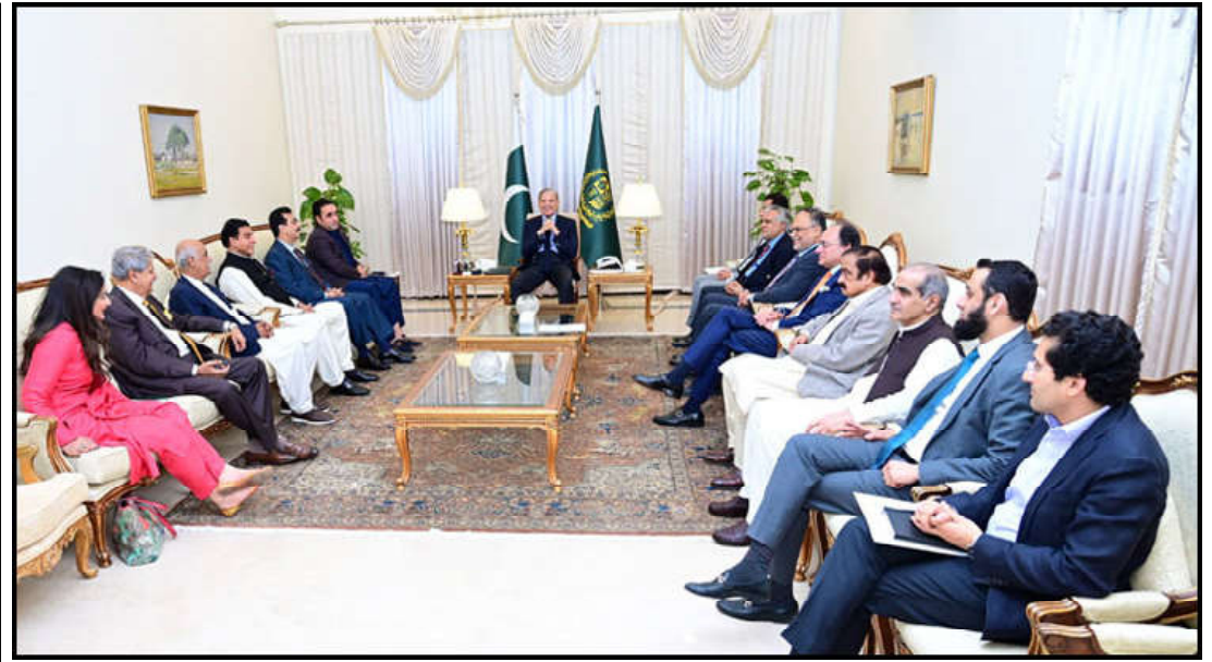
ISLAMABAD: A delegation of Pakistan People's Party headed by Chairman Bilawal Bhutto Zardari meeting with Prime Minister Shehbaz Sharif

Speaker National Assembly Sardar Ayaz Sadiq, Deputy Prime Minister and Minister for Foreign Affairs Ishaq Dar, Federal Minister for Planning Ahsan Iqbal, Federal Minister for Finance and Revenue Muhammad Aurangzeb, Federal Minister for Information and Broadcasting Attaullah Tarar were also present in the meeting.