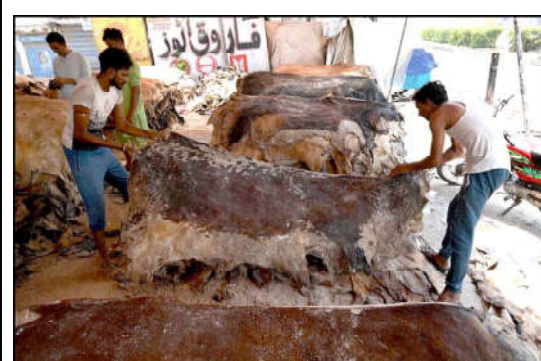
PESHAWAR: Workers preserving the hides of sacrificial animals at their warehouse at Ring road.

Five ships at Outer Anchorage of Port Qasim, out of them three ships, Khairpur, OM Shanghai and Maersk Chicago & another ship 'Navios Constellation' carrying Gasoline, Chemicals and Container are expected to take berths at respectively FOICO, EVTL and QICT on Thursday.