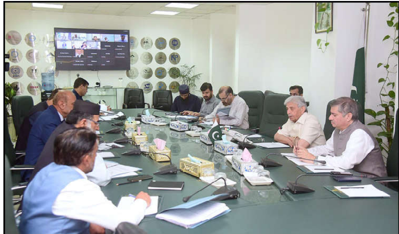
ISLAMABAD: Federal Minister for Industries and Production Rana Tanveer Hussain presides over a meeting of the Fertilizer Review Committee.