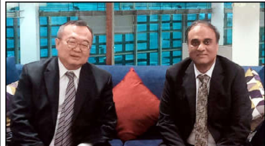
ISLAMABAD: Minister of the International Department of the Central Committee of the Communist Party of China (IDCPC), Liu Jianchao received at the Islamabad International Airport by Additional Foreign Secretary.

The search for the abductees has begun by the law enforcement agencies.