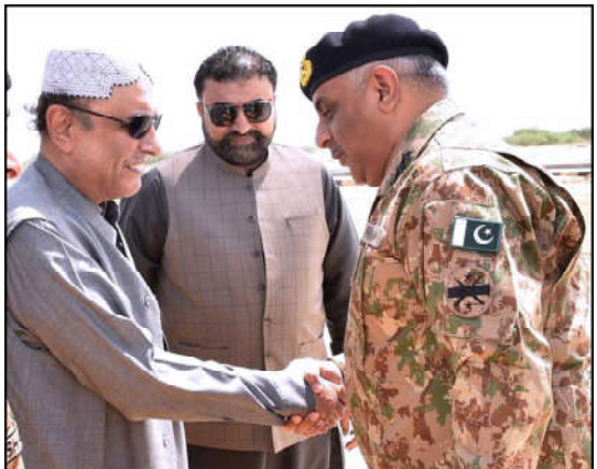
GWADAR: President Asif Ali Zardari being welcomed by Chief Minister Balochistan Mir Sarfraz Ahmed Bugti and Commander 12 Corps Lt General Rahat Naseem Ahmed Khan, upon his arrival.

What was reason for bringing ordinance? Was there any emergency. The ordinance came from where after the enactment of law by parliament. This is too interference in election. Election act was desire of parliament.