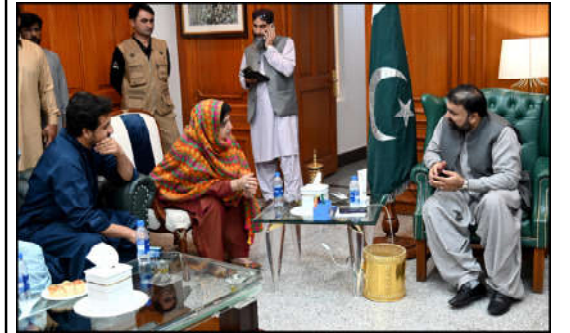
QUETTA: Provincial Ministers Raheela Hameed Khan Durrani and Mir Shoab Naushervani meeting with Chief Minister Balochistan Mir Sarfraz Ahmed Bugti.

Minister Liu Jianchao will call on Prime Minister Muhammad Shehbaz Sharif and hold extensive bilateral talks with Deputy Prime Minister and Foreign Minister Senator Mohammad Ishaq Dar.