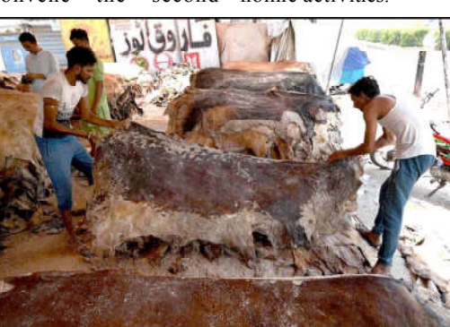
PESHAWAR: Workers preserving the hides of sacrificial animals at their warehouse at Ring road.

Five ships at Outer Anchorage of Port Qasim, out of them three ships, Khairpur, OM Shanghai and Maersk Chicago & another ship 'Navios Constellation' carrying Gasoline, Chemicals and Container are expected to take berths at respectively FOICO, EVTL and QICT on Thursday.