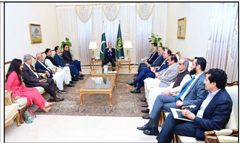
ISLAMABAD: A delegation of Pakistan People's Party headed by Chairman Bilawal Bhutto Zardari meeting with Prime Minister Shehbaz Sharif

Speaker National Assembly Sardar Ayaz Sadiq, Deputy Prime Minister and Minister for Foreign Affairs Ishaq Dar, Federal Minister for Planning Ahsan Iqbal, Federal Minister for Finance and Revenue Muhammad Aurangzeb, Federal Minister for Information and Broadcasting Attaullah Tarar were also present in the meeting.