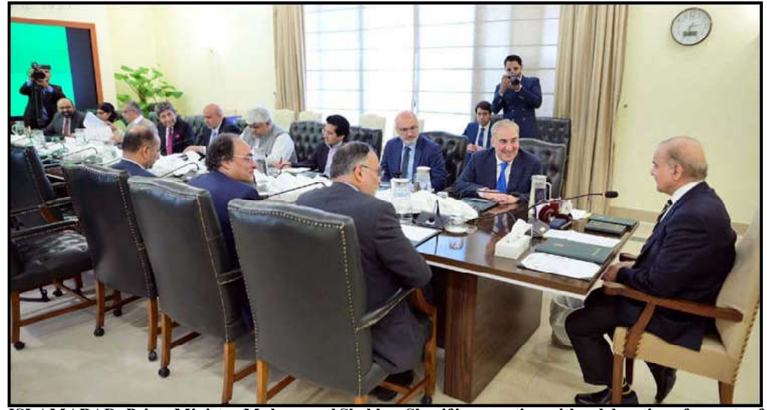
ISLAMABAD: Prime Minister, Muhammad Shehbaz Sharif in a meeting with a delegation of experts of Power Sector led by Nika Gilauri Former Georgian Prime Minister, in Islamabad.

The prime minister expressed his government's desire to promote alternative energy sources, particularly solar energy, and reduce reliance on expensive energy sources. He said the government would also promote public private partnership in the energy sector. The prime minister directed the federal ministers to consult with the delegation regarding the basic reforms of the country's energy sector and to evolve a comprehensive strategy regarding the reforms immediately. Minister for Planning and Development Ahsan Iqbal, Finance Minister Muhammad Aurangzeb, Petroleum Minister Musadik Malik, Power Minister Awais Ahmed Khan Leghari, Minister of State for Finance Ali Pervaiz Malik, and relevant high officials attended the meeting.