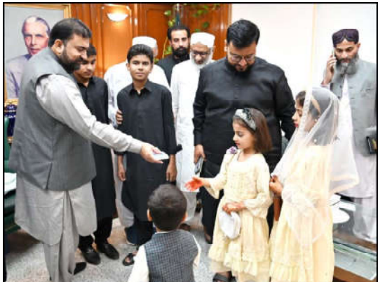
QUETTA: Chief Minister Balochistan Mir Sarfaraz Ahmed Bugti giving Eidi to children.

UNITED NATIONS (UNPoA) on Small Arms and Light Weapons (SALW). The 2001 UNPoA, which was backed by all member states, provides the framework for activities to counter the illicit trade in small arms and light weapons. Since then, the UN has worked to support the implementation of the UNPoA at national, regional, and international levels. "Terrorists and criminals do not manufacture these arms," the Pakistani envoy told delegates, pointing out they acquire them from illicit arms markets or receive them from entities that want to destabilize a particular region or country.