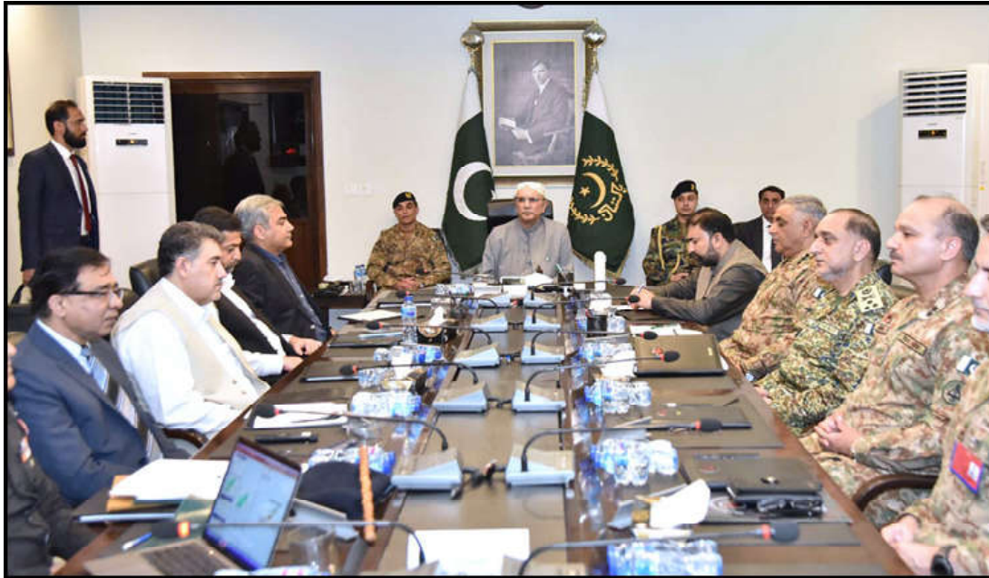
GWADAR: President Asif Ali Zardari chairing a meeting on the security and law and order situation of Balochistan.

Ph: 2841470/2841473 Vol: XIX No. 353, Zil Hajj 14, 1445 AH Friday June 21, 2024, Pages 04, Price Rs.15