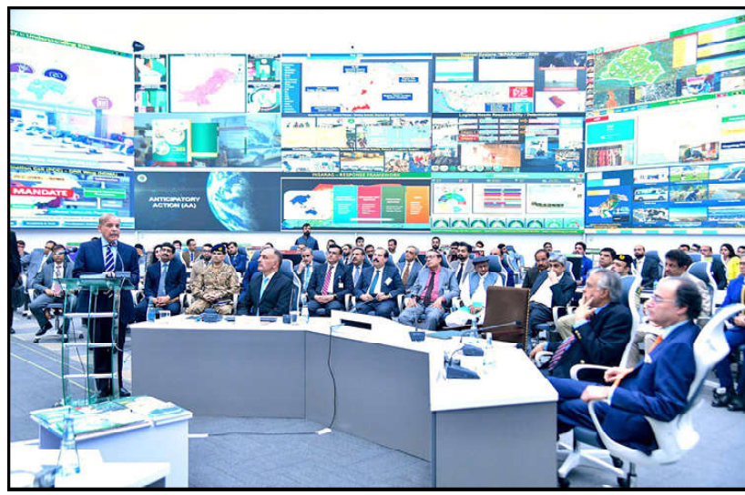
ISLAMABAD: Prime Minister Muhammad Shehbaz Sharif addresses the National Emergencies Operation Centre.

QUETTA (APP): Pakistan Peoples Party (PPP) always remained steadfast against the anti-democracy elements, he added. Raisani said it was Benazir Bhutto Shaheed who had become a symbol of Pakistan's identity internationally because of her prolonged fight against the dictators. She set a precedent by working for the country's solidarity, integrity and stability, he added. Raisani said that she was the first woman prime minister of an Islamic country and was revered as the "Daughter of Islam".