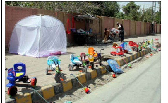
QUETTA: Vendor sells toys to earn his livelihood for support his family, at a roadside stall located on Zarghoon road in Quetta.