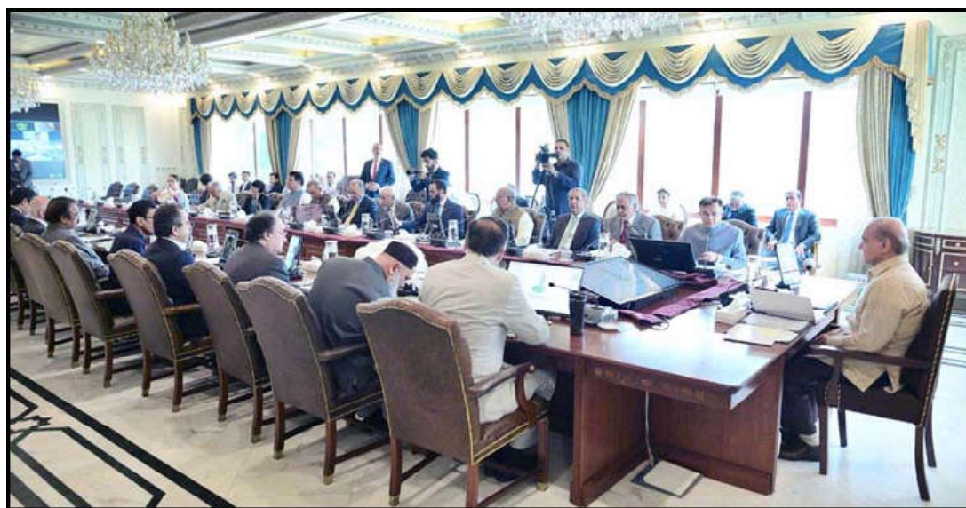
ISLAMABAD: Prime Minister Muhammad Shehbaz Sharif chairs Federal Cabinet Meeting.