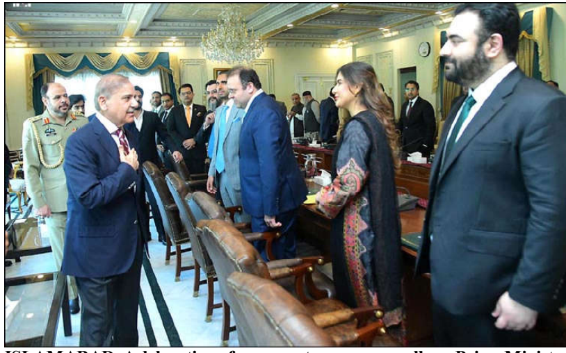
ISLAMABAD: A delegation of young entrepreneurs calls on Prime Minister Muhammad Shehbaz Sharif.

The prime minister said the promotion of bilateral business cooperation between Pakistan and China was their top priority, adding with the second phase of China Pakistan Economic Corridor, the industrial development would be accelerated.