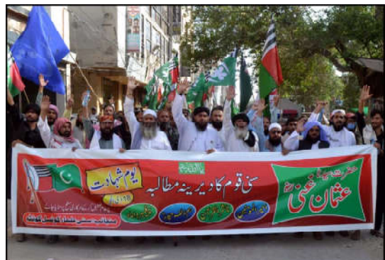
QUETTA: Members of Sunni Ulema Council chant slogan during rally on the martyrdom day of Hazrat Usman Ghani (RA), at Quetta press club.

Independent Report QUETTA: The supply of electricity was suspended to the Mach central jail located in Mach area of Bolan, on Tuesday. According to the Jail authorities, the power supply has been suspended to the Mach jail due to non-payment of electricity dues running in millions of rupees. The Jail authorities informed that there are dues of Quetta Electric Supply Company (QESCO) amounting to Rs. 30 million against the Mach jail. According to the Jail authorities, it was given assurance to pay the electricity utility dues to QESCO within 15 days. However, the electricity of Mach jail was cut by QESCO despite the assurance. It may be mentioned here that some 750 prisoners are imprisoned in central Jail Mach these days. They are included a total of 73 prisoners who are awaiting death sentence in the jail. Besides, more than 100 high profile prisoners are also undergoing imprisonment in the Mach jail, the sources informed adding that the security concerns were increased in the prison due to power disconnection.