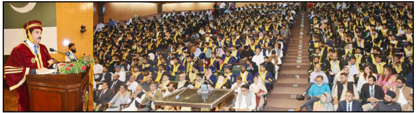
SWABI Khyber Pakhtunkhwa Governor Faisal Karim Kundi addressing 28 th Convocation of Ghulam Ishaq Khan Institute (GIK).