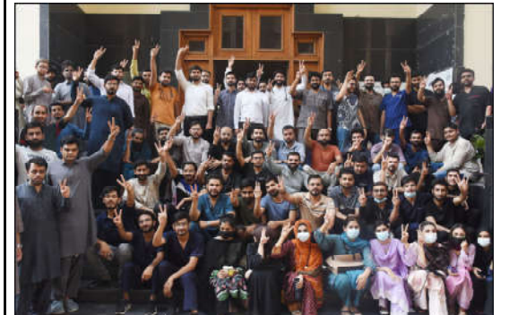
LAHORE: Young Doctors protest inside and outside the OPD, on the 10th day of the doctors strike at Services Hospital.

The IAHRA representative was also made aware of the deplorable conditions in which Kashmiri prisoners are held in various Indian jails.