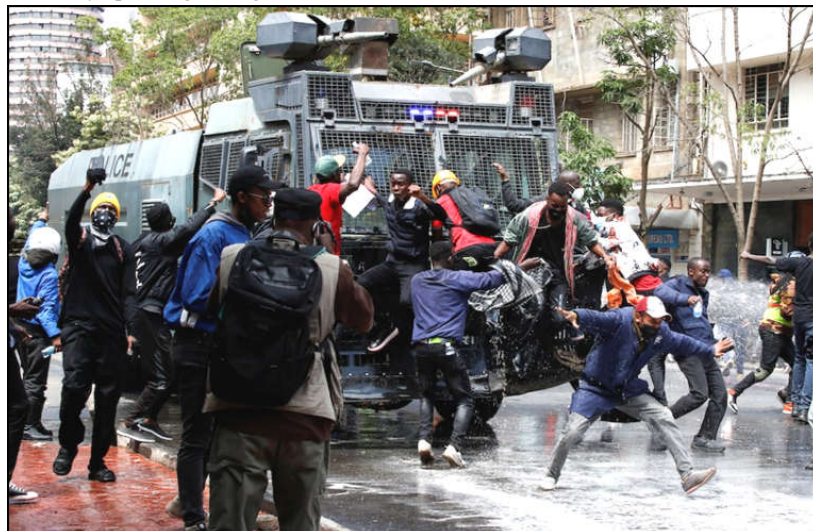
Demonstrators try to obstruct a police vehicle as police use water cannons to disperse protesters during a demonstration against Kenya's proposed finance bill 2024/2025 in Nairobi, Kenya.

In two televised debates focused on the economy ahead of the presidential polls, "almost all the candidates explained that the sanctions have had devastating effects".