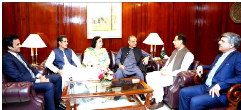
ISLAMABAD: Parliamentary Delegation of Istihkam-e-Pakistan Party (IPP) headed by Federal Minister for Privatization, Board of Investment and Communications Abdul Aleem Khan called on Speaker National Assembly Sardar Ayaz Sadiq.

But soon, Mahmudullah's indecisiveness and Rishad Hossain's adventurousness meant they slipped to 80 for 7 after 11 overs. Which is when the rainy clouds returned to continuously hover around the stadium, and constantly brought the DLS par scores into picture for the rest of the night.