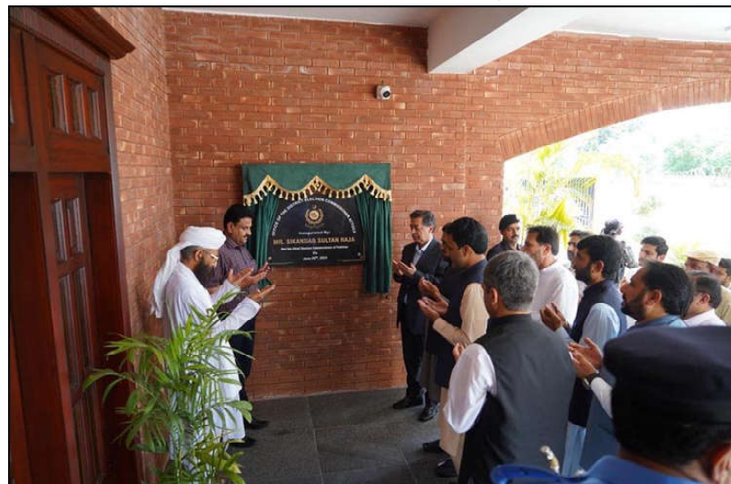
Honourable Chief Election Commissioner, Sikandar Sultan Raja inaugurated office of District Election Commission Attock

Moreover, in a gesture of humility and simplicity, the acting chief justice declined to receive protocol and guard of honor upon assuming his new role. After taking the oath of office, Justice Shujaat Ali Khan arrived at the LHC.