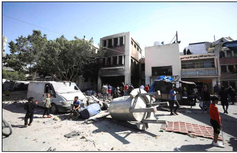
Palestinians inspect the damages at Abdulfattah Hamoud school where displaced people were taking refuge, following an Israeli strike, amid Israel-Hamas conflict, in Gaza City.

"We are committed to the Israeli proposal that President Biden welcomed. Our position has not changed. The second thing, which does not contradict the first, we will not end the war until we eliminate Hamas," Netanyahu said in a speech to parliament.