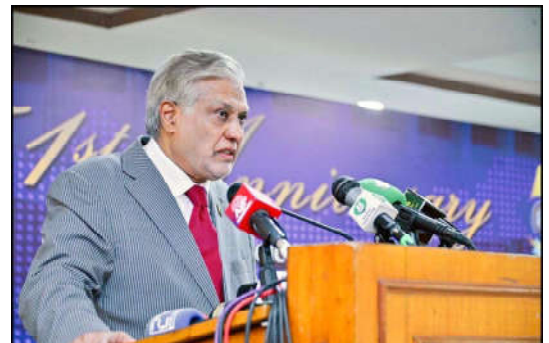
ISLAMABAD: Deputy Prime Minister and Foreign Minister Senator Ishaq Dar delivers remarks at 51st Anniversary of Institute of Strategic Studies.