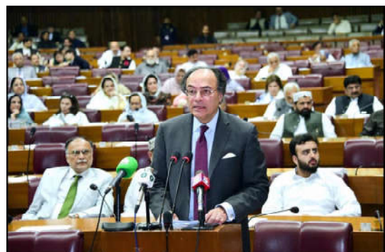
ISLAMABAD: Minister for Finance and Revenue Senator Muhammad Aurangzeb addressing to wind up the Federal Budget 2024-2025 in the National Assembly of Pakistan.