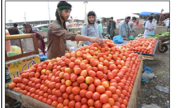
ISLAMABAD: A vendor arranging and displaying tomatoes on handcart to attract the customers at Fruit & Vegetable Market in Federal Capital.