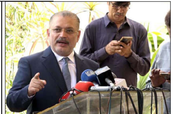
KARACHI: Sindh Minister for Information, Transport and Mass Transit, Excise Taxation and Narcotics Control, Sharjeel Inam Memon talking to media persons, at Sindh Assembly in Karachi.

RAWALPINDI (APP): The District Administration has imposed ban on all types of constructions in Murree. The notification issued by the Commissioner Rawalpindi office, here on Tuesday states that the ban will remain enforced till the completion of Murree master plan. According to the notification violations of government construction policy, illegal constructions causing serious disruption to the peaceful life of the local population, soil erosion and encroachments and illegal deforestation damaging the natural environment are the main reasons for putting the ban on constructions.