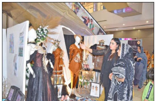
FAISALABAD: Students of GC University Faisalabad Fashion Designing are exhibiting their designed dresses.

Meanwhile, on a year-on-year basis, the petroleum group imports witnessed an increase of 12.09 percent during the month of May 2024 as compared to the same month of last year. The petroleum imports during May 2024 were recorded as $ 1,577.878 million against the imports of $ 1,407.698 million during May 2023. However, on a month-on-month basis, the petroleum imports into the country decreased by 5.90 percent during May 2024, as compared to the imports of $ 1,676.753 million in April 2024, according to the data. It is pertinent to mention here that the trade deficit contracted by 15.25 percent during the first 11 months of the current financial year (2023-24).