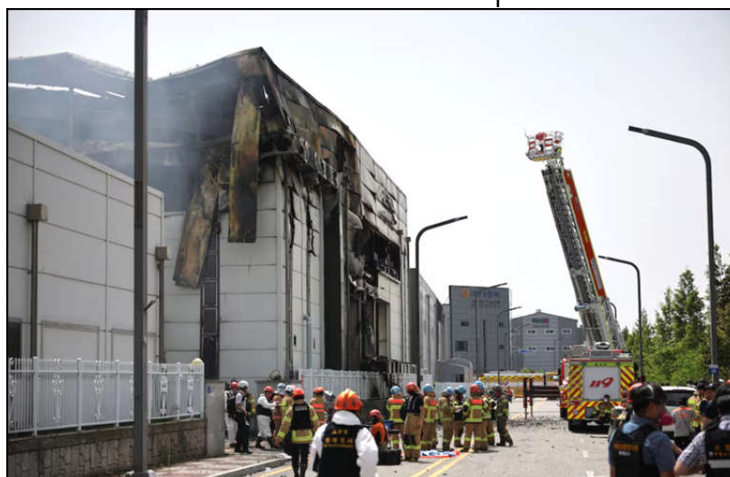
Emergency personnel work at the site of a deadly fire at a lithium battery factory owned by South Korean battery maker Aricell, in Hwaseong, South Korea.

It used a drill and robotic arm to scoop up samples, snapped some shots of the pockmarked surface and planted a Chinese flag made from basalt in the grey soil.