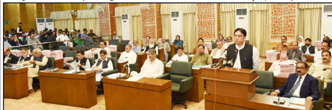
MUZAFFARABAD: Minister for Finance Abdul Majid Khan presenting the budget in the AJK Legislative Assembly.

"We cannot slow down our pace in green transition in exchange for short-term economic growth nor practice protectionism in the name of green development or environmental protection," he said. China is facing pushback over its electric vehicle exports, which some governments fear will flood markets and hurt domestic producers. The European Union and Canada among others are mulling surtaxes on Chinese EVs. China and the E.U. said over the weekend they are open to talks over the tentative tariffs after Beijing last week announced an anti-dumping probe into European pork, largely seen as retaliation for the EV duties. Polish President Andrzej Duda and Vietnamese Prime Minister Pham Minh Chinh joined the business leaders.