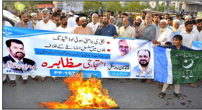
LAHORE: Activists of Jamat-e-Islami (JI) are holding protest demonstration against prolonged electricity load shedding and high inflated electricity bills, at Thokar Niaz Baig Chowk in Lahore.

ISLAMABAD (APP): The price of per tola of 24 karat gold decreased by Rs 500 and was sold at Rs 241,500 on Tuesday against its sale at Rs 242,000 on last trading day. The price of 10 grams of 24 karat gold also decreased by Rs 429 to Rs 207,047 from Rs 207,476 whereas that of 10 gram 22 karat gold went down to Rs 189,793 from Rs 190,186, the All Sindh Sarafa Jewellers Association reported. The price of per tola and ten gram silver remained constant at Rs 2,850.