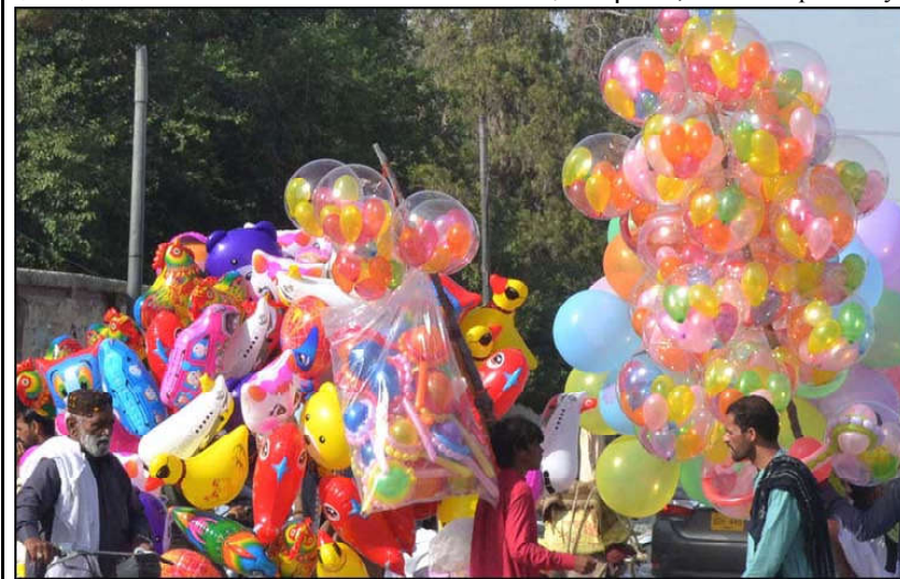
QUETTA: Vendor selling balloons while roaming in provincial capital street.