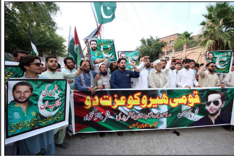
PESHAWAR: Residents of Peshawar are holding protest demonstration in favor of National Famous Cricketer Shahid Afridi, at Peshawar press club

Sindh Governor Muhammad Kamran Khan Tessori and provincial Minister for Auqaf and Religious Affairs Syed Riaz Hussain Shah Sherazi will formally inaugurate the three-day Urs by laying flowers wreath at the shrine of the sufi saint.