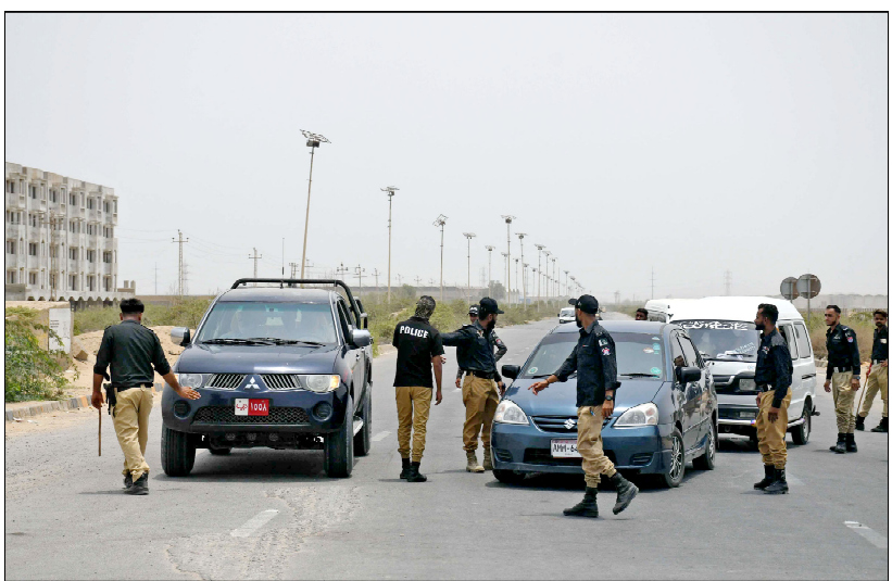
KARACHI: Tourists are being stopped by police at the Hawks Bay beach due to flooding in the sea