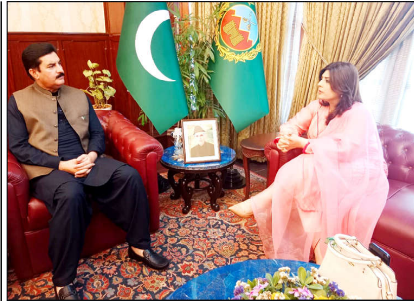
PESHAWAR: Convener of Women Empowerment and Personal Development of LCCI meeting with Khyber Pakhtunkhwa Governor Faisal Karim Kundi.

Mustafa Kamal said that the State-Owned Enterprises (SOEs) and independent power producers (IPPs) are currently a burden on the country's economy, and it needs to be resolved through a comprehensive strategy.