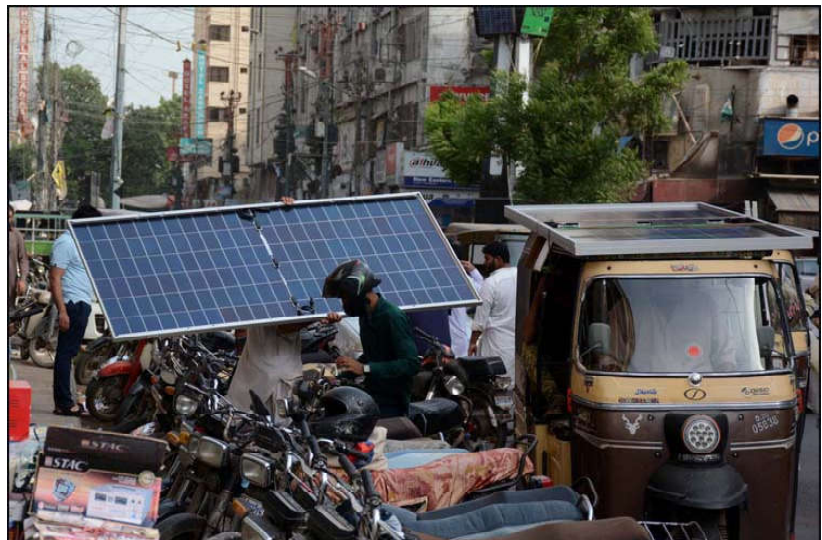
KARACHI: People busy in purchasing solar system for power generation as demand of solar system and UPS increased in city due to electricity load-shedding in city during summer season, at Saddar Electronic Market.

Further discussions revealed disagreements over the tax on raw materials for manufacturers. While manufacturers claimed exemptions were for raw materials, the committee noted these materials were being sold locally.