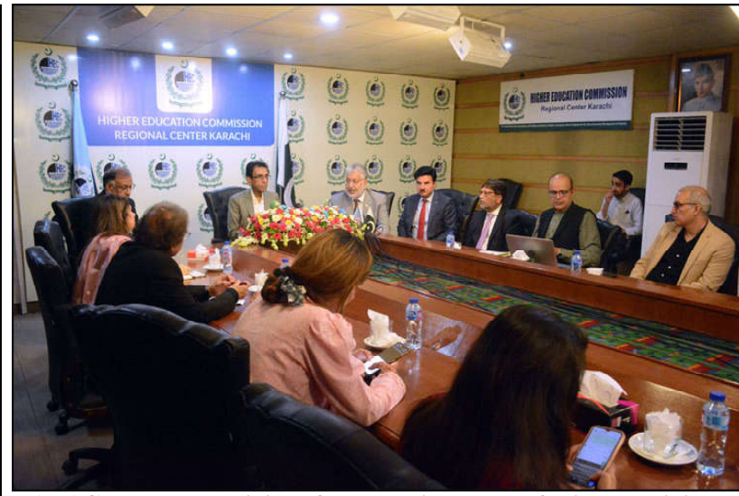
KARACHI: Federal Minister for Education and Professional Training Dr Khalid Maqbool Siddiqui chairs a meeting to discuss establishing campuses of educational institutions in Sindh at HEC Regional office.