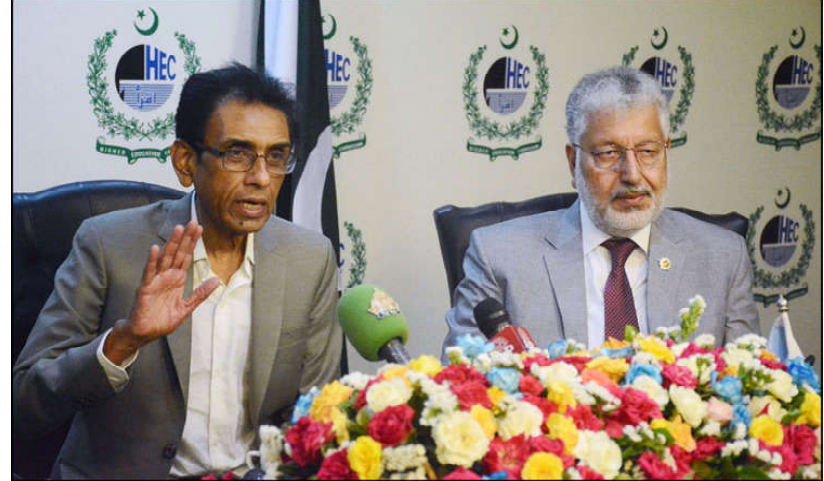
KARACHI: Federal Minister for Education and Professional Training Dr Khalid Maqbool Siddiqui talking to media persons after attending meeting to discuss establishing campuses of educational institutions in Sindh at HEC Regional office.