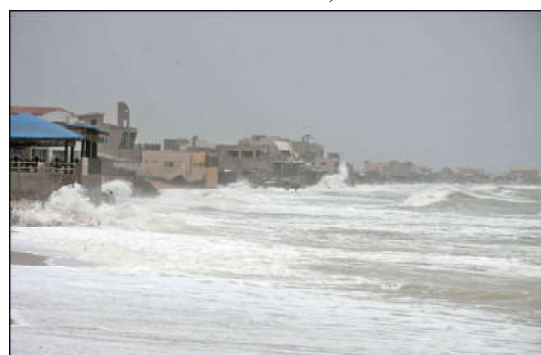
KARACHI: Waves crashing against the shore at Hawke's Bay during the coastal flooding in the Provincial Capital.

The minister directed all the CEOs to complete the pre-qualification process for private companies by June 28 and added that the local bodies and all waste management companies have made the impossible work possible by ensuring quality cleanliness on Eid-ul-Azha. "Due to this, people's trust in government institutions increased manifold. Now the same spirit has to be maintained in normal days also," he said.