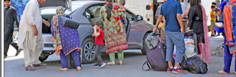
ISLAMABAD: After spending Eid Holidays citizens of twin cities reaching back to homes.