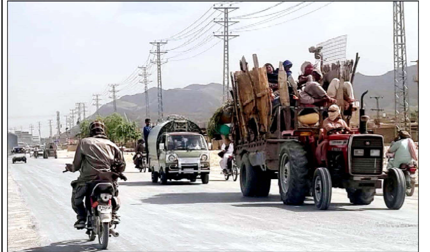
QUETTA: Nomads shift their luggage along with their family members dangerously travels on an overloaded vehicle which may cause any incident, passing through road towards their destination

ISLAMABAD (APP): Saudi Arabia's Ministry of Islamic Affairs, Dawah and Guidance, represented by the Secretary-General for Islamic Awareness in Hajj, Umrah and Visit, provided 1,485,000 religious services during this year's Hajj season. The General Secretariat also sent more than 80,000,000 educational and guidance text messages (SMS) through all telecommunications providers in the Kingdom to the mobile phones of pilgrims and service providers in various international languages. The messages included a step-by-step explanation of the Hajj rituals, adherence to the regulations and laws set by the Kingdom for the security and safety of pilgrims, and an outline of the stages of Hajj and the necessary religious information for the pilgrims in the daily rituals. To leverage modern technology and utilize it in educating pilgrims, the