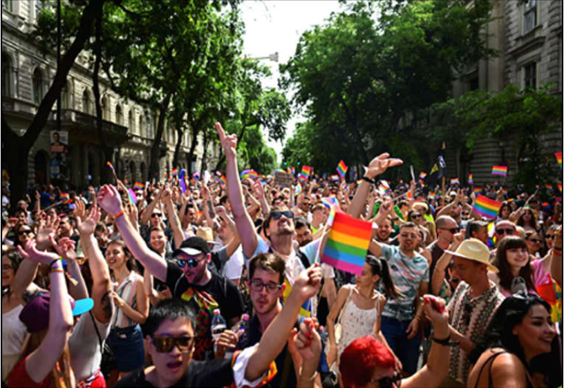
People attend the annual Pride march in Budapest, Hungary.

SHANGHAI: Six people have been found with no signs of life after going missing a week ago during landslides caused by heavy rainfall in China's southeastern province of Fujian, state television CCTV reported on Saturday. Rescue workers found them after extensive searches since losing contact with the victims on Sunday, CCTV said. Unusually heavy rains have hit southern China after an early start to the annual flooding season. The death toll reached 38 on Friday in Meizhou city in China's southern Guangdong province.