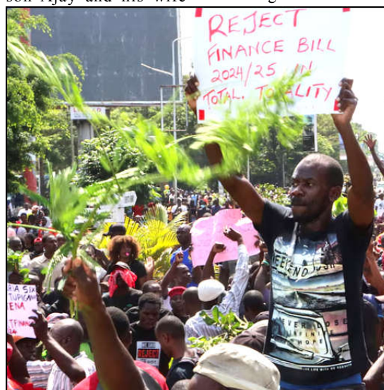
People fall as they run after police use water cannon to disperse protesters during a demonstration against Kenya's proposed finance bill 2024/2025 in Nairobi, Kenya.

Wildfire kills 11 in Turkiye's Kurdish region CINAR: A huge wildfire has killed 11 people and critically injured five, as it ripped through Turkiye's main region. Kurdish southeast overnight, the health minister stated on Friday. Hundreds of animals perished or were badly injured in the blaze, which roared across the dry landscape, sending flames into the night sky. By morning, the fire had left huge areas of charred and blackened land, across the Diyarbakir and Mardin provinces. "Eleven people lost their lives," Health Minister Fahrettin Koca wrote on X, adding that another 78 people sustained injuries and smoke inhalation. Of that number, five people were being treated in intensive care, he said. Turkiye's pro-Kurdish DEM party, which won many municipalities in the southeast in the March local elections, criticised the government's intervention as "late and insufficient".