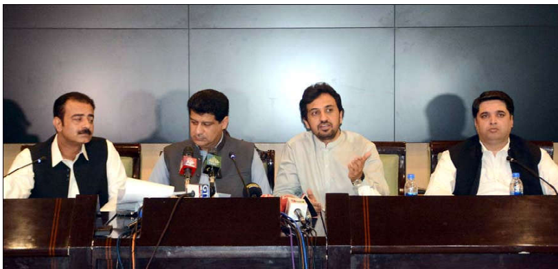
QUETTA: Provincial Finance Minister Mir Shoaib Nausherwani, Provincial Minister for P&D Mir Zahoor Ahmed Buledi, Spokesman of Government of Balochistan Shahid Rind and Provincial Secretary Finance Babar Khan addressing Post budget press conference