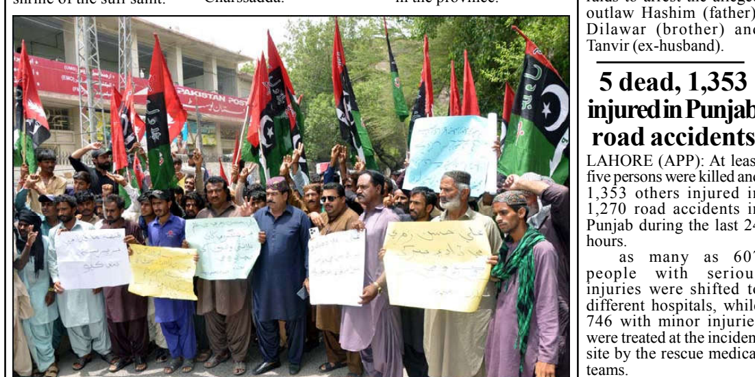
HYDERABAD: Activists of Peoples Party (PPP) are holding protest demonstration against high handedness of influent land mafia, at Hyderabad press club.