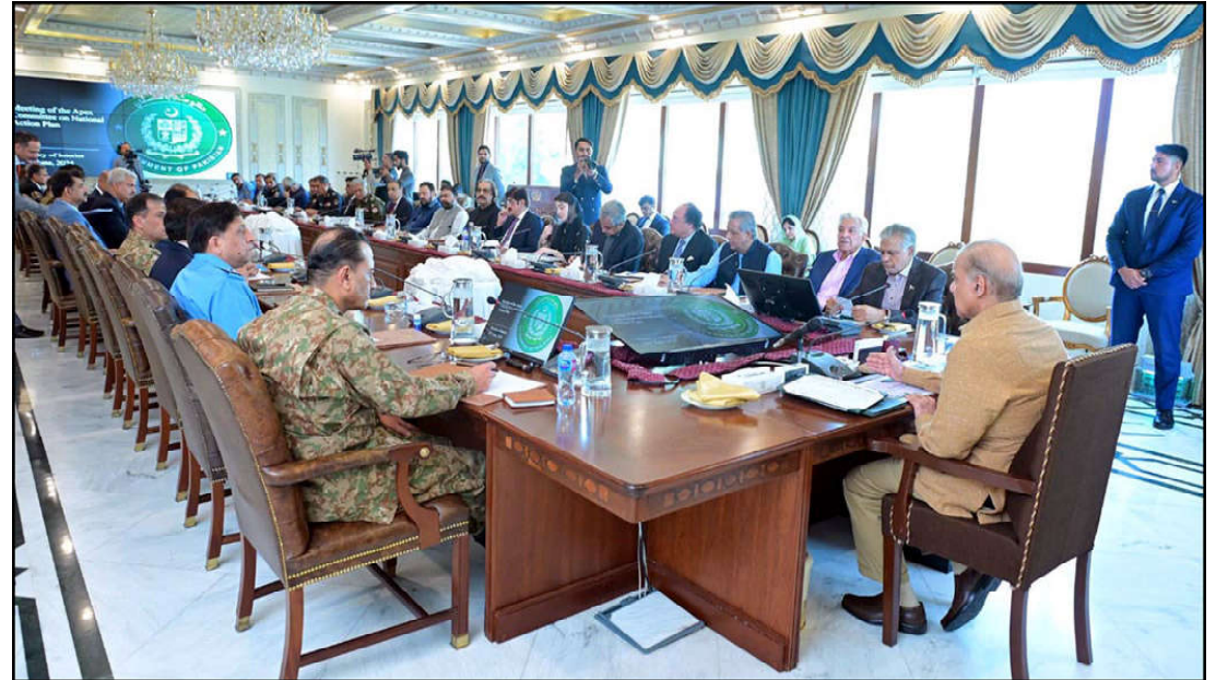
ISLAMABAD: Prime Minister Muhammad Shehbaz Sharif chairs a meeting of Central Apex Committee of National Action Plan.