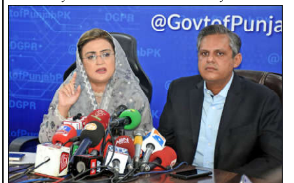
LAHORE: Provincial Minister of Information and Broadcasting Syeda Uzma Bukhari and Provincial Minister Transport, Bilal Akbar giving answers to the questions of the media during the press conference in DGPR of the provincial capital.

She said that the incident happened in Swat was heartrending. The provincial government should have played its due role to prevent occurrence of such incidents. During the press conference, Transport Minister Bilal Akbar Khan said that on the directions of Chief Minister Maryam Nawaz.