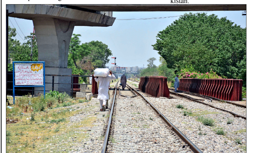
RAWALPINDI: Citizens walking dangerously on the railway track which may cause an accident