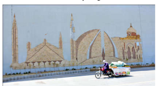
ISLAMABAD: Motorcyclist passing through a huge portrayal at Rawal Chowk in the Federal Capital.

He held injustice was done with KP by observing loadshedding and imposing taxes therein.