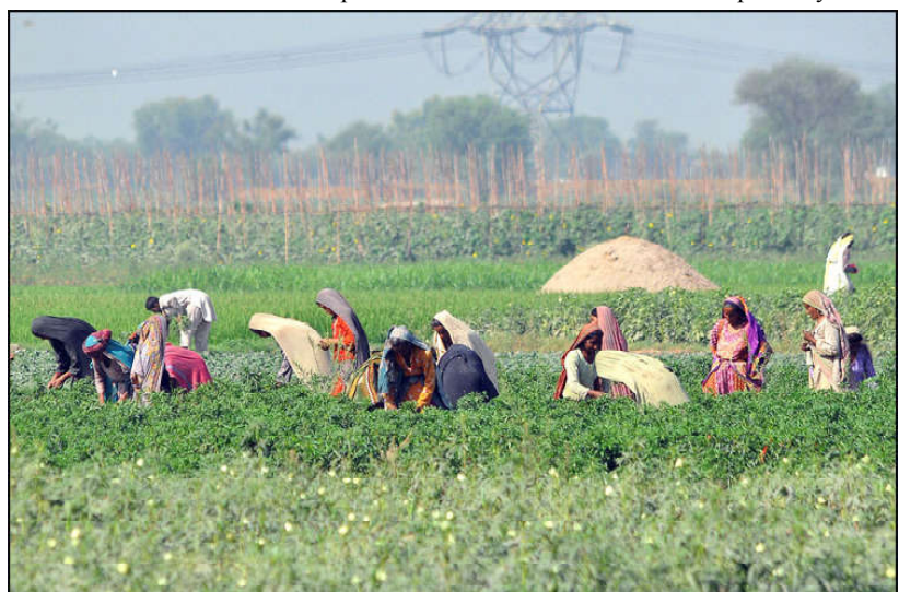
MULTAN: Women farmers plucking okra vegetables in the field.

May 2024. According to the latest SBP figures, the merchandise trade deficit during July-May (2023-24) was recorded at $19.724 billion as compared to the deficit of $23.753 billion in July-May (2022-23). Likewise, the services' trade deficit was recorded at $2,099 million during FY2023-24 compared to the deficit of $887 million during the corresponding period of last year.