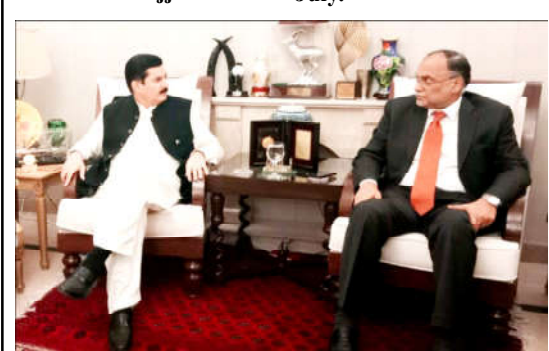
ISLAMABAD: Governor Khyber Pakhtoonkhwa Faisal Karim Kundi meeting with Federal Minister for Planning & Development Ahsan Iqbal

The post-Hajj flight operation of the national flag carrier airlines would remain continued till first week of July.