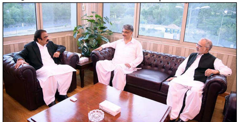
ISLAMABAD: The Prime Minister of Azad Jammu and Kashmir, Chaudhry Anwarul Haq calls on the Federal Minister for Inter Provincial Coordination, Rana Sanaulah.

ment to providing every possible facility to the public. He highlighted the deployment of trained officers within Police Khidmat Markaz, dedicated not only to serving Pakistani citizens but also delivering exceptional services to foreign nationals. He issued directives to senior officers to ensure immediate solutions and the provision of all feasible amenities for their benefit.