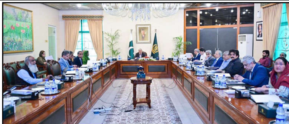
ISLAMABAD: Deputy Prime Minister and Foreign Minister Senator Mohammad Ishaq Dar Chairs the Second meeting of the Committee on Medical Education at Ministry of Foreign Affairs.

Rana Sana Ullah said proposal for increase in budget grant will be considered positively. All the available sources will be utilized for socio economic development of Azad Kashmir. Necessary cooperation will be extended for providing relief to people of Azad Kashmir. Federal government will continue to extend unconditional support to AJK.