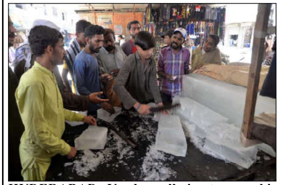
HYDERABAD: Vendor sells ice to earn his livelihood for support his family, at his stall as the demand of ice increases in city during hot weather of summer season.

Per tola and ten gram silver also went up by Rs.100 and Rs.85.76 and was sold at Rs.2,850 and Rs.2,443.41 respectively.