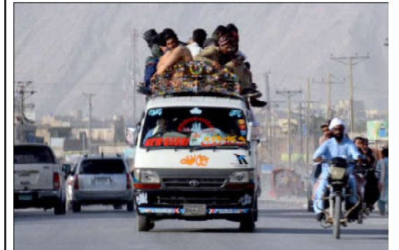
QUETTA: A view of overloaded passenger van on the way cause any incident needs attention of concern authorities.

ISLAMABAD (Online): PPP Members of National Assembly (MNAs) have met speaker National Assembly (NA) Ayyaz Sadiq and they have agreed on resolving all matters with reconciliation. According to NA, PPP delegation met NA speaker Ayyaz Sadiq before commencement of session in speaker chamber. PPP delegation included Khurshid Shah, Navid Qamar, Ijaz Jakhani and deputy speaker Ghulam Mustafa Shah.