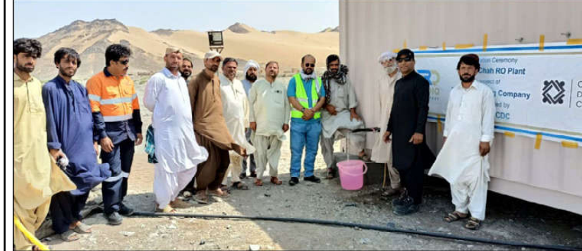
CHAGAI: Work on setting up of RO plants from Reko Diq Mining Company in process for provision of clean water for people of Chaghai

He reiterated that the nation was in debt of 78 thousand billion out of which 9,775 billion to be paid in terms of loans and interests.