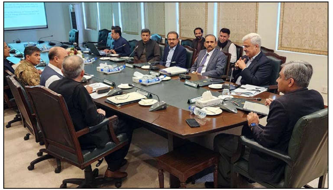
ISLAMABAD: Federal Minister for Interior Mohsin Naqvi chairing an important meeting at the Ministry of Interior.