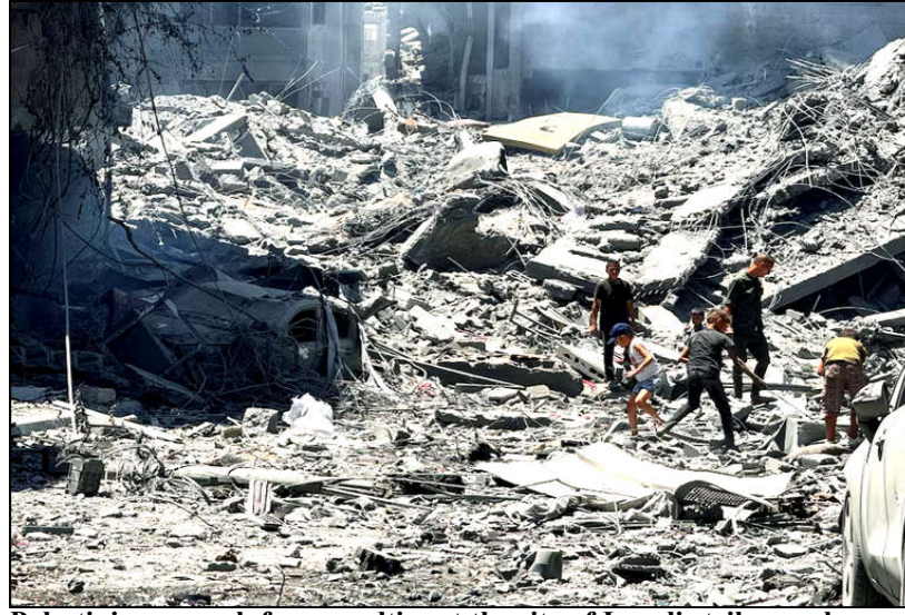
Palestinians search for casualties at the site of Israeli strikes on houses, amid Israel-Hamas conflict, in Gaza City.

new Israeli strikes in the south. They came after Hezbollah said it had fired dozens of rockets at a barracks in northern Israel on Thursday in retaliation for a deadly air strike in south Lebanon. Israel said a Hezbollah operative was killed in that strike. It said jets struck Hezbollah sites and used artillery "to remove threats in multiple areas in southern Lebanon". Hezbollah claimed a number of attacks on Israeli troops and positions near the border on Friday, including two using drones. Experts are divided on the prospect of a wider war, almost nine months into Israel's campaign to eradicate Iran-backed Hezbollah's ally Hamas, the Palestinian militant group in the Gaza Strip.