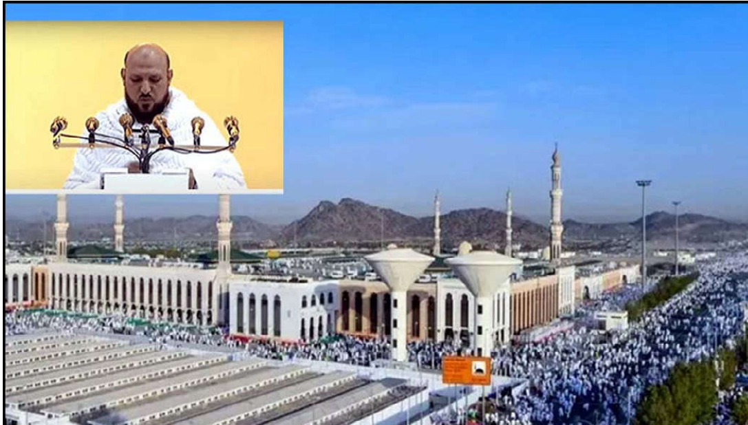
Sheikh Maher Al-Muaiqly, imam of the Grand Mosque in Makkah, delivers the Hajj sermon at Masjid-e-Nimrah

Ph: 2841470/2841473 REG: No. BC-116 B/ID-445 Vol XXV No. 296, Zil Hajj 09, 1445 AH Sunday June 16, 2024 Pages 08, Price Rs.15