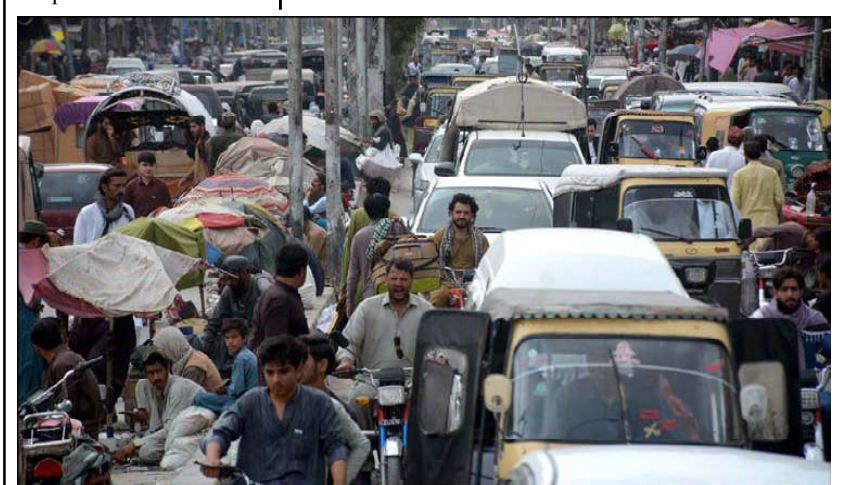
QUETTA: A view of traffic jam on Meezan Chowk due to Eid shopping.

He entered into chamber of the lawyer and opened firing. As a result former president district bar association Attock and one lawyer were killed.