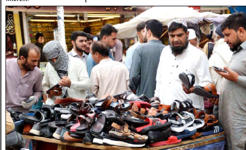
QUETTA: People selecting and purchasing shoes from road side vendor stall during eid shopping.

face Media Wing said in a press release. During the conversation, the two leaders reaffirmed the strong bond of friendship and brotherhood between Pakistan and Oman, rooted in shared values and mutual respect. They also discussed ways to further strengthen bilateral relations and cooperation in various fields. The two leaders also discussed the regional situation, particularly developments in Palestine and agreed to continue to work together to promote peace, stability, and prosperity in the region and beyond. The prime minister reiterated his cordial invitation to the Sultan to undertake an official visit to Pakistan at his earliest conven-