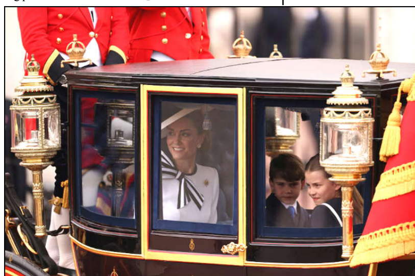
Britain's Catherine, Princess of Wales, Prince George, Princess Charlotte and Prince Louis attend the Trooping the Colour parade to honour Britain's King Charles on his official birthday in London, Britain.

Police said 350,000 people were expected to march and 21,000 officers had been mobilised after labour unions, student groups and rights groups called for rallies to oppose the anti-immigration, eurosceptic RN ahead of upcoming elections to the French parliament.