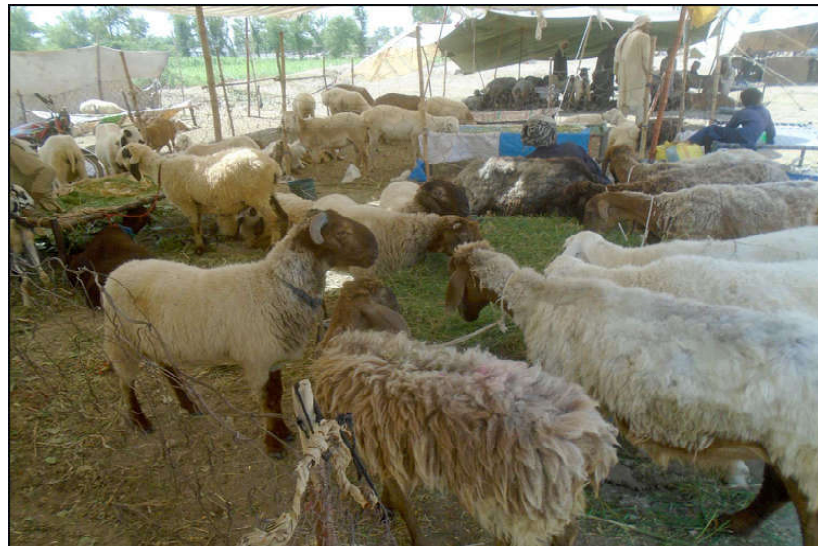
CHINIOT: Large number of Sacrificial animals available at Cattle Market at Jhang Road but there are no buyers. It is feared that the sacrifice rate will be lower this year.

Chairman FBR highlighted that milk companies have repeatedly raised their prices over the past two years, burdening consumers without contributing to the government's revenue. He noted that these companies have not entered the tax net despite substantial price hikes. Additionally, the complete abolition of zero rating from the next financial year was confirmed.