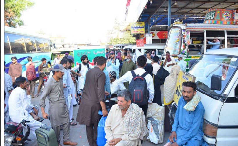
FAISALABAD: Passenger rush at GTS Chowk in the city, as transporters have increased the fares owing to Eid.

LAHORE (APP): At least thirteen persons were killed and 1464 injured in 1358 Road Traffic Crashes (RTCs) in all 37 districts of Punjab during the last 24 hours. Out of these, 686 people with serious injuries were shifted to different hospitals, while 778 victims with minor injuries were treated at the incident site by rescue medical teams thus reducing the burden of hospitals. Furthermore, the analysis showed that 808 drivers, 56 underage drivers, 153 pedestrians, and 516 passengers were among the victims of road traffic crashes. The statistics show that 267 RTCs were reported in Lahore which affected 293 persons placing the Provincial Capital.