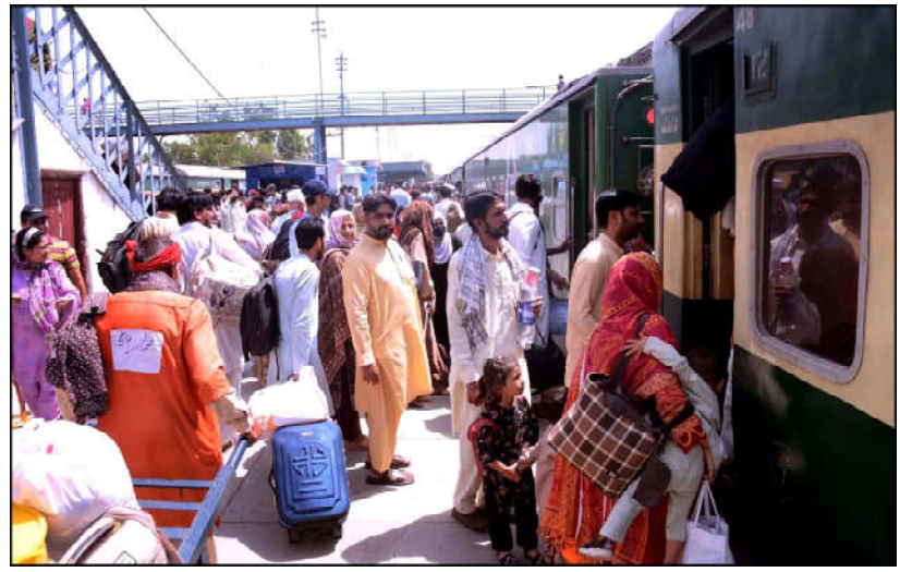
FAISALABAD: People arriving at Railway station depart their hometowns to spend Eid ul Azha holidays with their loved ones

elected government. He said that the development budget of Sindh was more than other provinces. He said that the PPP-led government always introduced long term programmes. The CM said that the minimum wage was proposed Rs 37000. He said that Sindh government had proposed 30 percent increase in the salaries of government employees of grade 1 to 6, 25 percent for grade 7 to 16 and 22 percent for the grade 17 to 22. He said that the prices had increased due to inflation and estimate could rise owing to it. He said that new NFC award should be announced every five years as per the constitution. He further said that PPP had supported the federal government but was not part of it.