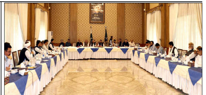
QUETTA: Balochistan Chief Minister Mir Sarfraz Ahmed Bugti consulting allied parties and opposition MPs on next financial year's provincial budget. Governor Balochistan Sheikh Jaffar Khan Mandokhail is also present