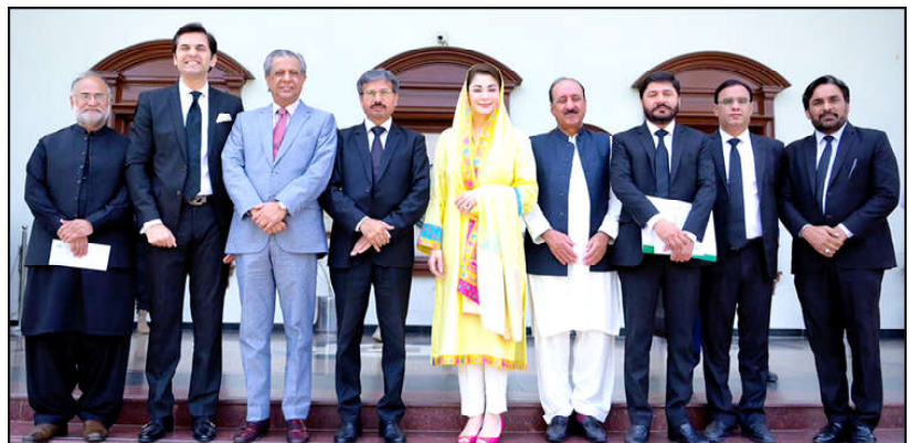
LAHORE: Chief Minister Punjab Maryam Nawaz Sharif in a group photo with delegation of apex bodies of Bar Councils.

Bahawalpur and Multan High Court Bar Councils. It was agreed to restore treatment facilities for the lawyers community in the government hospitals. Maryam Nawaz Sharif said, "The struggle of the lawyers community for the supremacy of the rule of law is praiseworthy. We will extend complete assistance for upholding the rule of law and equal access to justice for a common man. The government will continue to fulfil its administrative responsibilities for enhancing the performance of judicial system and timely provision of justice." Matters pertaining to strengthening a partnership between the government and lawyers community were discussed in the meeting.