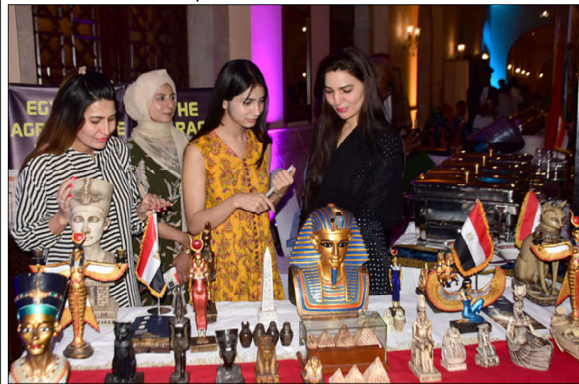
ISLAMABAD: Girls taking interest in an Egyptian stall on Africa Day at a local hotel in the Federal Capital.

stressed the significance of ensuring the strike's success, urging active participation from the people of the occupied territory. Furthermore, the APHC condemned Modi's visit, asserting that it seeks to mislead the global community about the real situation in IIOJK, which has witnessed unprecedented brutality under BJP rule. He pointed out that BJP-led Indian government was not only subjecting the Kashmiris to oppression and state terrorism but also insulting them by revoking their political rights. He said the entire world is well aware of India's double standards. KMS-R The spokesman stressed that BJP regime's dual approach, involving oppression and atrocities alongside deceptive economic packages, only exacerbates the suffering of Kashmiris. The APHC has called upon the international community to take prompt action to resolve the Kashmir dispute, cautioning the grave threat it poses to peace and stability in South Asia, and the exacerbation of the suffering of the people of Jammu and Kashmir.