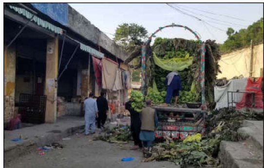
ABBOTTABAD: Laborers are busy in unloading bananas from truck to earn their livelihood for support their families, at Fruit and Vegetable Market in Abbottabad.

Commenting on the launch of the airline's fourth international route, Fly Jinnah's spokesperson said: "Fly Jinnah is proud to mark another milestone with the introduction of our fourth international route, linking Islamabad and Bahrain. This strategic expansion underscores our dedication to offering our valued customers new options for affordable and value-driven air travel domestically and internationally.