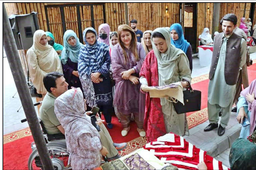
GILGIT: Deputy Speaker Gilgit-Baltistan Assembly Sadia Danish visiting the stall during the Summer Fest 2024 organized by the Women Chamber of Commerce & Industry.

the region. He said that the scorching heat caused numerous problems for the people. However, the FESCO was striving hard to ensure an uninterrupted power supply round the clock. In this connection, it is also updating its feeders' data on its social media accounts so that people could manage their normal activities. This data is also regularly published in electronic.