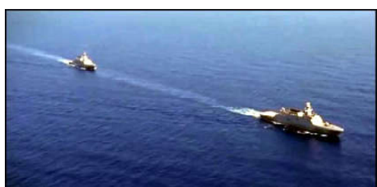
ISLAMABAD (INP): The naval forces of Pakistan and Türkiye have stages Turgutreis-9 exercise in the Eastern Mediterranean to enhance operational readiness and foster cooperation.

PNS Babur visited Aksaz naval base and participated in the exercise. The purpose of the exercise was to further enhance the interoperability and joint operations capability between the two navies.