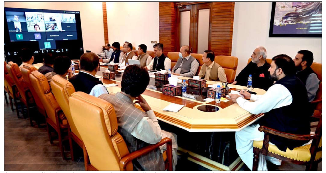
QUETTA: Chief Minister Balochistan Mir Sarfaraz Ahmed Bugti presiding over a meeting through video link regarding shifting of agriculture tubewells on solar energy

sion of agricultural tube wells on the solar energy. The expenditures on account of subsidy on agricultural tube wells would also be decreased remarkably besides prevention of electricity theft in the power system after the solarization, he added. The Chief Minister assured that it would be ensured by the Provincial government that the feeders shifting on the solar energy may not use electricity of QESCO.