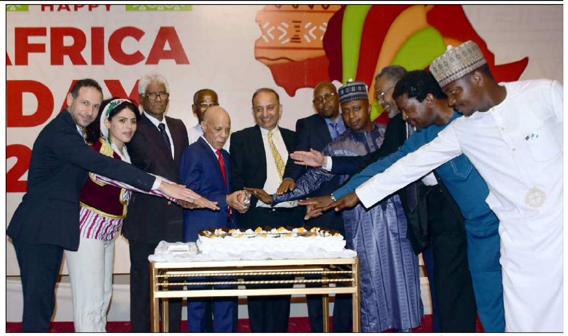
ISLAMABAD: Federal Minister for Petroleum, Musaddiq Malik, Dean of the African group and Ambassador of Morocco Mohamed Karmoune, and heads of missions of the African countries cutting cake to celebrate the Africa Day at a local hotel in the Federal Capital.

ISLAMABAD (APP): Governor Khyber Pakhtunkhwa, Faisal Karim Kundi on Saturday met with Federal Minister for Petroleum, Musaddiq Malik in Islamabad and discussed various economic and public welfare related issues. They also discussed various aspects of federal budget, issues relating to oil refineries situated in KP and security of oil wells. Member Provincial Assembly, Ahmad Kundi was also present in the meeting, said a release issued here. The Governor also urged federal minister to play role for giving the Federal Excise Duty of oil wells and the problems of gas load shedding.