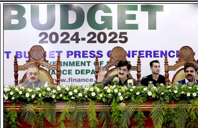
KARACHI: Sindh Chief Minister Syed Murad Ali Shah addressing a post-budget press conference at Sindh Assembly building.

RAWALPINDI (APP): The Anti-Narcotics Force (ANF) while conducting five operations across the country managed to recover over 182 kg drugs and arrested seven accused, said an ANF Headquarters' spokesman here on Saturday. He informed that 4 kg ice was recovered from the parcel sent to Kenya from a cargo office in Rawalpindi. 88.8 kg hashish and 700 grams opium were recovered from the possession of an accused arrested in Khushab. 22.8 kg hashish and 2 kg opium were recovered from the possession of an accused along with two women.