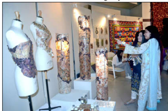
LAHORE: Visitors viewing the displayed items during the Art and Design exhibition (Degree Show 2024) at Johar Town.

also directed to ensure the availability of small and large machinery to deal with any untoward incident in advance. Farmers should adjust their watering routines according to the weather, especially in wheat harvesting areas. In case of strong winds, people should stay away from power lines, dilapidated buildings and structures, cyan boards and billboards. Tourists and locals in sensitive highlands are instructed to take precautionary measures to be aware of weather conditions. In sensitive districts, messages to the district administration should be conveyed to the local population in local languages. In any emergency,