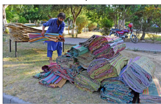
ISLAMABAD: A man selling flax and plastic mat used for sacrificial meat on Eid ul Adha.

Heavy rain is also expected at some places in Kashmir. The Khyber Pakhtunkhwa will have very hot and dry weather during June 16-18. The Meteorological Department said that between June 18 and June 22, Chitral and Abbottabad are likely to experience intermittent rains at few places with wind and thunderstorm. During June 16 to 18, the weather will remain very hot and dry in most parts of Balochistan. The weather experts said in their report that between June 18 and 22, there was a possibility of rain at some places in Islamabad.