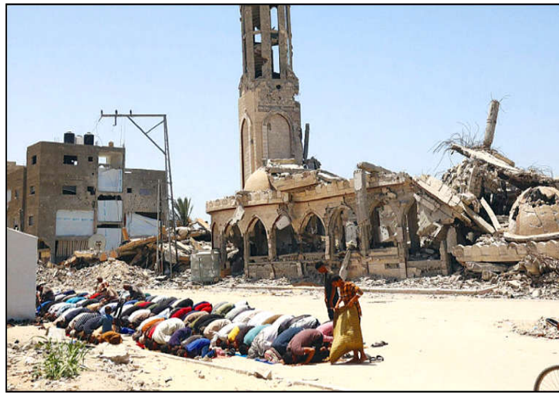
People offer Friday prayers in front of a destroyed mosque in Khan Younis.

At Al-Aqsa Martyrs Hospital in the central city of Deir al-Balah, men gathered over the body of an 11-year-old boy who died during a bombardment of nearby Bureij refugee camp.