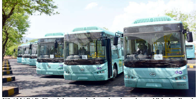
ISLAMABAD: Electric buses parked at a charging point established at Jinnah Convention Center in the Federal Capital.

empowered journalists to play a vital role in advocating for women's rights through their reporting." The stories produced by the fellows covered a range of critical topics, including: Women's inheritance rights and their deprivation; The practice of "Ghugh" in KP, where random men can claim a woman without her consent; Challenges faced by transgender individuals when a community member dies without anyone to conduct the funeral prayer. A key focus of this fellowship has been the gender-based violence (GBV) faced by the transgender community in Pakistan. "This fellowship has