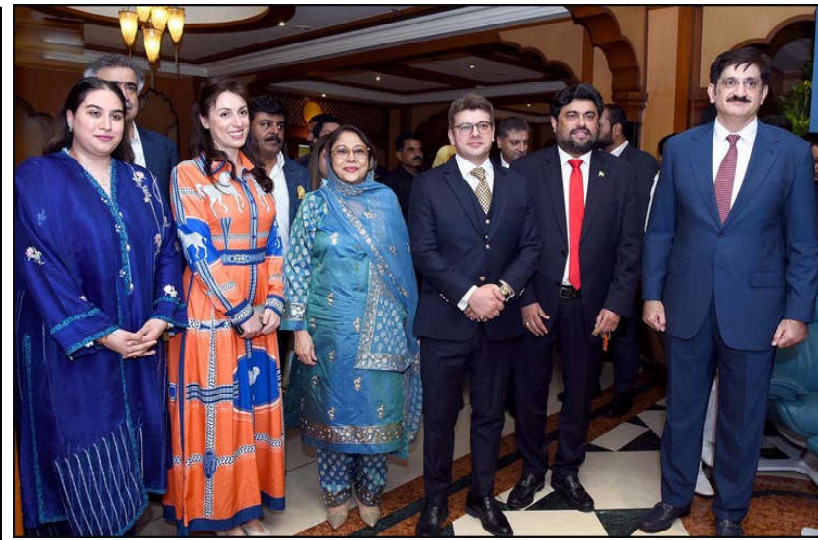
KARACHI: Sindh Governor Kamran Khan Tessori, Sindh Chief Minister Syed Murad Ali Shah and President PPP Women Wing Faryal Talpur in a group photo with Italian Consul General on the eve of the Italy National Day.