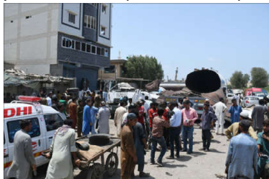
KARACHI: A view of the site after an explosion in Karachi. At least one killed and eight others injured in an explosion in a chemical tanker in Shireen Jinnah Colony Area.

KARACHI (APP): The Sindh Chief Minister Syed Murad Ali Shah while taking notice of a scavenger boy's death by a security guard of a private security company has ordered to arrest the culprit immediately and submit a report to him in this regard. According to a CM's Spokesman, the Chief Minister had ordered to take action against private security companies that hand over arms to under-training or recruited new guards. The Sindh Chief Minister directed the Home Department to inspect private security companies. Murad said that the companies should also work on mental health and development of security guards during and after recruiting process. He said that arms should not be given to a person, who was recruited as a new security guard. He said that the criminal record of the guard should also be checked during the recruitment and his deployment. The CM said that such incidents were painful and unbearable. He had also expressed his sorrow and showed sympathy to the family members over the death of the boy.