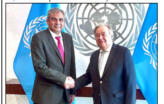
NEW YORK: Federal Minister for Interior Mohsin Naqvi shaking hands with UN Secretary General Antonio Guterres.

The UN Secretary General while evincing keen interest in establishment of Tahhafaz centre and other reforms said induction of women officers in police is good omen. Women officers do good policing. Women police officers will be given priority certainly.