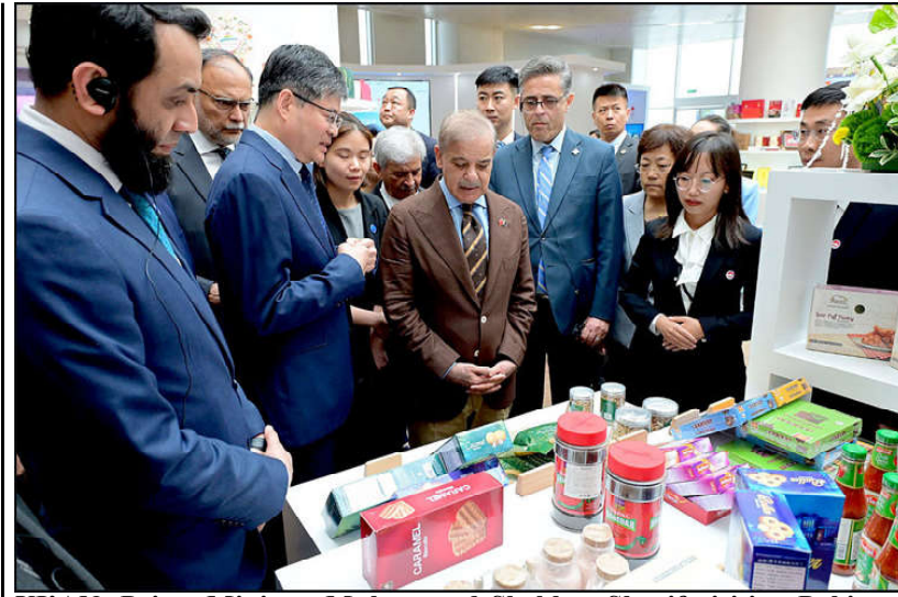
XI'AN: Prime Minister Muhammad Shehbaz Sharif visiting Pakistan Pavilion at the display center in Yangling Agricultural Demonstration Base.

assistance to POWERCHINA. He stated that as a global leader in clean, low-carbon energy, water resources, and environmental construction, POWERCHINA actively practices the Belt and Road Initiative (BRI), and has been involved in the early stages of the CPEC construction, effectively driving local employment and promoting Pakistan's economic and social development. POWERCHINA will fully leverage its integrated advantages across the entire industry chain, actively participate in hydropower, new energy, and other fields in Pakistan, promote the optimization of local energy structure and green development, and contribute to the optimization of local energy structure and green development, and contribute to the optimization of local energy structure and green development, and contribute to the optimization of local energy structure and green development.