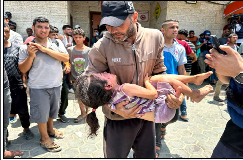
A man carries a casualty in the aftermath of an Israeli strike, amid the Israel-Hamas conflict, at Al-Aqsa Martyrs Hospital in Deir Al-Balah, in the central Gaza Strip.