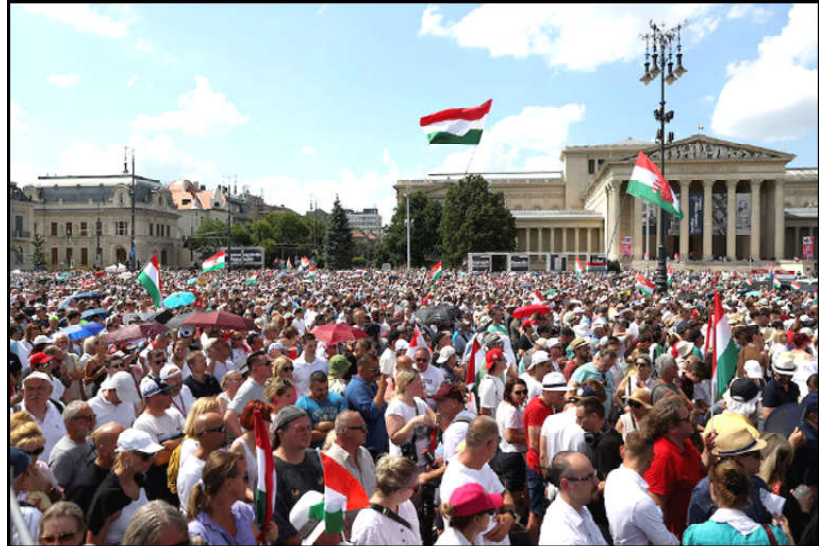
Supporters of Peter Magyar, former government insider and leader of the Respect and Freedom (TISZA) Party take part in a rally ahead of the European Parliament elections, in Budapest, Hungary.

green light for such attacks amounted to "a confession... for the murder of children and women in the Belgorod region". "Fragments of Himars [rockets] will serve as direct proof," she told reporters. Reuters could not independently verify the assertion and there was no immediate comment from Ukraine or the United States. Zakharova did not present images of any rocket fragments. She did not say how many people had been killed in the alleged incident.