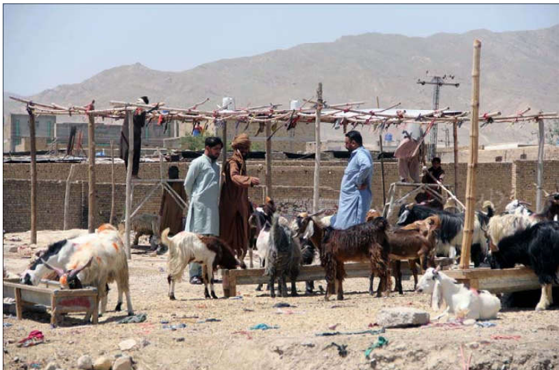
QUETTA: Sacrificial animals wait for their buyers at a make-shift sacrificial animals cattle market established for the upcoming festival Eid-ul-Azha, in Quetta