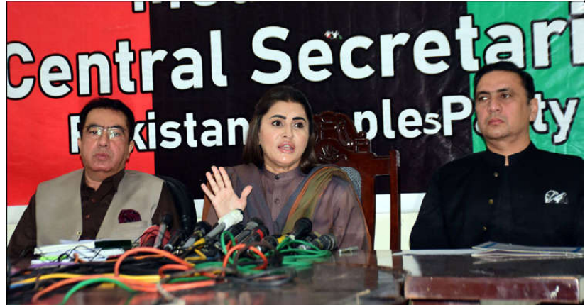
ISLAMABAD: Central Spokesperson Pakistan Peoples Party, Shazia Marri addressing a press conference in Federal Capital.