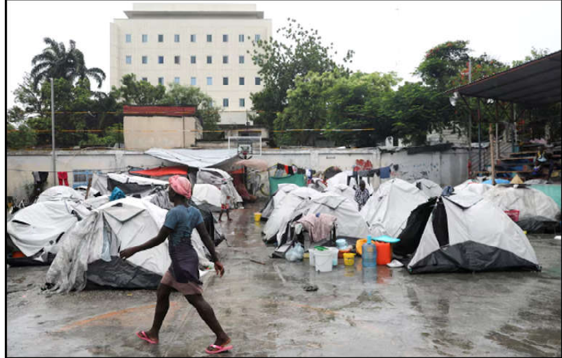
A woman walks past tents at the Gymnasium Vincent which was turned into a shelter for people who had to flee their homes due to gang violence, in Port-au-Prince, Haiti.