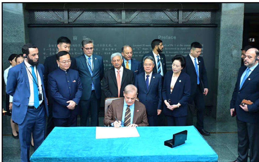
XIAN: Prime Minister Muhammad Shehbaz Sharif recording his remarks in the visitors' book at Terracotta Warriors Museum.