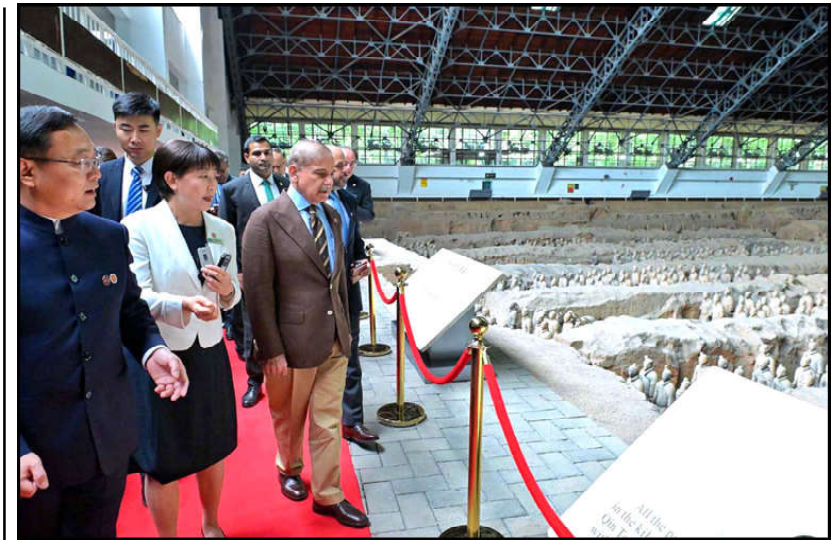
XI'AN: Prime Minister Muhammad Shehbaz Sharif visits different sections of Terracotta Warriors Museum.