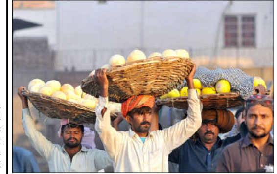
MULTAN: Daily wage workers carrying seasonal fruit baskets on their heads to earn for livelihood.