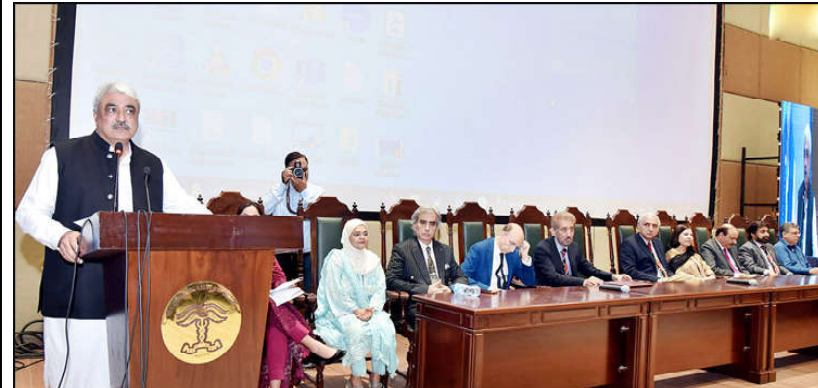
LAHORE: Punjab Minister for Health and Emergency Services addressing first International Gynecological Conference at King Edward Medical University.