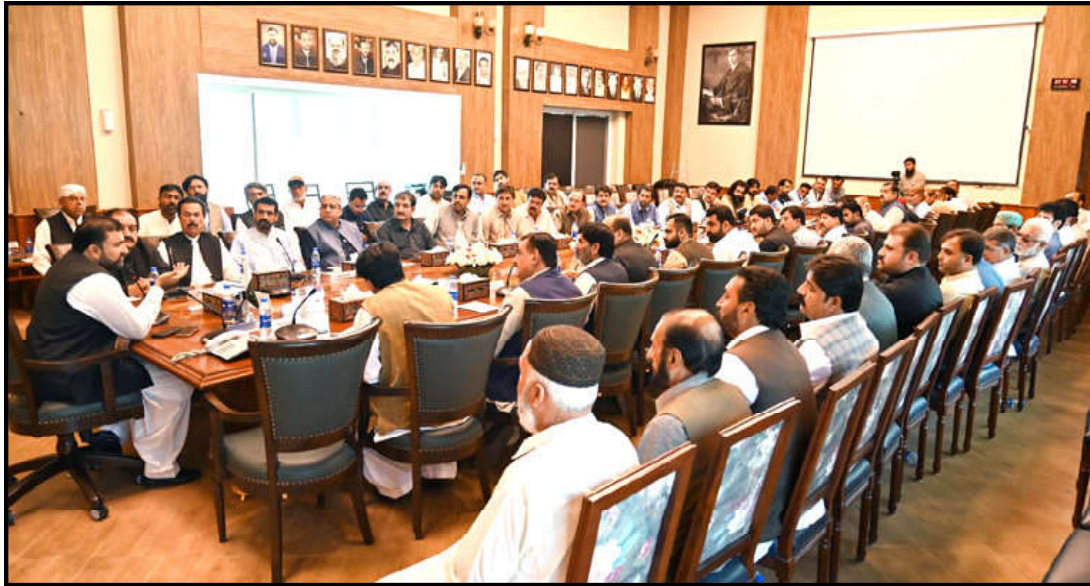
QUETTA: Chief Minister Balochistan Mir Sarfaraz Ahmed Bugti addressing Pakistan Peoples Party's Provincial, Divisional, District Presidents and General Secretaries

Ph: 2841470/2841473 REG: No. BC-116 B/ID-445 Vol XXV No. 289, Zil Hajj 02, 1445 AH Sunday June 09, 2024 Pages 08, Price Rs.15