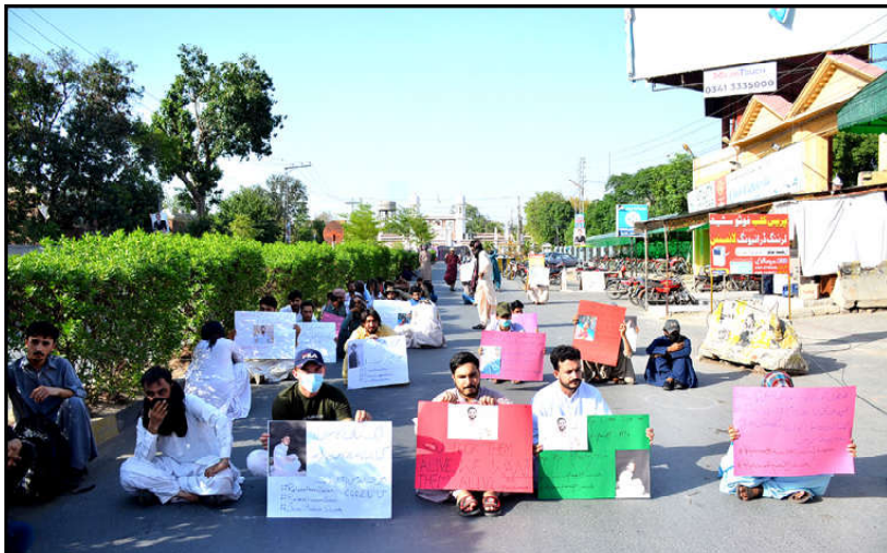
FAISALABAD: Baloch students protesting in favor of their demands under the auspices of Punjab Student Council in Zilla Council Chowk in the City.

Pakistan was the pioneer country that cooperated in the base, it was further told. The prime minister was also apprised of the Pakistani scientists and the Pakistani universities participating in the research work.