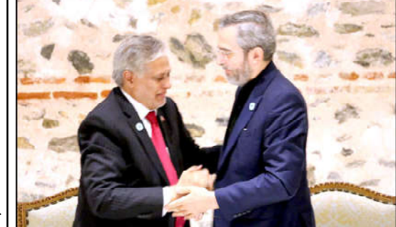
ISTANBUL: Deputy Prime Minister and Foreign Minister Senator Mohammad Ishaq Dar meets with Acting Foreign Minister of Iran, Ali Bagheri on the margins of the Extraordinary Meeting of the D-8 Council of Foreign Ministers.

ISLAMABAD (APP): Deputy Prime Minister and Foreign Minister Mohammad Ishaq Dar and Acting Foreign Minister of Iran Ali Bagheri on Saturday discussed the situation arising out of ongoing Israeli bombardment and targeting of refugee camps in Rafah in the Gaza Strip. They called for urgent measures to bring an immediate end to Israeli aggression, its incessant crimes against humanity and violation of international humanitarian law. The deputy prime minister and foreign minister met Iranian acting foreign minister on the margins of the Extraordinary Meeting of the D-8 Council of Foreign Ministers held in Istanbul, Türkiye, Foreign Office Spokesperson said in a press release. The deputy prime minister and foreign minister reaffirmed Pakistan’s strong commitment to the people of Palestine and their right to self-determination. The two ministers expressed satisfaction over the trajectory of bilateral relations marked by increased high-level exchanges in political, economic, defence and security and intelligence spheres. They reaffirmed commitment and resolve to continue strengthening of mutually beneficial bilateral cooperation and dialogue between the Pakistan and Iran. The acting foreign minister of Iran congratulated Deputy Prime Minister Dar on Pakistan’s election as a non-permanent member of the UN Security Council.