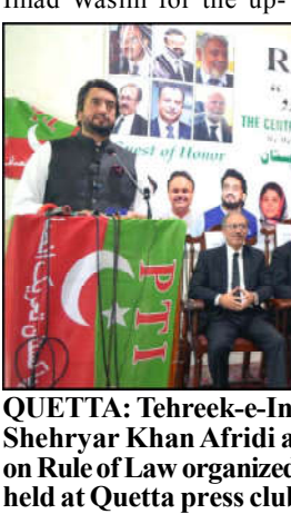
QUETTA: Tehreek-e-Insaf (PTI) Central Leader, Shehryar Khan Afridi addresses during seminar on Rule of Law organized by Insaaf Lawyers Forum, held at Quetta press club.