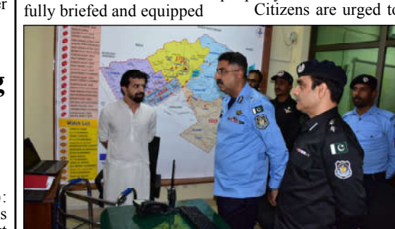
with all necessary gadgets before being sent on duty. Negligence and carelessness in duties will not be tolerated. During the visit, IGP Islamabad also reviewed

the ongoing construction works at the CTD Complex. Additionally, he issued orders to the Security Division officers to enhance the security of embassies. He emphasized ensuring an effective search process at the entry and exit points of the Diplomatic Enclave and effective monitoring of these routes with Safe City cameras. He further said that, Islamabad Police is actively engaged in maintaining peace and order in the federal capital and ensuring the safety of citizens' lives and property. Citizens are urged to