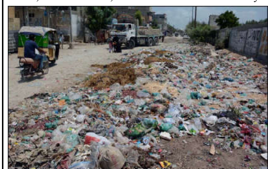
KARACHI: View of huge heap of garbage creating problems for commuter, causing unhygienic atmosphere showing the negligence of concerned authorities, located on Korangi Chakra Goth area.