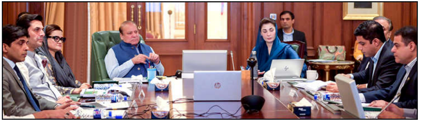
LAHORE: Punjab Chief Minister Maryam Nawaz and President PML-N Muhammad Nawaz Sharif preside over the special meeting about Marri Development Plan.

Clipping Pod Village' were reviewed in the meeting. It was apprised during the briefing that more than 90 percent construction and extension of 12 roads of Murree has been completed. A water supply scheme is going to be launched for the provision of clean water in Murree and in the surrounding areas from the incumbent system and River Jhelum. The participants were apprised about elimination of encroachments and crackdown being launched against illegal constructions. A principle approval was granted to provide financial aid to the injured workers during the launching of anti-encroachment campaign. CM Maryam Nawaz Sharif said, "Anti-encroachment campaign will continue and no compromise will be made in this regard."