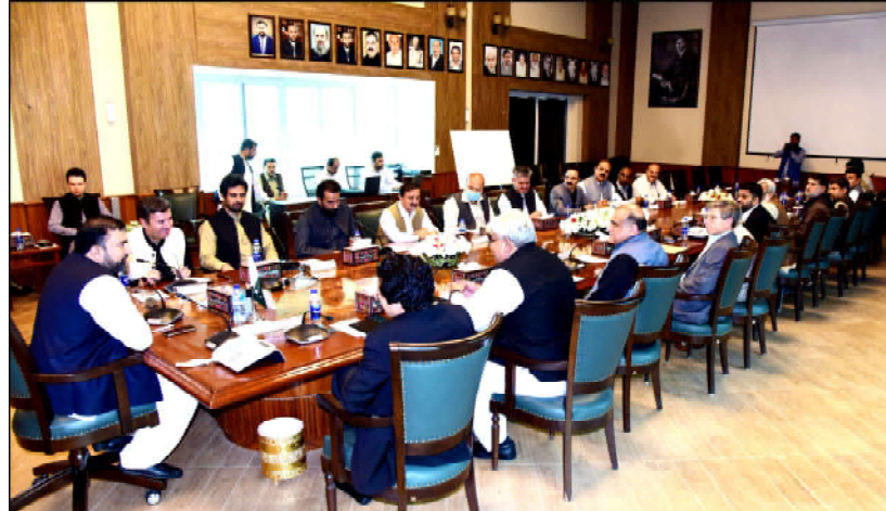
QUETTA: Balochistan Chief Minister Mir Sarfaraz Ahmed Bugti presiding over joint meeting of Federal and Provincial officials regarding solarization

He said having come into being two years after Pakistan, China took its trade to trillions of dollars while Pakistan's hovered around $30-40 billion in terms of exports. Besides, China has excelled in information technology and artificial intelligence. He also referred to the "wonderful" bilateral cooperation in space program as Pakistan recently sent a lunar satellite and a space satellite recently with Chinese collaboration.