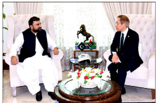
QUETTA: Ambassador of South Korea Park Kijun meeting with Chief Minister Balochistan Mir Sarfaraz Ahmed Bugti