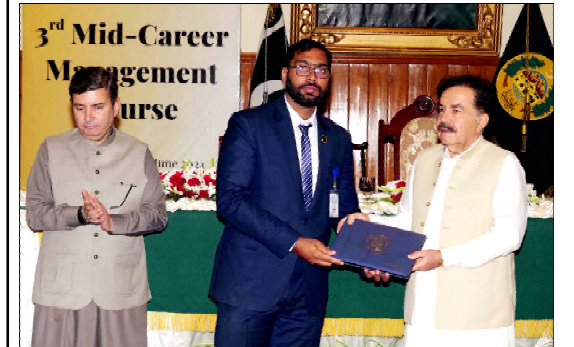
QUETTA: Governor Balochistan, Jaffar Khan Mandokhail distributing certificate among participants during the concluding ceremony of 3rd Mid-Career Management Course held in Quetta.