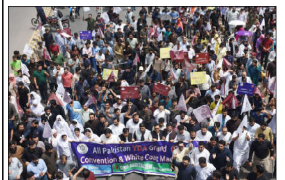
LAHORE: All Pakistan Young Doctors Association hold a protest rally from the service hospital of the provincial capital passing through Jail Road.

systems to reduce electricity bills, and private sector investment would be encouraged for mega projects. The minister said there would be no increase in taxes burdening the poor in the budget. The provincial minister informed the consul general that the Punjab government would not impose any tax on net wealth. Instead of increasing property tax rates, changes would be made in the tax base, he added. A reasonable increase in property tax rates was proposed after five years. In the upcoming budget, skill development and internship programs for youth would be introduced, while no final decision had been made regarding the Pink and Yellow Line trains.