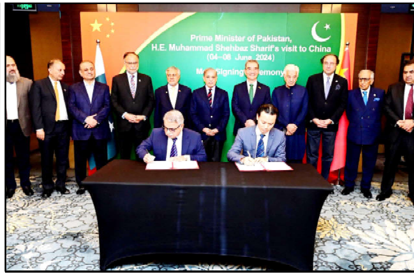
BEIJING: Prime Minister Muhammad Shehbaz Sharif witnesses signing of Memorandums of understanding regarding cooperation in different fields between China and Pakistan.

Deputy Commissioner told initially two persons were killed while 7 injured were rescued from bus.