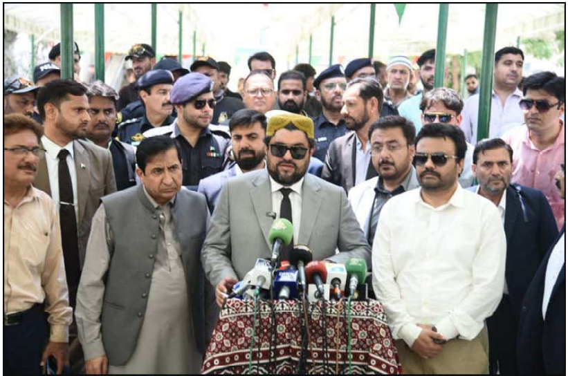
KARACHI: Sindh Governor Kamran Khan Tesori talking to media persons during 1294 Urs of Abdullah Shah Ghazi (R.A).

He said that collective efforts of all provinces related to out-of-school children's need of hour, adding, that Punjab government authorities.