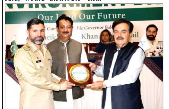
QUETTA: Governor Balochistan Sheikh Jaffar Khan Mandokhail giving away memorial shield of PPAF to Military Secretary to Governor Balochistan Col. Tanveer Hussain on eve of World Environment Day

Cup in 2022, meanwhile, in the ODI World Cup in 2023, they were knocked out from the group stage. The abovementioned campaigns were followed by a disastrous T20 World Cup 2024, where Sri Lanka lost their group stage matches against South Africa and Bangladesh while their fixture against Nepal was washed out. They were officially eliminated after Bangladesh defeated the Netherlands and qualified for the Super 8s stage.