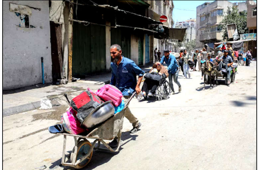
Palestinians flee their homes following an Israeli military operation in Shejaiya, amid Israel-Hamas conflict, in Gaza City.

ing a Canadian warning from the day before, "urgently requested" its citizens in Lebanon leave the country. "The current heightened tensions in the border area with Israel could escalate further at any time," updated foreign ministry advice in Berlin said. UN humanitarian coordinator Martin Griffiths told reporters in Geneva on Wednesday that Lebanon was "the flashpoint beyond all flashpoints". "It's beyond planning. It's potentially apocalyptic," warned Griffiths, whose term ends this week. A war involving Lebanon "will draw in Syria... it will draw in others", he added. "It's very alarming." Lebanon's national news agency reported about 10 Israeli strikes on areas near the border on Wednesday, including one around 10:00 pm that destroyed a building in Nabatiyeh, wounding five people.