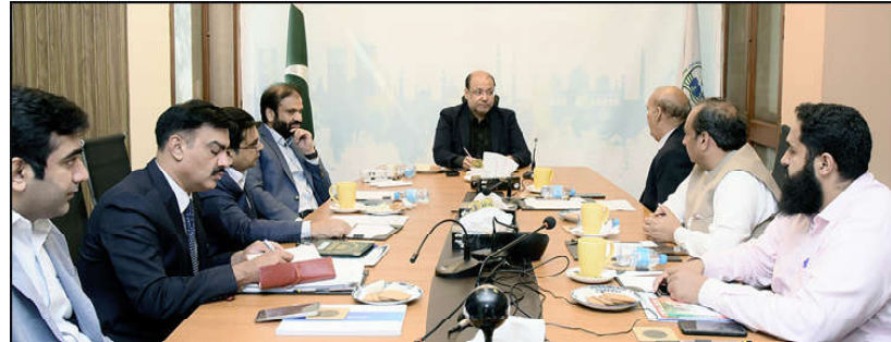
LAHORE: A delegation of Pak-China Joint Chamber of Commerce and Industry meeting with Punjab Minister for Industries and Commerce.

The PBF President urged that to safeguard our national interests, stringent measures should be implemented without delay. Companies seeking to import CBU units must provide a detailed plan outlining their timeline for local assembly.