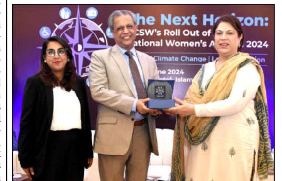
ISLAMABAD: NCSW Chairman Nilofer Bakhtiar Presenting Shield to Minister for law and Justice and Human Rights Senator Azam Nazeer Tarar.

KARACHI (INP): CPEC 2.0 will bolster Pakistan's 5E initiative, said Planning Minister Ahsan Iqbal while addressing a seminar held here by KASB Ktrade Securities. The 5Es initiative is centred around five key pillars, which include exports, E-Pakistan, environment and climate change, energy and infrastructure and equity and empowerment. The seminar themed "CPEC 2.0: Business Collaboration Between Pakistan and China". Ahsan Iqbal highlighted the opportunities of the new phase of CPEC featured by B2B cooperation with a view to the outcomes of Pakistani PM Shehbaz Sharif's visit to China earlier this month. According to Gwadar Pro, the Planning Minister summarised that over 1000 business meetings were held during PM's visit to China, which has brought together over 150 companies from Pakistan and over 200 firms in China in a grand business conference. In terms of the first "E", exports, he cited the success of sesame seeds and chilies. "The exports of sesame seeds to China just started around 3 years ago, and today we have an export of $300 million. Similarly, exports of chilies have expanded exponentially. There are huge potential for Pakistani products to hit the Chinese market", he said. In building E-Pakistan, the Planning Minister mentioned the framework agreement signed with China's technology giant Huawei during PM's China trip, under which Huawei will provide free training to 200,000 Pakistani youth in the field of information technology.