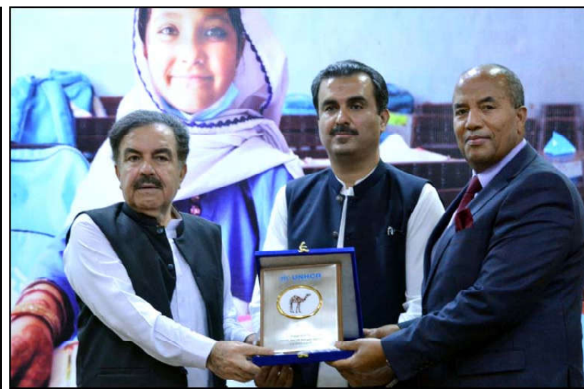
QUETTA: Balochistan Governor, Sheikh Jaffar Khan Mandokhail presenting the shield to the Country Head UNHCR during ceremony in connection of World Refugee Day organized by United Nations High Commissioner for Refugees (UNHCR) held in Quetta.

tournament, and Ibrahim Zadran had been the mainstay of the Afghan batting with three century opening partnerships on their fairytale run to the last four. Left-arm quick Marco Jansen (3-16) removed Gurbaz for a duck with just four runs on the board in the opening over, however, and returned in the third over to bowl Gulbadin Naib for nine. There was no respite from the other end as paceman Kagiso Rabada (2-14) found a nice line and length to bowl Zadran and Mohammad Nabi for a couple of runs apiece in the fourth over. The third quick Anrich Nortje (2-7) chipped in with a couple of wickets and left-arm wrist spinner Tabraiz Shamsi (3-6) mopped up the tail as Afghanistan became the first team to score fewer than 100 runs in a T20 World Cup semi-final.