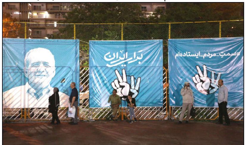
Supporters of reformist Iranian presidential candidate Massoud Pezeshkian lift his portraits during a rally in Tehran.

headed by the prime minister. These committees are responsible for appointing key posts such as the director of India's top crime investigation agency and members of the National Human Rights Commission (NHRC). He said the opposition wanted the house to function "often and well" and added that it was very important that cooperation happens with trust. Since 2014, no opposition party had won 10 per cent or 55 of the 543 seats required to claim the post, but Congress took 99 seats in the recent general election. The Congress party said Mr Gandhi would ensure the government was held to account at all times. On Wednesday, Mr Gandhi made his first appearance in parliament in his new role and wore a white khadi kurta and pyjama instead of his regular t-shirt. Pointing out that this time the opposition represents significantly more voices of the Indian people than last time, Mr Gandhi stressed that it was very important that the voice of opposition is allowed to be represented in the house.