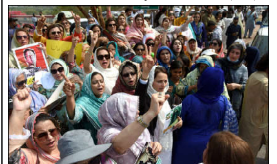
ISLAMABAD: Women workers of PTI shouting slogans during protest outside district court in the Federal Capital, as the court rejects Imran Khan, wife appeal in unlawful marriage case.

The court had ordered on April 4 to remove name of Shireen Mazari from ECL. Earlier IHC had ordered on December 01, 2023 to remove name of Shireen Mazari from Passport Control List (PCL).