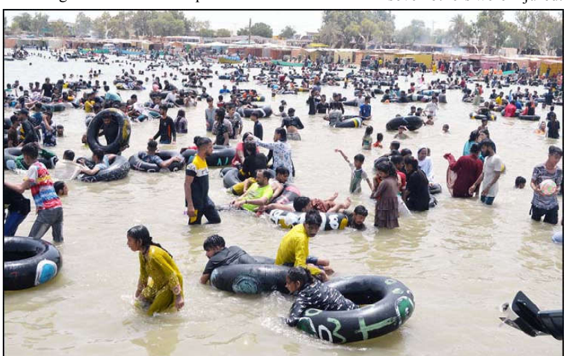
THATTA: A view of large numbers of people suffering from hot days visits Keenjhar Lake Thatta to take some sigh of relief.

Furthermore, the analysis showed those 692 drivers.