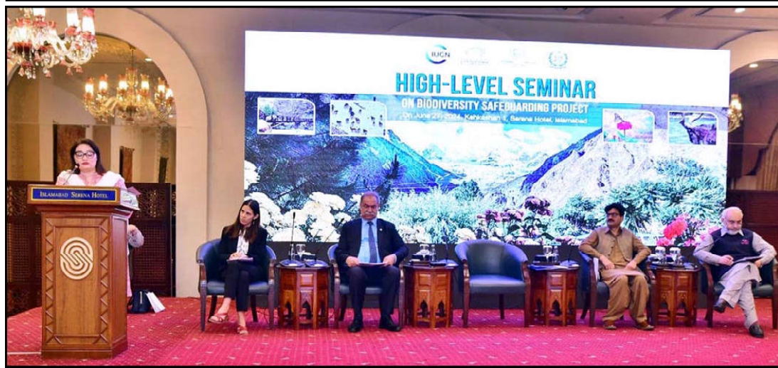
ISLAMABAD: Coordinator to Prime Minister on Climate Change, Romina Khurshid Alam addressing a seminar on "Global Assessment of State of Nature and Biodiversity Safeguarding Actions in Northern Pakistan".