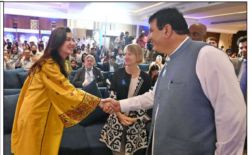
ISLAMABAD: Federal Minister for States & Frontier Regions (SAFRON), Kashmir Affairs and Gilgit-Baltistan Engineer Amir Muqam shaking hand with UNHCR's Goodwill Ambassador, Ms. Mahira Khan during a seminar on "World Refugee Day-2024" organized by UNHCR.

This year's theme, "Solidarity with Refugees and Solutions for Refugees," highlights the urgent need for collective action and sustainable solutions to address the refugee crisis, he added. Engr Amir Muqam said that for over four decades, Pakistan has demonstrated unparalleled generosity and compassion by hosting one of the largest refugee populations in the world. Currently, we provide sanctuary to approximately 1.4 million P.O.R and about 0.8 million Afghan Citizen Card holders, he added.