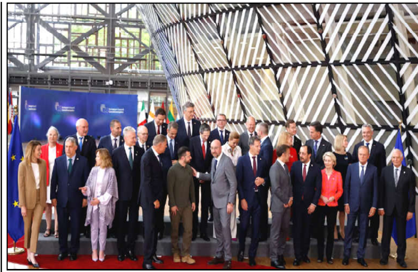
Ukrainian President Volodymyr Zelenskyy and European leaders attend a family photo session, during the European Union leaders' summit in Brussels, Belgium.

Monitoring Desk RUSSIA: Wildfires above the Arctic Circle in June have unleashed carbon emissions that are the third highest for the time of year in two decades of monitoring, European scientists said on Thursday. As climate change raises Arctic temperatures, wildfires have shifted north where they blaze through boreal forest and tundra, releasing vast amounts of greenhouse gases from carbon-rich organic soils. The latest data from European Union's Copernicus Atmospheric Monitoring Service (CAMS) showed some 6.8 megatonnes of carbon have been released this month, only less than in June 2019 and June 2020.