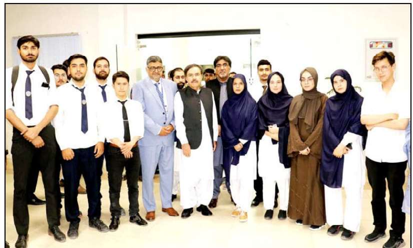
QUETTA: Governor Balochistan Sheikh Jaffar Khan Mandokhail in a group photo with students during his visit to BUIITEMS.