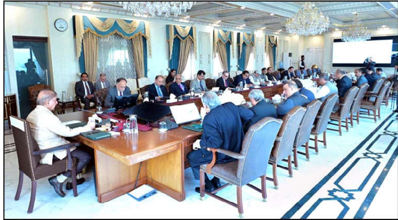
ISLAMABAD: Prime Minister Muhammad Shehbaz Sharif chairs a meeting regarding promotion of Pakistan-Azerbaijan economic ties.