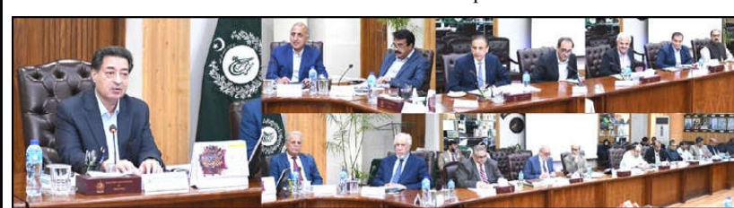
ISLAMABAD: Chief Election Commissioner, Sikandar Sultan Raja chaired a meeting on local body elections in Islamabad and Punjab at ECP Secretariat.

Chief Election Commissioner, Sikandar Sultan Raja chaired a meeting on local body elections in Islamabad and Punjab at ECP Secretariat.