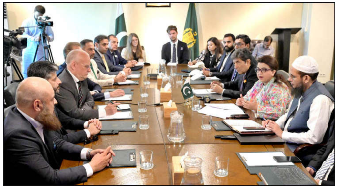
ISLAMABAD: Minister of State for IT and Telecom Ms. Shaza Fatima Khawaja addressing Roundtable on IT and Digitalisation with Swedish companies.

transfer efforts, with collaborations with China and Belarus. "Plans are in place to send students to China and double the per-acre yield," he added. He emphasized the importance of agricultural research, stating that the federal government has allocated Rs.5 billion, with 26 universities and research centers working on this front. Rana Tanveer said subsidies for solar-powered tube wells are being introduced by the federal and Punjab governments.