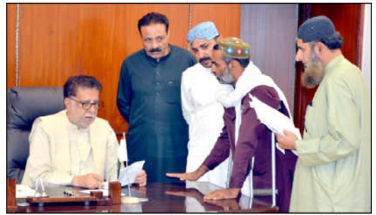
QUETTA: Provincial Minister for Irrigation Mir Sadiq Umrani listening problems of people at his office.