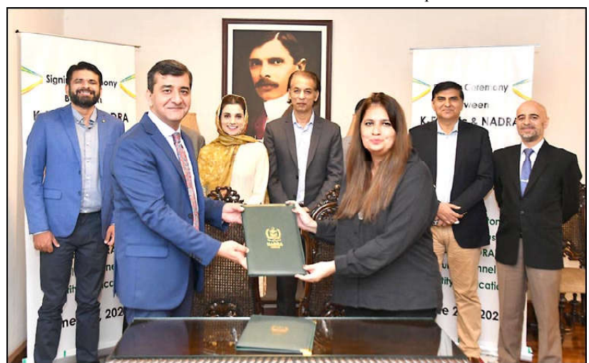
ISLAMABAD: Representative of National Database and Registration Authority (NADRA) and K-Electric (KE) exchange documents after agreement signed.

laptops among the efficient and talented students. "The government has set aside an amount of Rs 100 billion in the budget to promote the Information Technology sector, which is a historic step." Similarly, he said, the government had also allocated funds for the skills development and the sports sector. It was also working on several projects for skills development of the youth and to create maximum employment opportunities for them, he added. PM Shehbaz said the government was taking steps to reduce burden on the national exchequer by privatizing the state-owned enterprises and bringing reforms in the public departments. He also expressed his government's resolve to continue the diplomatic and moral support of the oppressed Muslims of Palestine. During the meeting, matters of the relevant constituencies and overall political situation of the country also came under discussion.