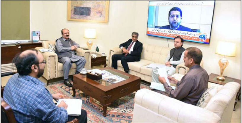
ISLAMABAD: Chairman Prime Minister's Youth Programme Rana Mashhood Ahmed Khan in a meeting with officials from Ministry of Interprovincial Coordination.