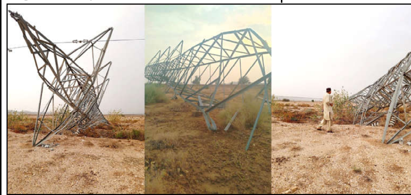
A view of towers of 132 KV Sui-Dera Bugti transmission line fell due to heavy rains and stormy winds

ISLAMABAD (APP): The Benazir Income Support Programme (BISP) and the Ministry of Information Technology (MOIT) have agreed to devise a strategy to combat fraudulent activities targeting innocent people. During a meeting with Minister of State for IT and Telecommunication, Shaza Fatima Khawaja, Chairperson of Benazir Income Support, Senator Rubina Khalid, emphasized the need for a national-level strategy with MOIT's assistance to protect people from deceptive practices exploiting the BISP name.