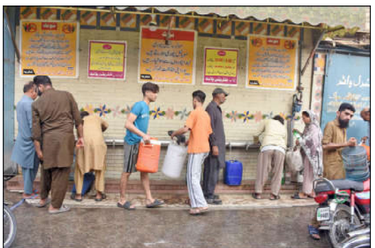
LAHORE: People filling drinking water from the Badami Bagh water filtration plant in the provincial capital.

The participants in the delegation said they benefited from the experiences of the Punjab government. Nigeria would use the PDMA mechanism to prevent natural disasters, the participants added.