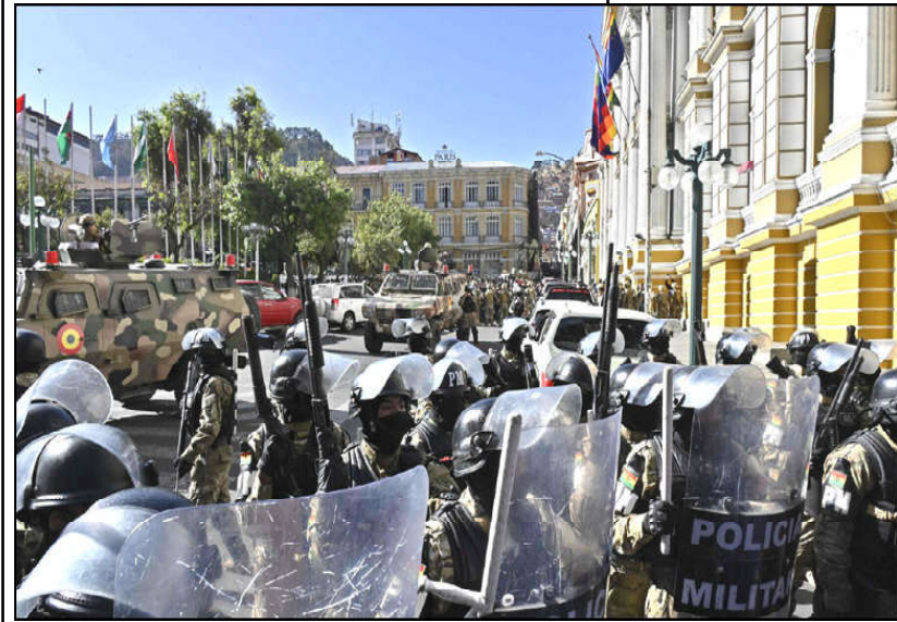
Military troops are deployed at the Plaza de Armas in La Paz.

It was not clear where they would receive treatment. The Israeli military body that coordinates civilian affairs in Gaza did not immediately respond to a request for comment.