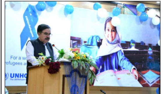
QUETTA: Balochistan Governor, Sheikh Jaffar Khan Mandokhail addresses during ceremony in connection of World Refugee Day organized by United Nations High Commissioner for Refugees (UNHCR) held in Quetta.

He assured that the feasible policies are being formulated for provision of livelihood to the local people of Chaman. Earlier, upon reaching in the border Chaman, the Chief Minister, Speaker provincial assembly, provincial ministers and members of assembly were warmly welcomed by the higher authorities.