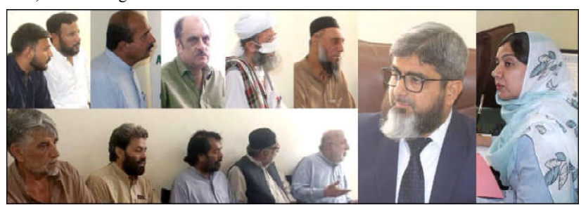
QUETTA: DG NAB (Balochistan) listening complainants during Khuli Kacheri held at NAB's Complaint Office at DC Office