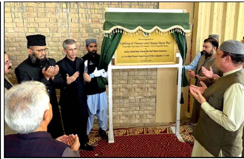
CHAMAN: Chief Minister Balochistan Mir Sarfaraz Bugti offering Dua after inaugurating Chaman Master Plan

She reiterated the resolve that the parliament will continue to play its role in highlighting the voices of the people and protecting their rights. She said that the democratic system is essential for the country's economic and social progress and stability.