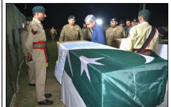
JHELUM: Federal Minister for Interior and Anti-Narcotics Mohsin Naqvi paying homage to ANF martyrs.