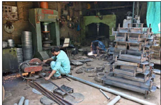
RAWALPINDI: A worker busy in preparing new grills to be used for Barbecue ahead of Eid ul Ahza at his workplace, Pirwadhai.