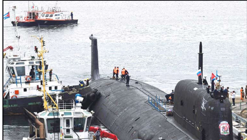
A Russian nuclear-powered submarine, part of a naval detachment visiting Cuba, docks at Havana harbour.