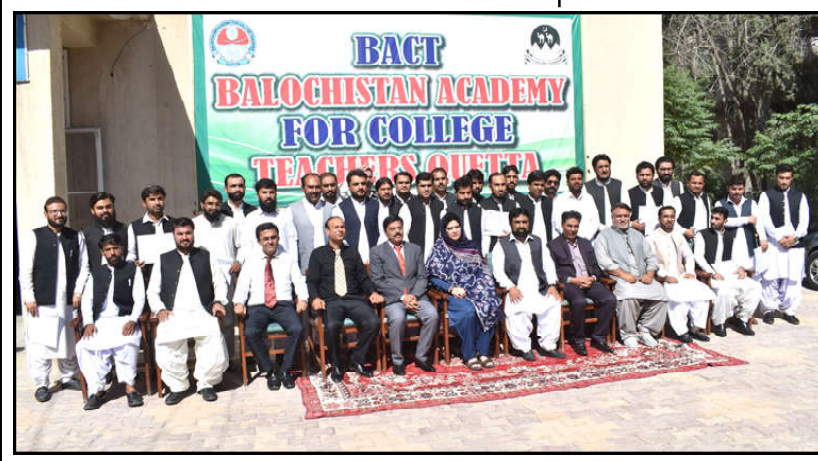
QUETTA: Provincial Education Minister Raheela Hameed Khan Durrani in a group photo with participants who completed training under BACT

ISLAMABAD (INP): A crucial meeting between PTI and Leader of the House Ishaq Dar regarding the division of standing committees concluded without a resolution. The PTI delegation, including Shibli Faraz and parliamentary leader Barrister Ali Zafar, convened with Dar in the Senate, aiming to finalize committee assignments. Despite discussions, both parties failed to reach an agreement on committee distribution. However, they have scheduled another meeting for today to continue negotiations. Senator Ali Zafar expressed optimism, stating, "Standing committees should adhere to procedural rules, and we anticipate our proposals will be considered."