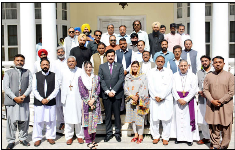
PESHAWAR: Khyber Pakhtunkhwa Governor Faisal Karim Kundi in a group photo with representative delegation of minorities who called on him at Governor House.