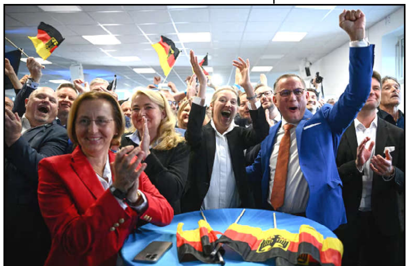
Alternative for Germany (AfD) party co-leaders Alice Weidel and Tino Chrupalla react to results after the polls closed in the European Parliament elections, in Berlin, Germany.

Like other coastal areas in Denmark, the Vejle fjord is suffering from eutrophication - a process in which nutrients, often from land run-off, accumulate in a body of water and lead to increased growth of microorganisms and algae. The algae cover water surfaces, blocking light and cutting off oxygen, killing plants and wildlife. An underwater surveillance camera installed in the Vejle fjord by the municipality last year detected just one fish in 70 hours.