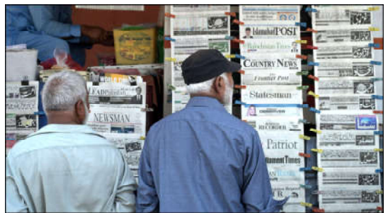
ISLAMABAD: Two elderly persons busy in reading newspaper about Federal Budget 2024-25.

ISLAMABAD (APP): In a concerted effort to combat the raging infernos engulfing the lush forests of Murree, Pakistan Army and Rescue 1122 joint forces, deploying over ten teams to extinguish the blaze at various locations. "We are pleased to announce that the combined efforts of armed forces and emergency responders have brought the fire under control in eighty percent of the affected area, "a rescue spokesperson told PTV. With the remaining twenty percent of the area still under scrutiny, the firefighting teams remain vigilant, ensuring that every ember is extinguished and every corner of the forest is secured, he maintained. He said the relentless efforts not only subdued the flames but also shielded the neighboring communities from the encroaching threat.