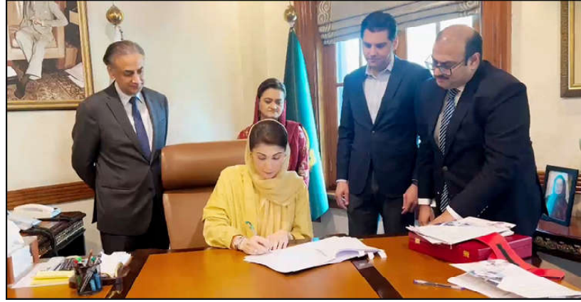
LAHORE: Punjab Chief Minister Maryam Nawaz Sharif signing the Budget 2024-25 documents.