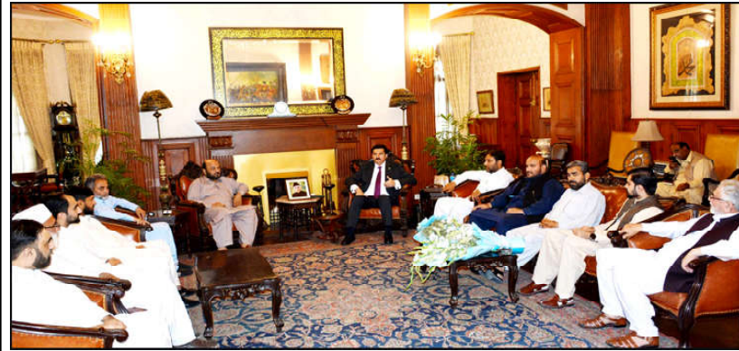
PESHAWAR: Khyber Pakhtunkhwa Governor Faisal Karim Kundi talks to representative delegation Peoples Traders Association, who called on him at Governor House.