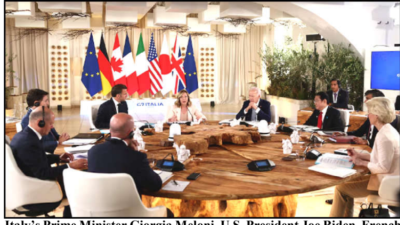
Italy's Prime Minister Giorgia Meloni, U.S. President Joe Biden, French President Emmanuel Macron, Canada's Prime Minister Justin Trudeau, German Chancellor Olaf Scholz, Britain's Prime Minister Rishi Sunak, Japan's Prime Minister Fumio Kishida attend a session on Africa, climate change and development on the first day of the G7 summit at the Borgo Egnazia resort, in Savelletri, Italy

to use the frozen Russian assets to benefit Ukraine comes several months after the White House broke through a logjam in Congress that stalled approval of some $60 billion in U.S. aid for Ukraine. The delay gave Russia time to make up ground on the battlefield. Earlier Thursday, Biden's national security adviser, Jake Sullivan, described the security pact as a "real marker" of the U.S. commitment to Ukraine, "not just for this month and this year, but for the many years ahead." Zelenskyy, on social media, said the document is "unprecedented, as it should be for leaders who support Ukraine." Sullivan said the agreement would not commit U.S. troops directly to Ukraine's defense against Russia's invasion. That is a red line drawn by Biden, who does not want to have the U.S. pulled into a direct conflict with nuclear-armed Moscow.