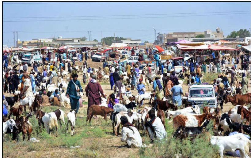
HYDERABAD: Vendors displaying the sacrificial animals to attract the customers at Cattle Market in connection with upcoming Eidul Ahza.

For "Institutional Strengthening of MoHR (Revised)", an amount of Rs 14,324 million has been allocated. Similarly, an amount of Rs 13,581 million has been set aside for the ongoing project of "Human Rights Coordination and Monitoring Unit for National Mechanism for Reporting and Follow-up (NMRF)".