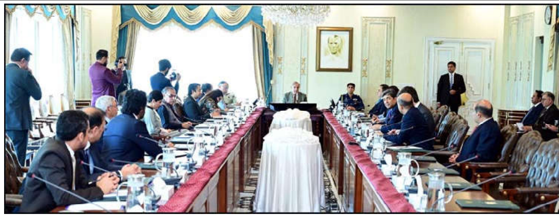
ISLAMABAD: Prime Minister Muhammad Shehbaz Sharif chairs a meeting on digitisation of the Federal Board of Revenue.