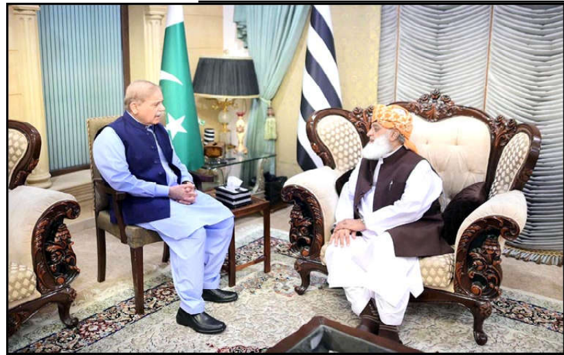
ISLAMABAD: Prime Minister Muhammad Shehbaz Sharif meets Maulana Fazlur Rehman.