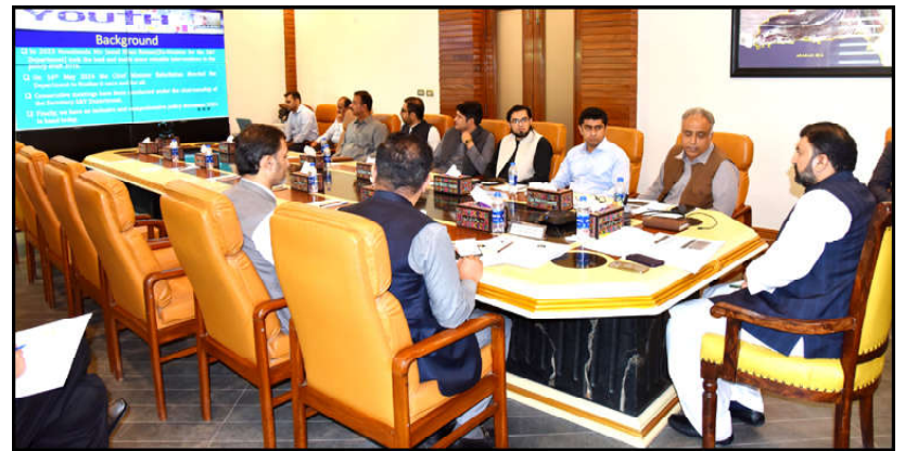
QUETTA: Chief Minister Balochistan Mir Sarfraz Ahmed Bugti presiding over a meeting regarding formation of Youth Police 2024

He directed to prepare calendar of events for engaging youth in healthy activities.