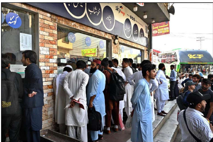
RAWALPINDI: A large number of people purchasing tickets at Faizabad Bus Stand to travel to their hometowns to celebrate Eid ul Azha with their loved ones.