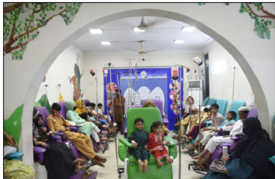
LAHORE: Citizens donate blood at Ganga Ram Hospital on the occasion of World Blood Donation Day in the provincial capital.