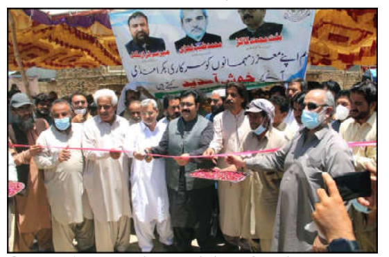
QUETTA: Balochistan Minister for Livestock and Dairy Development, Bakht Muhammad Kakar cuts ribbon during inauguration ceremony make-shift sacrificial animals market established for the upcoming festival Eid-ul-Azha, in Quetta.

Governor House on Thursday. The Governor said that the manner people elected them as their representatives in elections reposing confidence on them, similarly, they should serve them and meet their expectations. He said that the dignity of leadership is based on the public service. He stressed that it is responsibility of the elected public representatives to perform their duties honestly.