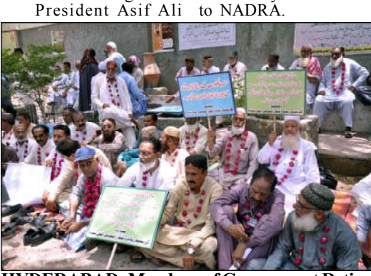
HYDERABAD: Members of Government Retired Teachers Association Sindh are holding protest demonstration for acceptance of their demands, at Hyderabad press club

In reply to a question. the BISP Chairperson said that this system is linked