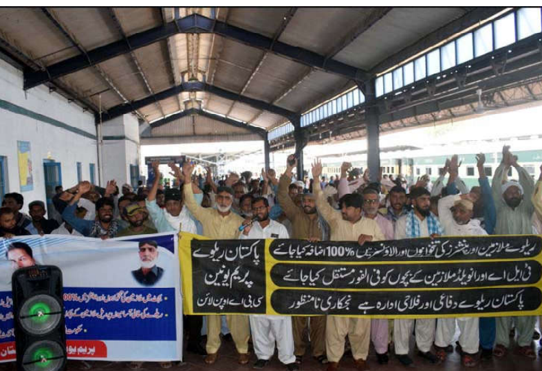
MULTAN: Members of Pakistan Railway Employees Prem Union CBA Multan Division are holding protest demonstration for acceptance of their demands, at Railway Station Platform in Multan