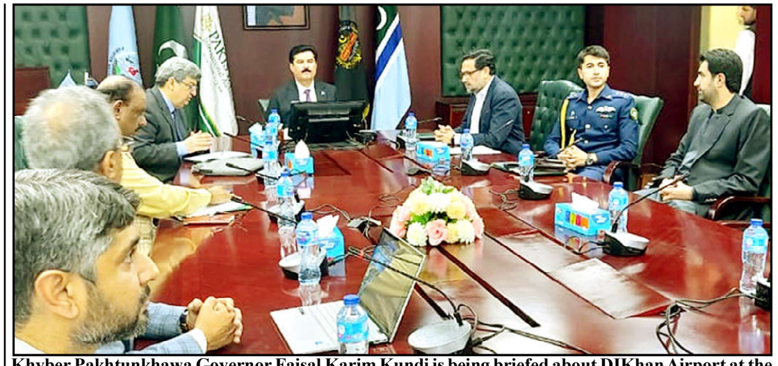
Khyber Pakhtunkhawa Governor Faisal Karim Kundi is being briefed about DIKhan Airport at the Ministry of Aviation Islamabad.

The EC while accenting the petitions of PML-N MNAs transferred all pressed reservations on tri- cases to other election tribunal. A 3-member bench of bunals