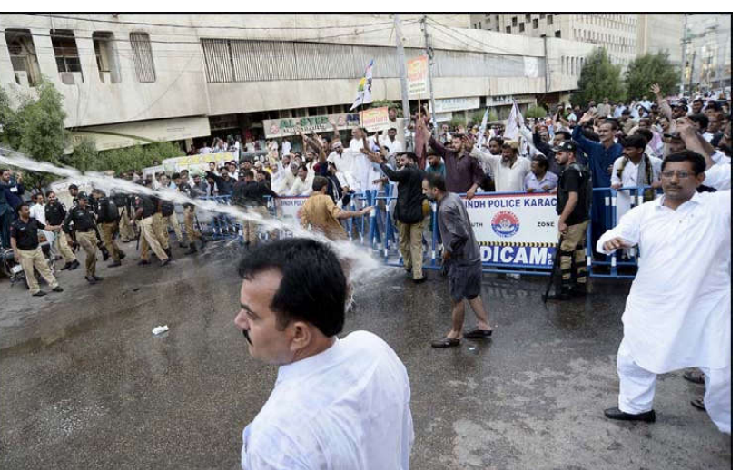
KARACHI: Police staffs restore baton charge and using water cannon to repel protesters moving towards Red Zone area during protest demonstration of All Pakistan Clerk Association (APCA) for acceptance of their demands, held at Karachi press club.

The alleged outlaw neither offered a visa nor returned the amount. FIA arrested the alleged outlaw and started investigation.