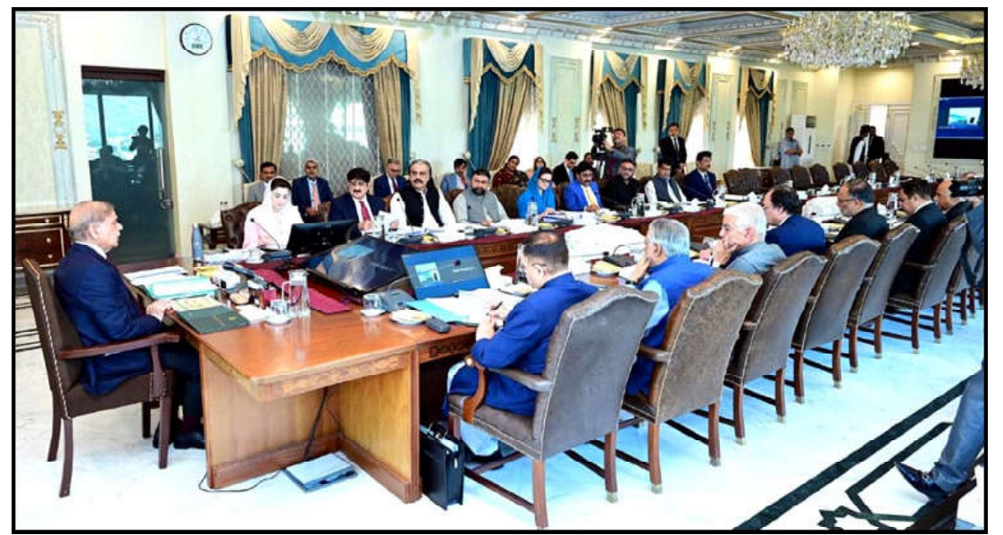
Prime Minister Muhammad Shehbaz Sharif chairs meeting of the National Economic Council in

Ph: 2841470/2841473 REG: No. BC-116 B/ID-445 Vol: XXV No. 291, Zil Hajj 04, 1445 AH Tuesday June 11, 2024 Pages 08, Price Rs.15