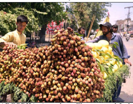
SARGODHA: A vendor selling seasonal fruits near Shaheen chowk.

He expressed concern that some areas in Punjab, Khyber Pakhtunkhwa, Sindh, and Balochistan are not paying their bills. He also shared details of a meeting with the Chief Minister of Khyber Pakhtunkhwa cannot be borne by the country's economy," he added. The minister cooperation in controlling stressed that unless power theft in the province.