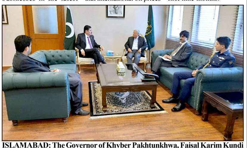
calls on the Federal Minister for Industries and Production, Rana Tanveer