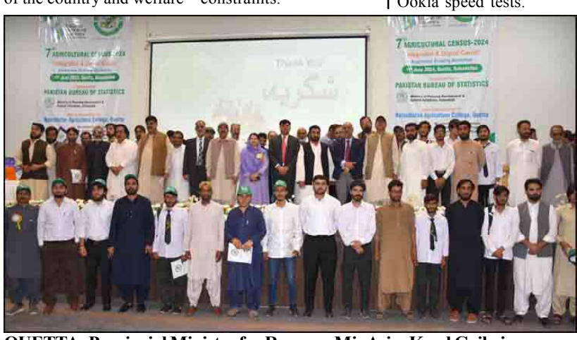
QUETTA: Provincial Minister for Revenue Mir Asim Kurd Gailu in a group photo with participants of awareness building workshop 7th Agricultural Census-2024 on "Integrated & Digital Count" organized by Pakistan

topping multiple categories in the Pakistan. The QoS survey, carried by the Pakistan Telecommunication Authority (PTA) out in 16 cities of Pakistan during the first quarter of 2024, assessed the performance of Cellular Mobile Operators (CMOs) in accordance with the Cellular Mobile Network were the lifeline of a employees from the taxes. | company. The survey involved approximately 250,000 tests of mobile broadband, 45,000 calls and SMS tests, and 130,000 Ookla speed tests.