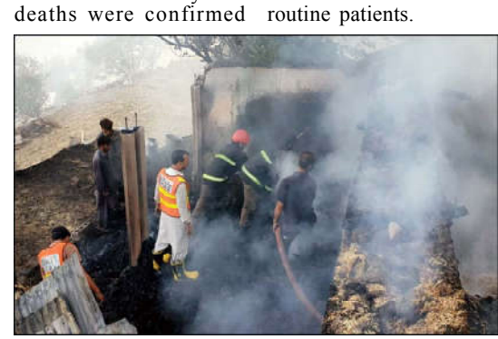
ABBOTTABAD: Fire fighters extinguishing fire at dairy farm warehouse building during rescue operation after fire broke out incident due to electric short circuit, in Abbottabad

government is utilizing digital monitoring and clustering to combat the disease, with Chief Minister Maryam Nawaz focusing her attention on the issue. The minister said clustering analysis had identified Bahawalpur, Jhang, and Chaniot as the