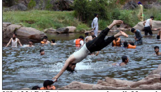
ISLAMABAD: A youngster seeks relief from the intense heat by diving and splashing into the cool waters on a scorching day.

The regime is also settling Indian citizens in IIOJK by granting them domicile status, changing the demographic composi tion of the disputed territory. They deplored that the Modi regime is grabbing Kashmiris' land and properties, violating international norms and denying them their right to self-de-