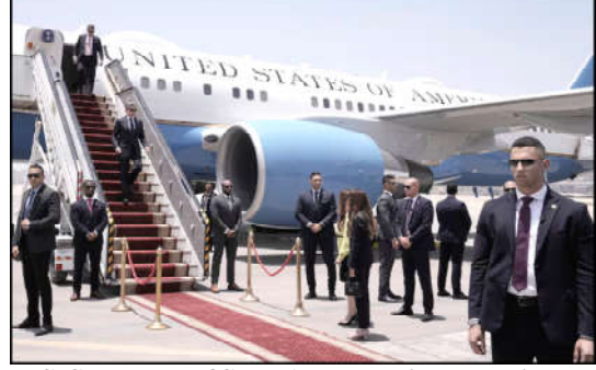
U.S. Secretary of State Antony Blinken arrives at Cairo airport, Egypt.

▼ @dpr_gob 👩 dpr.gob 👍 @dgpr.balochistan