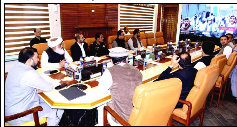
QUETTA: Chief Minister Balochistan Mir Sarfaraz Ahmed Bugti presiding over a meeting to review overall situation of law and order in Chaman

He said that we know very well that majority people of Chaman are peace loving, therefore, it is necessary that local people discourage those disrupting