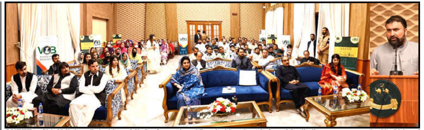
QUETTA: Chief Minister Balochistan Mir Sarfaraz Ahmed Bugti addressing "Safar-e-Mualim" ceremony organized by Voice of Balochistan

He said that he would have the financial cooperation of federal government for solarization of the agricultural tube wells, however, its reservations have to be removed on the solarization. He insisted that the electricity could not be acquired from the regular power system after regularization. The Chief Minister was speaking to the delegation of Balochistan Zamindar Action Committee.