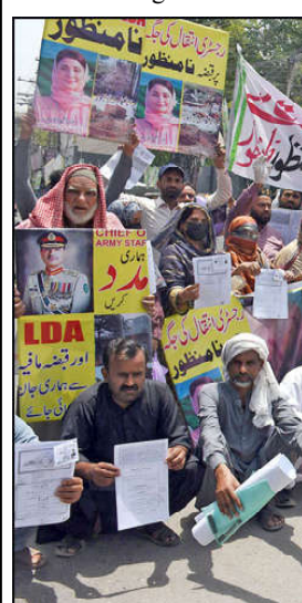
LAHORE: Residents of LDA scheme old Kahna hold placards during protest in favor of their demands outside press club in the Provincial Capital.

Yesterday alone, health authorities identified 321 suspected cases of measles across Punjab. Breakdown of the new cases includes 47 from Lahore, 6 from Gujranwala, 4 from Vehari, 26 from Jhang.