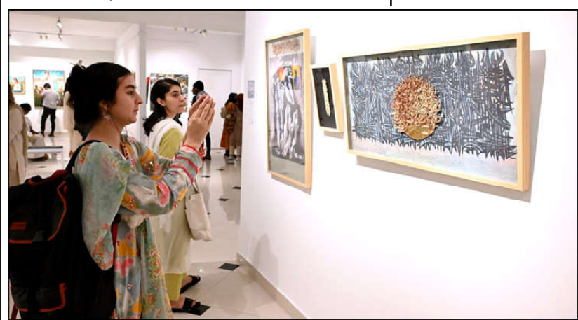
ISLAMABAD: Visitors keenly observes the on displayed artworks during an Art exhibition at Gallery 6.

that the jurisdiction of Agha Khan Foundation's welfare projects and assistance of the underprivileged segment would be extended to other areas of the province. Khyber Pakhtunkhwa Governor Faisal Karim Kundi commended the services of the Agha Khan Foundation for eradication of poverty and providing assistance to the poor segment of KP especially in Chitral district. He underscored the need for collective efforts for looking after the needs of poor families and taking them out of poverty in future. He said that Agha Khan Trust was busy in