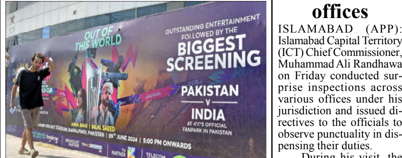
RAWALPINDI: A man on his way in front of PAKINDIA T-20 world cup match billboard outside of Pindi Cricket Stadium in the city. The International Cricket Council (ICC) Men's T20 World Cup 2024 match between Pakistan and India, scheduled for June 9, will be live-streamed at Rawalpindi Stadium for Pakistani fans as part of ICC's fan parks.