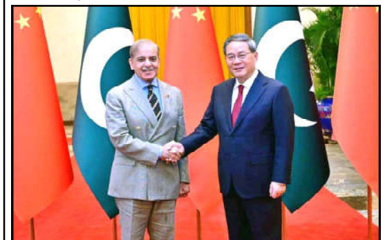
BEIJING: Prime Minister Muhammad Shehbaz Sharif shakes hands with his Chinese counterpart H.E. Li Qiang upon his arrival at Great Hall of the People.