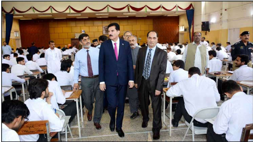
PESHAWAR: Khyber Pakhtunkhwa Governor Faisal Karim Kundi inspecting the exam during his visit to Edwards College Peshawar.

The CM said, "For the first time in the history of Punjab, Rs. 400 billion Kissan Package is being granted. The farmers, besides being granted agricultural revenue, will also be given other privileges and facilities through the Kissan Card.