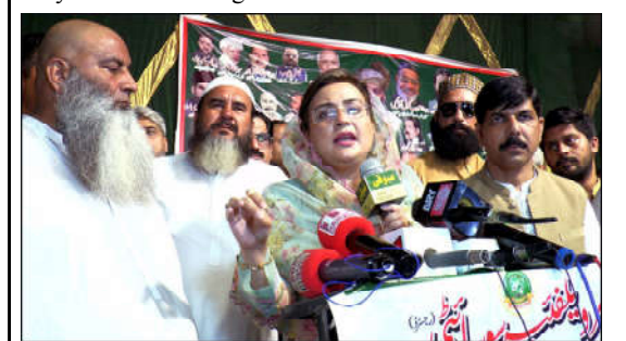
GUJRANWALA: Punjab Information Minister Azma Bukhari talking to media person on the eve of collective marriage ceremony.

The PPP stalwart criticized the PTI led provincial government for its poor governance for last 12 years, which has pushed the province to backwardness and lawlessness.