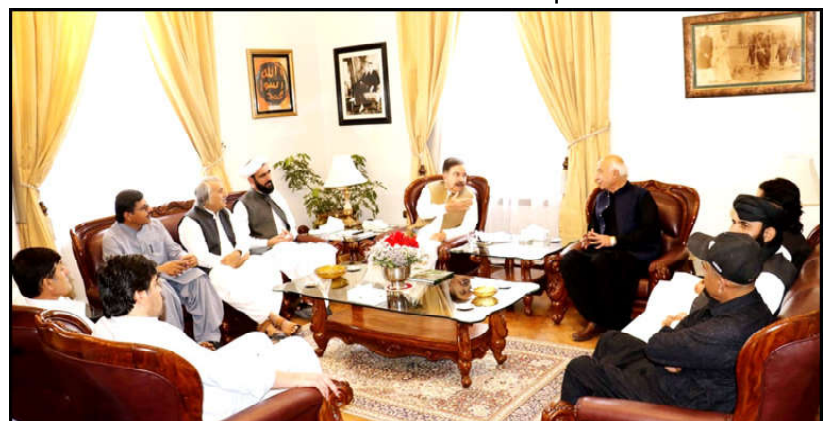
QUETTA: A delegation of Quetta Development Mahaz led by former Chief Minister Balochistan Dr. Abdul Malik Baloch meeting with Governor Balochistan Sheikh Jaffar Khan Mandokhail

The prime minister, in his remarks on the occasion, said China was a big brother and trusted friend of Pakistan, and every Pakistani citizen felt proud on its remarkable progress and development. He said he was impressed by the Chinese Premier's enthusiasm, speed of work and commitment. The reception hall was echoed by Pakistan's national songs, including "Dil Dil Pakistan", "Dil Se Maine Dekha Pakistan", "Main Bhi Pakistan Hoon", and "Jeeve Jeeve Pakistan" played by a Chinese military band.