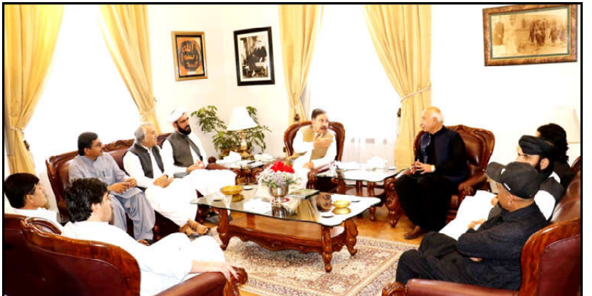
QUETTA: A delegation of Quetta Development Mahaz led by former Chief Minister Balochistan Dr. Abdul Malik Baloch meeting with Governor Balochistan Sheikh Jaffar Khan Mandokhail

tribute to Chairman Zhao for his contributions to the Chinese politics and society, and congratulated him on successfully convening the NPC's annual session. He noted Zhao Leji's important position in the Communist Party of China (CPC) and the NPC which underlined the trust placed in him by the Chinese leadership and people. He stated that the relations with China were the cornerstone of Pakistan's foreign policy. The prime minister noted that the unique and special relationship between the two countries was based on strategic trust.