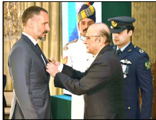
ISLAMABAD: President Asif Ali Zardari conferring the award of Nishan-i-Pakistan upon Prince Rahim Aga Khan in recognition of his services for Pakistan at Aiwan-e-Sadr.