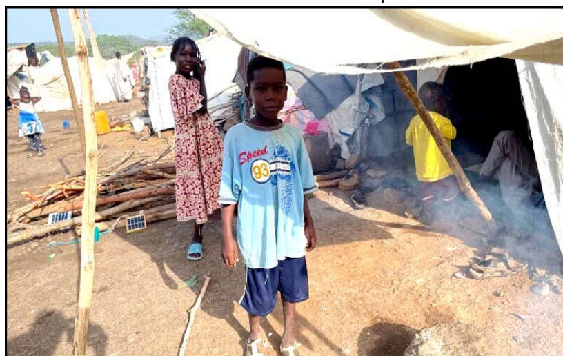
Children look on near Awlala Camp, Amhara region, Ethiopia.

The rendezvous was achieved despite an earlier loss of several guidance-control jet thrusters, some of them due to a helium propulsion leak, which Nasa and Boeing said should not compromise the mission.