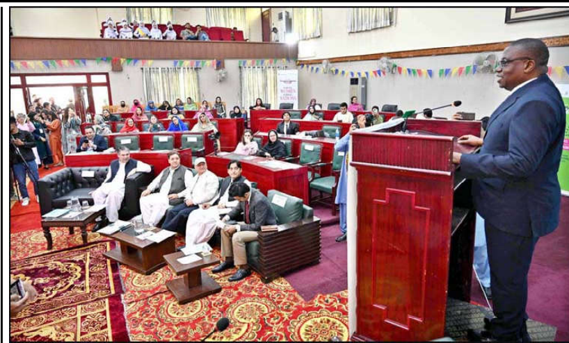
GILGIT: Country Head UN Women Lansana Wonnch addresses at the 2nd Annual Women's Summit for Strengthening Bonds, Finding Joy & Developing Collective Voice at old Assembly Building Chinar Bagh.