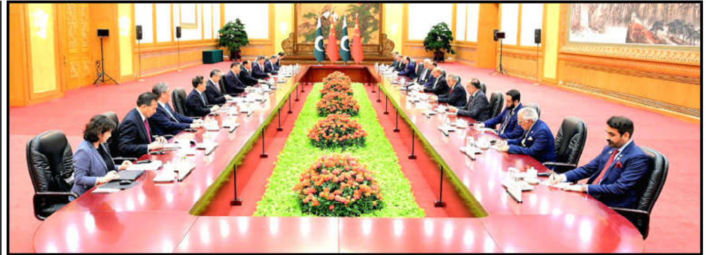
BEIJING: Prime Minister Muhammad Shehbaz Sharif meets with President of People's Republic of China, Xi Jinping.

There was a complete shutdown in the city on the third day and all markets and shops were closed.