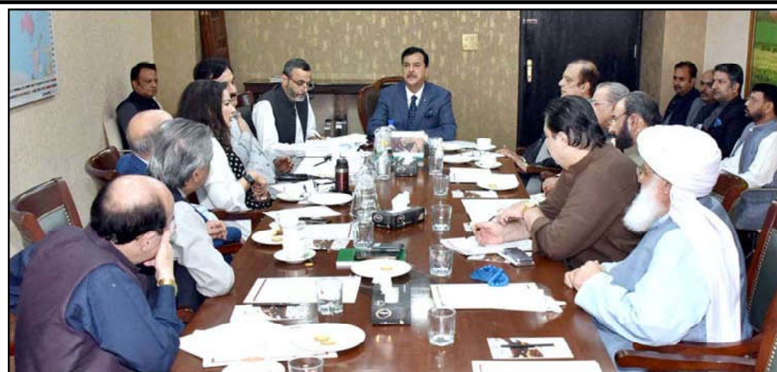
ISLAMABAD: Chairman Senate, Syed Yousuf Raza Gilani presiding over a Senate House Business Advisory Committee Meeting at Parliament House.

cally ready to make requisite amends in the formatting details of the passport giving options to the women to retain their father's name or CNIC or passport within three months of the passing of this order. "It is pertinent to observe that the government shall ensure synchronization of the record of NADRA (National Database Registration Authority), Passport and Immigration Department." The minister said as per the court's decision the