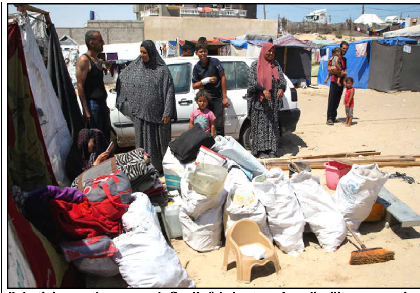
Palestinians gather as people flee Rafah due to an Israeli military operation, amid the Israel-Hamas conflict, in Rafah, in the southern Gaza Strip.

Both the army and the RSF — commanded by Burhan's former deputy Mohamed Hamdan Daglo — have been accused of war crimes, including targeting civilians, indiscriminately shelling residential areas and looting or obstructing humanitarian aid.