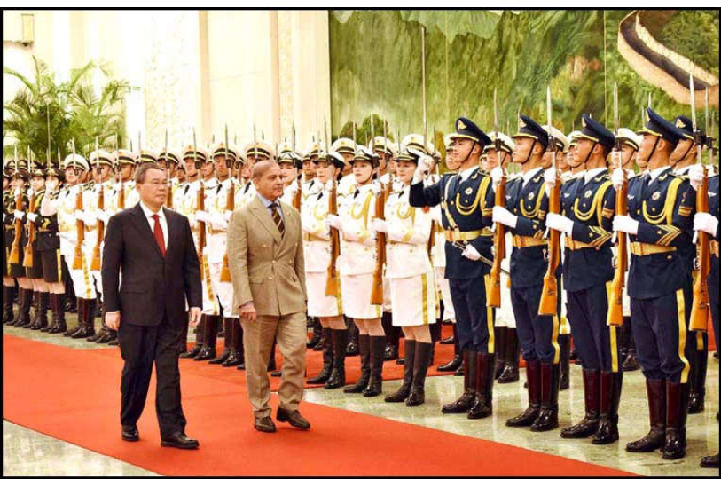
BEIJING: Prime Minister Muhammad Shehbaz Sharif is being presented with the Guard of Honor at Great Hall of the People.