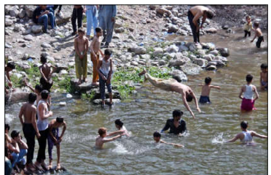
ISLAMABAD: Amid scorching heat, youth dive and splash into Rawal Dam, seeking relief from the heat in federal capital.

their pivotal role in the development and construction of the country. He said that work should be done keeping in mind the current condition and modern trends of the country and society. Designs should be made to reduce energy consumption in buildings and use of natural resources including geothermal, solar energy sources. Ashfaq Shah said that developed countries have achieved sustainable economic growth by strengthening academia-industry linkages and emphasized that we should also adopt the same approach to revive the economy. It will help in preparing the students as per the requirement of the industry.