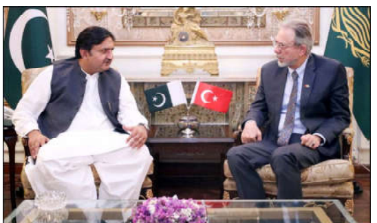
LAHORE: Ambassador of Turkey Mehmed Pacaci meeting with acting Punjab Governor Malik Muhammad Ahmed Khan at Governor House.

Furthermore, significant savings of billions of rupees were made in publication of textbooks by breaking the monopoly of certain paper mills. For the first time in history, a tradition of policy-making in consultation with all stakeholders had been established, with every step taken after gaining their confidence, the minister added.