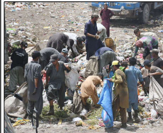
KARACHI: Garbage collectors take usable items from a dump site on the eve of World Environment Day in the Port City. World Environment Day (WED) is celebrated every year on 5 June to raise global awareness to take positive environmental action to protect nature and the planet Earth.