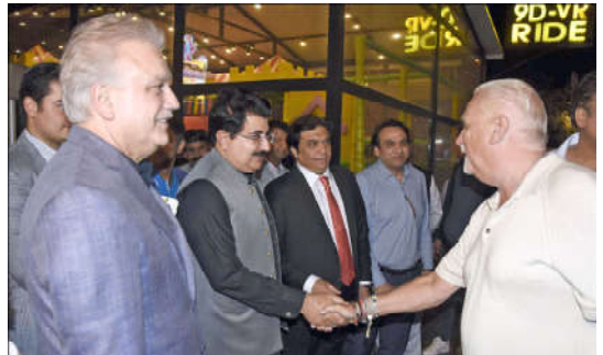
ISLAMABAD: Former Chairman Senate Sadiq Sanjrani shaking hand with the member of Pakistan Football League (PFL) UK in the reception of foreign delegation at local hotel.

ISLAMABAD (APP): A varied duration anti-Polio vaccination campaign is underway in full swing across the country where polio workers are visiting door to door to administer anti-polio drops to the children below the age of five. According to details, transit camps have also been set up at bus stops, hospitals and railway stations to administer polio drops to maximum children. During the drive, more than 16.2 million children would be administered anti-polio drops. Provincial Health Minister Syed Qasim Ali Shah talking to a private news channel said that polio was crippling diseases and it was the responsibility of all segments of the society to support the government's efforts to defeat the ailment.