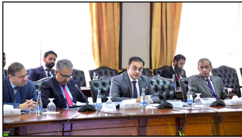
ISLAMABAD: The Federal Minister for Economic Affairs, Ahad Khan Cheema, chairs the 4th meeting of the International Partners Support Group (IPSG) at the Prime Minister's Office.