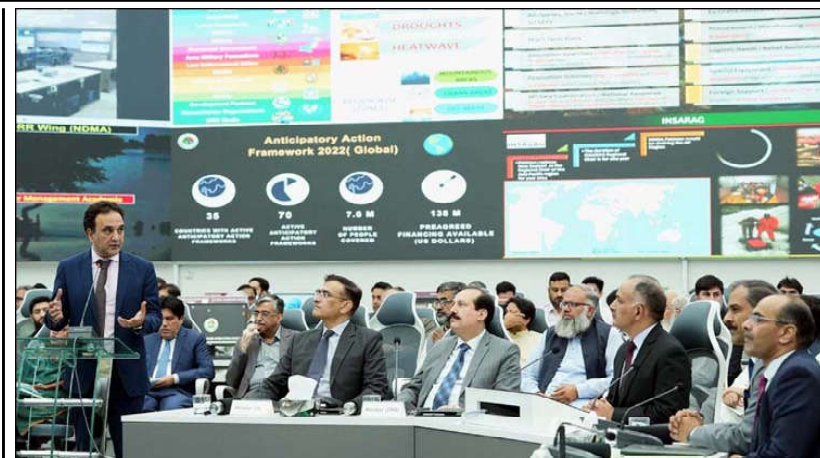
ISLAMABAD: National Monsoon Coordination Conference-2024 is underway, at National Disaster Management Authority (NDMA) Headquarters.