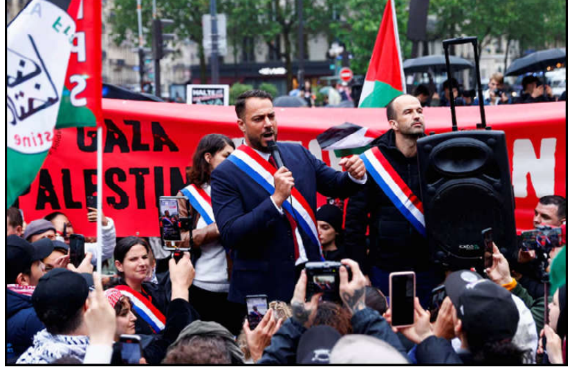
Sebastien Delogu, deputy for La France Insoumise (LFI) party attends a pro-Palestinian protest in central Paris, France.

recognise a Palestinian state, saying they bolster Hamas. Some 55 per cent of all structures in the Gaza Strip have been destroyed, damaged or possibly damaged since war erupted in the Palestinian territory eight months ago, according to preliminary satellite analysis by the UN.