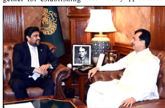
KARACHI: Chairman Senate, Syed Yusuf Raza Gilani exchanging views with Kamran Tessori, Governor of Sindh during meeting held at Governor House in Karachi.

The Pope said that his message to the people of Pakistan was peace, adding "We all should work together for establishing