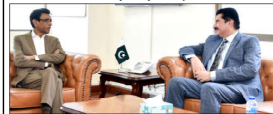
of Comsats University in D I Khan and concerned authorities were directed to prepare a feasibility report

over the subject matter. Faisal Karim Kundi also suggested to allocate admission quota for students of southern districts in Comsats University and added that he desired to create opportunities for KP youth to venture into field of information technology. He also highlighted significance of modern technology to compete in the contemporary world and to take country towards progress and development. Khalid Maqbool Siddique appreciated interest of KP Governor to empower youth and assured