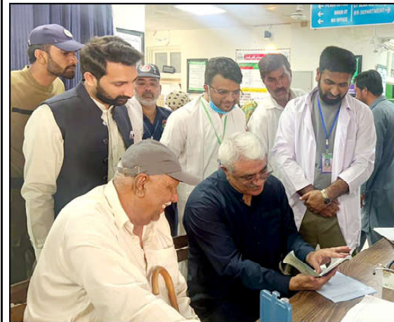
LAHORE: Provincial Health Minister and Emergency Services Khawaja Salman Rafique talking to patient during his surprise visit to Trauma Centre Tehsil Headquarters Hospital, Kalar Kahar.

RAWALPINDI (APP): Anti-Narcotics Force (ANF) in its ongoing operations against drug trafficking conducted five raids across the country and managed to recover 49 kg drugs and arrest three accused, said an ANF Headquarters spokesman here on Tuesday. He informed that 4.4 kg ice was recovered from a parcel booked for Australia at a courier office in Islamabad. 424 grams of ice was recovered from a passenger going to Doha at Islamabad Airport while 35 kg hashish was recovered from Panjgur.