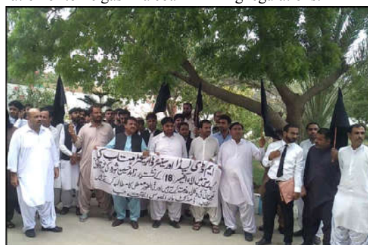
HUB: Members of District Bar Association are holding protest demonstration for acceptance of their demands, at District and Session Court premises.

Its purpose was betterment of the country. Court should exercise restraint in moving forward contempt of court proceedings. The contempt of court notice be withdrawn. Faisal Vawda presented scripts of speeches of Maulana Fazlur Rehman, Rauf Hassan and Shehbaz Sharif. His reply contains 16 pages. On the other hand Mustafa Kamal has tendered unconditional apology. Hearing of case will take place today (Wednesday).