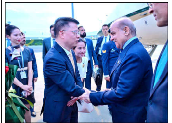
SHENZHEN: Prime Minister Muhammad Shehbaz Sharif arrives in Shenzhen on his 5-day official visit of China.

Representatives from various international organizations such as UNDP, World Bank, ADB, IMF, AIB, UNRC, EU, KfW, UNICEF, IsDB, WFP, AICS, and USAID were also present.