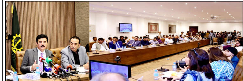
Kyber Pakhtunkhwa Governor Faisal Karim Kundi talks to office bearers and members of FPCCI during his visit to regional office FPCCI, Lahore.

ISLAMABAD (APP): Pakistan Rupee on Monday lost 04 paise against US Dollar in the interbank trading and closed at Rs 278.36 against the previous day's closing at Rs 278.32. According to the Forex Association of Pakistan (FAP), the buying and selling rates of the Dollar in the open market, however, were Rs 277.5 and Rs 280 respectively. The price of the Euro increased by 44 paise to close at Rs 301.67 against the last day's closing of Rs 301.23, according to the State Bank of Pakistan (SBP). The Japanese Yen remained unchanged to close at Rs 1.77, whereas an increase of 62 paise was witnessed in the exchange rate of the British Pound, which traded at Rs 353.85 as compared to the last day's closing of Rs 353.23. The exchange rate of the Emirates Dirham and the Saudi Riyal increased by 01 paise each to close at Rs 75.78 and Rs 74.21.