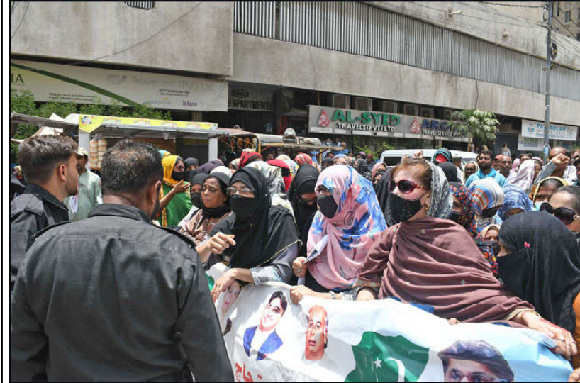
KARACHI: Primary School Teachers from Sukkur march from Karachi Press Club to CM House for their demands, protesters were prevented from entering the red zone by the police.