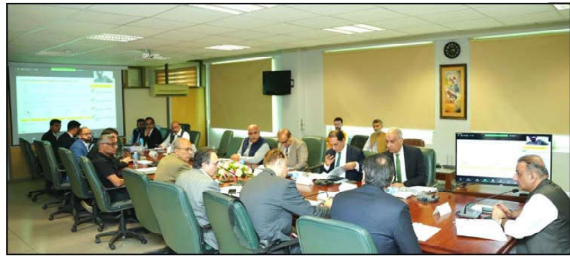
Federal Minister Abdul Aleem Khan presided meeting of Privatization Commission Board.