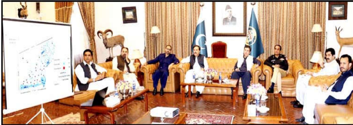
QUETTA: Governor Balochistan Sheikh Jaffar Khan Mandokhail being about law and order situation in the province