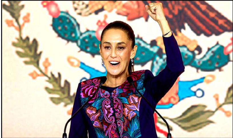
Claudia Sheinbaum, the presidential candidate of the ruling MORENA party, reacts as she addresses her supporters after winning the election, in Mexico City, Mexico.