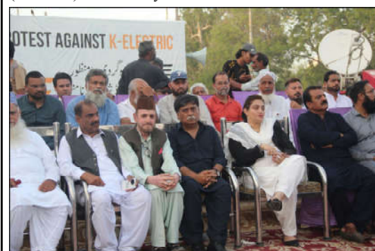
KARACHI: Workers of Mohajir Qaumi Movement participating in the protest demonstration against the worst load-shedding and over-billing of electricity in the port city.

She said that 3.6 million children in Khyber Pakhtunkhwa are out of the schools and the number is further growing. She said that a child in primary school cost Rs.5000 and Rs.7500/- per child in the public sector schools respectively. But, on the other hand private schools are providing quality education at minimal fees.