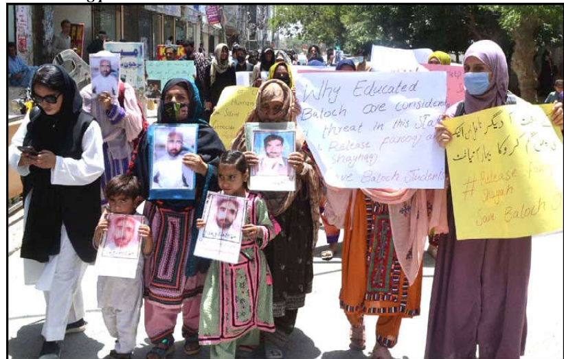
QUETTA: Relatives of missing persons are holding protest demonstration for recovery of their loved one, at Quetta press club.

The drive, set to commence today, has been rescheduled for June 8th in the districts of Nasirabad, Sibi, Jaffar Abad, Ustha Muhammad, Dera Bugti, and Sohbatpur, private news channels reported.