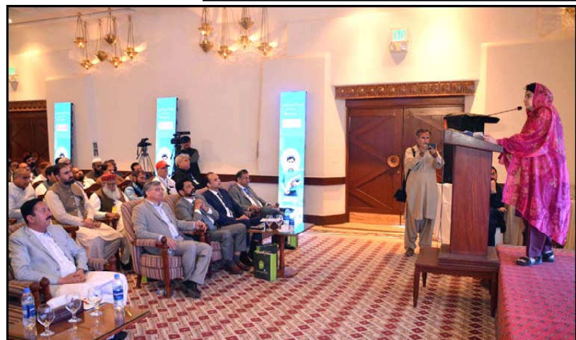
QUETTA: Provincial Education Minister, Raheela Hameed Khan Durrani addresses during seminar on Provincial Assessment of Students Learning organized by Balochistan Assessment and Examination Commission (BAEC) held at local hotel in Quetta.