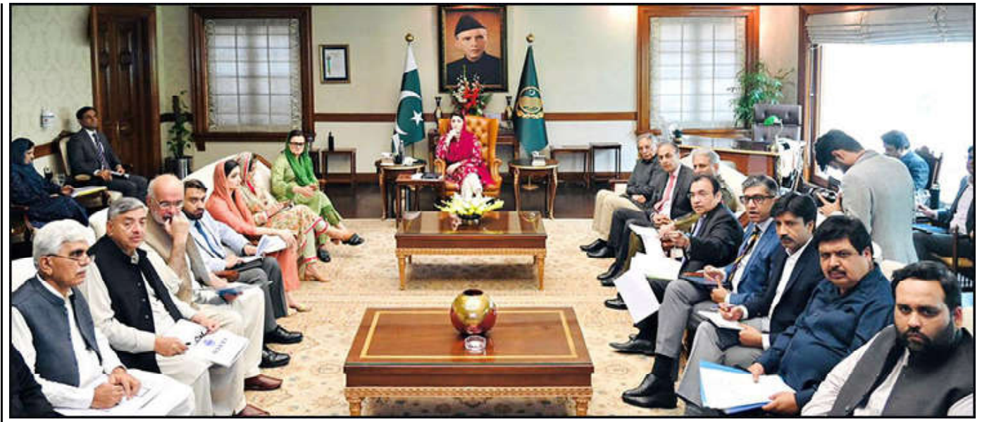
LAHORE: Punjab Chief Minister Maryam Nawaz Sharif presides over the special meeting to prevent power theft.