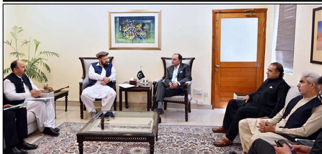
ISLAMABAD: Chief Minister Gilgit-Baltistan Haji Gulbar Khan in a meeting with Federal Minister of Finance Muhammad Aurangzeb at his office.