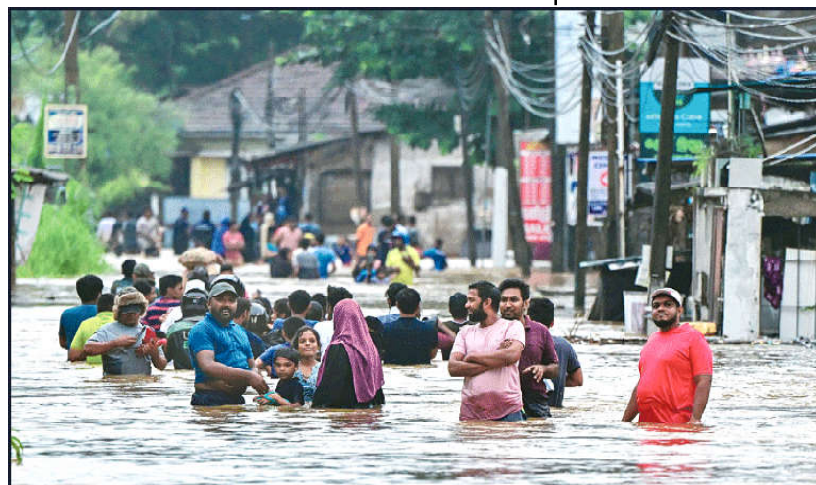
COLOMBO: Residents wade through a flooded street after heavy rains in Malwana area on the outskirts of Sri Lankan capital.

Monitoring Desk BEIJING: China held its stance on three disputed islands in the Persian Gulf on Monday despite Tehran's anger at Beijing for describing the Iran-controlled islands as a matter to be resolved with the United Arab Emirates. In a statement last week, China expressed support for the efforts of the UAE to reach a "peaceful solution" to the issue of the islands - the Greater Tunb, the Lesser Tunb and Abu Musa. The islands, claimed by the UAE and Iran, have been held by Tehran since 1971. In a rare show of anger toward its biggest trading partner, the Iranian foreign ministry on Sunday summoned the Chinese ambassador to Iran to protest China's "repeated support" for the UAE's "baseless claims". "Considering the strategic cooperation between Tehran and Beijing, it is expected that the Chinese government will re-evaluate its stance on this matter," the Iranian foreign ministry said. China's foreign ministry on Monday repeated its call for Iran and the UAE to resolve their differences through dialogue and consultation, describing China's stance on the matter as "consistent". "The relevant contents of the China-UAE Joint Statement are consistent with China's position," said Mao Ning at a regular press briefing when asked about Iran's protest, offering no revision of Beijing's stance. She added that China and Iran had a strong relationship, and that China attached great importance to the development of their strategic partnership.