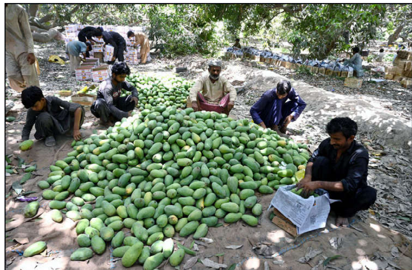
HYDERABAD: Farmers busy in sorting and packing mangoes in wooden boxes after plucking from tree in field area near Tando Jam to deliver in fruit markets.