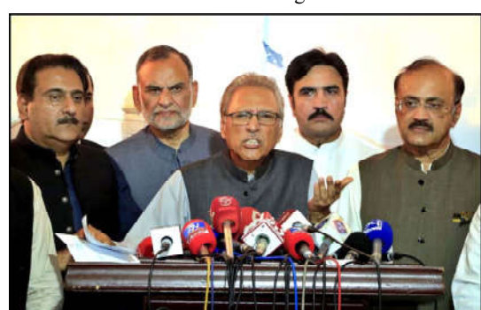
LAHORE: Former President of Pakistan and Tehreek-e-Insaf (PTI) Leader, Dr. Arif Alvi talking to media persons, at Punjab Assembly in Lahore.