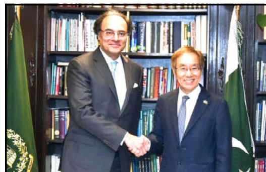
ISLAMABAD: Federal Minister for Finance and Revenue Senator Muhammad Aurangzeb in a meeting with the Korean Ambassador and Representatives of Korean Companies working in Pakistan.

He will also visit Economic and Agricultural Zones in China.