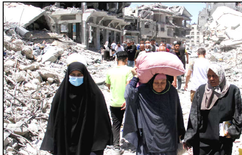
A woman carries belongings on her head, as Palestinians inspect the damage after Israeli forces withdrew from Jabalia refugee camp, following a raid, in the northern Gaza Strip.

300km, and other long-range US weapons for deep strikes inside Russia. The US is the biggest supplier of weapons to Ukraine in its battle against the full-scale invasion launched by Russian President Vladimir Putin in February 2022. Ukrainian President Volodymyr Zelensky said on Friday that Ukraine using any Western weapon to strike Russian territory is "a question of time". "I think that using any weapon, Western kind of weapon, on the territory of Russia is a question of time. Otherwise, it is not about just peace," Zelensky told reporters on a visit to Stockholm. Ukraine has stressed the urgency for the use of Western-supplied arms to conduct strikes inside Russia as it defends against Russian advances in the northeastern Kharkiv region. This spring, Ukraine found itself on the back foot in the 27-month-old full-scale invasion as it faces delays in military aid from the US, increased attacks on its energy infrastructure and Russia's push to expand the frontline.