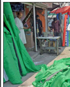
LAHORE: People are buying green net Tarpal at Landa Bazaar, in the Provincial Capital.