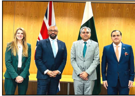
LONDON: Federal Minister for Interior Mohsin Naqvi in a group photo with Home Secretary of UK James Cleverly.

On May 15, the government had announced a welcome reduction in petrol and HSD prices for a fortnight by Rs15.39 per litre and Rs7.88 per litre, respectively.