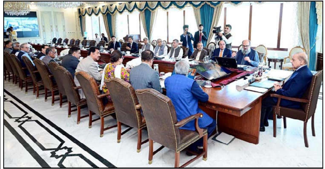
ISLAMABAD: Prime Minister Muhammad Shehbaz Sharif chairs a meeting on Pakistan Single Window Company.