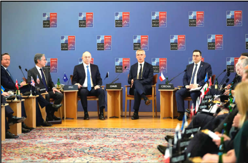
NATO Secretary General Jens Stoltenberg chairs a meeting of NATO foreign ministers, as British Foreign Secretary David Cameron, United States Secretary of State Antony Blinken, NATO Deputy Secretary General Mircea Geoana, and Czech Republic's Foreign Minister Jan Lipavsky attend, at the Czernin Palace, in Prague, Czech Republic.

spread across the country, reigniting ethnic bloodshed in the western Darfur region and forcing millions to flee in the world's largest displacement crisis. "Without an immediate and major step change, we will face a nightmare scenario: A famine will take hold in large parts of the country," read the statement also signed by UN aid chief Martin Griffiths. The war broke out as long-simmering tensions over integrating the RSF with the army came to a head. The UN special adviser on the prevention of genocide said last week there was a risk of genocide in parts of Darfur. A UN-backed report said in March that immediate action was needed to "prevent widespread death and total collapse of livelihoods and avert a catastrophic hunger crisis in Sudan".