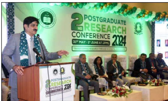
KARACHI: Chief Minister Sindh Syed Murad Ali Shah addressing 2 nd post graduate research conference at JPMC Auditorium.

The meeting was attended by special secretaries, additional secretaries, and other key health officials through video link.