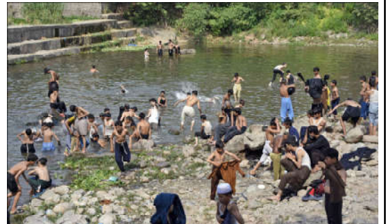
ISLAMABAD: A large numbers of youngsters are bathing in the water on a hot summer day in the Federal Capital.

He said that the seminar was attended by SSP Traffic Muhammad Sarfraz Virk, representatives from the Ministry of Health, the education team of Islamabad Police, and medical students. Participants were further informed to avoid smoking and other toxic substances in daily life, exercise regularly, and undergo regular monthly medical check-ups to prevent diseases. Following the awareness seminar, a walk was also organized, and SSP Traffic along with the students distributed awareness pamphlets to citizens.