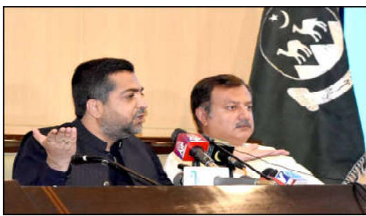
Secretary on Friday afternoon.

He said that the arrested culprits have confessed their crime in their statement recorded. According to their statement, they were given the task of murdering the "Punjabi labourers" who come in Gwadar, stated the Minister Home while addressing a hurriedly called press conference at the Sikandar Jamali Auditorium, Civil