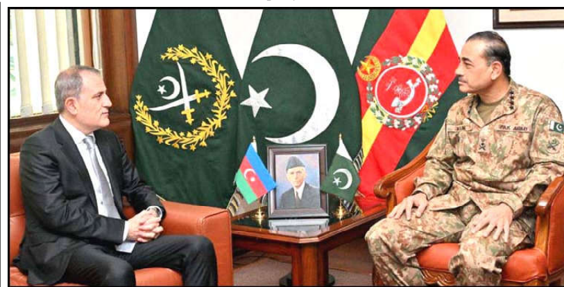
RAWALPINDI: The Foreign Minister of Azerbaijan, Jeyhun Bayramov, called on General Syed Asim Munir, NI (M), Chief of Army Staff (COAS), at the General Headquarters (GHQ).