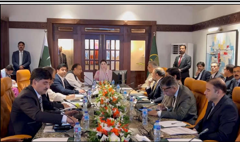
LAHORE: Punjab Chief Minister Maryam Nawaz presides over the special meeting to review price control and other matters.