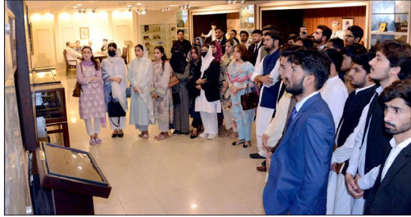
Students and faculty members of the International Islamic University, Islamabad visiting Senate Museum at Parliaments House, Islamabad.

ISLAMABAD (APP): Saudi Arabia's General Directorate of Civil Defense is exerting tremendous efforts through the 30 centers. It set up at the land crossings and highways leading to Makkah and Madinah during this year's Hajj season to ensure the safety and security of pilgrims, SPA reported. The 30 centers work to implement the general plan to deal with emergency situations, support the main civil defense centers in those locations, and undertake preventive measures and field operations to provide the highest levels of security and safety in cooperation with the relevant authorities.