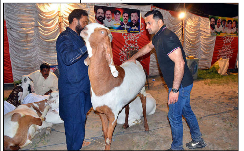
FAISALABAD: A man displayed a goat during 26th All Pakistan Beautiful Goat Competition, At Arid Agriculture University in the city.