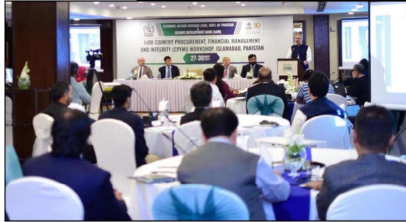
ISLAMABAD: IsDB Organizes Country Procurement, Financial Management and Integrity Workshop in Islamabad.