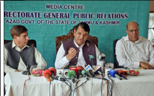
MUZAFFRABAD: Federal Minister for Kashmir Affairs and Gilgit Baltistan Engineer Amir Muqam addressing a press conference at press club in the city.

political recommendations or personal likes and dislikes would not be tolerated in the disbursement of social security funds. Each and every penny of Zakat funds must be spent on the wellbeing of needy and poor people, by giving priority to orphans, widows and persons with disabilities, he instructed. The CM also directed to provide standard electric wheelchairs to the needy persons. He said that the disable persons already registered with the department, and they should be given priority in this regard. He further directed to ensure representation of at least three female members in every forum of Zakat Committees. On this occasion, the participants of the meeting agreed with the proposal regarding creation of Philant.