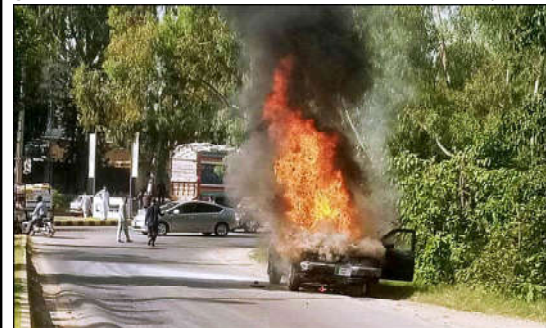
ISLAMABAD: A view of car engulfed in flames after a fire erupts at H-9 in the Federal Capital.

will pursue dialogue with Pakistan," Abdullah affirmed. "Even though I have been labeled as a Pakistani, Khalistani, and American agent, I will not cease to advocate for dialogue between India and Pakistan." "The IIOJK will not be fine until these two big countries realize that war is no longer the way forward," Abdullah called for international investigation into recent shooting incidents, saying, "International pressure must be created, and international investigating agencies must probe the matter." He expressed his desire for assembly elections, stating, "I think Assembly elections will take place after the Amarnath Yatra concludes this year."