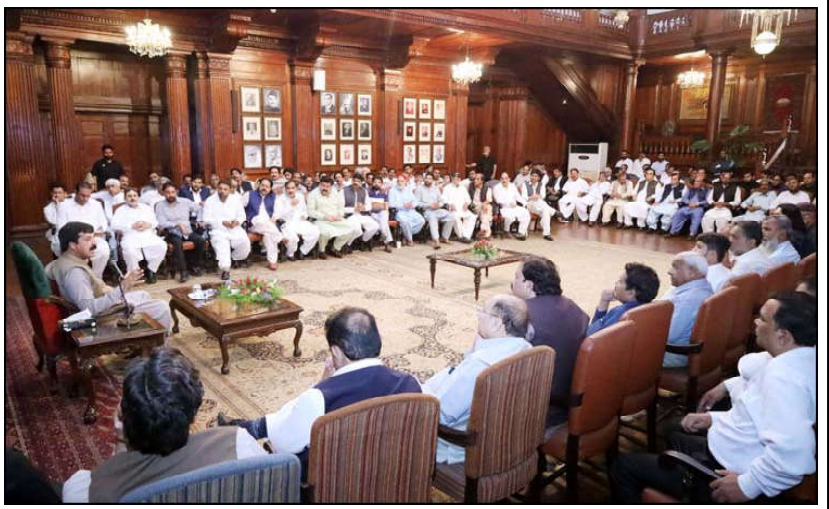
LAHORE: A delegation of Pakistan Peoples Party Lahore Division called on Punjab Governor Sardar Saleem Haider Khan at Governor House.