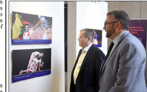
LAHORE: French Ambassador to Pakistan Nicolas Galey looking at a photograph during France Olympic Games photograph exhibition at Al-Hamra hall, in the Provincial Capital.

The delegation expressed gratitude to Governor for his hospitality and lauded the efforts of government to preserve artifacts of Buddha era in various areas of the province.