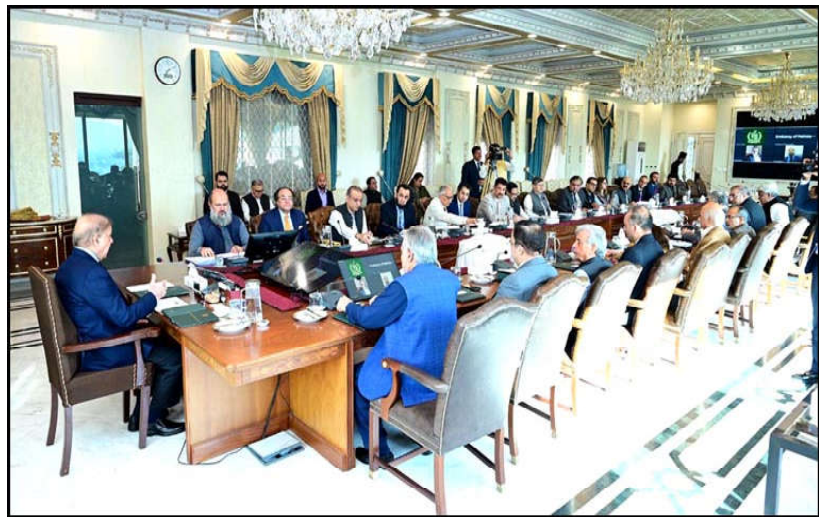
ISLAMABAD: Prime Minister Muhammad Shehbaz Sharif chairs a review meeting on preparation of his upcoming visit to China.

Ph: 2841470/2841473 REG: No. BC-116 B/ID-445 Vol XXV No 281, Zeeqad 23, 1445 AH Saturday June 01, 2024 Pages 08, Price Rs.15