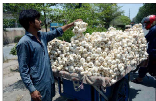
FAISALABAD: A vendor displaying Garlic to attract the customers at roadside setup.