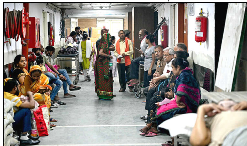
People seen at an emergency ward of the Ram Manohar Lohia hospital in New Delhi.

Executive Engineer (Roads) CWPP&H Department District Pishin PRQ No.2727/31-5-2024 www.dpr.gov.pk @dpr_gob @dpr_gob @dpr_balochistan