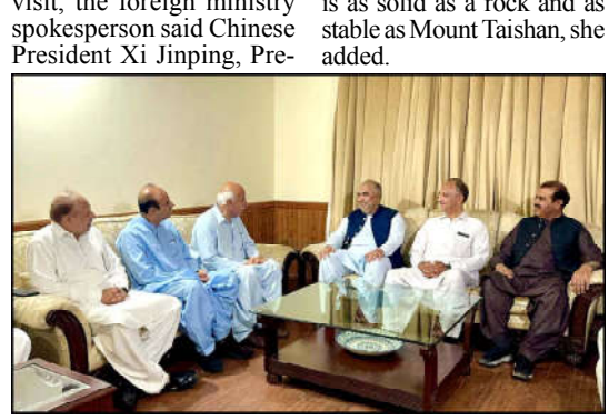
ISLAMABAD: Leadership of Tehreek Tahafuz Aine-Pakistan meeting with President National Party Dr. Abdul Malik Baloch

PM Shehbaz Sharif will also visit Guangdong and Shaanxi provinces. Mao Ning pointed out that China and Pakistan are all-weather strategic partners and "iron-clad" friends. China-Pakistan friendship has been tested by the winds and clouds of the times, and is as solid as a rock and as stable as Mount Taishan, she added.