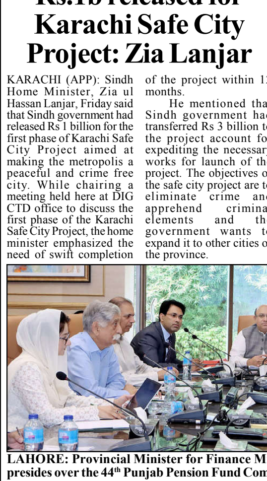
LAHORE: Provincial Minister for Finance Mujatba Shuja-ur-Rehman presides over the 44 th Punjab Pension Fund Committee meeting.