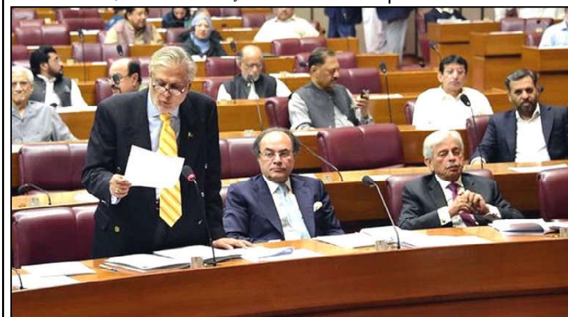
ISLAMABAD: Deputy Prime Minister and Foreign Minister Muhammad Ishaq Dar addressing the National Assembly.

The bodies and injured were shifted to hospital and police after registering a case against truck driver started investigations.