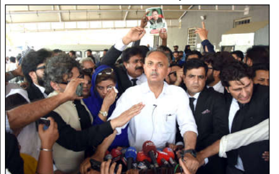
ISLAMABAD: Opposition Leader in the National Assembly Omar Ayub Khan talking with media persons outside district court in the Federal Capital, as the court rejects Imran Khan, wife appeal in unlawful marriage case.

Similarly, exports of chilies have expanded exponentially.