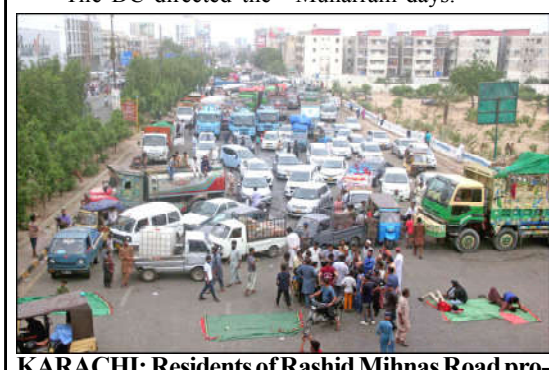
KARACHI: Residents of Rashid Mihnass Road protesting against the shortage of water by blocking the road.