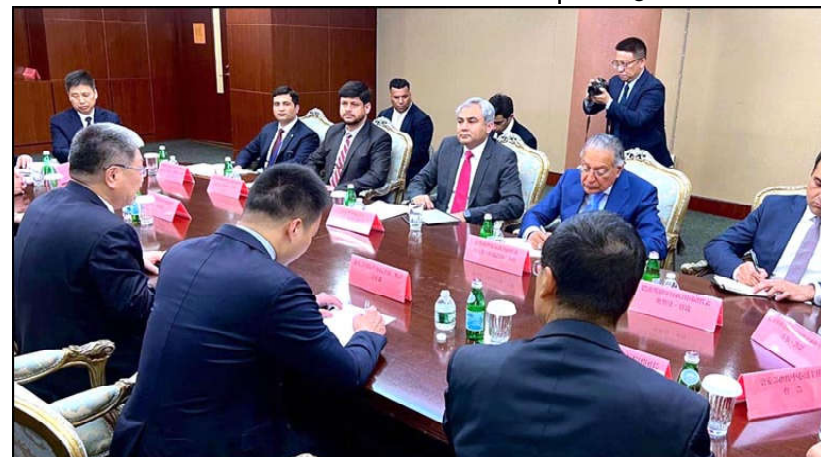
NEW YORK: Federal Minister for Interior Mohsin Naqvi attending meeting with his counterpart from the People's Republic of China Qi Yanjun.

On June 13, IHC's Justice Mian Gul Hassan Aurangzeb ordered the sessions court to decide the petitions seeking suspension of the sentence within 10 days and the main appeals within a month.