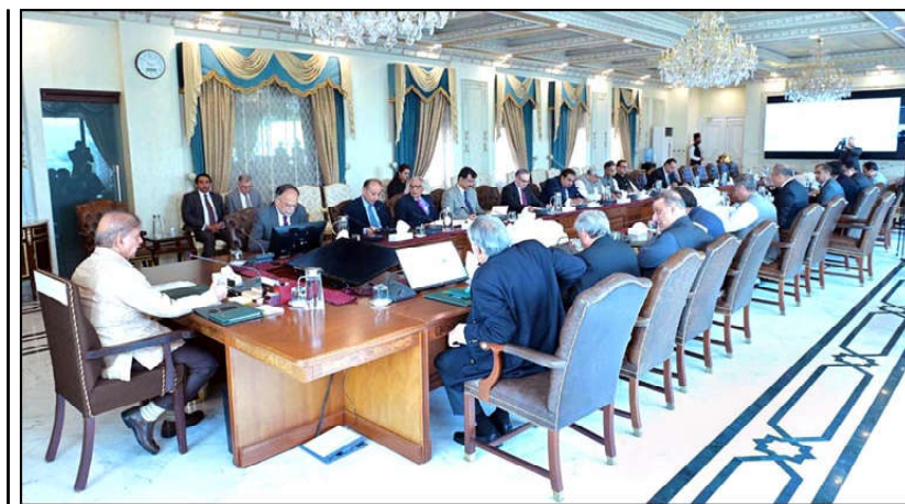
ISLAMABAD: Prime Minister Muhammad Shehbaz Sharif chairs a meeting regarding promotion of Pakistan-Azerbaijan economic ties.

He said that Pakistan believed in constructive dialogue and engagement based on mutual respect and understanding. Such resolutions, he noted, were neither constructive nor objective.