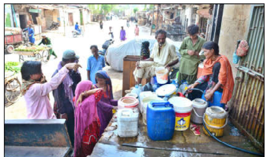
HYDERABAD: People fill their water cans with clean water from a pipeline for domestic use at Makrani Para.

SUKKUR (APP): Trade Development Authority of Pakistan (TDAP) Sukkur, organized a consultative session on Banana and Dates product of Khairpur to assess the actual potential and challenges faced by the stakeholders. The event was collaborated by Khairpur Chamber of Commerce & Industries (KCCI), Sindh Chamber of Agriculture Khairpur (SCA), Sindh Abadgar Foundation Khairpur (SAF), Date Palm Research Institute (DPRI), and Banana Research Institute (BRI) Khairpur on Thursday. The organizers of the event explained audience that the objective of such sessions is to connect and unite the concerned stakeholders who may identify structural flaws in their products. The audience of growers, traders, processors, exporters and technical experts highlighted various issues available with these products at almost all stages. The man made issues like lack of good agriculture practices, limited and traditional varieties, unskilled labor, less educated growers, lack of pre & post harvesting techniques, improper tools, non-feasible infrastructure, inadequate transport, shortage of cold storages, lack of mechanization.