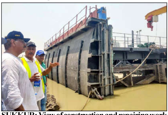
SUKKUR: View of construction and repairing work of damage to gates No 44 and 47 of Sukkur Barrage while the Kisan Gate (temporary gate) to the barrage for replace damaged gates of Sukkur Barrage in Indus River, in Sukkur.