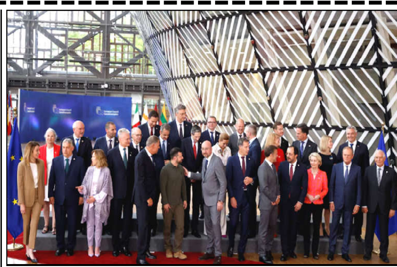
Ukrainian President Volodymyr Zelenskyy and European leaders attend a family photo session, during the European Union leaders' summit in Brussels, Belgium.

ing a Canadian warning from the day before, "urgently requested" its citizens in Lebanon leave the country. "The current heightened tensions in the border area with Israel could escalate further at any time," updated foreign ministry advice in Berlin said. UN humanitarian coordinator Martin Griffiths told reporters in Geneva on Wednesday that Lebanon was "the flashpoint beyond all flashpoints". "It's beyond planning. It's potentially apocalyptic," warned Griffiths, whose term ends this week. A war involving Lebanon "will draw in Syria... it will draw in others", he added. "It's very alarming." Lebanon's national news agency reported about 10 Israeli strikes on areas near the border on Wednesday, including one around 10:00 pm that destroyed a building in Nabatiyeh, wounding five people.