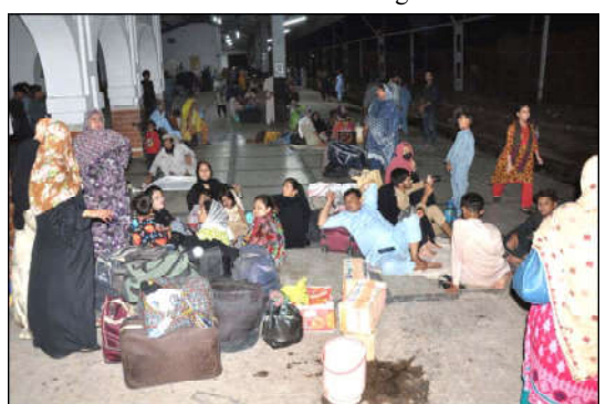
HYDERABAD: Passengers with their bags gather at platform as trains are late from their original schedules at Railway Station in Hyderabad.