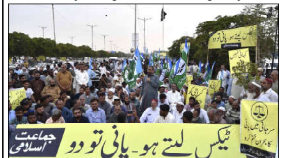
KARACHI: Activates of jamat e islami hold protest at Shar e Faisal.