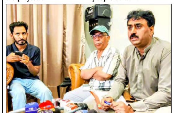
SUKKUR: Provincial Minister, Jam Khan Shoro is addressing a press conference regarding the Sukkur Barrage, in Sukkur.

The PM assured the delegation for enhancing funds in respect of both of the projects.