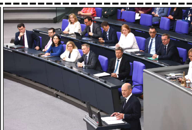
German Chancellor Olaf Scholz delivers a government declaration in parliament on the upcoming EU and NATO summits in Berlin, Germany.

Citing figures from UN children's agency Unicef, he said that figure "does not even include the arms and the hands, and we have many more" of these. "Ten per day, that means around 2,000 children after the more than 260 days of this brutal war," Lazzarini said. He said amputation often takes place "in quite horrible conditions", sometimes without anaesthesia. The UN's Rome-based World Food Programme, meanwhile, said a new report "paints a stark picture of ongoing hunger." The latest Integrated Food Security Phase Classification (IPC) partnership said its March warning of imminent famine in north Gaza had not materialised. "However, the situation in Gaza remains catastrophic and there is a high and sustained risk of famine across the whole Gaza Strip," the report said, warning against complacency.