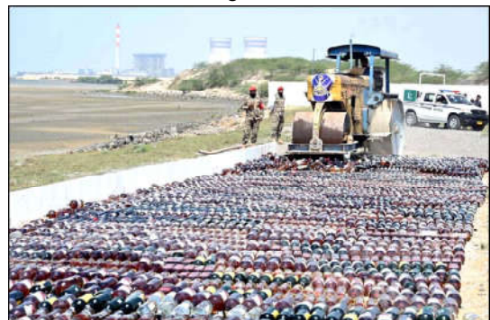
KARACHI: View of destroying liquor bottles and burning pile of confiscated drugs during Drug Destruction ceremony organized by Pakistan Coast Guards in connection of International Day against Drug Abuse and Illicit Trafficking held in Karachi.

The minister also addressed concerns over rural security and improvements in motorway operations, stressing targeted police actions despite resource limitations. He mourned recent police casualties and called for enhanced security measures in Kashmore and Karachi.