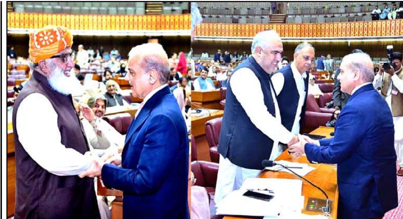
ISLAMABAD: Prime Minister Muhammad Shahbaz Sharif interacting with leaders of SIC Asad Qaiser, Umar Ayub and JUI Chief Maulana Fazlur Rehman during National Assembly session.

Prime Minister Shehbaz said that other PML-N leaders like Khawaja Muhammad Asif and Rana Sanaulallah also faced humiliating treatment despite being the under-trial prisoners.