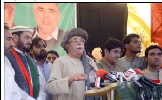
PESHAWAR: Pashtunkhwa Milli Awami Party (PKMAP) Chairman, Mahmud Khan Achakzai addressing during Tribal Aman Jirga arranged by Tehreek-e-Insaf (PTI) in Peshawar.

The AGP said, "Independent candidates can join the political parties that have representation in the Parliament."