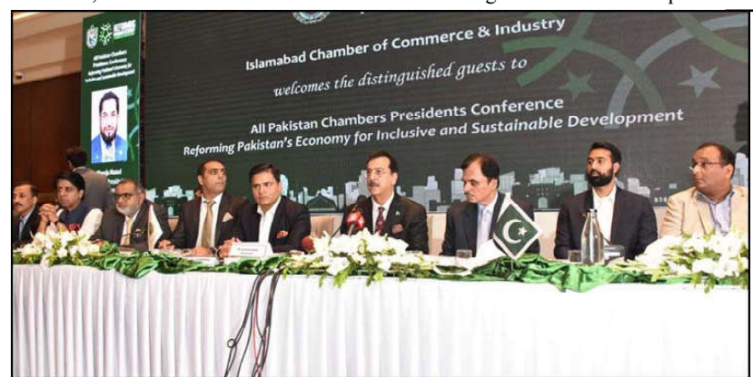
Chairman Senate, Syed Yousuf Raza Gilani addressing the all Pakistan Chambers Presidents Conference "Performing Pakistan's Economy for Inclusive and Sustainable Development" organized by Islamabad Chamber of Commerce and Industry in Islamabad.