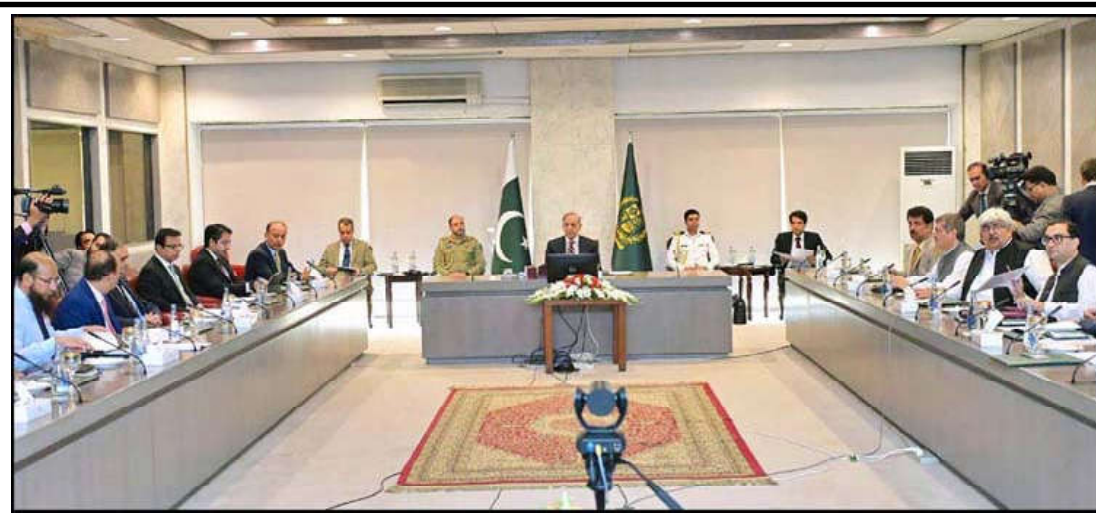
ISLAMABAD: Prime Minister Muhammad Shehbaz Sharif chairs a meeting on matters related to Petroleum Division.

The Petroleum Division authorities said that steps were being taken to enhance competitiveness in the petroleum sector, promotion of bio-fuels.