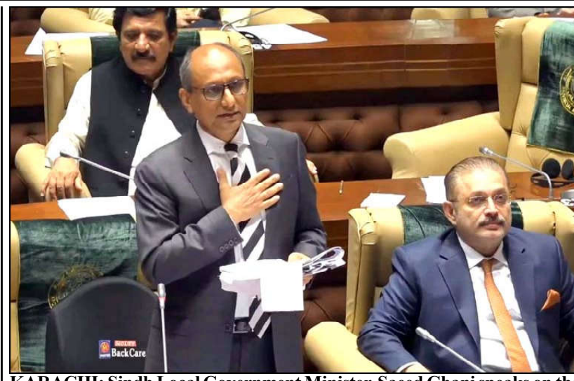
KARACHI: Sindh Local Government Minister, Saeed Ghani speaks on the floor of the assembly, at Sindh Assembly in Karachi.

and local investment. Reflecting on past challenges, the minister highlighted the steep costs incurred due to political and policy instability over the past 75 years. He urged both the public and private sectors to collaborate in overcoming these challenges and achieving sustained growth and development. Regarding resource constraints, he indicated that the government would encourage public-private investments in development projects to bridge funding gaps and meet development needs, underscoring the difficulty in earmarking sufficient funds for development alone. Ahsan Iqbal also said that Pakistan-China Economic Corridors Project entered in second-phase. He said that commencing an upgraded version of CPEC Phase-2 with five corridors focusing on growth, livelihood, information technology, green economy, and regional development.