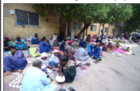
KARACHI: Patient attendants, who were came from shade of tree of Sindh province, rest under the shade of tree during the hot weather, at civil hospital premises in Karachi.

He pointed out the exploitation since Pakistan's formation, mentioning the thousands of miles of railway lines consumed, marble from Mohmand, and the gold-filled lands of Waziristan. He urged President Zardari to ensure that the natural resources benefits go to the local people.