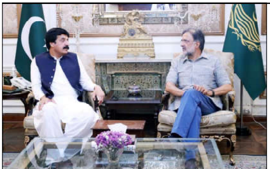
LAHORE: Senior leader of Pakistan People's Party, Qamar Zaman Kaira, called on Governor Punjab Sardar Saleem Haider Khan at Governor House.

SOS Children's Village Lahore. It is pertinent to mention here that the Governor Punjab had announced a donation of one million rupees during his visit to SOS Children's Village Lahore on the day of Eid-ul-Azha. Speaking on the occasion, Governor Punjab Sardar Saleem Haider Khan said that it is our national duty to serve the destitute and orphan children. Governor Punjab said that Islam also teaches us to treat helpless children with compassion and love. He said that we should collectively contribute to make such children responsible citizens of the society.