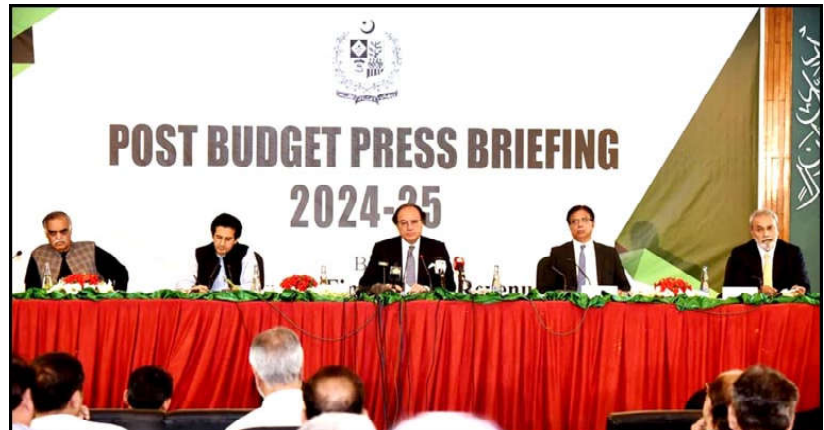
ISLAMABAD: Finance Minister Senator Muhammad Aurangzeb addressing media persons at the Post Budget 2024-25 Press Conference along with Minister of State for Finance & Revenue Ali Pervaiz Malik.

ISLAMABAD (APP): Reiterating the pressing need for digitization and broadening of tax base, Federal Minister for Finance and Revenue, Senator Muhammad Aurangzeb asserted here on Thursday that below 10 percent tax to GDP ratio was not sustainable for managing country's economy. "We have to take it up to 13 percent in next three years gradually," the minister said while addressing the post-budget press conference, adding as per the international bench marks, no country could sustain at 9.5 tax to GDP ratio base without external assistance. Hence, there is a dire need to enhance tax to GDP ratio, the minister said. The minister was flanked by State Minister for Finance, Ali Pervaiz Malik, Secretary Finance, Imdad Ullah Bosal and Chairman Federal Board of Revenue (FBR), Amjad Zubair Tiwana. Aurangzeb underscored the importance of doing away with undocumented economy with end-to-end digitization to reduce human intervention as much as possible and make the tax mechanism transparent and mitigate chances of corruption. The minister admitted that the Federal Board of Revenue (FBR) could not do compliance and enforcement to the extent it should have done. He said, the government had introduced progressive taxes in the federal budget for upcoming fiscal year 2024-25 to impose more tax on high income earners.