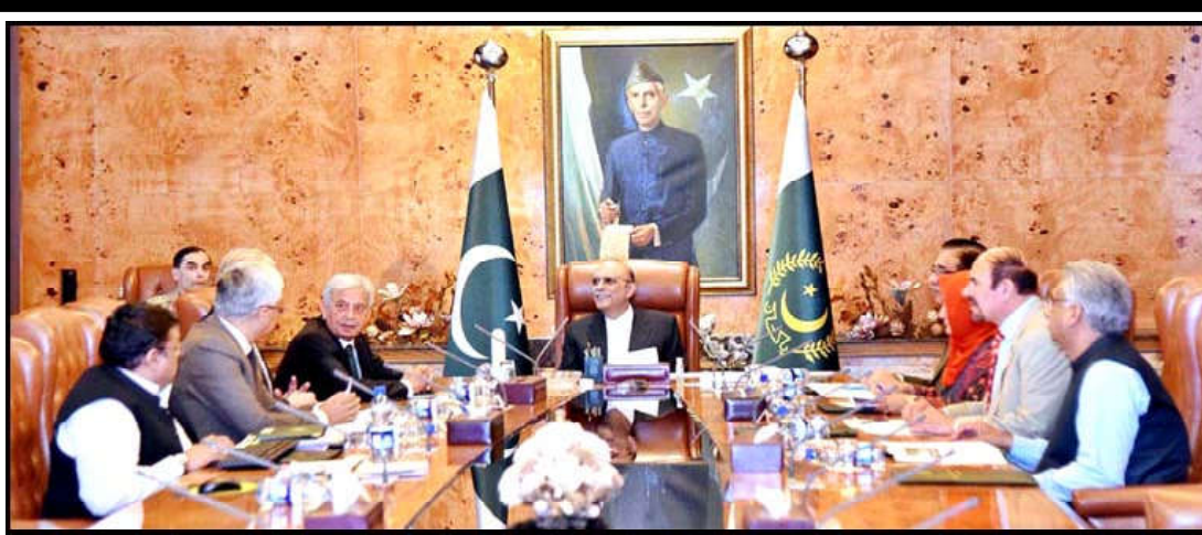
ISLAMABAD: President Asif Ali Zardari chairing a meeting to discuss issues related to wheat procurement in the country, at Aiwan-e-Sadr.