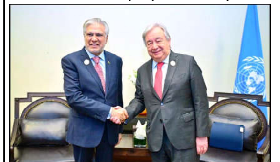
JORDAN: Deputy Prime Minister and Foreign Minister Senator Muhammad Ishaq Dar meets with UN Secretary General, Antonio Guterres on the sidelines of the high-level conference on "Urgent Humanitarian Response for Gaza".

The Mayor said that we want to work equally in all areas of Karachi, he said that today this resolution has been a great success with the approval and this council of 2024 will always be remembered. He said that no land, no property of KMC is being given to anyone and, all the lands will remain the property of KMC but work will be continued under public-private partnership for the improvement and development of the city.