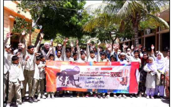
KARACHI: Sindh Human Rights Commission and Society for the Protection of the Rights of the Child, hold a walk taken out from the Scout Headquarters on the occasion of Child Labor Day.