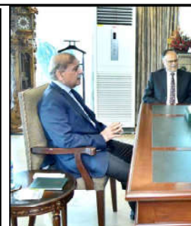
ISLAMABAD: Prime Minister of Pakistan, Muhammad Shehbaz Sharif, called on President Asif Ali Zardari, at Aiwan-e-Sadr, Federal Minister for Planning Development and Special Initiatives, Prof Ahsan Iqbal, is also present on the occasion.

Sources said Prime Minister Shehbaz Sharif has approved the summary forwarded by the Cabinet Division. The development comes as Pakistan will celebrate Eid ul Adha on June 17 after the Zil Hajj moon was sighted on June 7 last week.