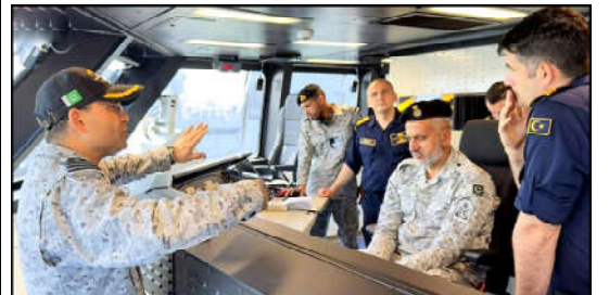
GOLCUK: Officials of Turkish Naval Forces being briefed onboard PNS BABUR at Golcuk Naval Base, Turkey.

ISLAMABAD (APP): In this phase, five new corridors were announced, including the Corridor of Growth, Livelihood, Innovation, Green Corridor, and a Regional Cooperation Open Corridor to work on, he added. The 5Es framework will be implemented, including Export, Energy, Equity, E-Pakistan, and environment, aiming at growth, livelihood, innovation, green development, and regional cooperation, he said. He said that creating safe investment environments and a dependable energy supply was important to draw in foreign investors and set Pakistan up for an industrial revolution with China's help. He highlighted the significant benefits of the CPEC and said that one of the most notable achievements is the installation of 8000 megawatts of electricity, which has helped alleviate the load-shedding issue in Pakistan. Ahsan Iqbal said that the second phase of the China-Pakistan Economic Corridor (CPEC) was pivotal for Pakistan's economic development.