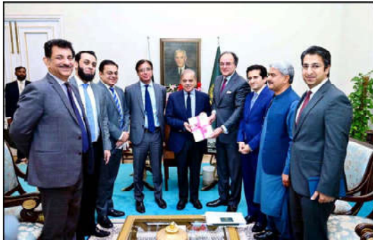
ISLAMABAD: Federal Minister for Finance and Revenue Muhammad Aurangzeb presenting a copy of Economic Survey of Pakistan 2023-2024 to Prime Minister Muhammad Shehbaz Sharif prior to its official launch.

ISLAMABAD (APP): The Supreme Court on Tuesday ordered closure of all restaurants, including Monal, running in the area of Margalla Hills National Park (MHNP). A three-member bench of the apex court, headed by Chief Justice Qazi Faez Isa, in its orders in the petitions filed by Monal Restaurant and the Wildlife Department, directed the authorities to close down all the restaurants within the period of three months as their leases stood terminated. The court declared that the commercial activities were not allowed in the area of National Park to protect the natural environment. It further said that the restaurants would have priority if the leases were granted outside the National Park area. The court observed that all unnecessary notices served to the restaurants running in other areas stood terminated as in the instant case it was focusing only to the extent of MHNP. During the hearing, Chief Justice of Pakistan Qazi Faez Isa asked the lawyer of Monal Restaurant to give a time frame for shifting their infrastructure voluntarily, otherwise, the court would issue orders of its sealing. The advocate prayed the court to grant a four-month time for the task. The court, however, approved three months for the shifting of Monal Restaurant. The chief justice remarked that the Capital Development Authority (CDA) had also included the Pak-China Friendship Center, Sports Club, Arts Council and National Monument in its report pertaining to the structures in the National Park.