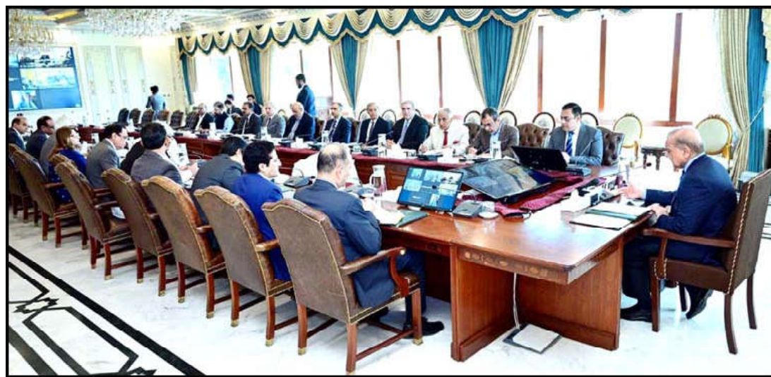
ISLAMABAD: Prime Minister Muhammad Shehbaz Sharif chairs a meeting regarding load shedding, the anti-power theft campaign and reforms in the power sector.

In the meeting, DIGP SPU provided an in-depth briefing on the current security measures and strategies implemented for the protection of Chinese nationals at the provincial level. The meeting, held at the Central Police Office in Karachi, was attended by several high-ranking officials, including the Additional IGP Karachi and DIGPs from the Counter-Terrorism Department, Special Branch, SPU, Headquarters, Traffic, South Zone, Training.