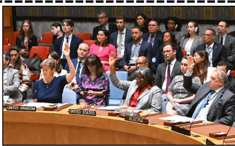
US Ambassador to the United Nations Linda Thomas-Greenfield votes during a UN Security Council meeting on the situation in the Middle East at UN headquarters in New York.