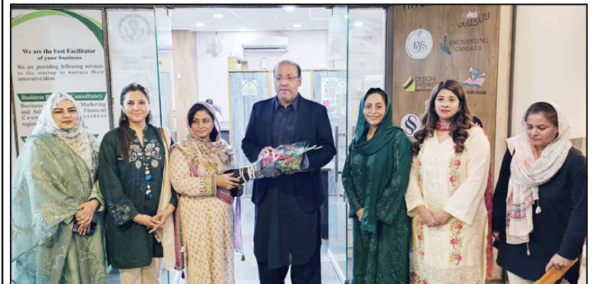
LAHORE: Punjab Minister for Industries and Commerce Chaudhary Shafay Hussain being welcomed during his visit to Women Resource Centre.

stated that first orders for acting vice chancellors in seven top universities were issued against legal norms and later its summary was sent to the Governor House for approval that was returned back with an objection of being unlawful. The Governor said that seeing this kind of education system in Khyber Pakhtunkhwa was a matter of great concern. Despite completion of selection of vice chancellors by academic search committee for 24 universities, he said that the appointments have not been made and a letter was written to CM KP to complete the appointment process quickly to take these universities out of administrative and educational crisis.