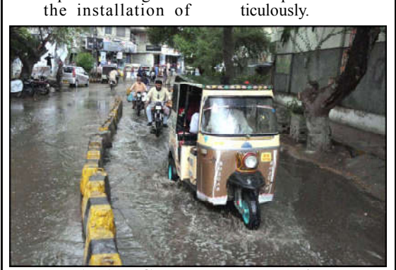
HYDERABAD: Commuters make their way to a road amid rain showers, in Hyderabad.