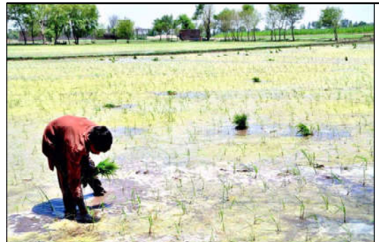
SARGODHA: A farmer busy in planting saplings of rice in his field along Shekan Road.