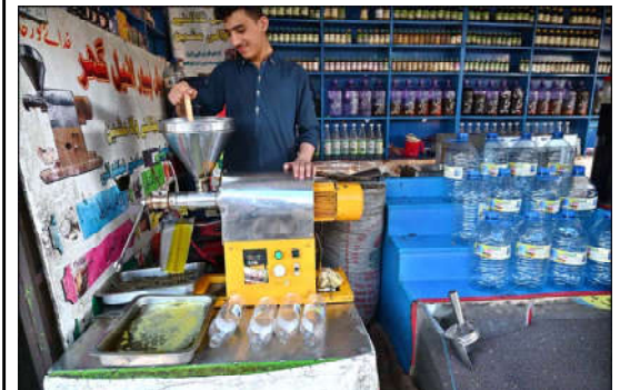
ISLAMABAD: A vendor busy in extracting mustard oil at his stall in weekly Sunday Bazaar, H-9 Sector.

Malik Imran Ahmad country head Campaign for Tobacco-Free Kids (CTFK) said, "Higher taxes on tobacco products can lead to increased revenue for the government. Pakistan currently holds the highest proportion of young people, as 64% of the total population of Pakistan is below the age of 30.