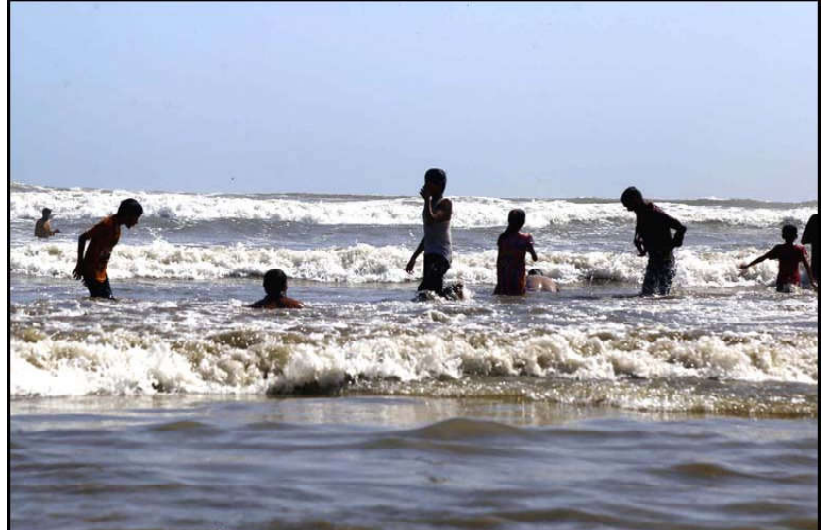
KARACHI: A large number of citizens are enjoying and cooling themselves during the hot weather of summer season, at Sea View Beach in Karachi.

PESHAWAR (INP): Tug of war between Governor Khyber Pakhtunkhwa Faisal Karim Kundi and Chief Minister Ali Amin Gandapur continues and former challenges latter for debate. Talking to media persons in Peshawar on Sunday, the Governor KP said that Gandapur could debate with him on any channel of his choice. Faisal Karim Kundi said that the chief minister was talking like this to secure a job.