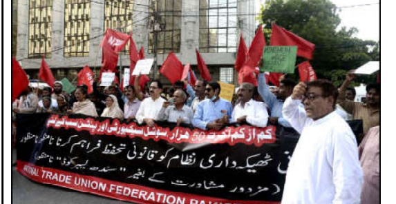
KARACHI: Members of National Trade Union Federation (NTUF) are holding protest demonstration for acceptance of their demands, at Karachi press club.

ployment of police commands and personnel at these locations. Lanjar directed to establishment of wireless control rooms at zonal, district, and police station levels to coordinate security efforts. He said that a comprehensive security plan to prevent potential security threats and ensure peace and order during Eidul-Azha be implemented. The home minister emphasised the need for close coordination and co-operation among all stakeholders including law enforcement agencies, religious leaders and the public to ensure a peaceful and secure Eidul-Azha.