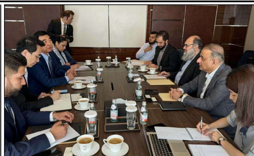
BEIJING: Federal Minister for Communications, Privatization and Investment Board, Abdul Aleem Khan presiding a high level meeting with the officials of Chinese Business group.

The department urged citizens to cooperate and informed about illegal use of gas at phone number 0619220085 as secrecy would be maintained.