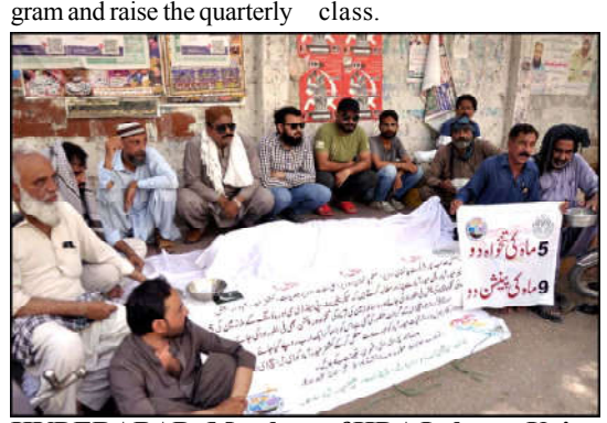
HYDERABAD: Members of HDA Labourers Union are holding protest demonstration against non-payment of their dues salaries and pensions, at Hyderabad press club.