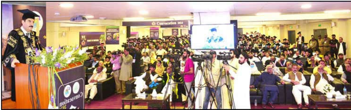
PESHAWAR: Khyber Pakhtunkhwa Governor Faisal Karim Kundi addressing the Annual Convocation of the Allama Iqbal Open University.