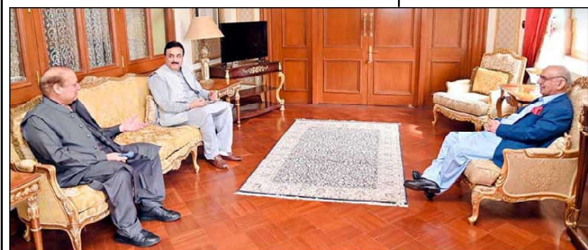
MURREE: Deputy Chairman Senate Saydal Khan meeting with President PML(N) Muhammad Nawaz Sharif.

MAKKAH AL-MUKARRAMAH (APP): A month-long pre-Hajj flight operation, which began on May 9 to transport around 70,105 from major cities of Pakistan to holy cities of Madinah and Makkah under the government scheme, would complete with the arrival of the last flight at the King Abdulaziz International Airport Jeddah on Monday morning. As per the schedule, a copy of which is available with APP, a Saudi Airlines SV-3727 would leave Islamabad International Airport for Jeddah at 3 a.m. (PST) carrying 380 passengers - the last batch of Pakistani intending pilgrims under the government scheme. These views were expressed by the president of Pakistan Muslim League-Nawaz (N) and three-time former premier during a conversation with the Deputy Chairman of the Senate, Senator Syedal Khan, who called on him in Murree today.