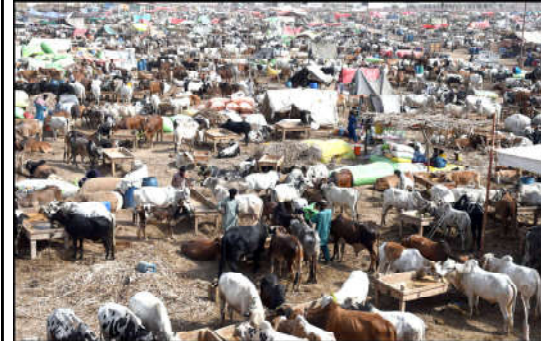
KARACHI: A general view of a cattle market as vendors displayed sacrificial animals attraction for customers ahead of Muslim festival of Eid al-Adha, on the outskirts of the Provincial Capital.