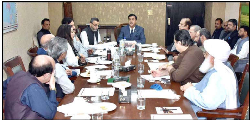
ISLAMABAD: Chairman Senate, Syed Yousuf Raza Gilani presiding over a Senate House Business Advisory Committee Meeting at Parliament House.

He also urged parents to give their children two doses of polio drops and make a polio-free Pakistan.