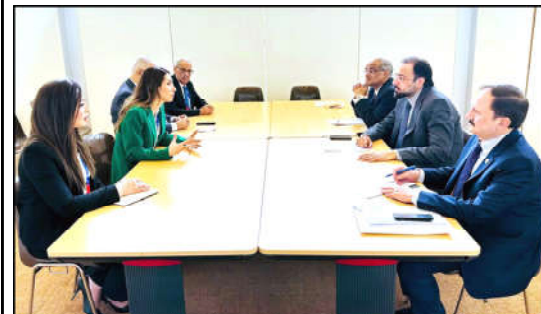
GENEVA: Federal Minister for Overseas Pakistanis and Human Resource Development, Chaudhry Salik Hussain in a meeting with Dr. Enas Attari, Palestine Labour Minister.

He assured that financial assistance would be given to the victims, and he asked the Deputy Commissioner Matiari to present detailed information about the injured in this regard.