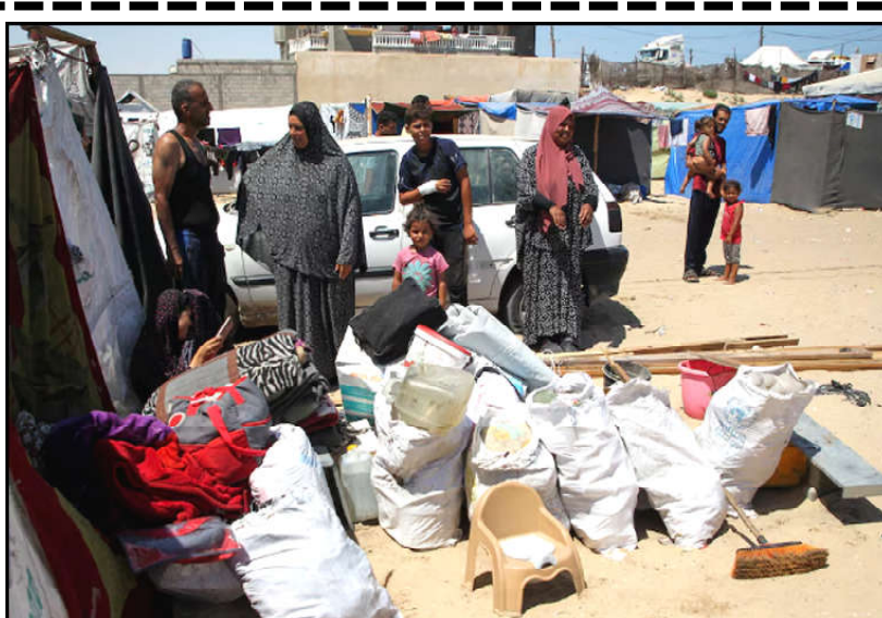
Palestinians gather as people flee Rafah due to an Israeli military operation, amid the Israel-Hamas conflict, in Rafah, in the southern Gaza Strip.

Monitoring Desk BRUSSELS: European Union finance ministers will consider a G7 plan for leveraging windfall profits generated by Russian assets, immobilised in the West after Russia's invasion of Ukraine, after a G7 summit later in June, the ministers' chairman said. Paschal Donohoe, who chairs meetings of euro zone finance ministers, said after a video teleconference of EU ministers on Wednesday that there was unwavering support to help Ukraine meet its financing needs. "The discussion among ministers showed appreciation for the constructive engagement with G7 partners in this regard and full support for it to continue," Donohoe said in the statement after the teleconference. "Finance ministers will consider at their June meeting the need for further discussions following the G7 Summit in Apulia," he added.