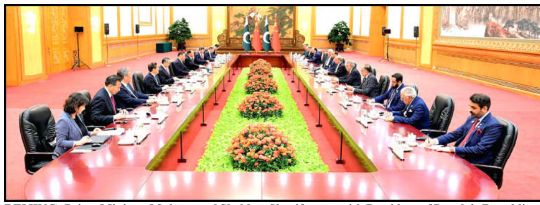
BEIJING: Prime Minister Muhammad Shehbaz Sharif meets with President of People's Republic of China, Xi Jinping.