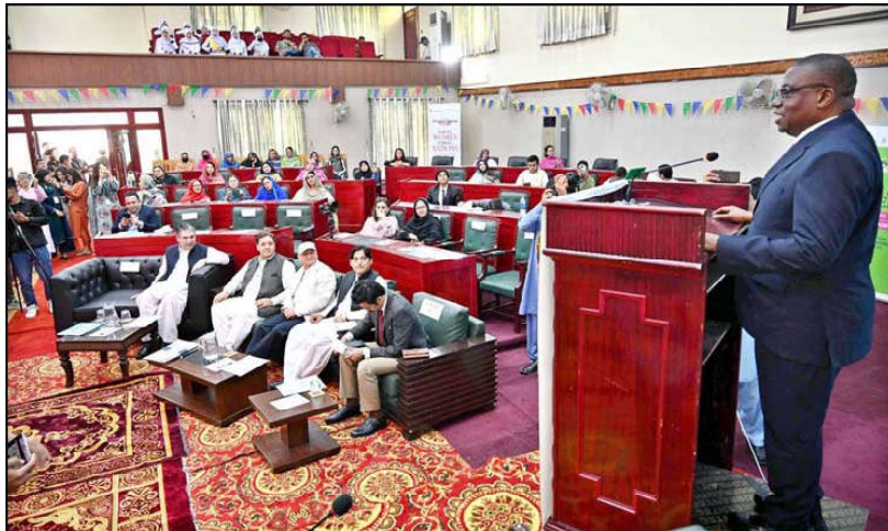
GILGIT: Country Head UN Women Lansana Wonneh addresses at the 2nd Annual Women's Summit for Strengthening Bonds, Finding Joy & Developing Collective Voice at old Assembly Building Chinar Bagh.

LAHORE (APP): The measles outbreak in Punjab continues to escalate, with alarming increases in both suspected and confirmed cases. Tragically, three children have succumbed to the disease in Multan during the past 24 hours, as reported by the Health Department on Friday. These recent fatalities bring the total number of measles-related deaths among children in Punjab to 30.