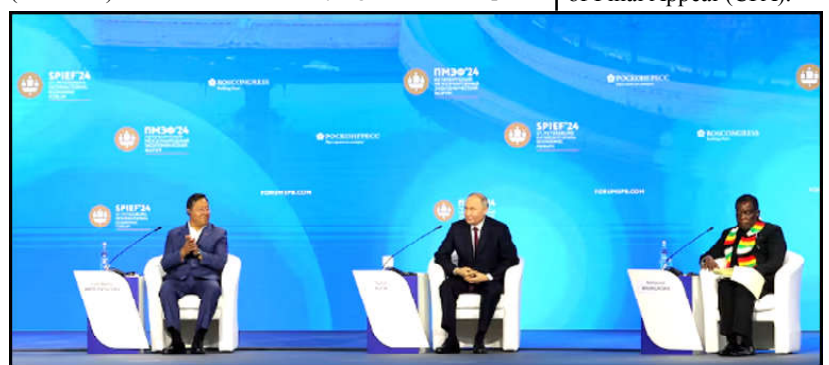
Russia's President Vladimir Putin, Bolivia's President Luis Arce and Zimbabwe's President Emmerson Mnangagwa attend a plenary session of the St. Petersburg International Economic Forum (SPIEF) in Saint Petersburg, Russia.

Monitoring Desk HONG KONG: Two British judges have resigned from Hong Kong's top court, about a week after a landmark verdict that convicted 14 prominent democratic activists of subversion, amid a national security crackdown on dissent in the financial hub. In a statement, the Hong Kong judiciary said two prominent British judges, Lawrence Collins and Jonathan Sumption, had tendered their resignations from the city's Court of Final Appeal (CFA).