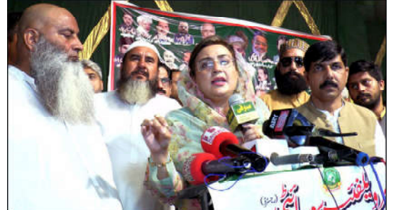
GUJRANWALA: Punjab Information Minister Azma Bukhari talking to media person on the eve of collective marriage ceremony.

Independent Report PESHAWAR: Nutrition International, in collaboration with the Health Department of Khyber Pakhtunkhwa (KP), has launched the 'NourishMaa' campaign in the province. The initiative aims at enhancing maternal nutrition by improving the knowledge and skills of healthcare providers (HCPs) and frontline health workers (FHWs). A press release issued here Friday said that already operational in six districts across Punjab and Sindh, the campaign has now extended to KP, specifically targeting Mardan and Battagram, districts with particularly high rates of maternal malnutrition. Speaking on the occasion Minister for Health KP, Syed Qasim Ali Shah, said the health and nutrition of mothers and children are foundational pillars for the overall development of our society, emphasising the critical role of maternal nutrition in ensuring the well-being of both mothers and children. The minister highlighted the urgency of addressing maternal malnutrition and the essential role of healthcare providers in fostering a healthier future.