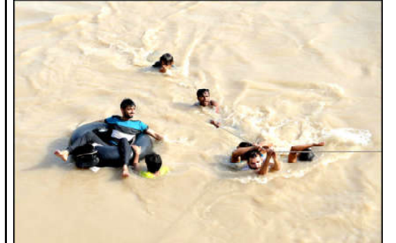
HYDERABAD: Youngsters cool off at Phuleli canal during a hot summer day amid heatwave in the city.