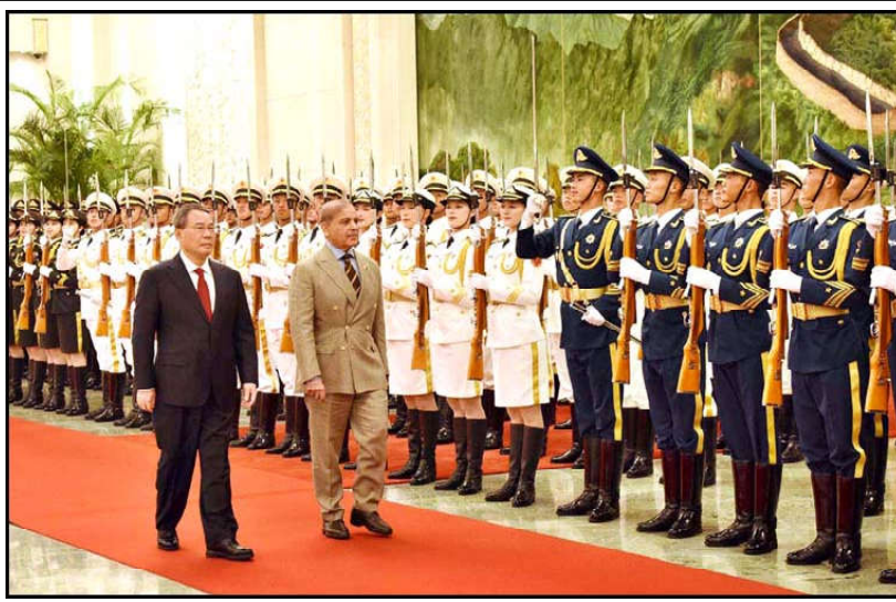
BEIJING: Prime Minister Muhammad Shehbaz Sharif is being presented with the Guard of Honor at Great Hall of the People.

"We are coming with serious plans. We will engage with you and return to Pakistan with great dividends that will benefit Chinese and Pakistani companies and the two countries will have their relations strengthened and become much higher than the Himalayas or any other highest peaks and deeper than the deepest oceans," he remarked.