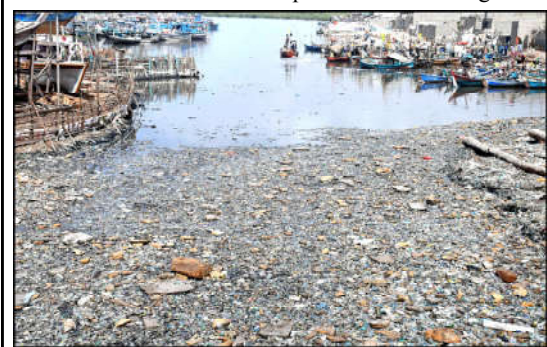
KARACHI: Fishing boats are seen among rubbish accumulated in the waters of the harbor on the eve of World Environment Day in Karachi.

KARACHI (INP): Karachi Electric (K-Electric) on Tuesday filed an interim petition in the National Electric Power Regulatory Authority (NEPRA), seeking monthly adjustments for April. From one of the angles, K-Electric has requested for 44-paise increase in electricity prices, while from the other two angles, it also requested for cut in the prices by Rs1.18 and 74 paise. The power distribution company requested the NEPRA to accept either of these three options. The Authority will hear the K-Electric's petition on June 12.