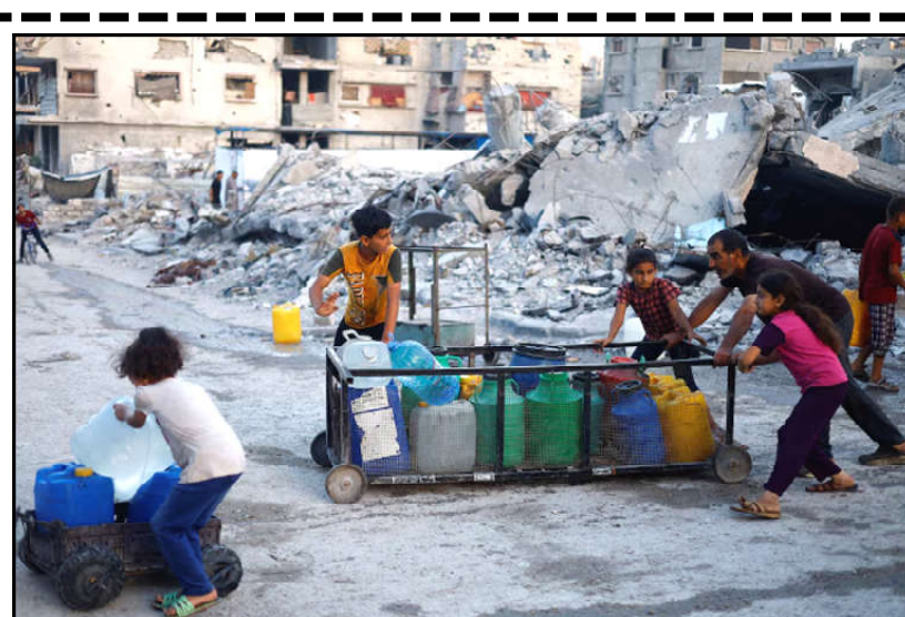
A Palestinian man and children push a cart with water containers, amid the ongoing conflict between Israel and Hamas, in southern Gaza City, in the Gaza Strip.

Monitoring Desk TOKYO: The Israeli ambassador to Japan has not yet been invited to Nagasaki's annual peace ceremony, said city officials who instead sent the embassy a letter calling for a Gaza ceasefire.