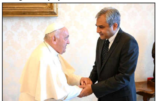
VATICAN: Federal Minister for Interior shaking hands with Pope Francis.

He emphasized that the interfaith dialogue and harmony was the key to resolve issues.