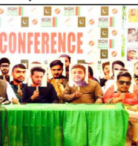
KARACHI: Muttahida Qaumi Movement (MQM-P) Rabita Committee Senior Deputy Convener, Syed Mustafa Kamal along with others addresses to media persons during press conference held at Pakistan House in Karachi.

Kamal on Tuesday submitted an affidavit in the Supreme Court Karachi Registry.