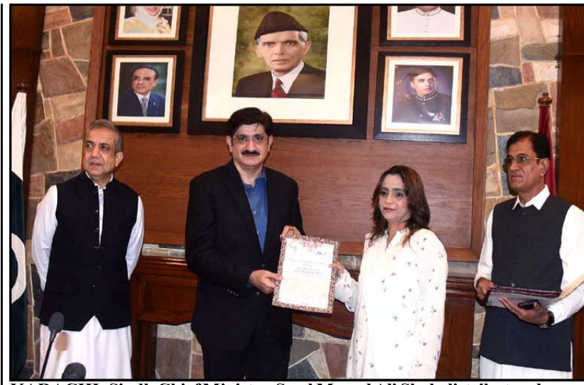
KARACHI: Sindh Chief Minister, Syed Murad Ali Shah distributes cheques among the NGOs working for differently abled persons during ceremony held at CM House in Karachi.

made significant strides in afforestation and ecosystem restoration," he added. The president said the initiatives such as the National Adaptation Plan and the Climate Smart Agriculture reflected their dedication to sustainable agricultural practices and land degradation mitigation. Although Pakistan was taking steps to tackle desertification, land degradation and drought through the restoration of degraded forests, and agricultural lands, but much more needed to be done, he stressed. "We need to adopt sustainable land management practices, and water conservation techniques, besides supporting community action to promote reforestation in the rural and urban residential areas," he opined.