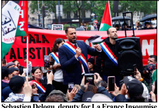
Sebastien Delogu, deputy for La France Insoumise (LFI) party attends a pro-Palestinian protest in central Paris, France.

"This is a pre-condition for lasting peace in Palestine and the entire Middle East beginning with the immediate declaration of a ceasefire in Gaza and no further military incursions into Rafah," they said. "A two-state solution remains the only internationally agreed path to peace and security for both Palestine and Israel and a way out of generational cycles of violence and resentment." Israel's Foreign Ministry did not respond immediately to a request for comment. With their recognition of a Palestinian state, Spain, Ireland and Norway said they sought to accelerate efforts to secure a ceasefire in Israel's war with Hamas in Gaza.