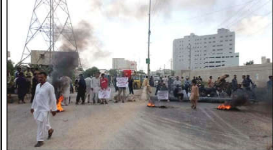
KARACHI: Residents of Ibrahim Hyderi blocked road burn tyres as they are holding protest demonstration prolong electricity load shedding and non-availability of drinking water during hot weather of summer season, in Karachi.