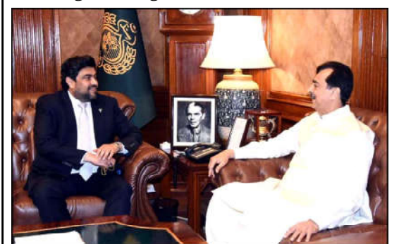
KARACHI: Chairman Senate, Syed Yusuf Raza Gilani exchanging views with Kamran Tessori, Governor of Sindh during meeting held at Governor House in Karachi.

The CM directed the Secretary DEP to run the centre effectively and he would provide more facilities and equipment if needed.