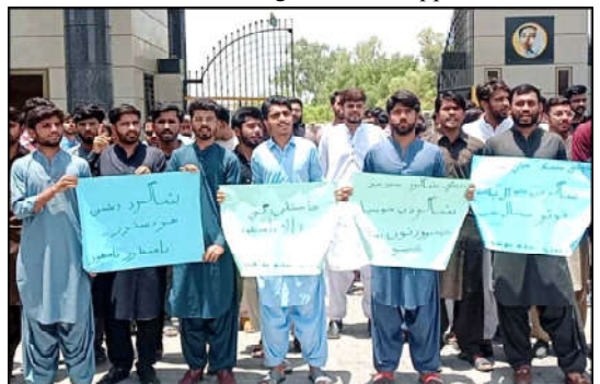
LARKANA: Members of All Students Action Committee are holding protest demonstration against the worst lack of basic facilities in the Chandka Medical College outside college premises in Larkana.