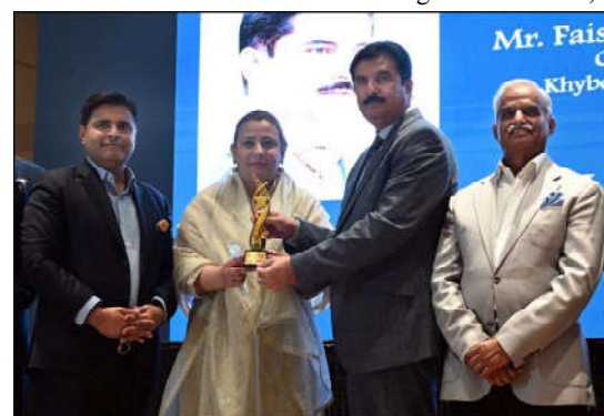
ISLAMABAD: Governor Khyber Pakhtunkhwa (KPK) Faisal Karim Kundi conferring awards to the traders of KPK during an award giving ceremony which was held at Islamabad Chamber and Commerce & Industry.

Gilani said the transportation sector under the Chian Pakistan Economic Corridor had already opened up new avenues of trade and connectivity.