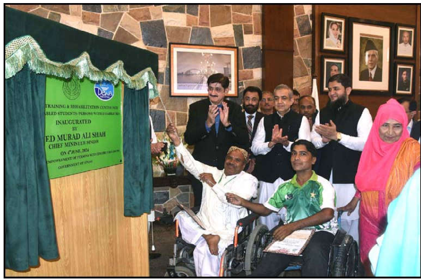
KARACHI: Sindh Chief Minister, Syed Murad Ali Shah along with disabled persons unveils the plaque during inauguration ceremony of the Vocational Training Centre for Persons with Disabilities Anchohi, held at CM House in Karachi.

He informed about all the strategies in relation to the operation for disposal of