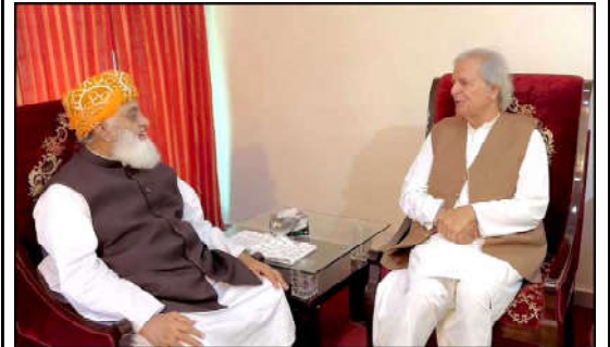
MULTAN: Senior politician Javed Hashmi meeting with Chief of JUI Maulana Fazlur Rehman.

ous Pakistani languages should be deployed to assist pilgrims visiting the Haram Sharif for Umrah or prayers. "This move would enhance the experience of pilgrims and help them navigate the area with comfort, given Pakistan's multicultural nature with language diversity," he added. He urged the supporting staff to ensure that the pilgrims should be provided with the best possible facilities and services during their stay for Hajj, showing compassion and empathy towards them in addition to their duties.