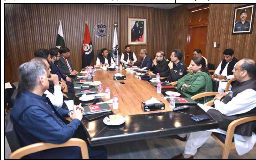
KARACHI: Sindh Home Minister Zia-ul-Hassan Lanjar presides over the meeting regarding Safe City Project.

The DG Safe City Project informed the meeting that Pakistan's largest screen and data center will be established under this project, with 12000 cameras to be installed at selected locations in Karachi, and 2000 existing cameras to be upgraded.