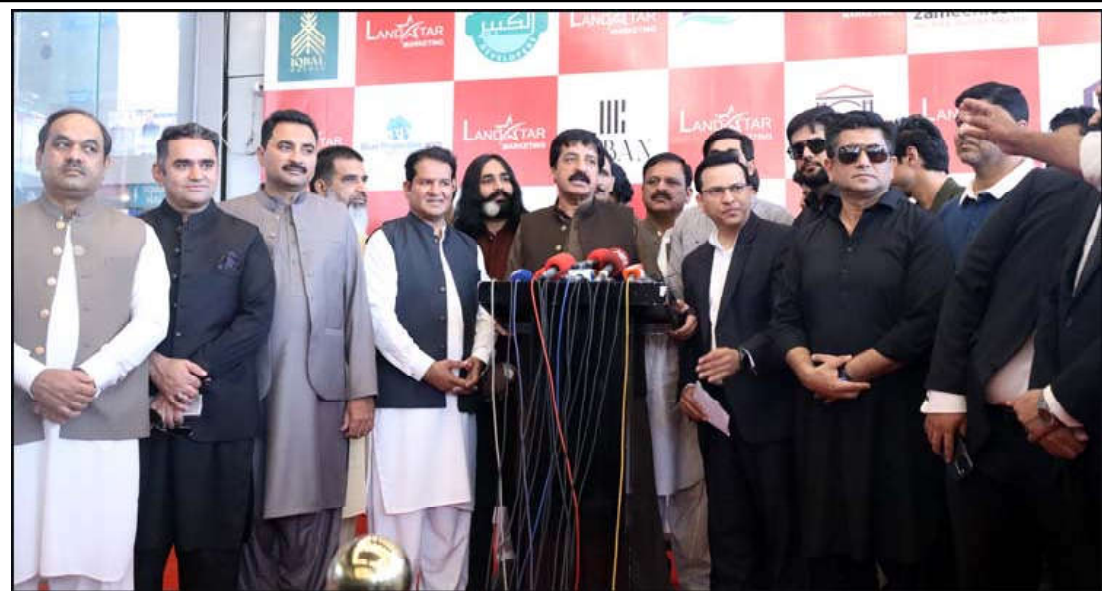
LAHORE: Governor Punjab Sardar Saleem Haider Khan talking to media persons during his visit to Property Exhibition at Expo Centre Lahore.

top quality benchmarks, according to press release issued by the ministry. The minister said that PPD would be developed on modern lines to enhance its efficiency and effectiveness and all resources would be utilized to address staff shortages within the department. "We have a strong commitment to promote merit and transparency