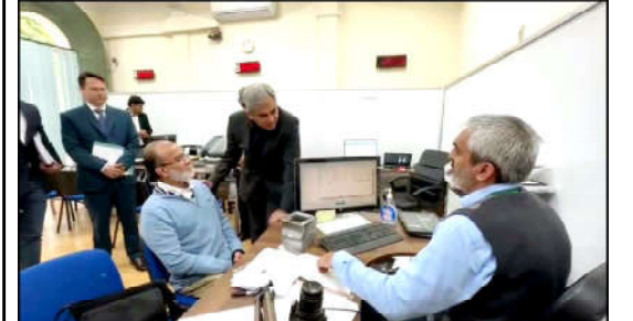
Federal Minister for Interior Mohsin Naqvi visiting NADRA and Passport Centers in London.