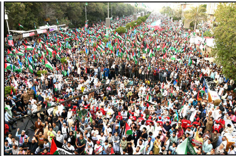
KARACHI: Supporters of the religious and political party Jamaat-e-Islami attend a demonstration against Israeli airstrikes on Gaza, to show solidarity with Palestinian people, in the Provincial Capital.

of people in Gaza and said that even children in Gaza have associated themselves with the Quran. It's an irony that the international terrorist United States has declared the resistance forces in Palestine as terrorist, he said, adding that the history of the US is evident the she has never been loyal to any state. He quoted Quaid e Azam as saying that Israel was an illicit child of the west. He also recalled that the All India Muslim League had not only passed a resolution for Pakistan but also for Palestine and they repeatedly did so. He shed light in detail on the role of Pakistan in the Muslim World in the past and recalled that Islamabad's military might and position were used for Muslims in the middle east, in Bosnia and other parts of the world.