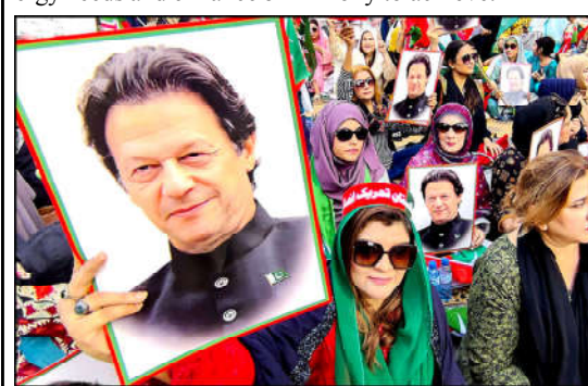
KARACHI: Supporters of PTI hold a protest in front of their demands in front of Karachi Press Club.

The ambassador hoped that the CASA-1000 projects would be completed in due time and also to meet Pakistan's energy needs and enhance bi-