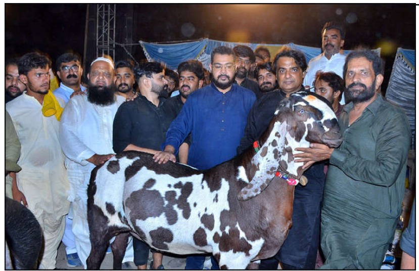
FAISALABAD: Owners proudly display their pets during the competition 26th International camel and Goat contests of beautification, weigh and milk, contest is jointly arranged by the Faculty of Animal Husbandry (FAH), UAF and International Goat and Bull Association at UAF Stadium.