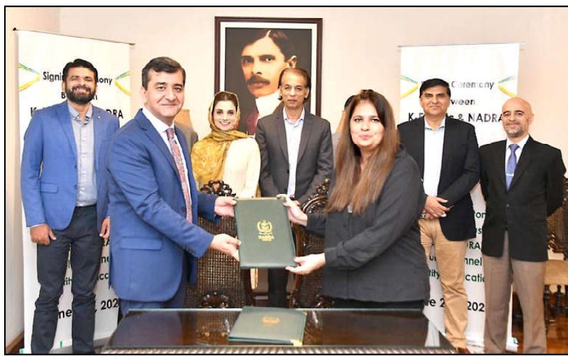
ISLAMABAD: Representative of National Database and Registration Authority (NADRA) and K-Electric (KE) exchange documents after agreement signed.

(SPU) in Islamabad for the security of foreign nationals, particularly Chinese citizens. He also assured the Federal Minister for Interior full cooperation in the training and other related matters of the SPU. It is worth mentioning that an advisory group from the Chinese Ministry of Public Security will visit Pakistan soon. Federal Minister for Interior Mohsin Naqvi said that Pakistan is proud of its friendship with China and Pakistan-China friendship is an example for the rest of world. He highlighted that foolproof security arrangements have been made for the Chinese citizens. It is worth mentioning that Federal Minister for Interior Mohsin Naqvi and his PRC counterpart Qi Yanjun are in New York to attend the 4th United Nations Chiefs of Police Summit (UNCOPS).