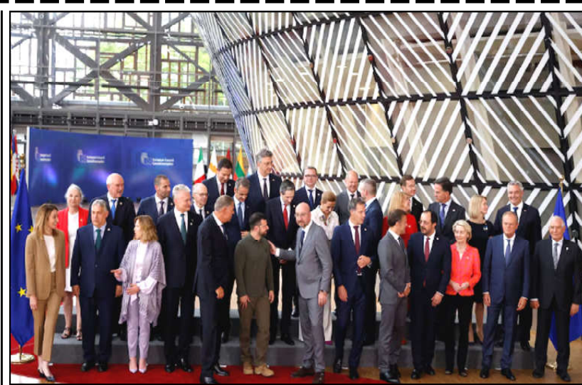
Ukrainian President Volodymyr Zelenskyy and European leaders attend a family photo session, during the European Union leaders' summit in Brussels, Belgium.

ing a Canadian warning from the day before, "urgently requested" its citizens in Lebanon leave the country. "The current heightened tensions in the border area with Israel could escalate further at any time," updated foreign ministry advice in Berlin said. UN humanitarian coordinator Martin Griffiths told reporters in Geneva on Wednesday that Lebanon was "the flashpoint beyond all flashpoints". "It's beyond planning. It's potentially apocalyptic," warned Griffiths, whose term ends this week. A war involving Lebanon "will draw in Syria... it will draw in others", he added. "It's very alarming." Lebanon's national news agency reported about 10 Israeli strikes on areas near the border on Wednesday, including one around 10:00 pm that destroyed a building in Nabatiyeh, wounding five people.