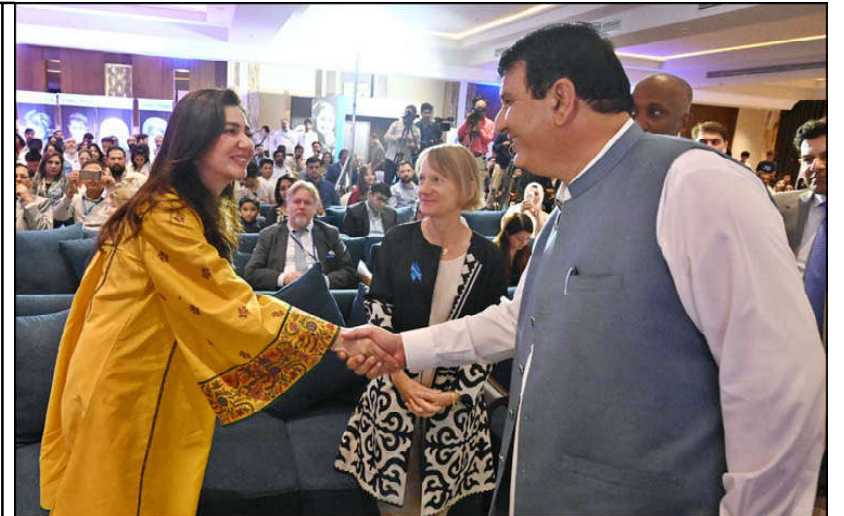
ISLAMABAD: Federal Minister for States & Frontier Regions (SAFRON), Kashmir Affairs and Gilgit-Baltistan Engineer Amir Muqam shaking hand with UNHCR's Goodwill Ambassador, Ms. Mahira Khan during a seminar on "World Refugee Day-2024" organized by UNHCR.

of millions of refugees around the world. This year's theme, "Solidarity with Refugees and Solutions for Refugees," highlights the urgent need for collective action and sustainable solutions to address the refugee crisis, he added. Engr Amir Muqam said that for over four decades, Pakistan has demonstrated unparalleled generosity and compassion by hosting one of the largest refugee populations in the world. Currently, we provide sanctuary to approximately 1.4 million P.O.R and about 0.8 million Afghan Citizen Card holders, he added.