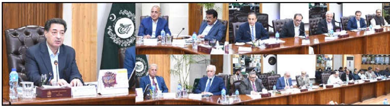
ISLAMABAD: Chief Election Commissioner, Sikandar Sultan Raja chaired a meeting on local body elections in Islamabad and Punjab at ECP Secretariat.

ISLAMABAD (INP): The power tariff is likely to hike by Rs 3.41 per unit on account of monthly fuel adjustment is approved, the tariff hike would put an additional burden on consumers already struggling with high electricity prices. Following the announcement of Budget 2024-25, the federal government earlier further burdened the inflation hit citizens with Rs 5.72 per unit hike in power tariff. The National Electric Power Regulatory Authority (NEPRA) announced that the average electricity tariff will rise to Rs. 35.50 per unit from the current Rs. 29.78. Previously, the basic electricity tariff was increased to Rs 7.50 per unit in the current financial year, up from Rs 7.91 per unit in the last fiscal year. However the surge in the electricity tariff will be implemented from July 1. The CPPA has filed an application to NEPRA seeking an increase in the electricity tariff, citing an increase in the monthly fuel adjustment for May. According to the CPPA, 12.26 billion units of electricity were generated last month, with a production cost of Rs9.12 per unit. If the application