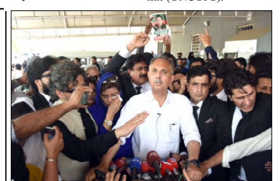
ISLAMABAD: Opposition Leader in the National Assembly Omar Ayub Khan talking with media persons outside district court in the Federal Capital, as the court rejects Imran Khan, wife appeal in unlawful marriage case.

ISLAMABAD (INP): Petrol prices are expected to increase in Pakistan from July 1 after four consecutive price cuts, sources said on Thursday. Petrol is projected to increase by Rs7 per litre and HSD by Rs8 per litre due to higher international market rates. The international prices for petrol and HSD have risen by $4.4 and $5.5 per barrel, respectively, in the last fortnight. The hike in petrol prices could lead to domestic price hikes, potentially more significant if the government raises the Petroleum Development Levy (PDL) from the current Rs60 per litre. Previously, Pakistan slashed petrol and HSD prices due to a slump in the international market. Since May 1, petrol prices have fallen by roughly Rs35 per litre, dropping from around Rs294 on April 30 to about Rs259. Similarly, HSD prices have fallen by roughly Rs22 per litre, decreasing from over Rs290 in mid-April to Rs268. However, the Finance Bill 2024 has raised the PDL limit to Rs80 per litre. Finance Minister Muhammad Aurangzeb, however, announced on June 13 that PDL would be gradually increased depending on the pricing trend.