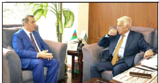
ISLAMABAD: Ambassador of Azerbaijan, Khazar Farhadov calls on Minister for Defence & Defence Production, Khawaja Muhammad Asif.