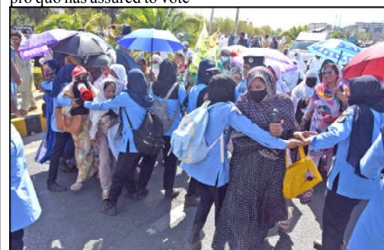
ISLAMABAD: Women scuffle with the police during a protest to demand rise in wage and pension, whilst they march towards the National Assembly in the Federal Capital, before Pakistan's Finance Minister Muhammad Aurangzeb presents the country's annual budget for fiscal year 2024-25.

Federal Minister for Planning and Special Initiatives Professor Ahsan Iqbal also attended the meeting, according to a President House press release. President Zardari emphasised that the interests of the low income and middle class should be protected in the annual budget. He also assured the prime minister of his support for the national development and achievement of fiscal targets.