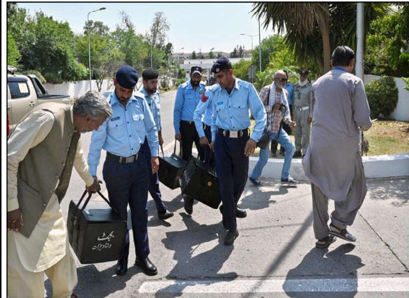
ISLAMABAD: Police officials carrying bags of budget documents arrive at the National Assembly before Finance Minister Muhammad Aurangzeb presents the country's annual budget for fiscal year 2024-25.