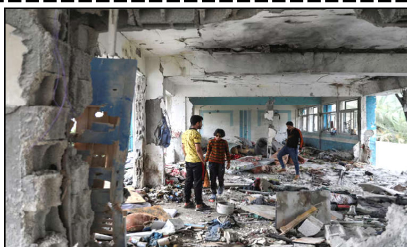
Palestinians inspect the site of an Israeli strike on a UNRWA school sheltering displaced people, amid the Israel-Hamas conflict, in Nuseirat refugee camp in the central Gaza Strip.

Lawyers representing the United Nations High Commissioner for Refugees (UNHCR) told the court on Monday that Rwanda's asylum system was inadequate, as part of a challenge to the British government's policy to deport asylum seekers there. The lawyers said removing asylum seekers to Rwanda put them at risk of being transferred again in a banned process known as refoulement—building on past evidence which formed an important part of the UK Supreme Court's reasoning when it ruled last year that the British plan.