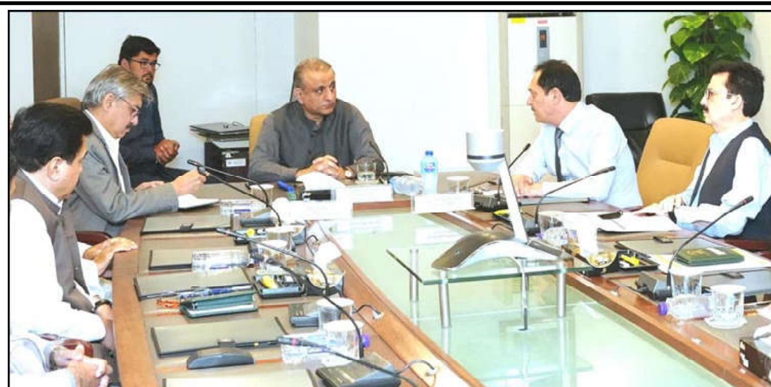
Federal Minister for Communications, Privatization and Investment Board Abdul Aleem Khan presiding over a meeting of NHA in Islamabad.

distribution efficiency improvement project (HESCO) and Rs 2,600 million for 500 kV Matiari—Moro-R Y Khan. For New Scheme, an amount of Rs 6,250 million has been earmarked for land acquisition for installation of 1200 MW solar power plant Layyah, Rs 4,500 million for electricity distribution improvement and Rs 6,000 million for installation of assets performance management system on 100 kV and 200 kV distribution transformers.