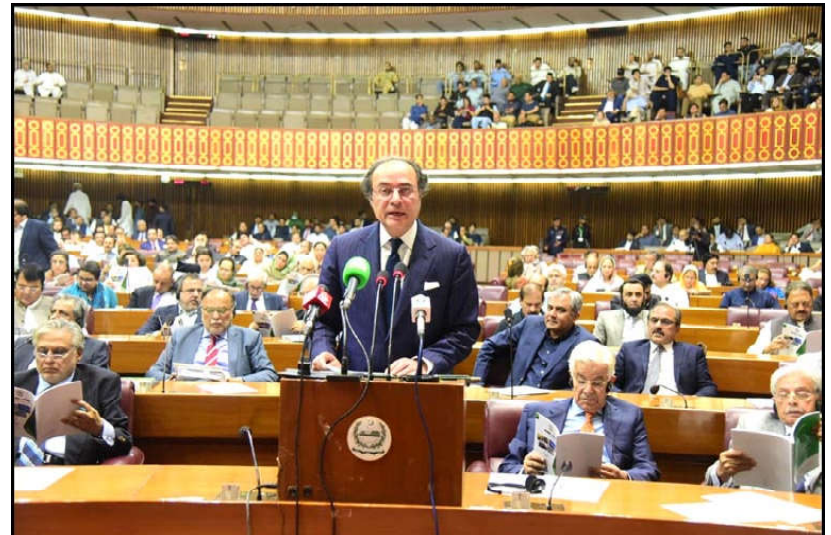
ISLAMABAD: Minister for Finance and Revenue Senator Muhammad Aurangzeb presented the Federal Budget 2024-2025 before the National Assembly of Pakistan.

budgetary allocations, which would help to develop the volume of infrastructure including transportation, energy, IT and water resources and improve the living standards of the people in the country. Senator Aurangzeb said that in PSDP 2024-25 special focus is paid to the completions of ongoing projects as 83 percent of resources are allocated for the completion of ongoing schemes and 17 percent for the new development schemes. During the financial year 2024-25, it is proposed to allocate 59 percent of resources for the development of infrastructure development and 20 percent for the social sector development. To ensure the equitable development in AJK, GB and merged districts of the KP, the government has allocated at 10 percent and around 11 percent for other sectors development including IT, telecom, science and technology, governance and production sector. The government has included projects related to support the productivity of exports oriented industries to enhance their competitiveness, to expend the digital infrastructure in the country.