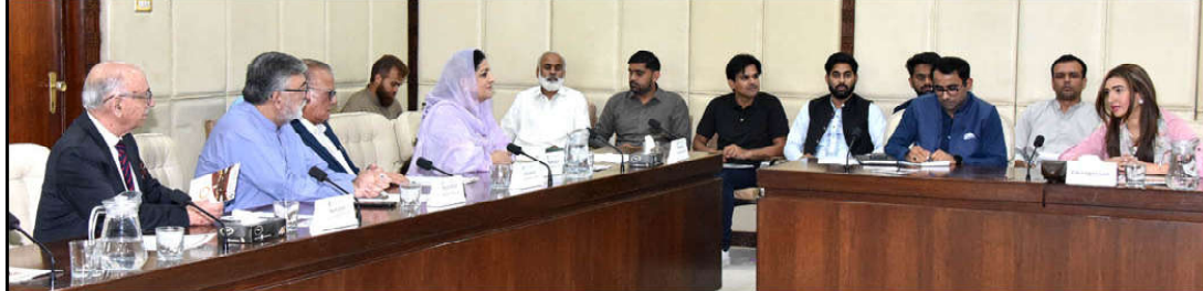
Senator Bushra Anjum Butt, presiding over a meeting of the Senate Standing Committee on Federal Education after being elected as chairperson of the Committee at Parliament House Islamabad.

Transfusion and Blood Products Policy would be introduced soon, and work on a nursing and midwifery policy framework was in the final stage. It was told that an evening shift was being introduced in the nursing colleges to increase the number of graduates. Moreover, work on a revised National Action Plan 2025-30 has been started to control the population growth. As the prime minister was told about the installation of new health equipment worth Rs 711 million in Islamabad's hospitals, he instructed the third-party audit of the purchase of the said equipment. It was informed that a modern hospital management system would be installed in Islamabad's hospitals and that waste management plants were operating in the capital city's five public and four private sector hospitals.