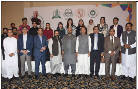
LAHORE: Provincial Education Minister Rana Sikandar Hayat and others in a group photo on the occasion of opening ceremony of Digital Education at a local hotel of the provincial capital.

several cities of Sindh, in distress. As per details, the NAB investigation team's initial raids uncover a web of deceit by revealing warehouses and shops in Sadiqabad, being used to stock misappropriated commodities by accused Sheikh Rashid and his accomplices. Taking decisive action under Section 12 of NAO 1999, DG NAB freezes all properties and stocked commodities owned by the accused persons and appoints Assistant Commissioner (AC) Sadiqabad as "Receiver" for the frozen assets.