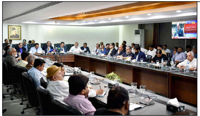
LAHORE: Business community persons and LCCI members listening the budget 2024-25 at LCCI.