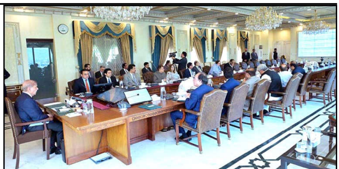
ISLAMABAD: Prime Minister Muhammad Shehbaz Sharif chairs a meeting regarding the rightsizing of the government.

Resolving to meet everyone's expectations, the prime minister lauded the trust of brotherly countries and investors in the government's economic policies and increasing the foreign investment.