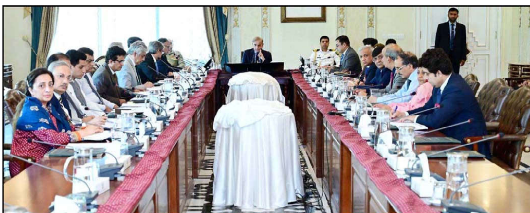
ISLAMABAD: Prime Minister Muhammad Shehbaz Sharif chairs a review meeting on the matters related to Ministry of National Health Services, Regulations and Coordination.

ates for change. Speak up against the silent exploitation happening in our midst. Let us not normalize young boys and girls working in our neighborhoods, sometimes in our own homes." Speaking as the chief guest, Minister of Law and Justice and Human Rights, Senator Azam Nazeer Tarar, affirmed the government's commitment, stating, "The Ministry of Human Rights is fully committed to supporting the efforts of the NCRC in their mission to end child labour and bring about legislative reforms."