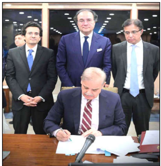
ISLAMABAD: Prime Minister Muhammad Shehbaz Sharif signs the documents of the Federal Budget 2024-25 after its approval from the Federal Cabinet to be laid before the National Assembly.

ISLAMABAD (INP) - Leader of the opposition in National Assembly Omar Ayub termed the federal budget as anti-people and said that the government didn't consult any stakeholder. Talking to media outside the parliament house after the budget speech of Finance Minister Muhammad Aurangzeb, the opposition leader said that the constitution was violated for the very first time in National Assembly during the presentation of budget. "I have presented four budgets in this house. These are fake documents as government didn't mention the total volume of budget and its deficit," said the opposition leader. He added that the PTI government eliminated electricity loadshedding by 80 percent during its tenure. "The PPP has stabbed the government in the back as their MNAs didn't want to participate in the budget session today," Ayub said. MNA Ali Muhammad Khan of Sunni Ittehad Council said that the budget is anti-people as it doesn't have anything for the masses. "The party that got majority in the house was thrown on the opposition benches. The budget was presented by those who reached parliament on Form-47," said Ali Muhammad Khan.