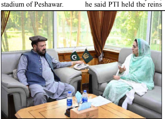
GILGIT: Deputy Speaker Gilgit-Baltistan Assembly Sadia Danish called on Chief Minister Gilgit-Baltistan Haji Gulbar Khan at CM