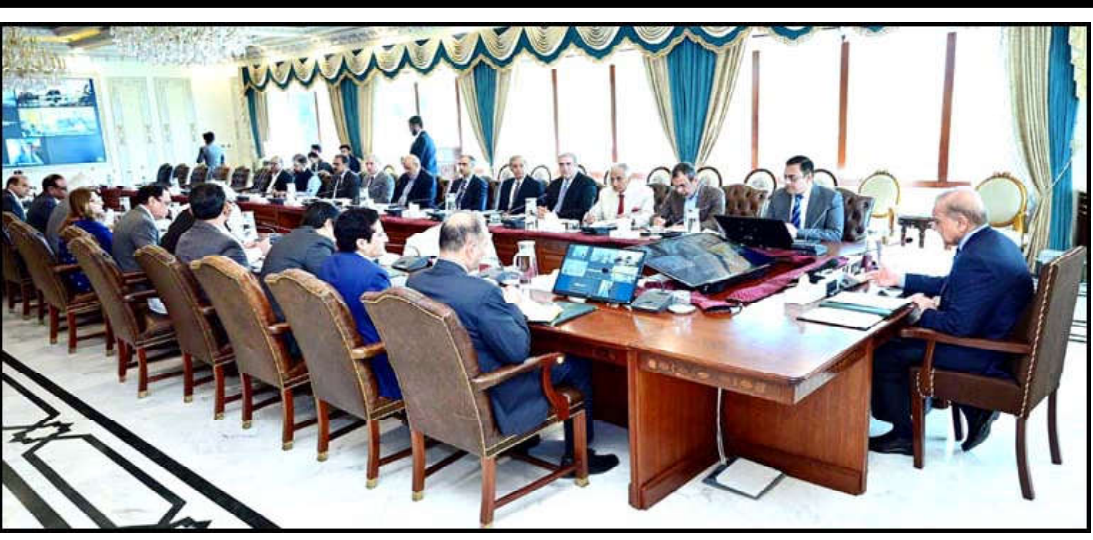
ISLAMABAD: Prime Minister Muhammad Shehbaz Sharif chairs a meeting regarding load shedding, the anti-power theft campaign and reforms in the power sector.