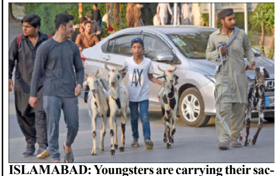
rificial goats for walking at a road in the Federal Capital.

projects. The 4320 MW-Dasu Hydropower Project is being constructed on the River Indus, upstream of Dasu Town in the Upper Kohistan District of Pakhtunkhwa Province.