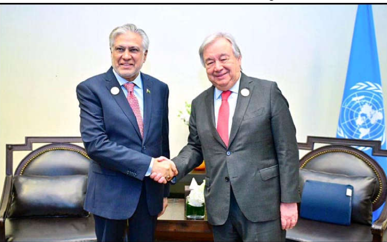
JORDAN: Deputy Prime Minister and Foreign Minister Senator Mohammad Ishaq Dar meets with UN Secretary General, Antonio Guterres

Meanwhile the federal cabinet on Tuesday principally approved the Digital Nation Pakistan Act 2024 providing to establish the National Digital The prime minister Commission and Paki-