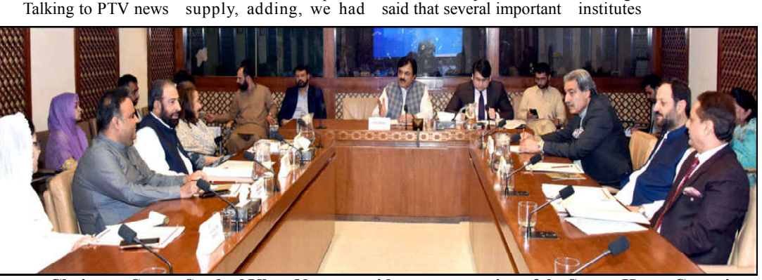
Deputy Chairman Senate Syedaal Khan Nasar presides over a meeting of the Senate House Committee press release.