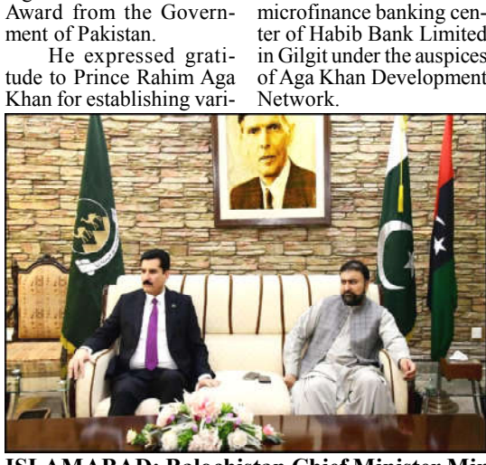
ISLAMABAD: Balochistan Chief Minister Mir Sarfaraz Ahmed Bugti meeting with Governor Khyber Pakhtoonkhwa Faisal Karim Kundi.