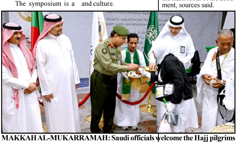
from different countries on their arrival.

The symposium aimed to establish unified principles of collective work for the Islamic world in responding to suspicions about faith, nation, and culture.