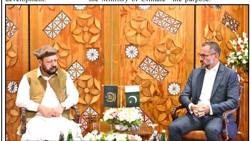
GILGIT: Chief Minister Gilgit-Baltistan Haji Gulbar Khan in a meeting with the Prince Rahim Aga Khan.

The budget also allocates Rs15.775 billion for four ongoing schemes, aimed at promoting sustainable development and environmental conservation. Furthermore, the government has proposed Rs100 million for the Pakistan Biosafety Clearing House. In a move to improve water quality monitoring capabilities, the government has allocated Rs30 million for the purpose.