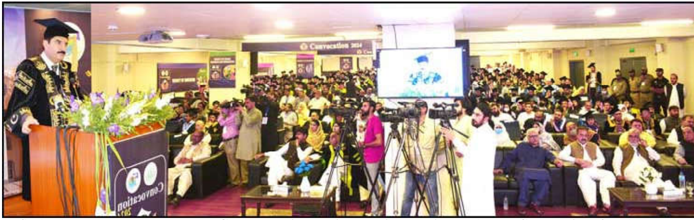
PESHAWAR: Khyber Pakhtunkhwa Governor Faisal Karim Kundi addressing the Annual Convocation of the Allama Iqbal Open University.