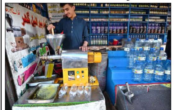
ISLAMABAD: A vendor busy in extracting mustard oil at his stall in weekly Sunday Bazaar, H-9 Sector.

Malik Imran Ahmad country head Campaign for Tobacco-Free Kids (CTFK) said, "Higher taxes on tobacco products can lead to increased revenue for the government. Pakistan currently holds the highest proportion of young people, as 64% of the total population of Pakistan is below the age of 30.