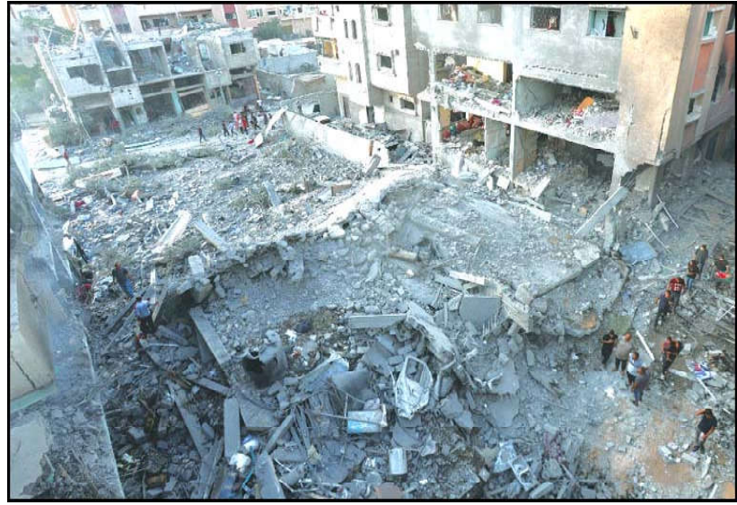
Palestinians inspect a house hit in an Israeli strike in Nuseirat refugee camp, in central Gaza Strip.