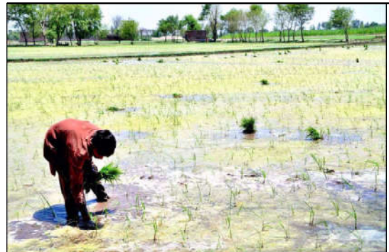
SARGODHA: A farmer busy in planting saplings of rice in his field along Shekan Road.