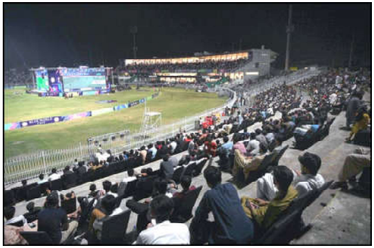
RAWALPINDI: A large number of spectators watching T-20 cricket match between Pakistan and India during ICC Men's T20 World Cup on big screens installed by Pakistan Cricket Board (PCB) at Rawalpindi Cricket Stadium.