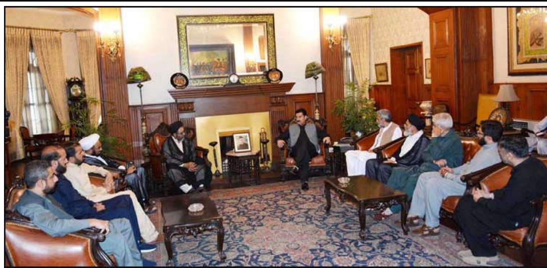
Khyber Pakhtunkhwa Governor Faisal Karim Kundi talking to representatives of Imamia Council Peshawar at Governor House.

LAHORE (APP): At least six people were killed and 1301 injured in 1196 accidents in Punjab during the last 24 hours. According to the Rescue-1122, 729 drivers, 44 underage drivers, 175 pedestrians, and 403 passengers were among the victims of traffic crashes. The statistics showed that 231 accidents were reported in Lahore which affected 271 persons placing the provincial capital top of the list followed by Multan 80 in with 82 victims and at third Faisalabad with 78 accidents and 86 victims. According to data, 1,058 motorcycles, 57 rickshaws, 117 cars, 23 vans, 11 buses, 26 truck and 88 other vehicles besides slow-moving carts were involved in the accidents.