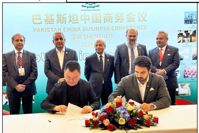
SHENZHEN: Federal Minister for Board of Investment, Privatization and Communications, Abdul Aleem Khan, Federal Minister for Commerce Jam Kamal Khan and Federal Minister for Industries and Production, Rana Tanveer Hussain witnessing MOUs at Pakistan China Business Conference.