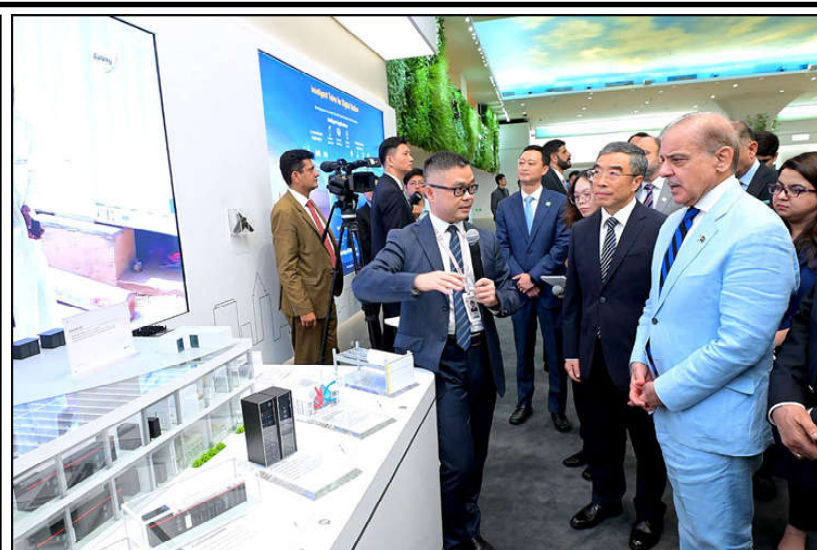
SHENZHEN: Prime Minister Muhammad Shehbaz Sharif visiting Huawei exhibition centre.

She said that the optical fiber cable network is vital for digitalization in Pakistan adding that the present government is fully committed to the provision of quality telecom services in the country.