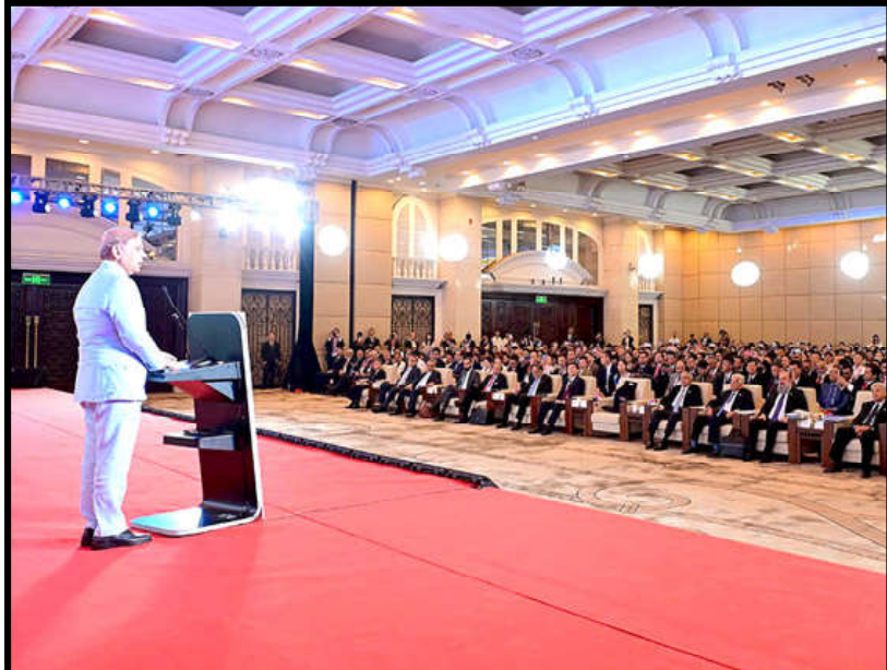
SHENZHEN: Prime Minister Muhammad Shehbaz Sharif addresses Pakistan China Business Conference.

Vol. XIV No. 132 Reg. mails-B / ID-445 Thursday June 06, 2024, Zeeqad 28, 1445 A.H. Ph: 2158688, 2158997 Pages 4: Rs. 12