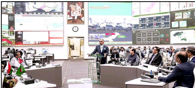
ISLAMABAD: NDMA conducts National Simulation Exercises Focusing on Monsoon Preparedness at NEOC, NDMA HQs.

ISLAMABAD (INP): Pakistan to 'request' United Arab Emirates (UAE) for rollover of $1 billion loan, before maturity period, sources said on Wednesday. As per details, the finance ministry has completed the working on the matter and Prime Minister Shehbaz Sharif is likely to pen down a letter to the UAE President Sheikh Mohammed bin Zayed al-Nahyan, for the rollover of the loan. Sources said, overall UAE kept $3 billion as a safe deposit in the State Bank of Pakistan out of which $2bn loan has already been rollover by the UAE at Pakistan's request, while a rollover for the remaining $1 bln will be sought. They said Pakistan is currently paying 3 to 6.5 per cent interest rate on the overall $3 billion safe deposit of the United Arab Emirates. Prime Minister Shehbaz Sharif will write a letter to the UAE president, in which he will thank the Emirates for its support to Pakistan and will seek rollover of $1 billion on the current terms and conditions, the sources said.