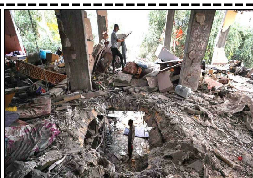
Palestinians inspect the damage to a house after it was hit in an Israeli strike in al-Bureij camp in the central Gaza Strip.

1,200 people and taking more than 250 people hostage, according to Israeli tallies. About 120 hostages remain in Gaza. The Israeli military campaign has killed more than 36,000 people in densely populated Gaza, according to its health authorities, who say thousands more bodies are buried under rubble. Qatar said on Tuesday it had delivered an Israeli ceasefire proposal to Hamas that reflected a three-phase proposal presented on Friday by US President Joe Biden, and that the paper was now much closer to the positions of both sides. Qatar, which has been mediating on Gaza between Israel and Hamas, also stressed that there should be a clear position from both parties to clinch a deal, its foreign ministry spokesperson said in a press briefing.