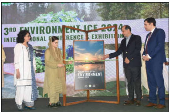
LAHORE: Senior Provincial Minister Maryam Aurangzeb inaugurating the third Environment ICE 2024 International Conference and Exhibition in the local hotel of the provincial capital.

PESHAWAR (APP): Khyber Pakhtunkhwa Governor, Faisal Karim Kundi on Wednesday said that people of erstwhile Fata and all tribal districts including Mohmand need better infrastructure for the progress and prosperity of the region. He was talking a representative delegation of Mohmand Chamber of Commerce and Industry here at Governor House. The delegation requested the Khyber Pakhtunkhwa Governor to play his constitutional role for establishment of special economic zone and industrial estate at Mohmand for promotion of marble industry. The delegation said it would help bring foreign investment besides generate employment opportunities for youth. The delegation also emphasized the need for construction of Yakagund Road upto Pak-Afghans border and Warsak dam royalty to Mohmand district. The delegation further apprised the governor about their concerns pertaining to electricity, enforcement of taxes and security challenges. The Governor Khyber Pakhtunkhwa Faisal Karim Kundi assured full support to the office bearers of Mohmand Chamber for continuity of business activities. The governor assured to play his constitutional role in resolution of their issues and bringing funds for the province.