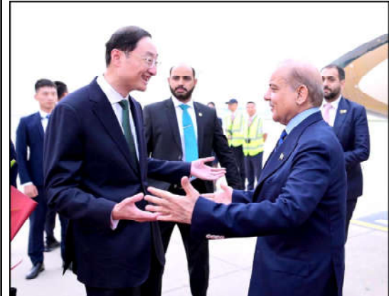
BEIJING: Vice Foreign Minister of People's Republic of China, Sun Weidong receives Prime Minister Muhammad Shehbaz Sharif at Beijing Capital International Airport.

SHENZHEN (APP): Federal Minister for Information, Broadcasting, National Heritage and Culture Attaullah Tarar on Wednesday said that Prime Minister (PM) Shehbaz Sharif had brought an innovation within China Pakistan Economic Corridor (CPEC). Talking to the media here, the minister said that a new era was beginning in CPEC under the vision of the Prime Minister. More than 500 Pakistani and Shenzhen businessmen participated in Business to Business Conference in Shenzhen, he added. "The relations between Pakistan and China are entering a new era which is an important milestone for the Pakistani economy," the minister said. He opined that business-to-business meetings and conferences in Shenzhen will play a significant role in the stability and development of Pakistan's economy. The minister said that a meeting with the owner of a mobile phone manufacturing plant was held whose factory was operational in Pakistan. He said that it will export its mobile sets from Pakistan.