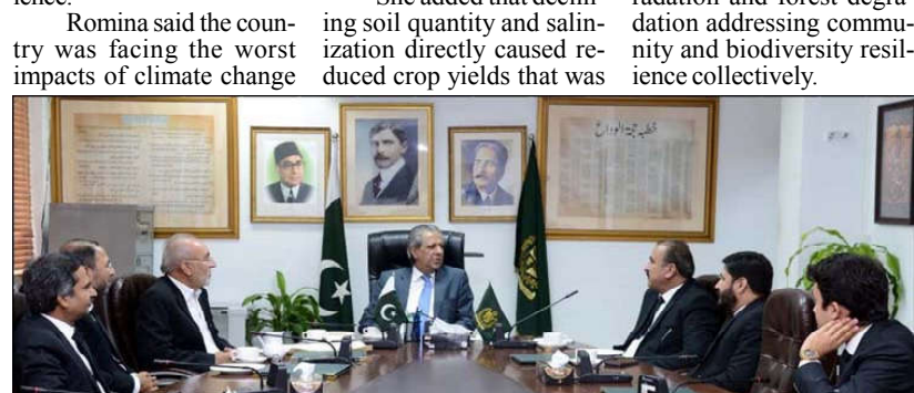
ISLAMABAD: Federal Minister for Law and Justice, Senator Azam Nazeer Tarar exchanging views with a delegation of Lawyers from Punjab and Khyber Pakhtunkhwa Bar Association during meeting.

that emanated interconnected challenges of food security, water scarcity, and land degradation. "Land degradation is damaging millions of hectares land annually and forcing millions of masses to displace around the world. Agriculture is the life one of Pakistan and land degradation would cast serious impacts coupled with forest degradation that would further aggravate the problem," she said. The PM's Coordinator mentioned that Indian construction of dams on rivers providing water to Pakistan was also a concern for the latter as a low riparian country. She added that declining soil quantity and salinization directly caused reduced crop yields that was