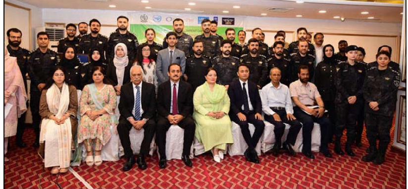
ISLAMABAD: PM's Coordinator on Climate Change & Environmental coordination Romina Khurshid Alam in a group photo with Customs & Enforcement officers on Montreal Protocol & HCFC control on the eve of World environment day.

equipped with knowledge and education can reshape the destiny of the country", he said. The minister lamented that our country could not achieve the desired progress in Information Technology sector. "We must conduct research that from which level we can impart IT education to our children so that they can compete with this digital world", he observed. He said that the present government has imposed education emergency considering the low literacy rate in the country. Khalid Maqbool said that the country is producing 20,000 IT graduates every year but only 5000 or 6000 graduates get jobs which is very unfortunate.