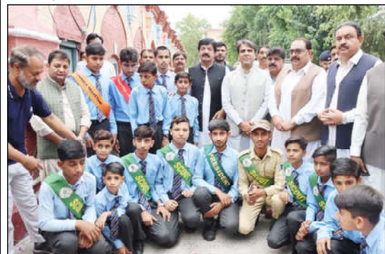
ATTOCK: Punjab Governor Sardar Saleem Haider in a group photo with students during his visit to Government Pilot School.

resolve the issues being faced by higher education institutions. He also appreciated the education standard of the College and efforts of the faculty members to strengthen financial position of the institution. The minister also planted a sapling in the College and assured cooperation to the College administration in resolution of their problems. He was also briefed by the faculty about various properties of the College in Khyber Bazar, Charsadda and Harichand.