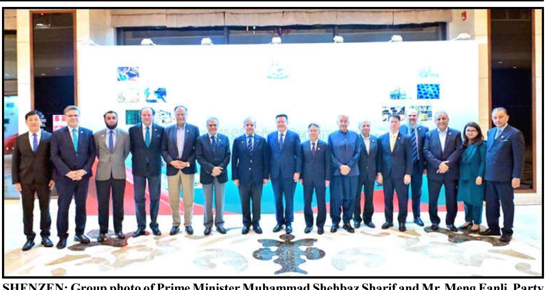
SHENZEN: Group photo of Prime Minister Muhammad Shehbaz Sharif and Mr. Meng Fanli, Party Secretary of Shenzhen Municipal Committee, and Deputy Party Secretary of Guangdong Provincial Committee along with their respective delegations.

The prime minister also attended a banquet hosted by Meng Fanli