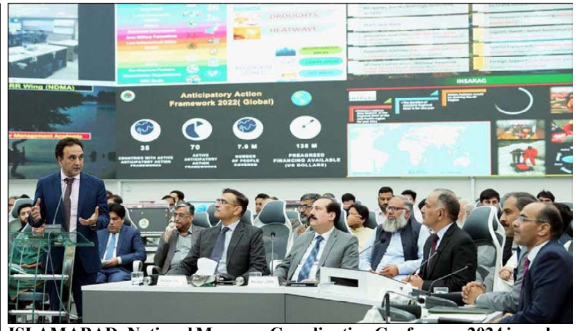
ISLAMABAD: National Monsoon Coordination Conference-2024 is underway, at National Disaster Management Authority (NDMA) Headquarters.

Pakistan Navy, he said celebrates WED to highlight the significance of environment in Pakistan to promote awareness amongst personnel and encourage them to adopt practices conducive to the marine