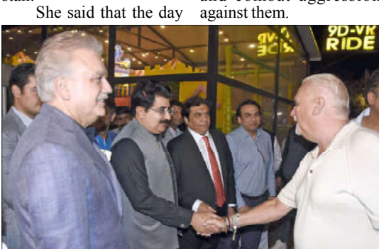
ISLAMABAD: Former Chairman Senate Sadiq Sanjrani shaking hand with the member of Pakistan Football League (PFL) UK in the reception of foreign delegation at local hotel.

She calls on governments, citizens. policymakers, communities, and individuals to prioritize the well-being and numerable children around rights of children and take concrete steps to prevent and combat aggression