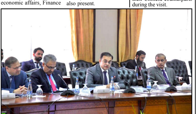
ISLAMABAD: The Federal Minister for Economic Affairs, Ahad Khan Cheema, chairs the 4th meeting of the International Partners Support Group (IPSG) at the Prime Minister's Office.

against drug smuggling in the last ten days. Pakistan Navy and PMSA maintain constant presence to closely monitor sea lanes Successful joint antinarcotics operation is a result of effective surveillance at sea by Pakistan Navy and Pakistan Maritime Security