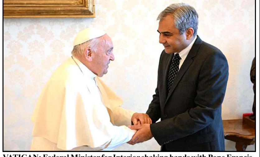
VATICAN: Federal Minister for Interior shaking hands with Pope Francis.

Says all issues would've been resolved if intra-party polls were held: Case of PTI would have been strong if the independent members had not joined the SIC