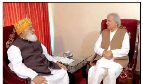
MULTAN: Senior politician Javed Hashmi meeting with Chief of JUI Maulana Fazlur Rehman.

Sources said that the PML-N has contacted directly and via mutual friends inviting the party to join the government. The party has been invited to join the federal as well as Punjab government as an ally. "The PPP didn't respond to the government over the offer, neither the party held consultations over the issue," sources said. Sources said that the PPP leadership has been under pressure to join the government. The party's parliamentarians from Sindh backing to join the government. However, a senior party leader from Sindh has vehemently opposed the offer and communicated the opinion to the party's leadership. The People's Party's Punjab leadership opined to join the government in Punjab instead of the Centre. "The PPP will strengthen in the province by joining the Punjab government," sources said.