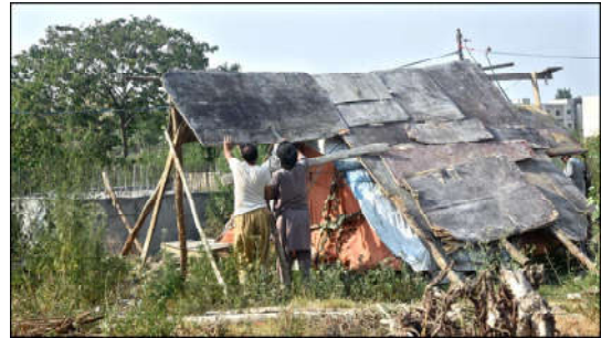
ISLAMABAD: Gypsy men making makeshift home at roadside in the Federal Capital.

one-window facility. Affected individuals can now seek assistance at the One Window in Sector C-16 instead of visiting the CDA office for their property claims. The Chairman directed to accelerate sector development by resolving issues of affected individuals. Following his visit, sector development has sped up significantly. Development works are ongoing round the clock under the guidance of Chairman CDA.