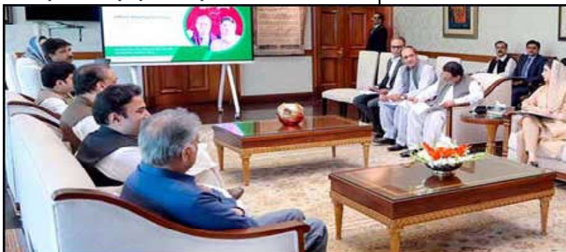
LAHORE: Punjab Chief Minister Maryam Nawaz Sharif chaired a meeting to review progress on the Lahore development plan.