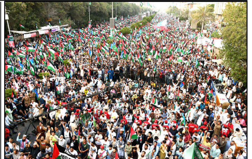
KARACHI: Supporters of the religious and political party Jamaat-e-Islami attend a demonstration against Israeli airstrikes on Gaza, to show solidarity with Palestinian people, in the Provincial Capital.

people. "So, we really appreciate that China has contributed immensely to the uplift of Gwadar, but it is just the first steps go other port has a long way to go," he added. He remarked that in partnership with the Gwadar and in partnership with China, we hope that Gwadar will become an internationally acclaimed world class port city, which will have tremendous opportunities for its people. Ahsan Iqbal pointed out that China has also given scholarships for the youth of Gwadar who are studying in Chinese universities. "So, I think China's contribution and Gwadar has been very valuable and uplifting the lives of people and region and we appreciate very much." The minister also appreciated that China is sharing its success, not just with Pakistan, but with other countries also, to help them improve their infrastructure to help them improve their socio-economic development. Launched in 2013, the CPEC, a flagship project of the China-proposed Belt and Road Initiative, is a corridor linking Gwadar Port in southwest Pakistan's Balochistan province with Kashgar in Northwest China's Xinjiang Uygur Autonomous Region, which highlights energy, transport, and industrial cooperation in the first phase, while the new phase expands to the fields such as agriculture and livelihood, among others.