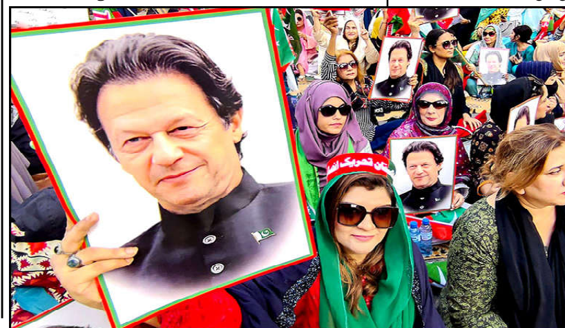
KARACHI: Supporters of PTI hold a protest in favor of their demands in front of Karachi Press Club.