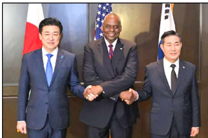
Japanese Defense Minister Minoru Kihara, U.S. Defense Secretary Lloyd Austin and South Korean Defence Minister Shin Won-sik attend a trilateral meeting on sidelines of the Shangri-la Dialogue in Singapore.

Chinese Defense Minister Dong Jun spoke before Zelensky at the Shangri-La conference but he did not appear to be in the room when Zelensky made his appeal.