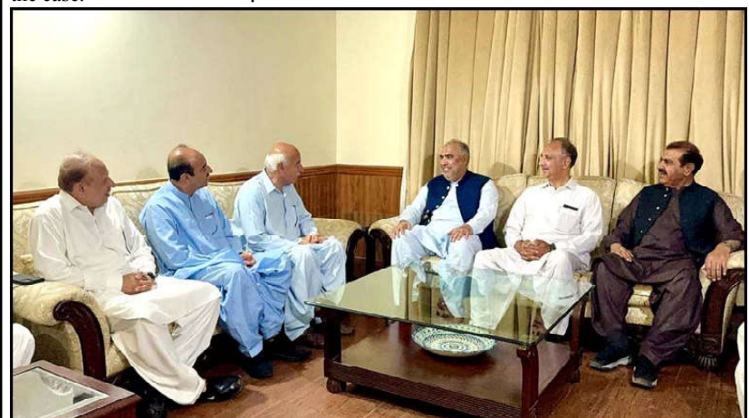
ISLAMABAD: Leadership of Tehreek Tahafuz Ain-e-Pakistan meeting with President National Party Dr. Abdul Malik Baloch

ISLAMABAD (APP): A large number of students and teachers from Azad Jammu Kashmir (AJK), university took part in a rally to express their support and solidarity with the Pakistan Army. The participants paid tribute to the brave soldiers and officers who have sacrificed their lives in the line of duty since the establishment of Pakistan, PTV reported on Friday. The rally was marked by passionate speeches and slogans, with participants chanting "Pakistan Army zindabad" and "Shuhada-e-watan zindabad" (Long live Pakistan Army and Long live the Martyrs of the Homeland). The students and faculty members praised the Pakistan Army's unwavering dedication to protecting the country's borders and its people.