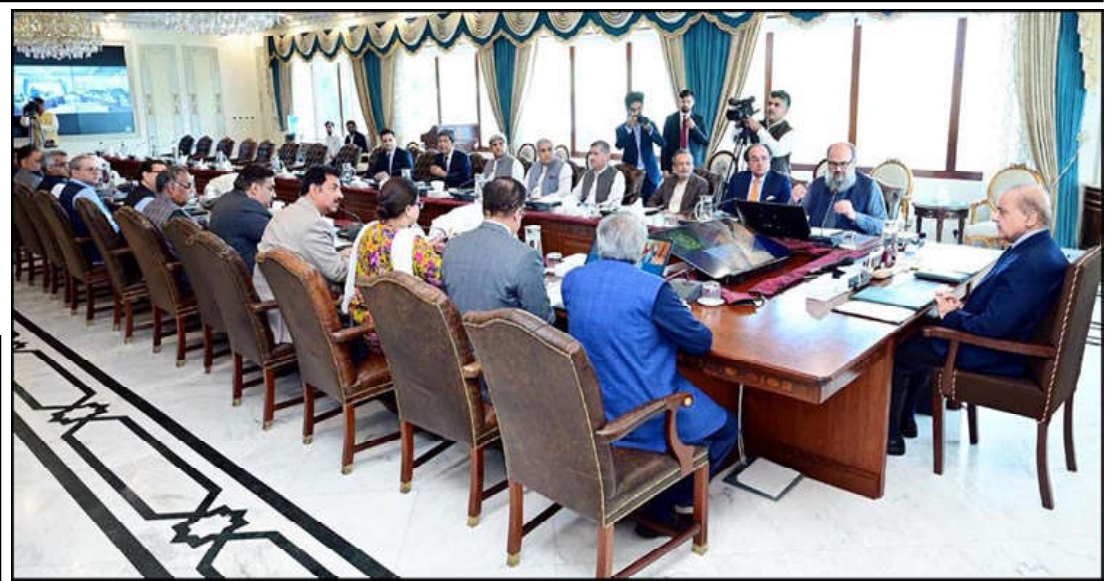
ISLAMABAD: Prime Minister Muhammad Shehbaz Sharif chairs a meeting on Pakistan Single Window Company.