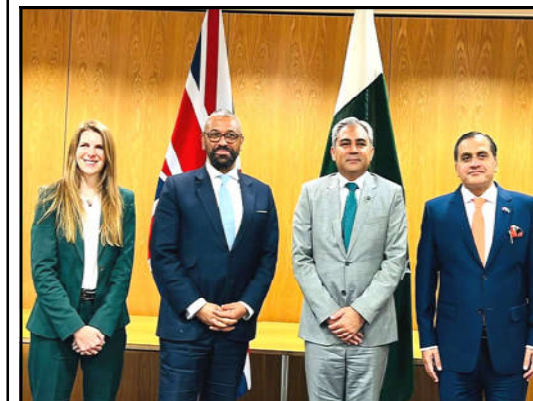
LONDON: Federal Minister for Interior Mohsin Naqvi in a group photo with Home Secretary of UK James Cleverly.

ISLAMABAD (APP): In a major decision on Friday, Prime Minister Muhammad Shehbaz Sharif has directed the Ministry of Finance to cut the price of petrol by Rs 15.4 per liter and that of diesel by Rs 7.9 per liter. The government's pro-people policies have led to a notable decline in inflation and a stabilization of the economy, the prime minister said in a statement released by the PM Office. He stated that these policies have resulted in a noticeable reduction in inflation and have contributed to economic stability. This move is expected to bring significant relief to the public, who have been grappling with high fuel prices in recent months. On May 15, the government had announced a welcome reduction in petrol and HSD prices for a fortnight by Rs15.39 per litre and Rs7.88 per litre, respectively.