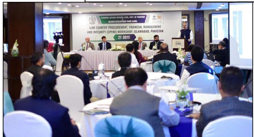
ISLAMABAD: IsDB Organizes Country Procurement, Financial Management and Integrity Workshop in Islamabad.