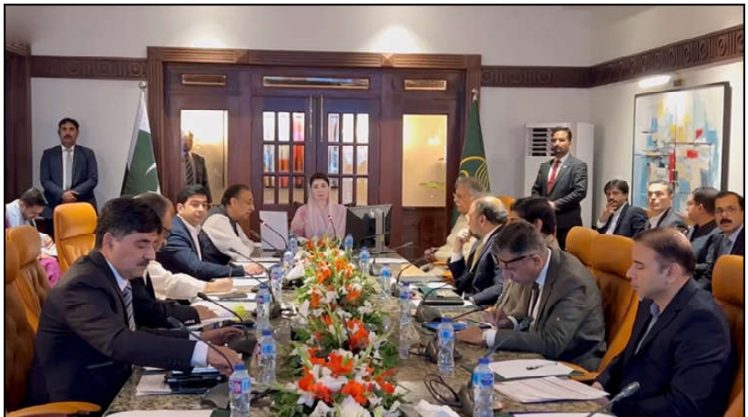
LAHORE: Punjab Chief Minister Maryam Nawaz presides over the special meeting to review price control and other matters.