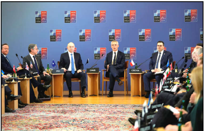
NATO Secretary General Jens Stoltenberg chairs a meeting of NATO foreign ministers, as British Foreign Secretary David Cameron, United States Secretary of State Antony Blinken, NATO Deputy Secretary General Mircea Geoana, and Czech Republic's Foreign Minister Jan Lipavsky attend, at the Czernin Palace, in Prague, Czech Republic.

The war broke out as long-simmering tensions over integrating the RSF with the army came to a head. The UN special adviser on the prevention of genocide said last week there was a risk of genocide in parts of Darfur. A UN-backed report said in March that immediate action was needed to "prevent widespread death and total collapse of livelihoods."