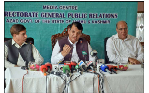
MEDIA CENTRE RECTORATE GENERAL PUBLIC RELATIONS AZAD GOVT OF THE STATE OF JAMMU & KASHMIR