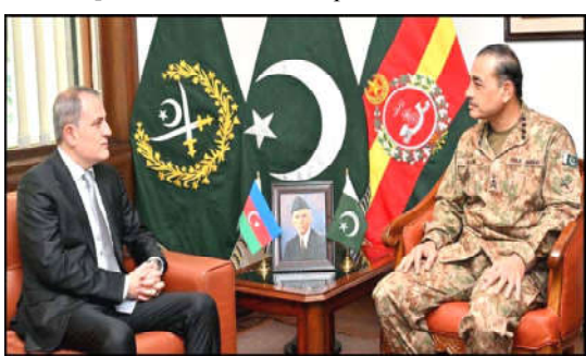
RAWALPINDI: The Foreign Minister of Azerbaijan, Jeyhun Bayramov, called on General Syed Asim Munir, NI (M), Chief of Army Staff (COAS), at the General Headquarters (GHQ).