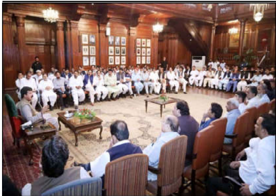
LAHORE: A delegation of Pakistan Peoples Party Lahore Division called on Punjab Governor Sardar Saleem Haider Khan at Governor House.

"We need to have an efficient scrutiny mechanism in order to ensure that only deserving girls would be selected for that programme," he said.