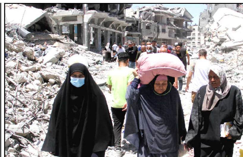
A woman carries belongings on her head, as Palestinians inspect the damage after Israeli forces withdrew from Jabalia refugee camp, following a raid, in the northern Gaza Strip.

This spring, Ukraine found itself on the back foot in the 27-month-old full-scale invasion as it faces delays in military aid from the US, increased attacks on its energy infrastructure and Russia's push to expand the frontline.